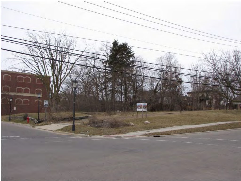
Cady East 335_Looking Northwest