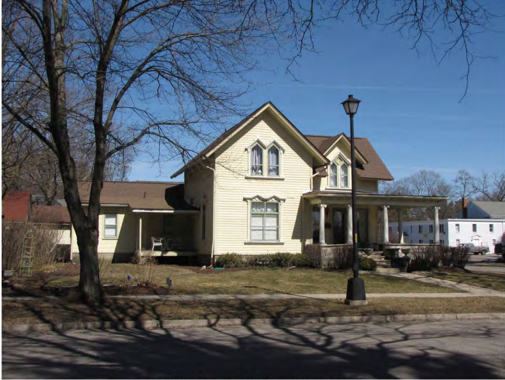
Dunlap West 304_Looking North