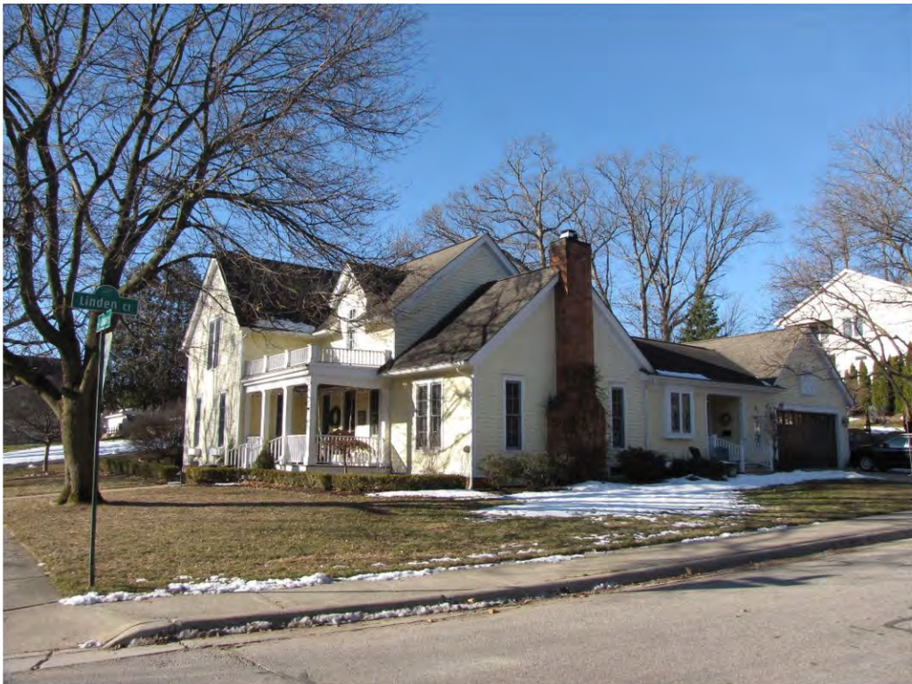
Linden 335_Looking Southwest