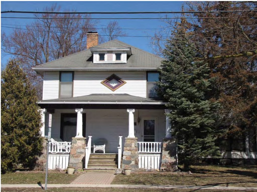
Main West 312_Looking North