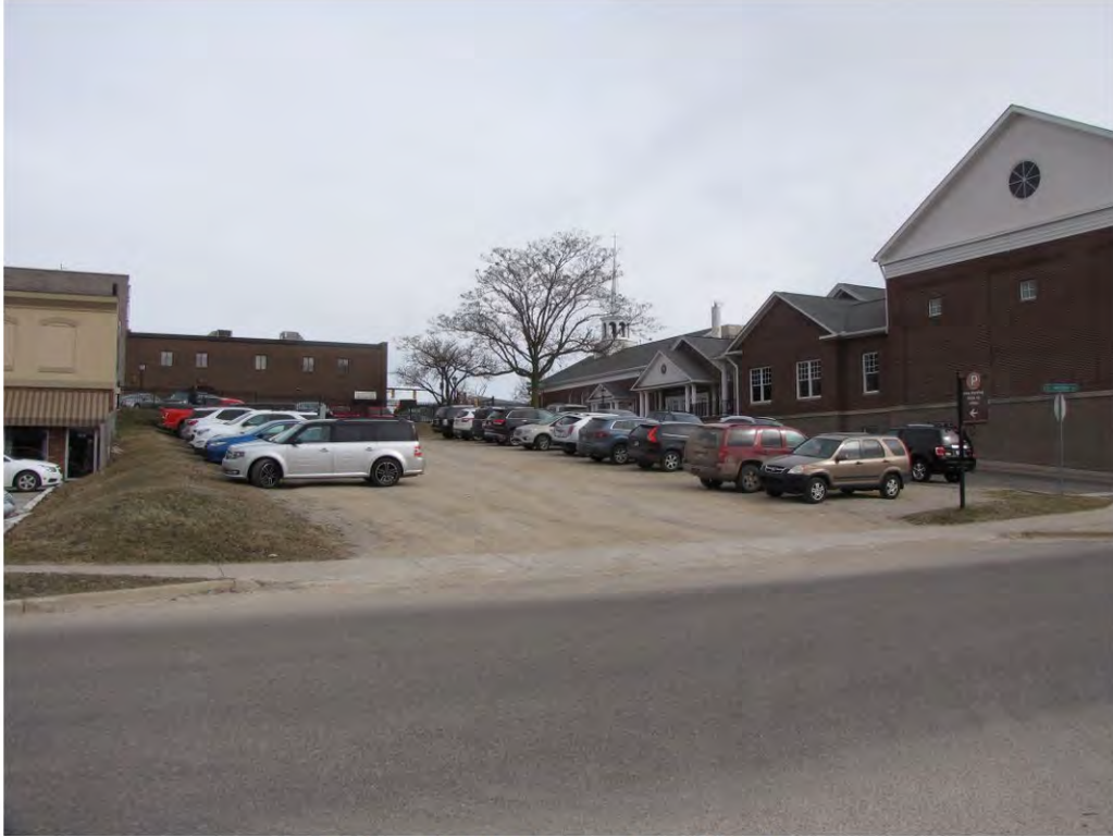
Cady East NVA 11_Looking Northeast