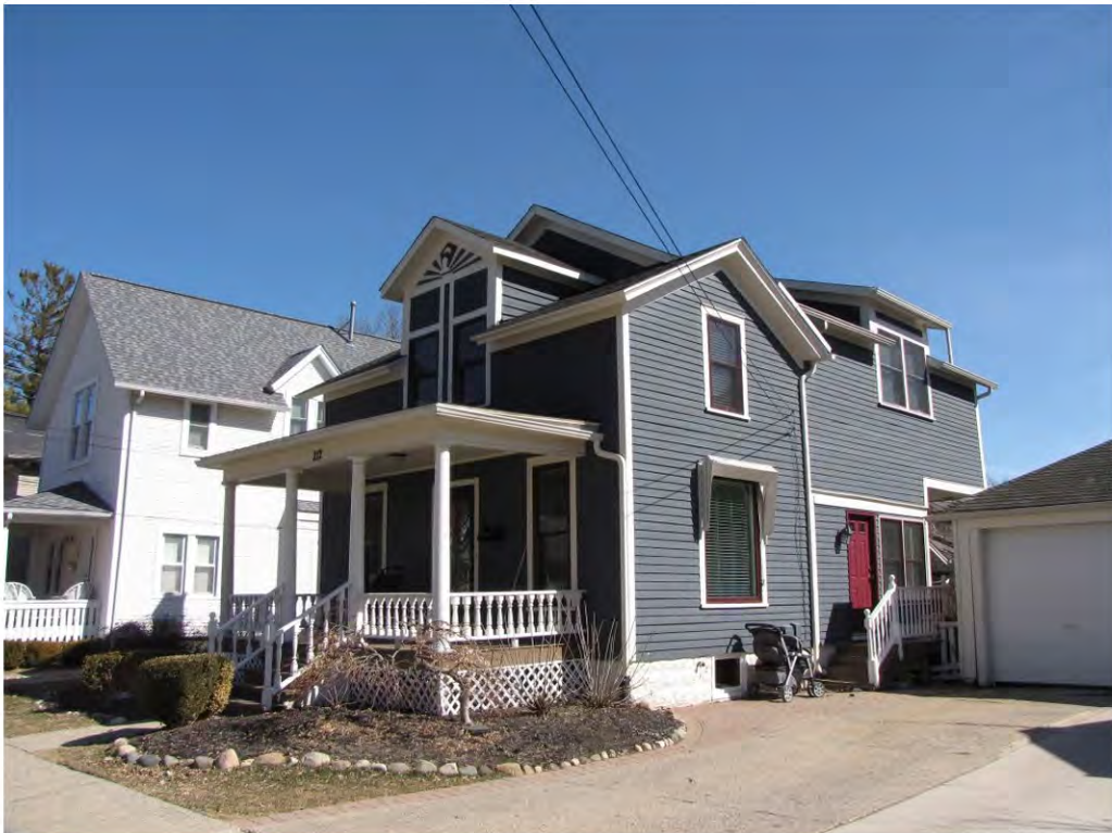
West 212_Looking East