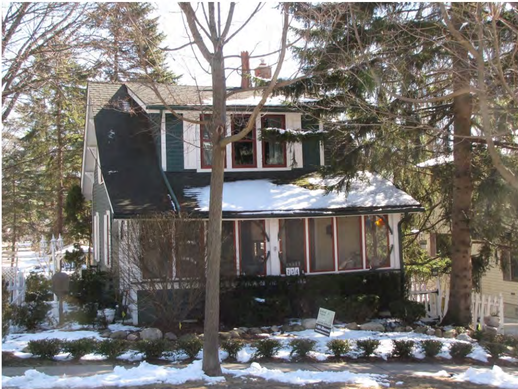
Rogers North 234_Looking East