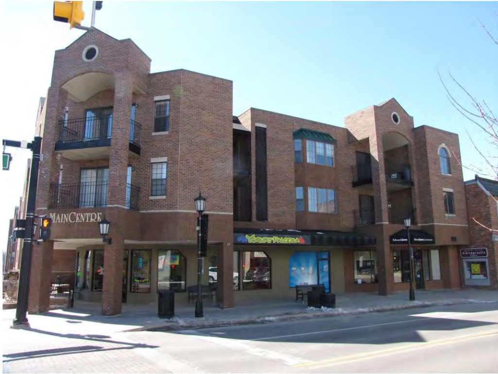
MainCentre 150_Looking Southwest