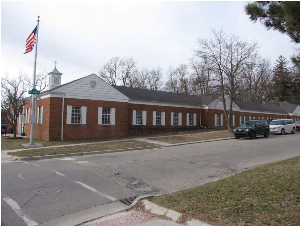
Wing South 200_Looking Southwest