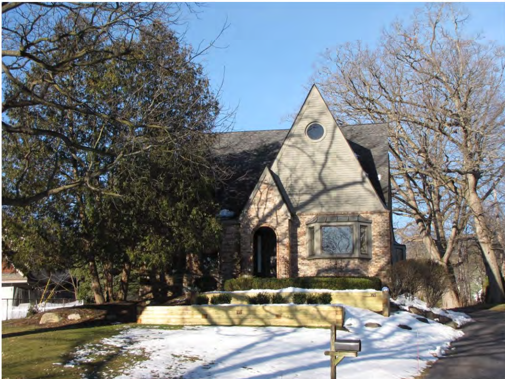
Linden 265_Looking West