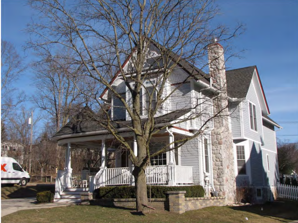
Linden Court 535_ Looking Northwest