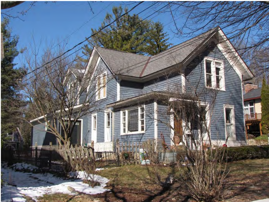
Rogers North 227_Looking Northwest