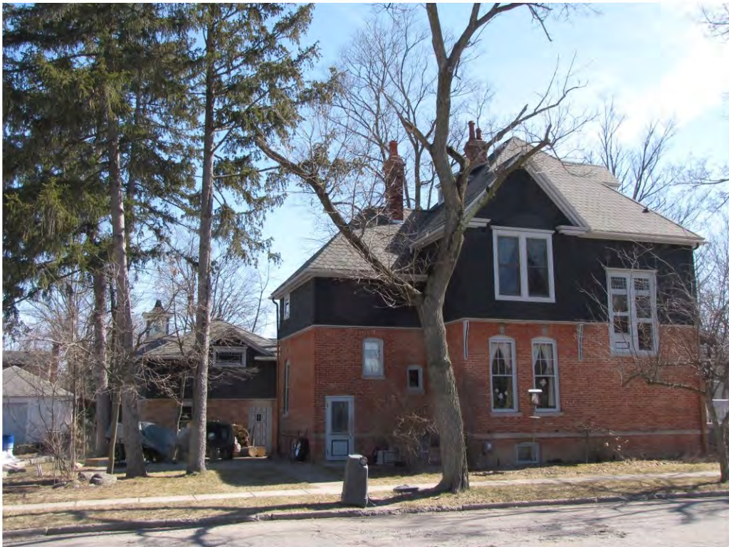
Dunlap West 218_Looking Southeast