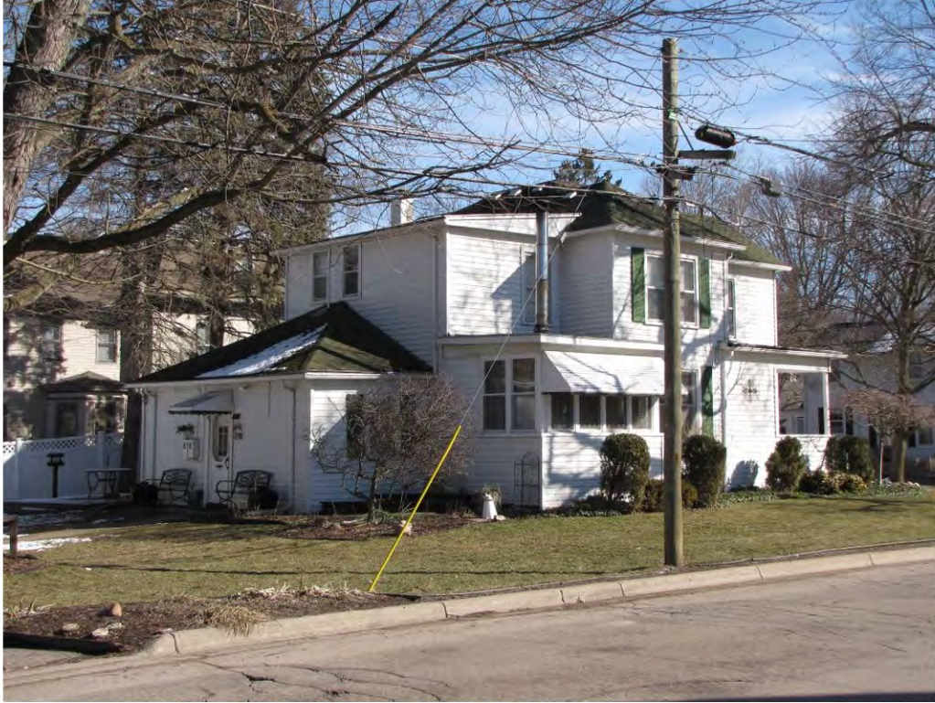
Rogers North 101_Looking Northeast