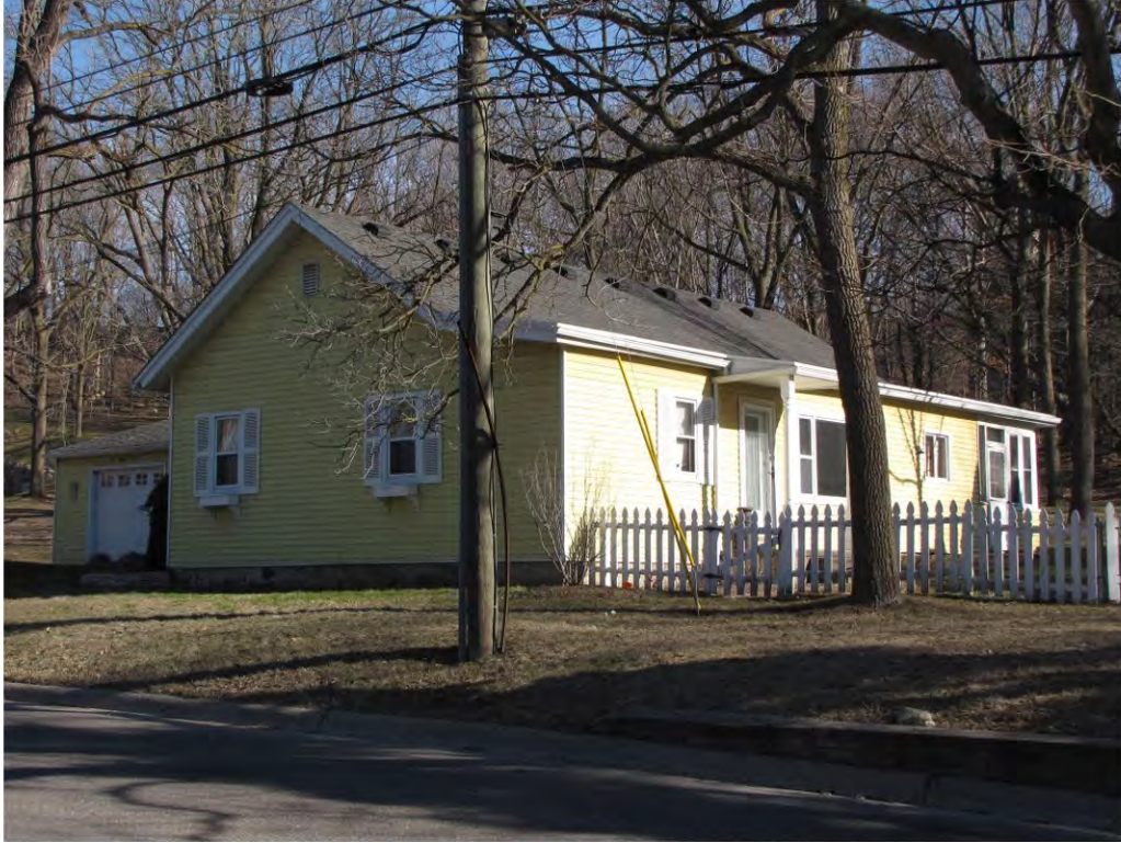
Randolph 588_Looking Northwest