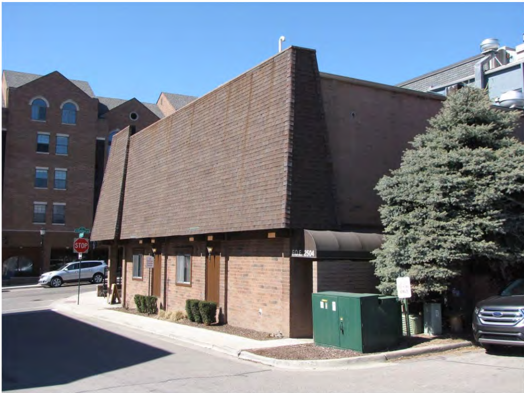
Center South 113_Looking Northwest