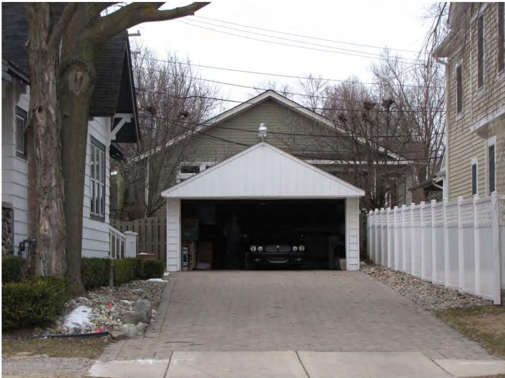
Wing North 111, Garage_Looking West