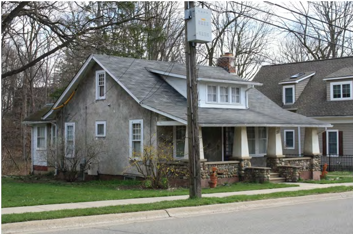
Randolph 424_Looking Northeast