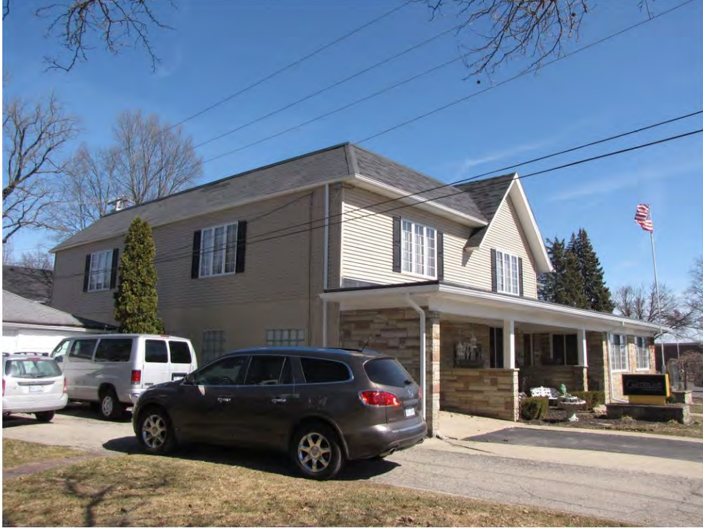
Dunlap West 122_Looking Northeast