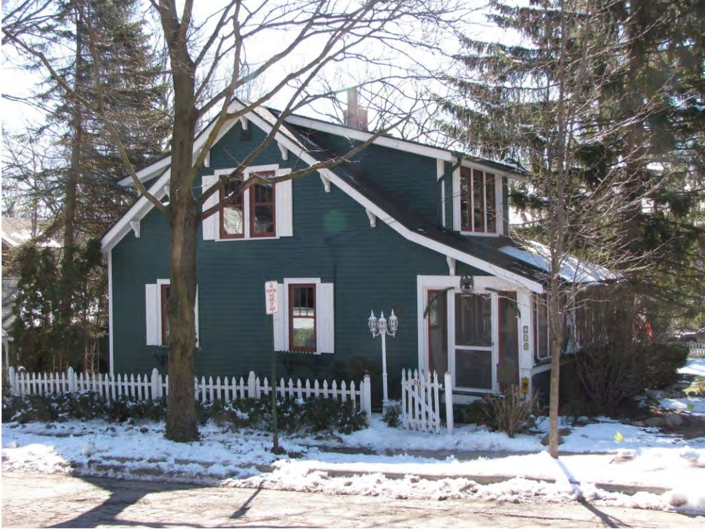
Rogers North 234_Looking Southeast