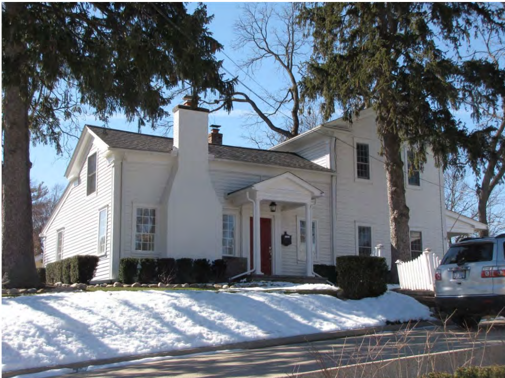
West 247_Looking Southwest