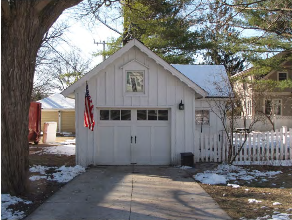
Cady West 521, Carriage House_Looking South