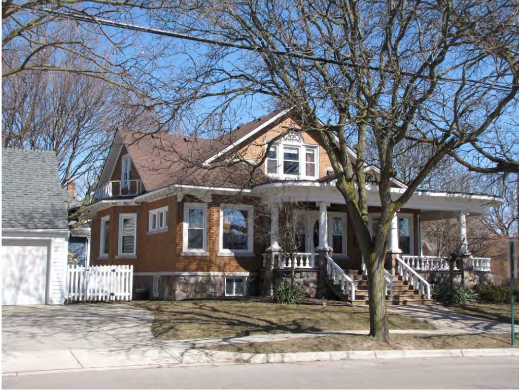
Main West 302_Looking Northeast