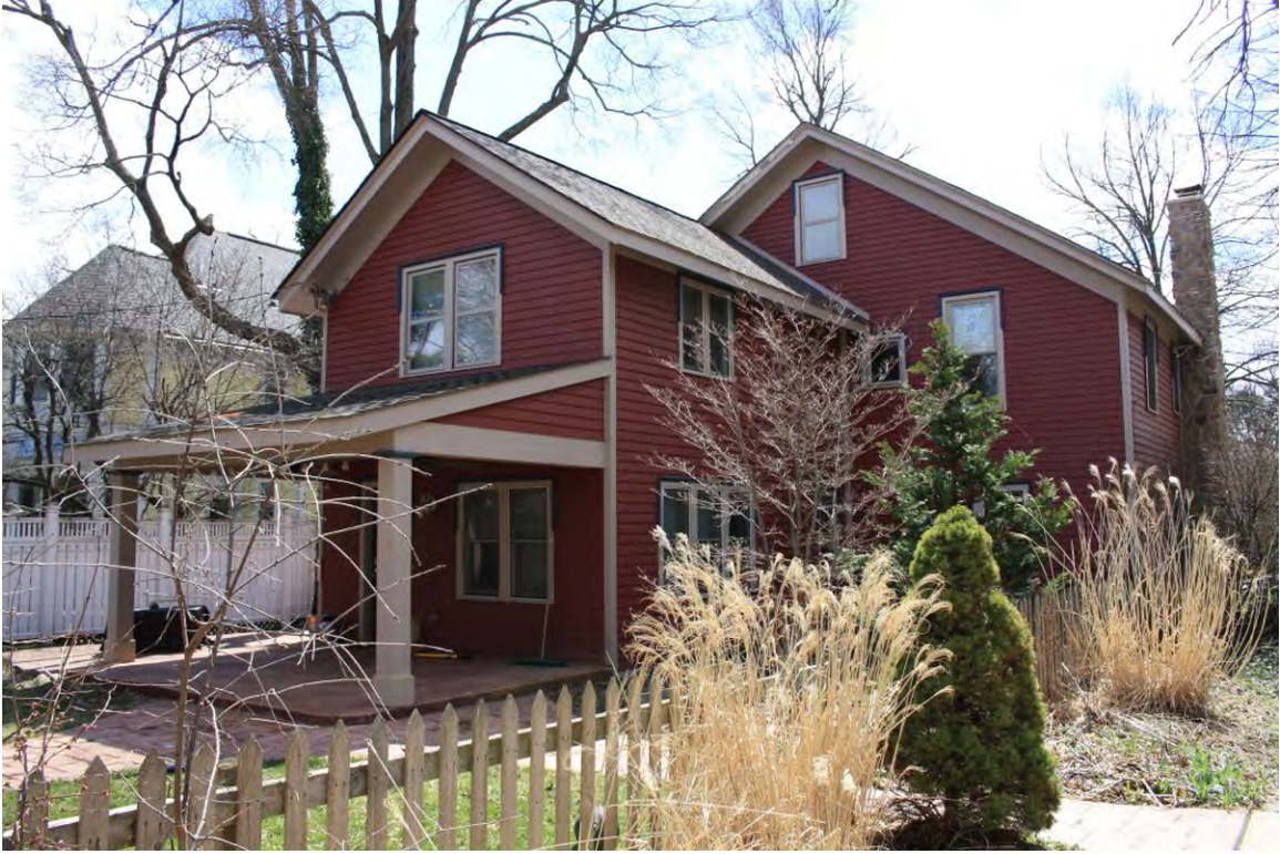
Dunlap West 418_Looking Southeast