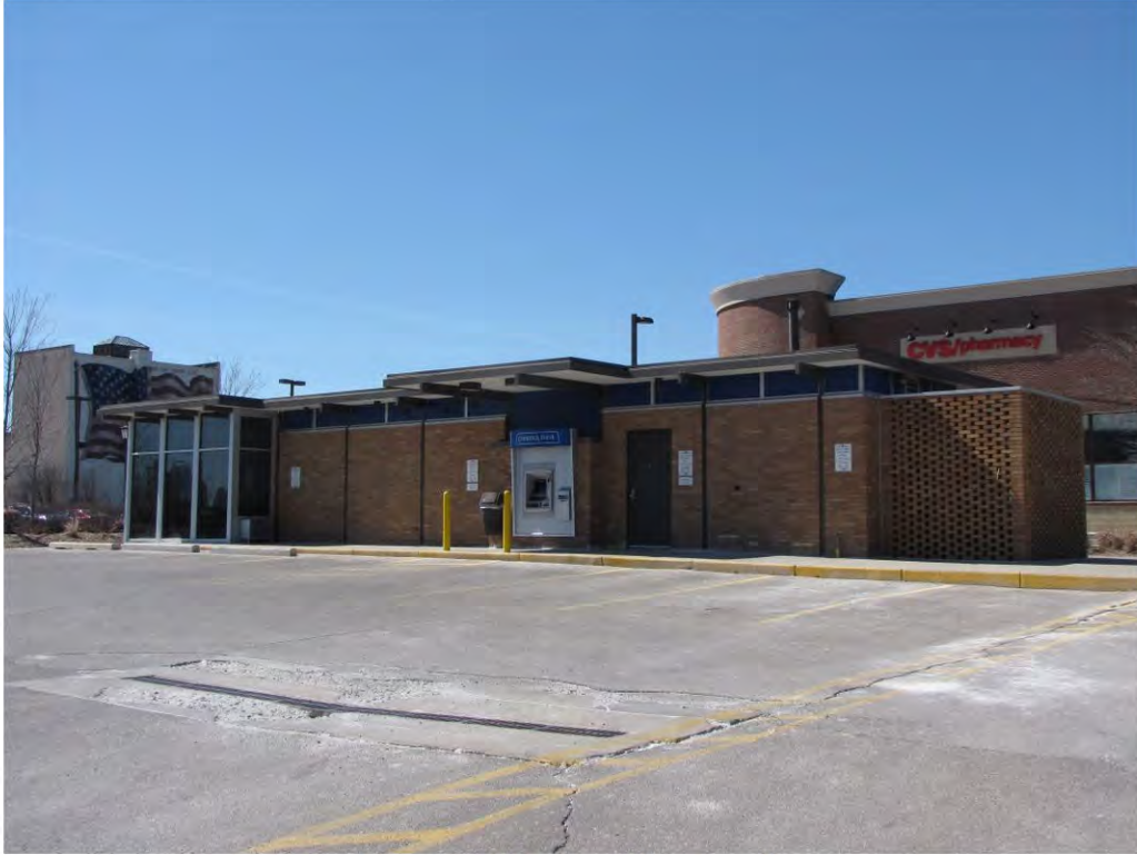
Dunlap East 143_ Looking Southwest