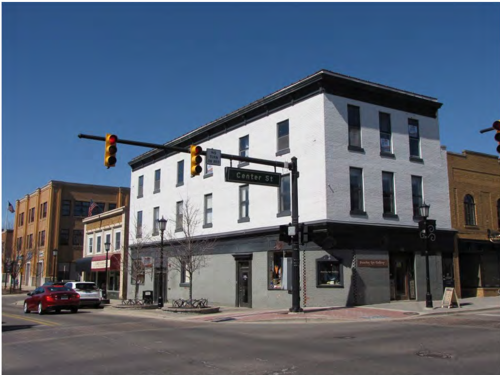
Center North 101-103 and Main West 102-106_Looking Northwest