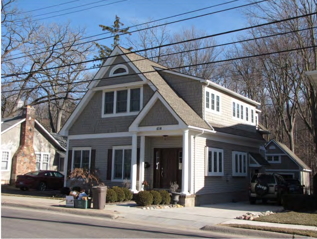
Randolph 418_Looking Northwest