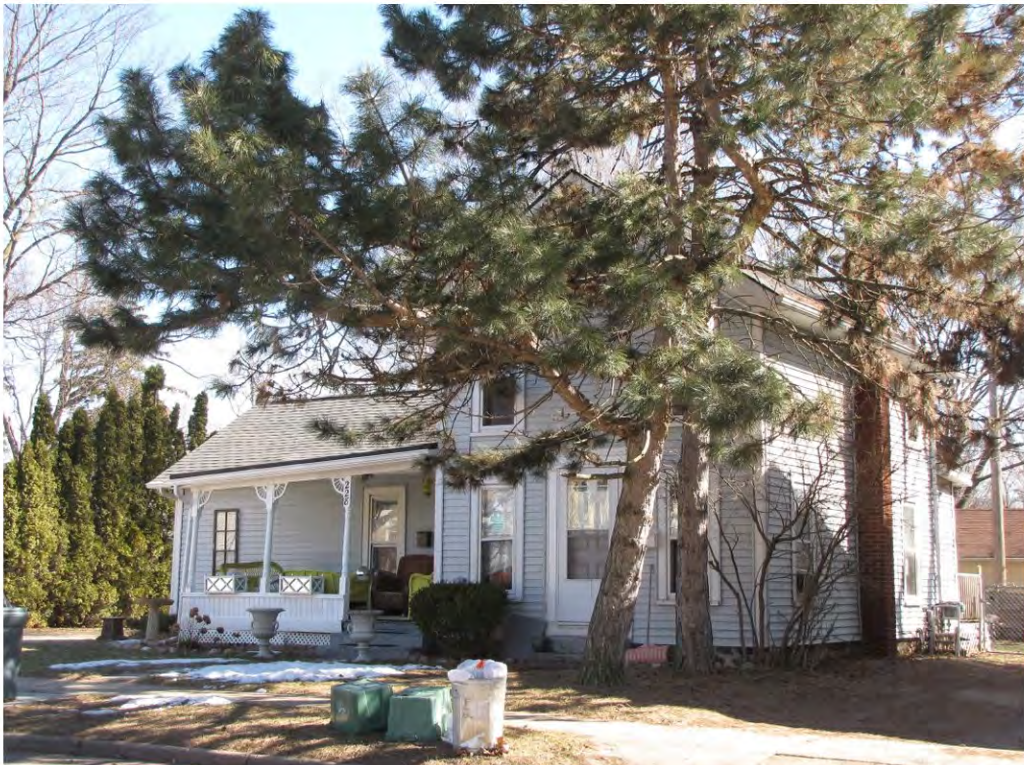
Linden 226-228_Looking Northeast