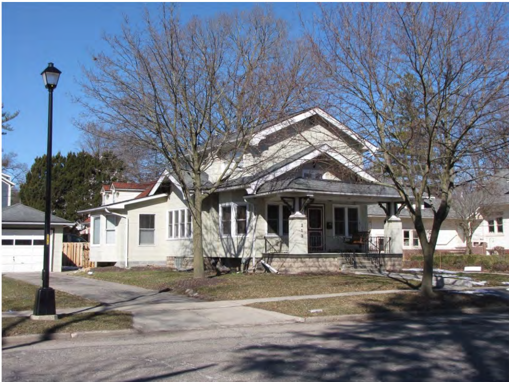
High 213_Looking Northwest