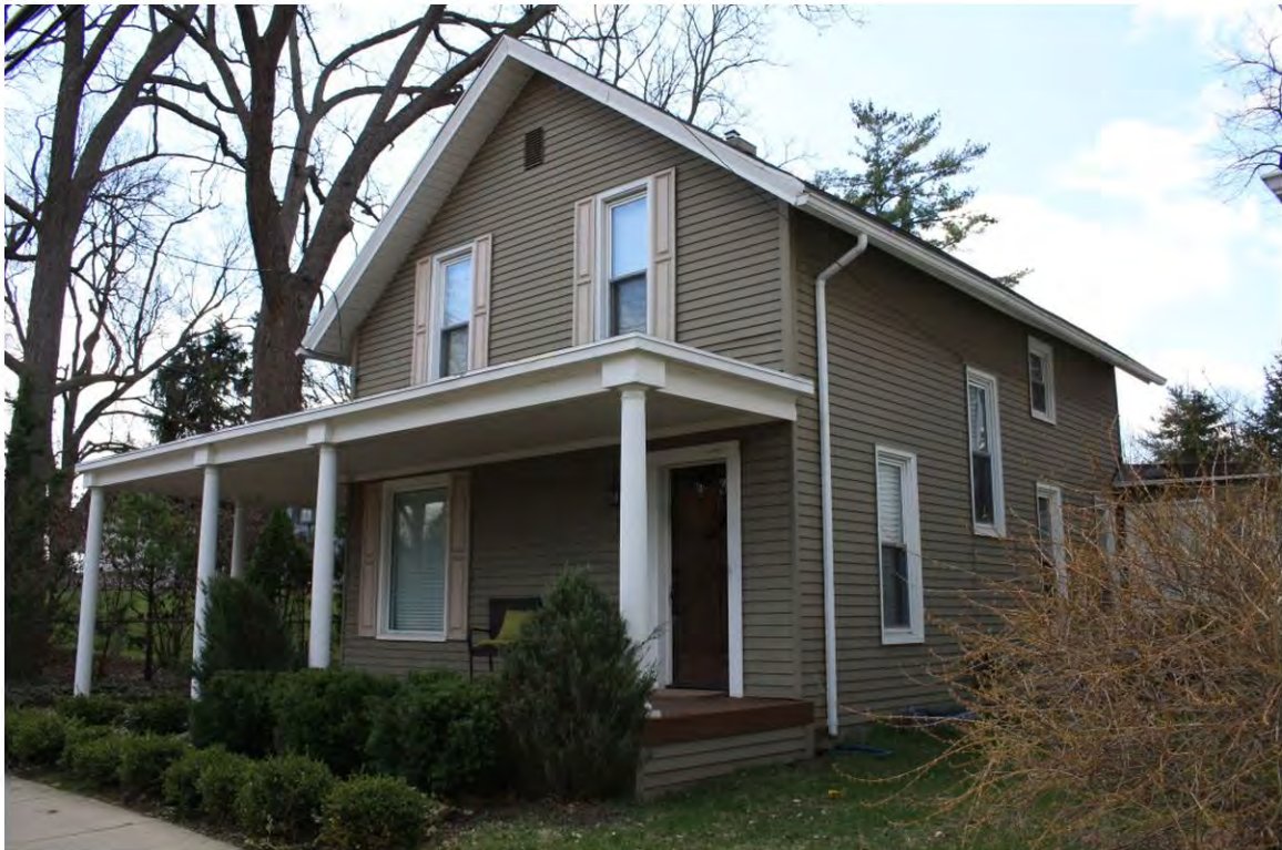
Randolph 317_Looking Southeast