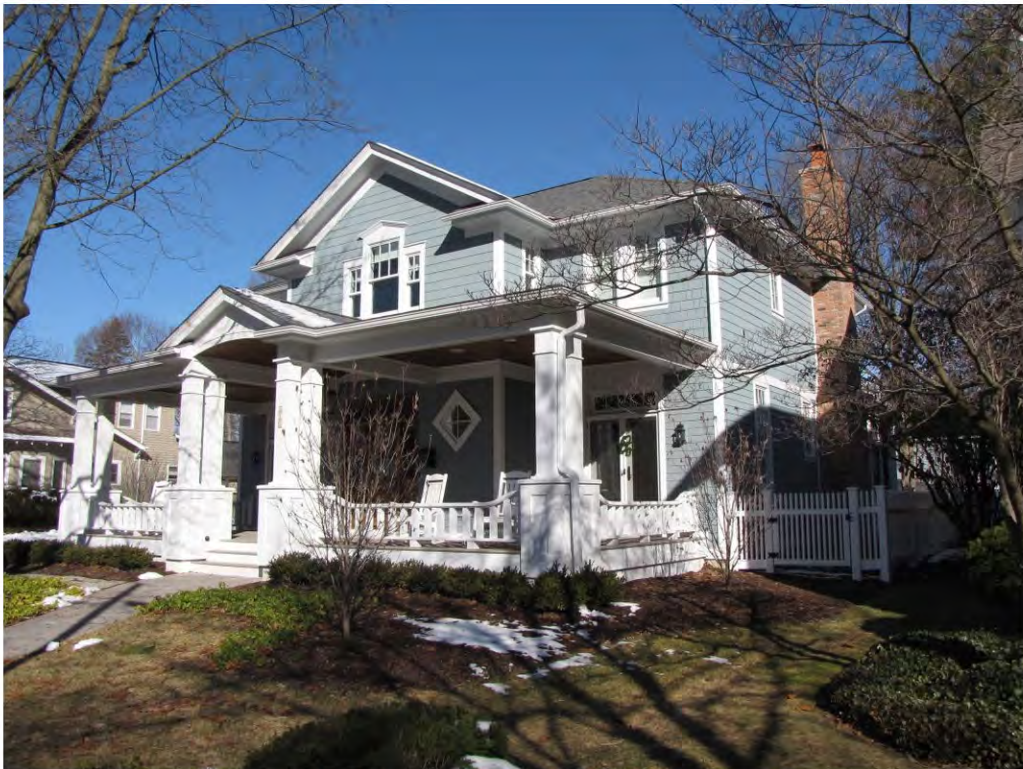
Cady West 500_ Looking Northwest