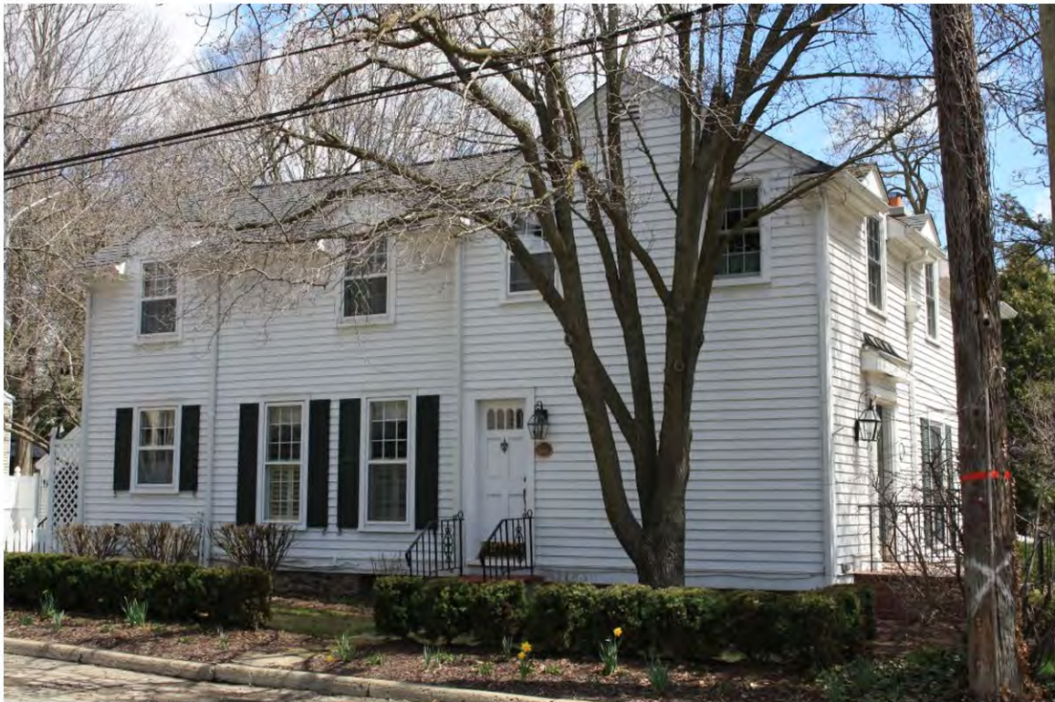
Main West 548_Looking East