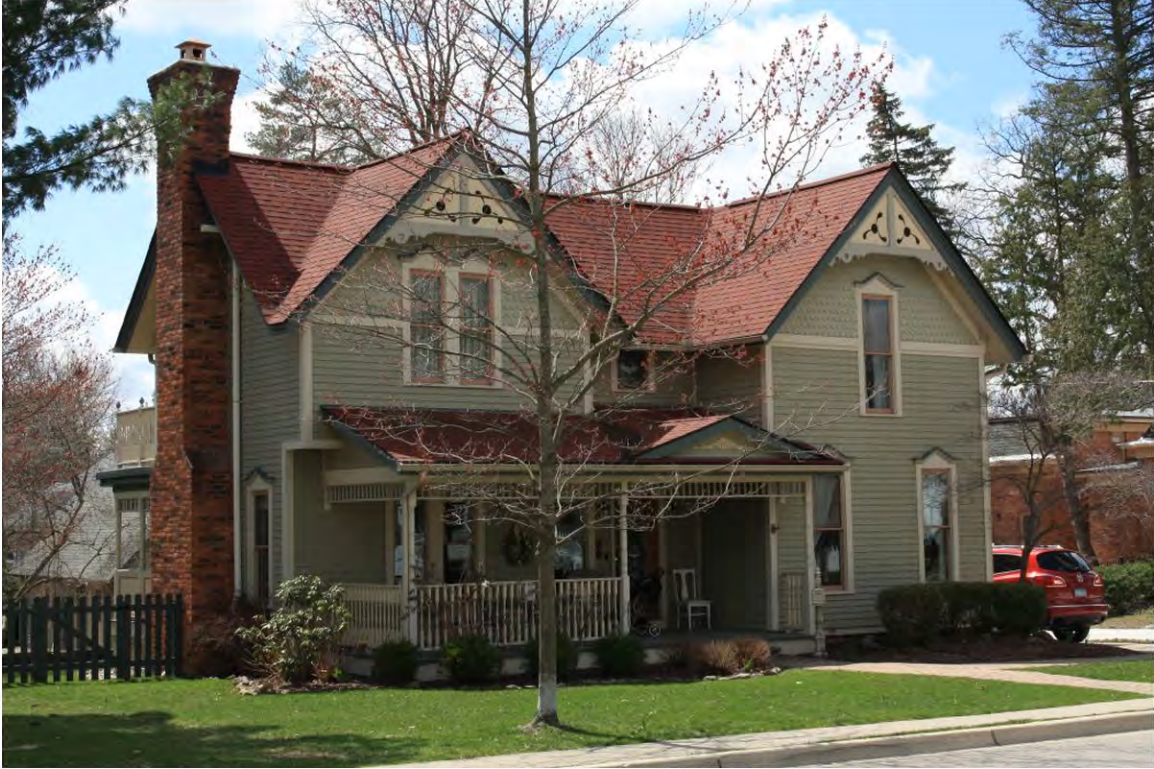
Main West 537_ Looking Southwest