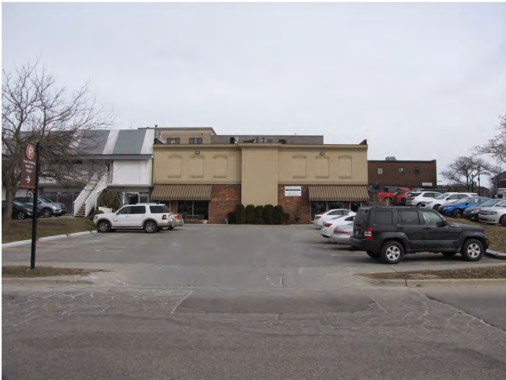
Cady East NVA 10_Looking North