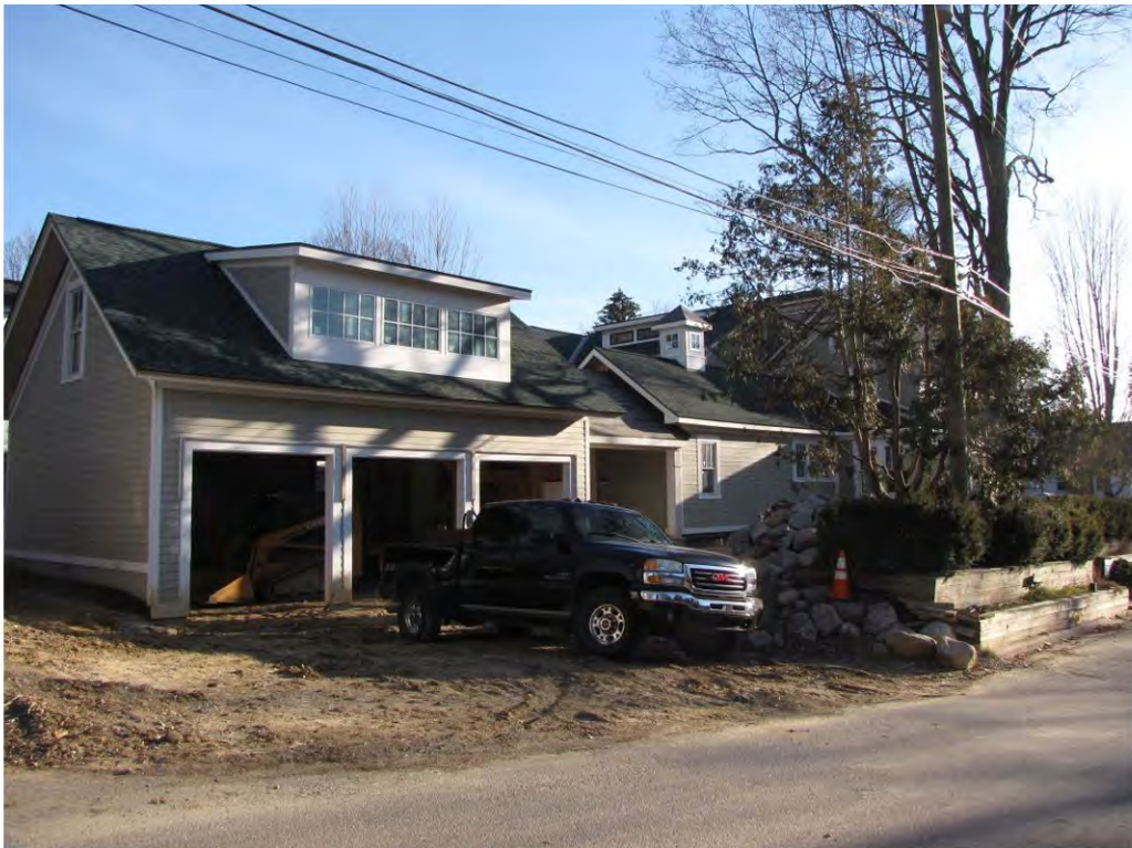
Rogers North 333_Looking Northeast