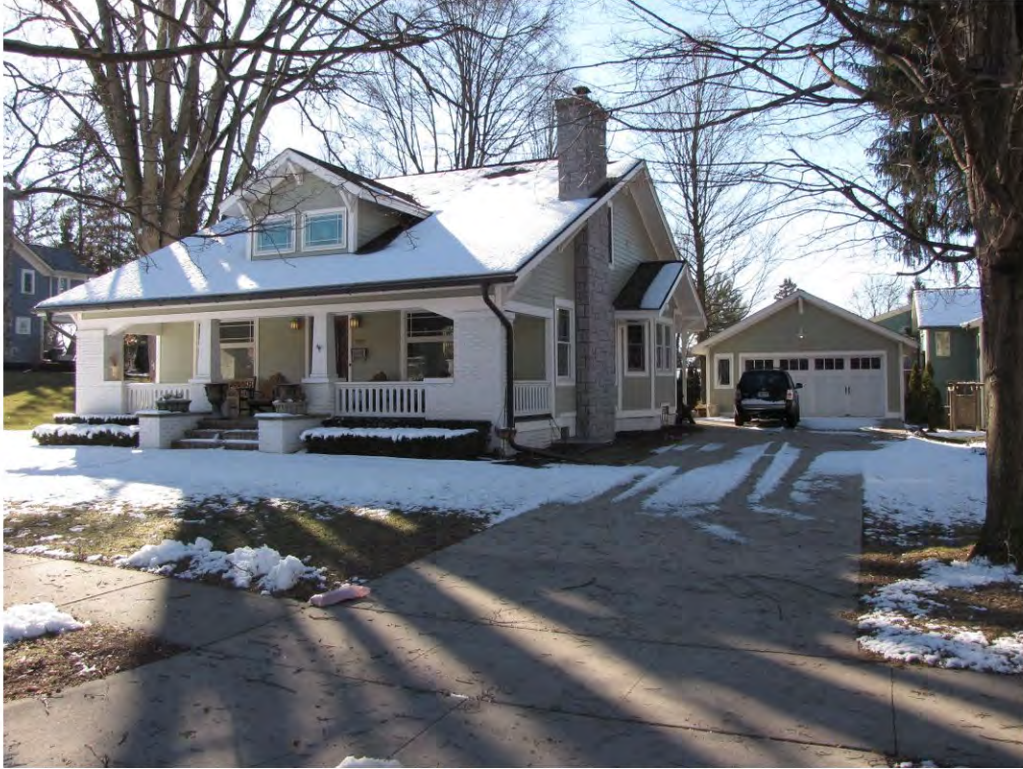
Cady West 487_Looking Southeast