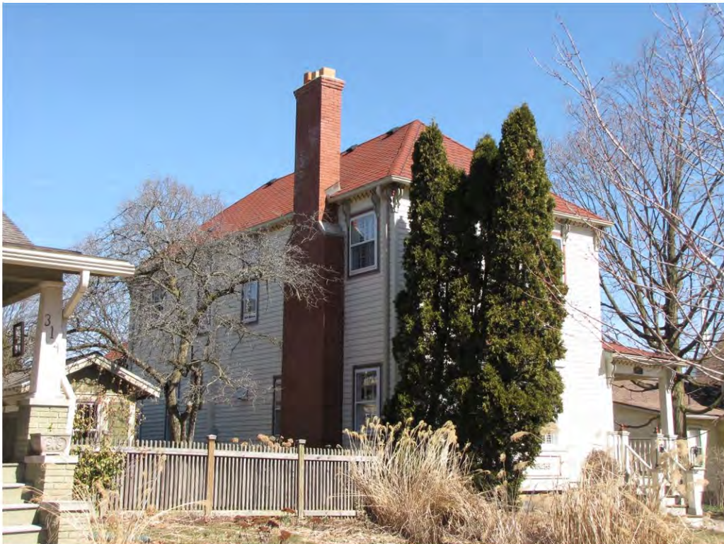
Dunlap West 310_Looking Northeast