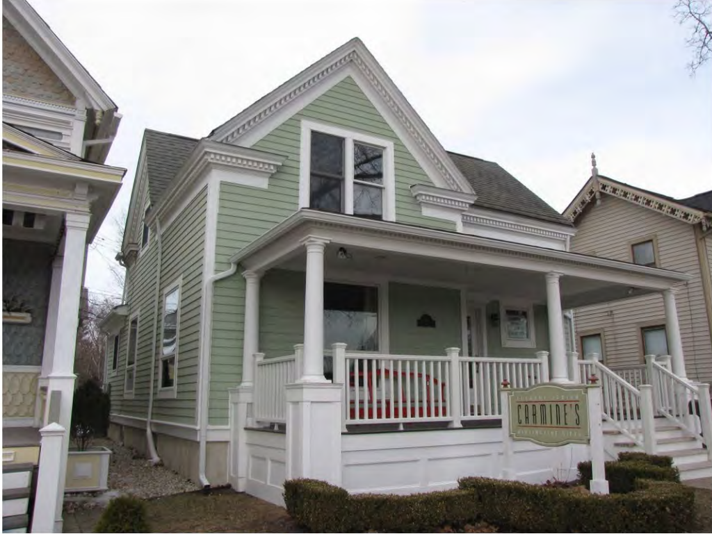
Wing North 125_ Looking Northwest