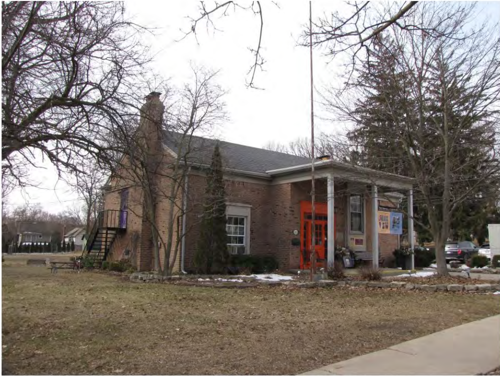
Cady West 215_ Looking Southwest