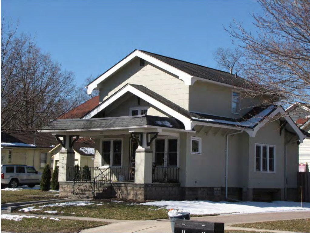
High 213_Looking Southwest