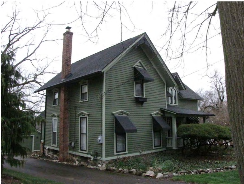
Rogers North 322_Looking Southeast