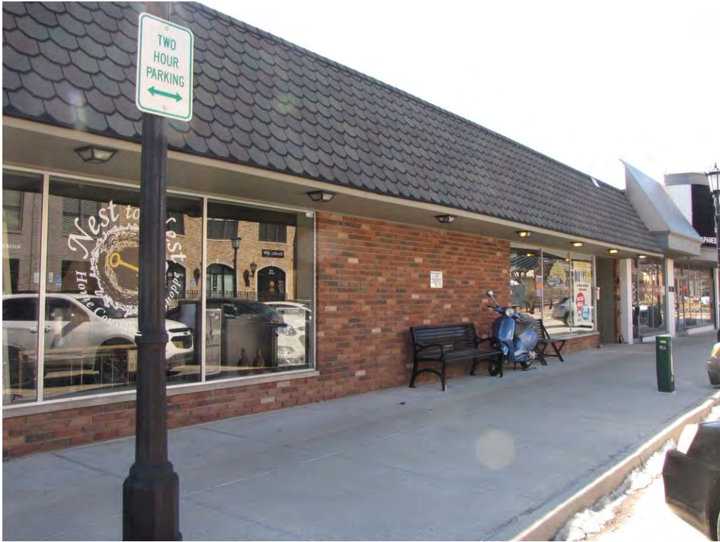
Cady East 141_Looking Southwest