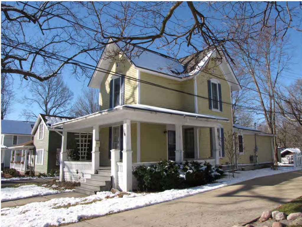
Rogers South 116_Looking Southwest