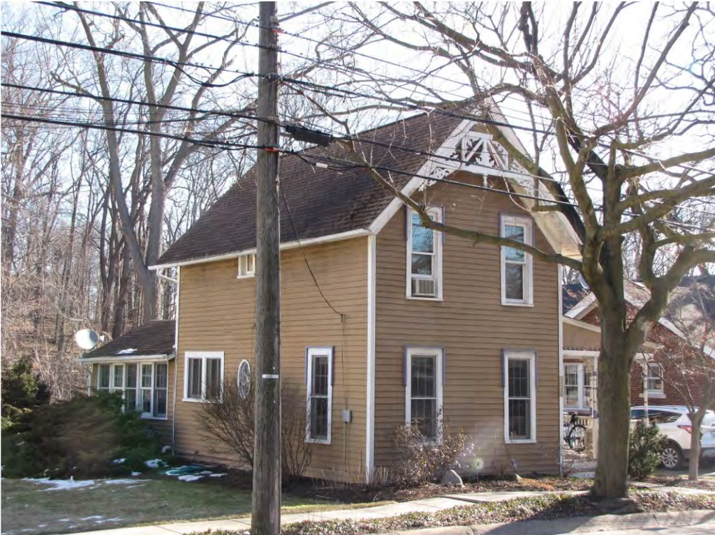
Randolph 442_ Looking Northeast