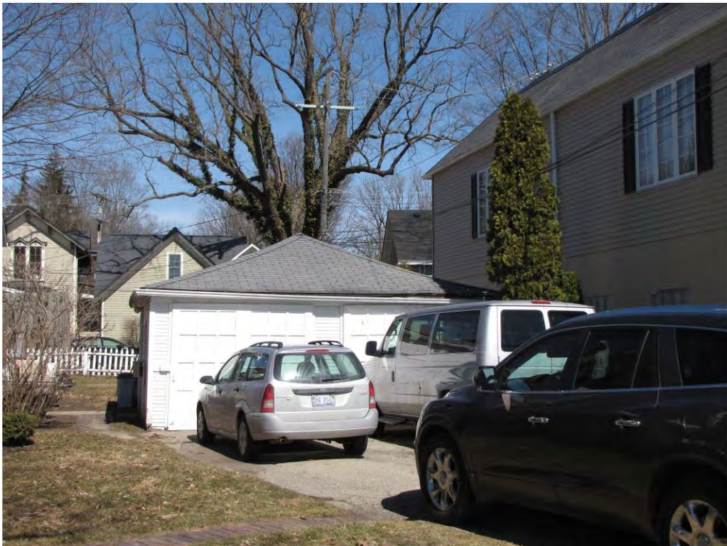
Dunlap West 132, Garage_Looking Northeast