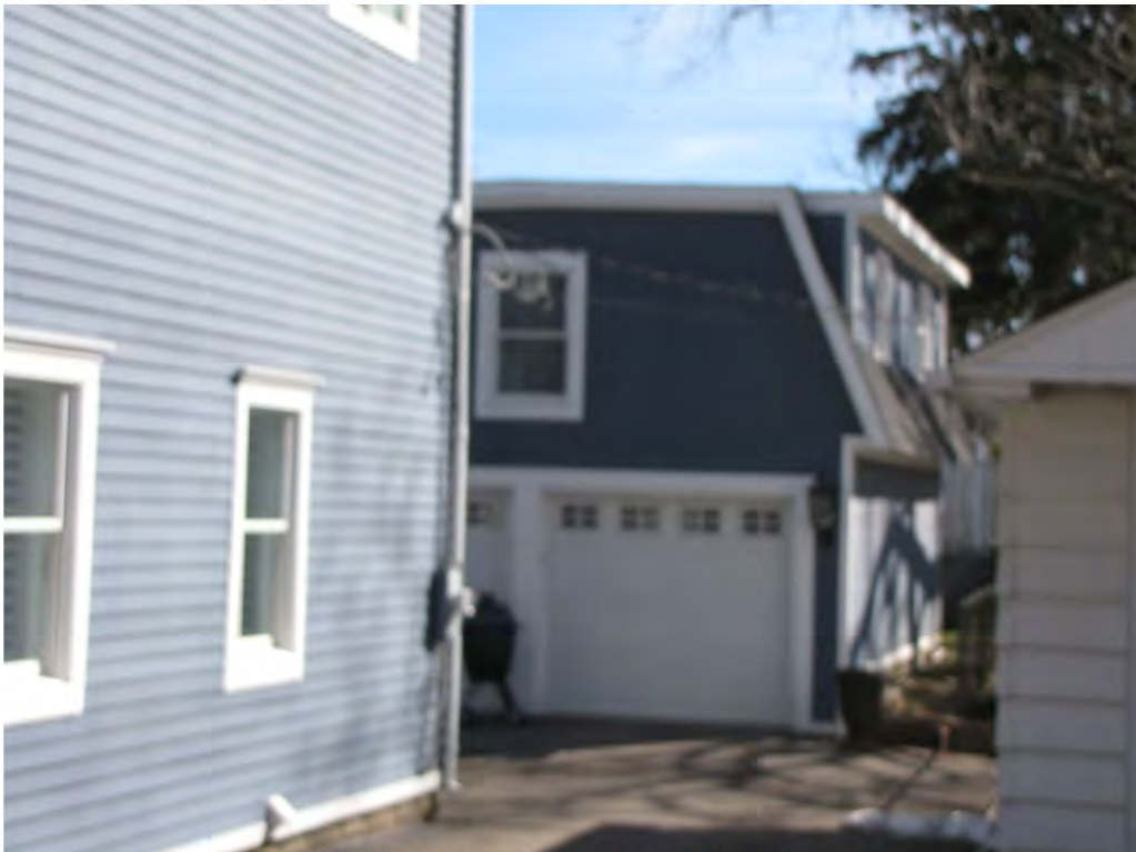
Linden 254, Garage_Looking East