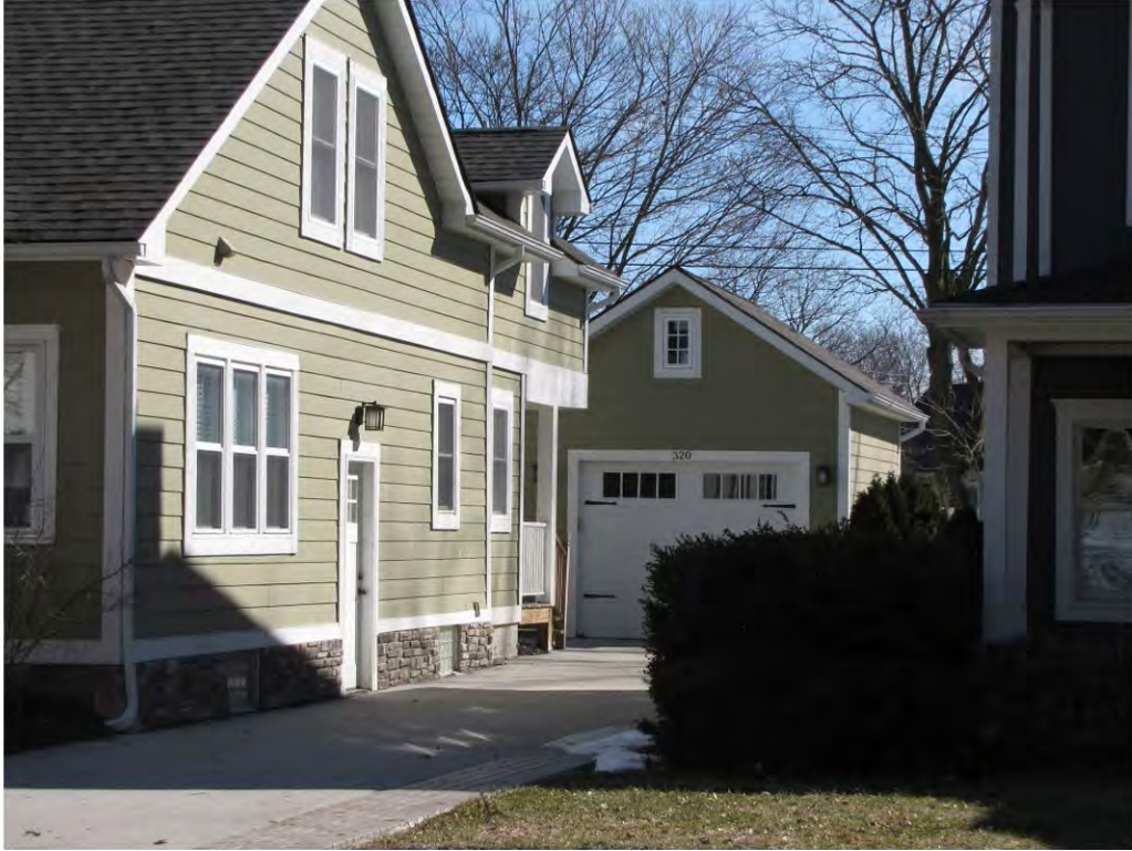
Linden 320, Garage_Looking East