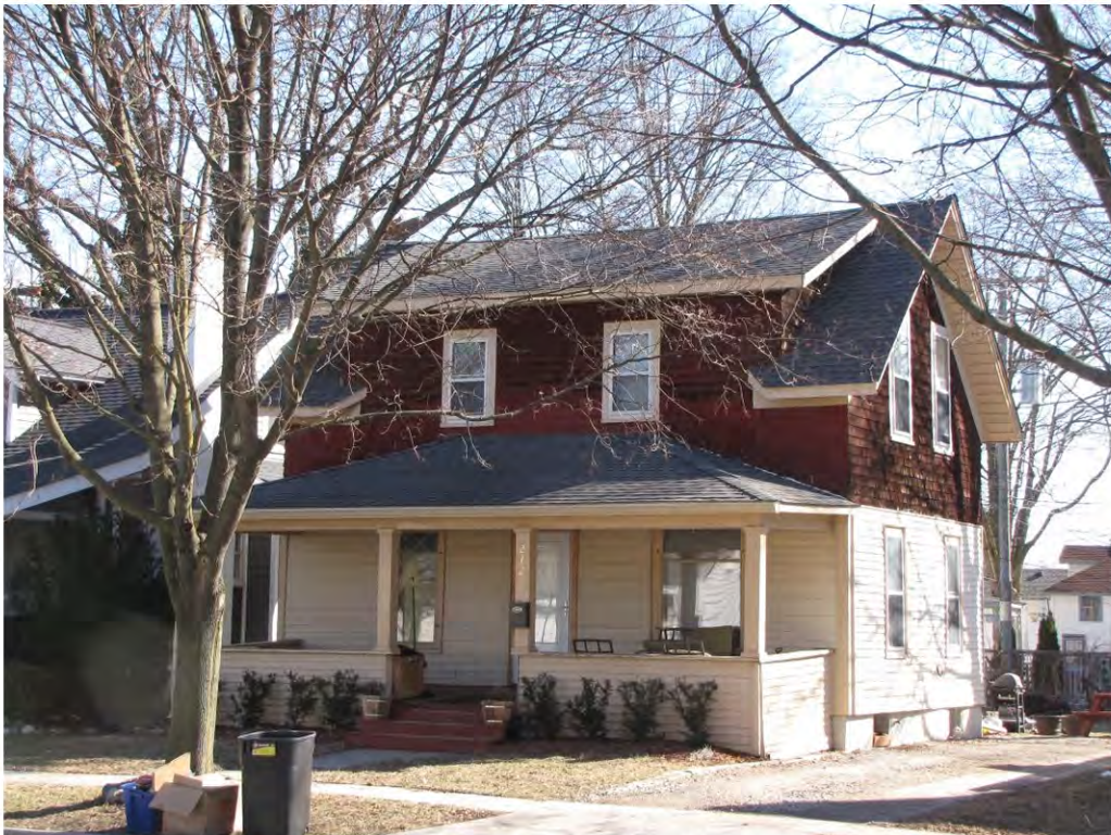
Wing North 212_Looking Northeast