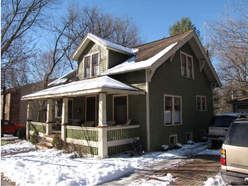
Rogers North 131_Looking Southwest