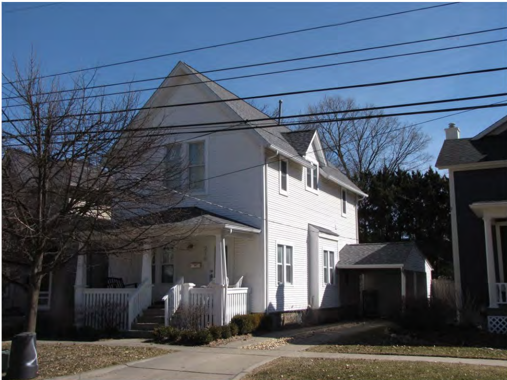
West 216_Looking Northeast