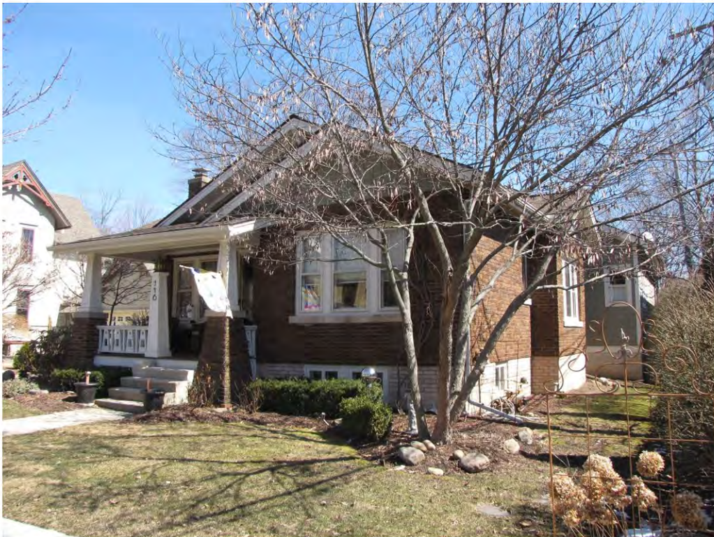
High 116_Looking Southwest