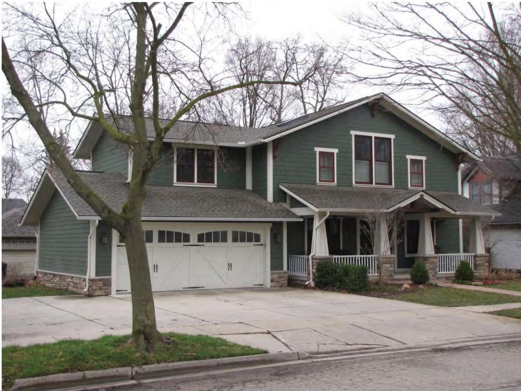
Dubuar 417_Looking Southwest