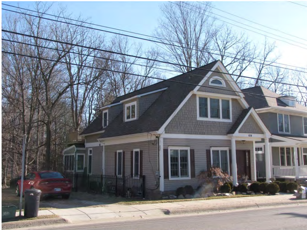
Randolph 418_Looking Northeast