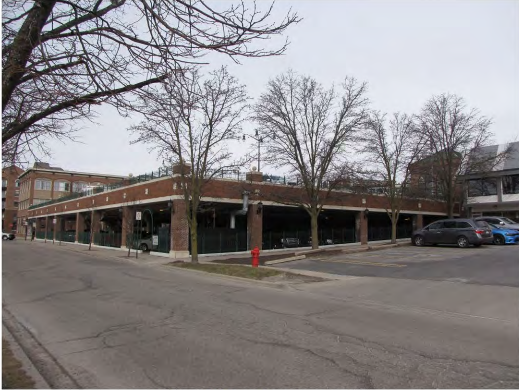
Cady East NVA 9_Looking Northwest