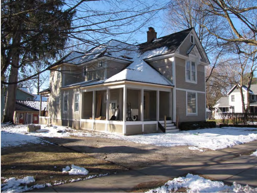
Cady West 495_Looking Southwest