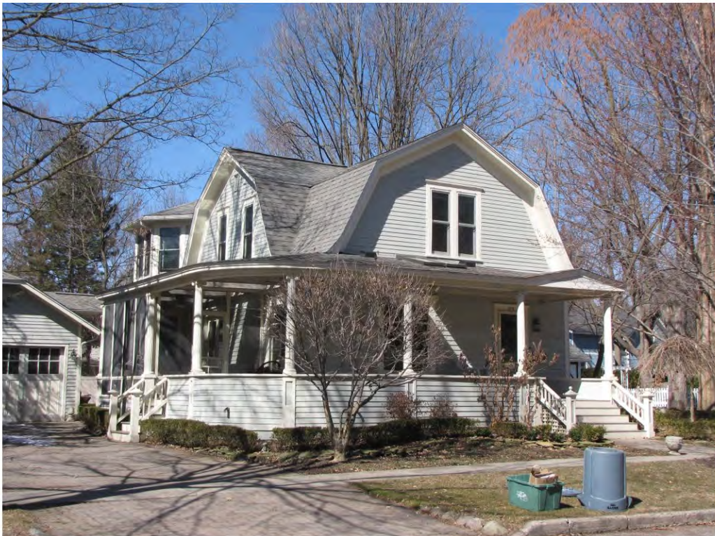
West 113_Looking Northwest