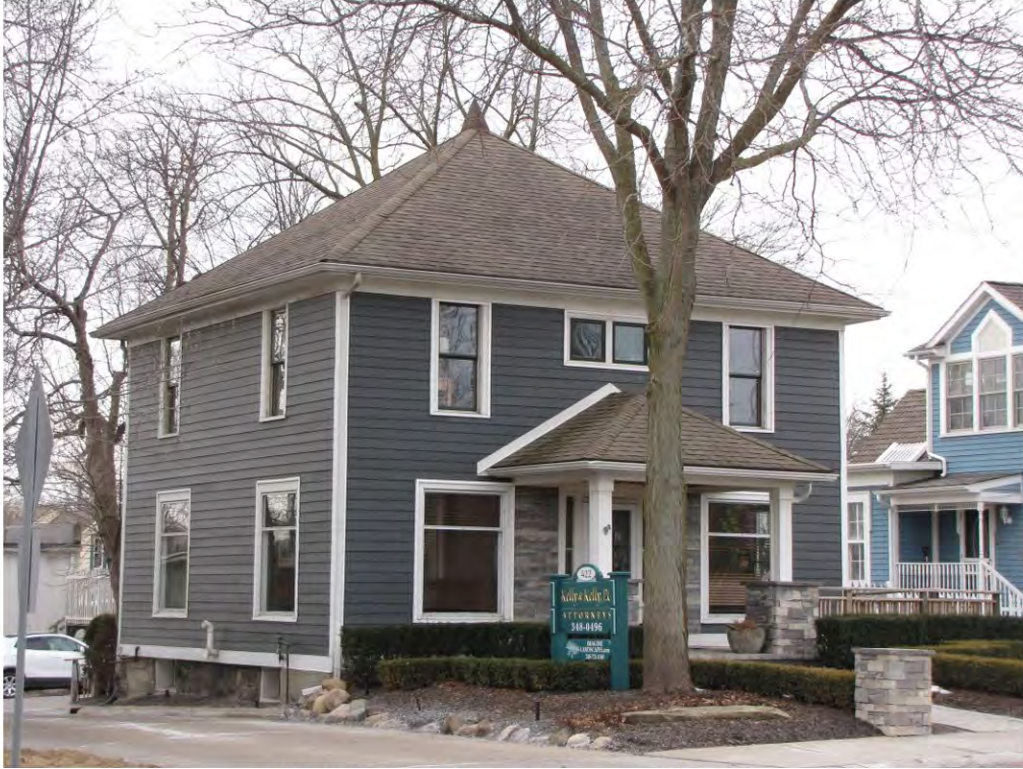
Main East 422_Looking Southwest