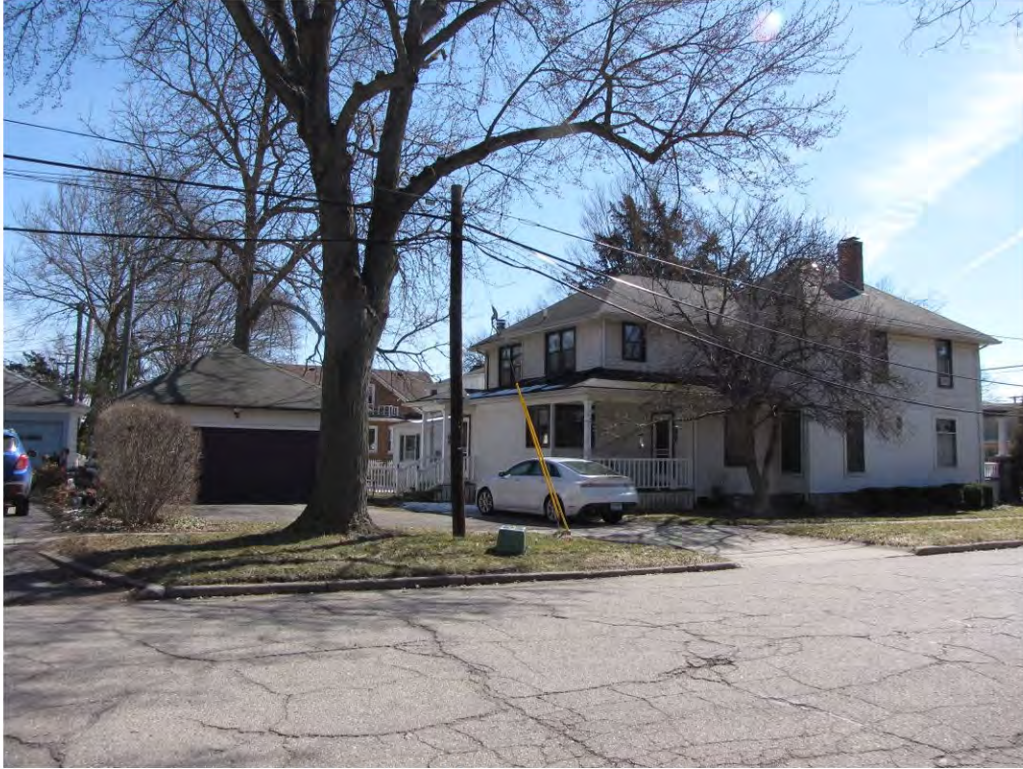
Main West 312_Looking Southeast