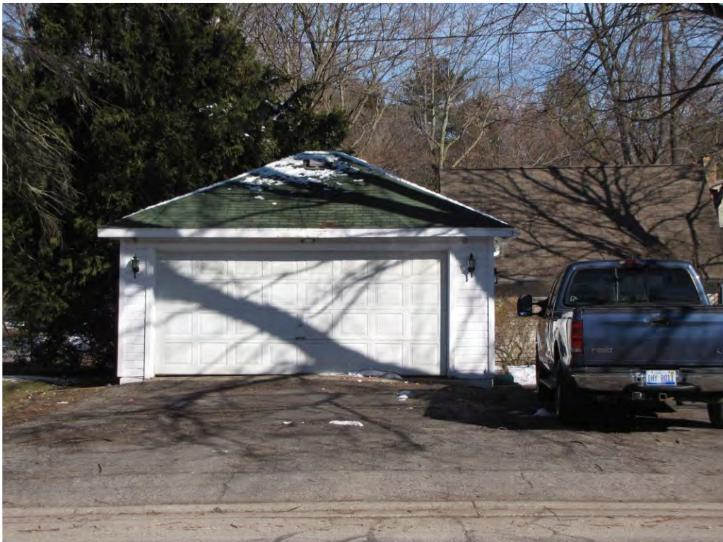
Rogers North 101, Garage_Looking North