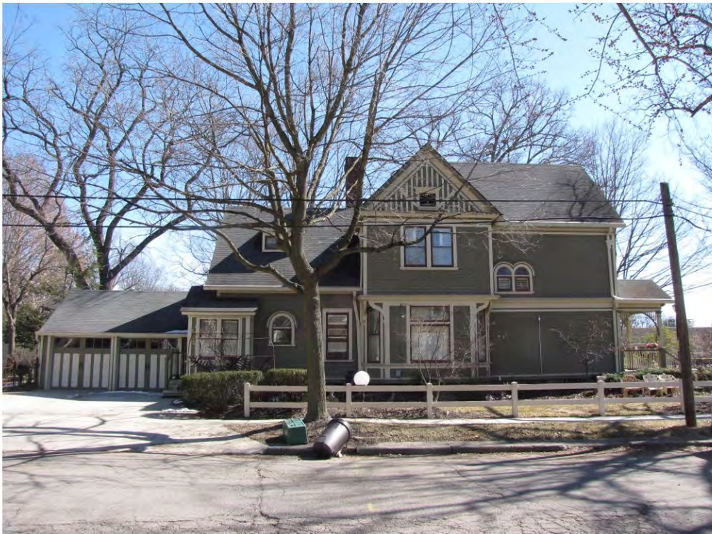
Main West 418_ Looking East