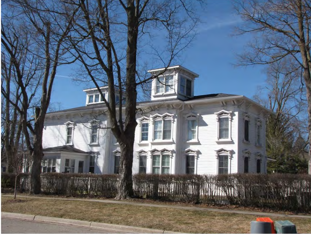
Dunlap West 404_Looking Southwest