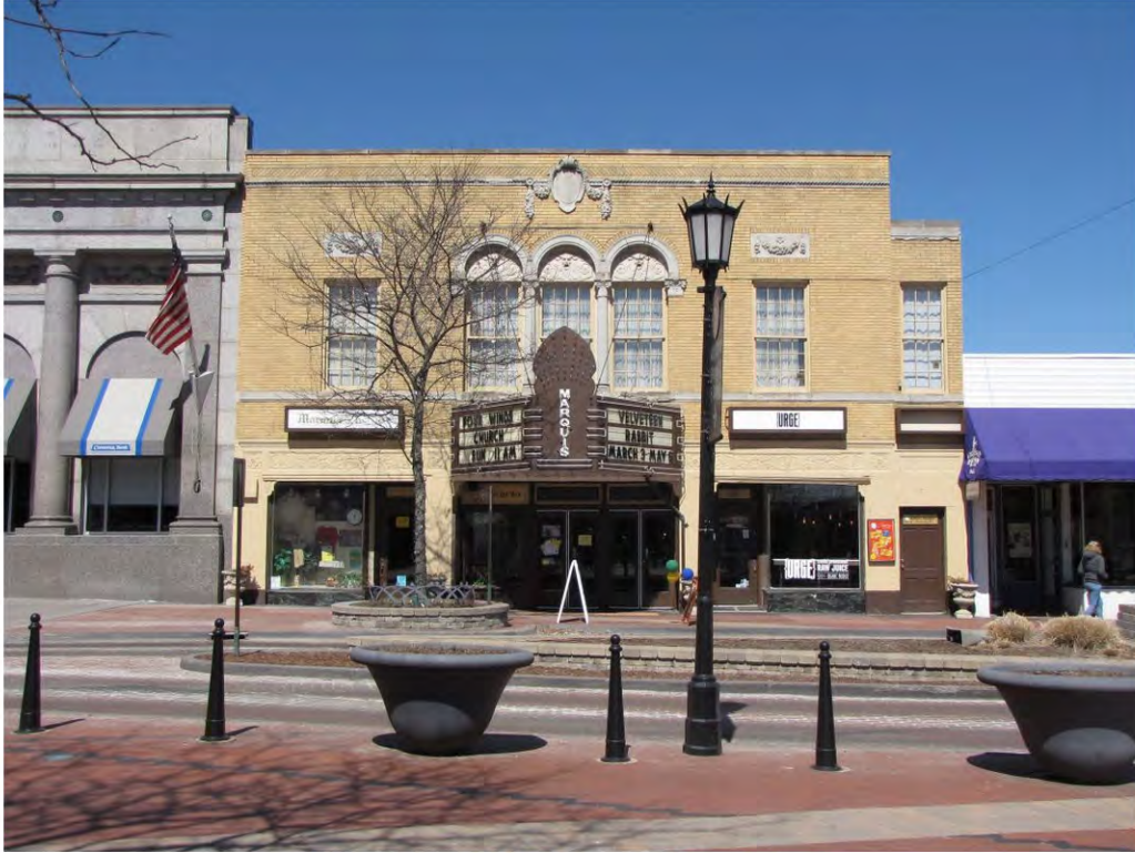
Main East 131-137_Looking North