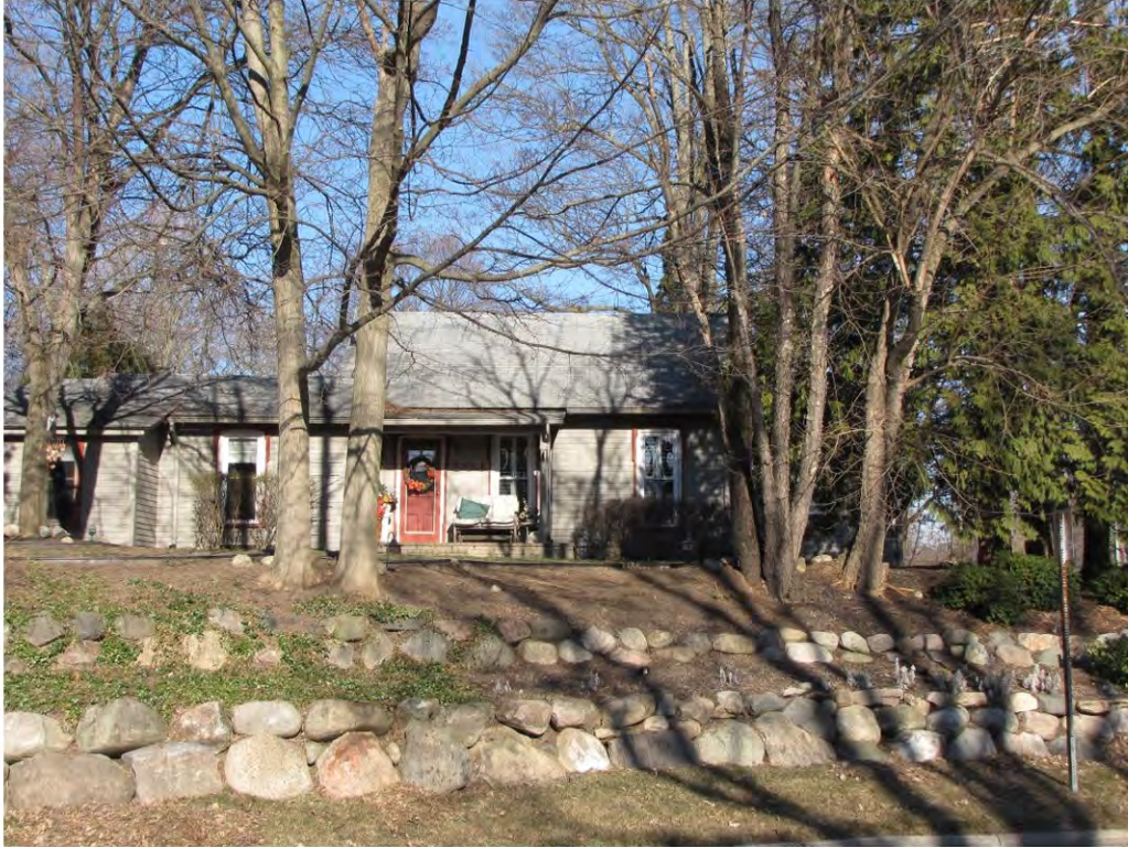
Randolph 503_Looking West