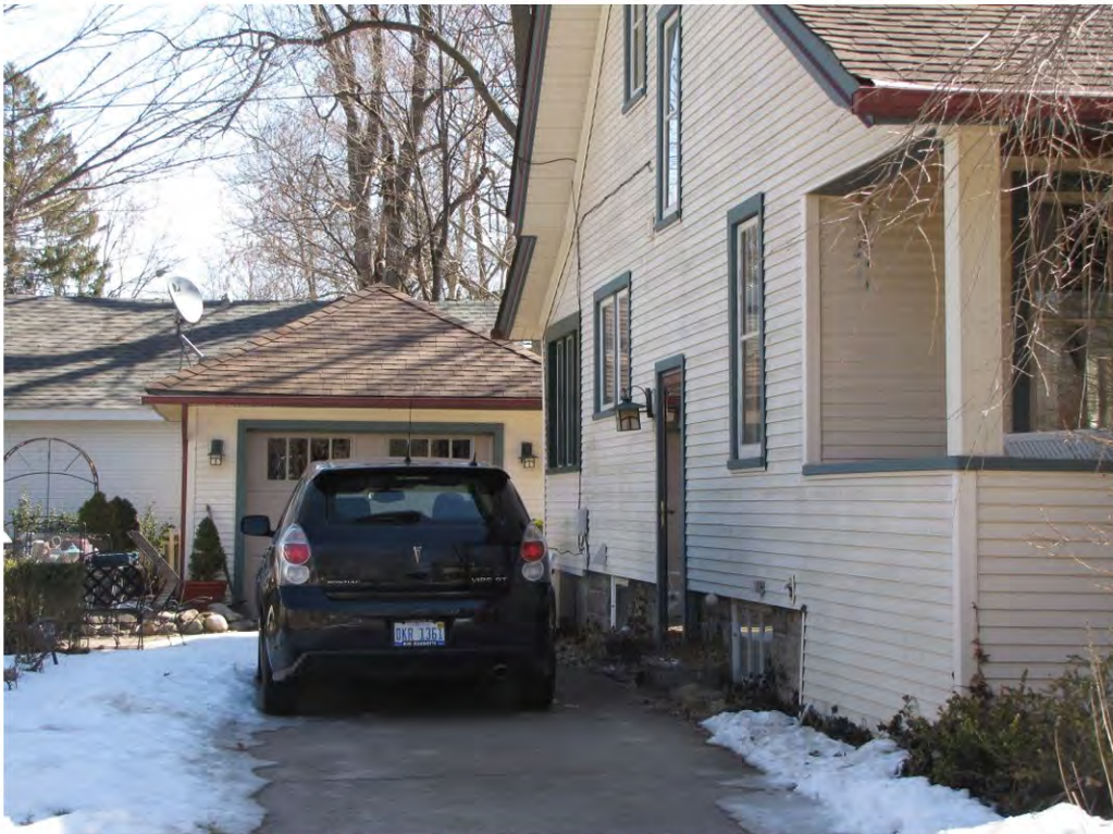
Linden 118, Garage_Looking East