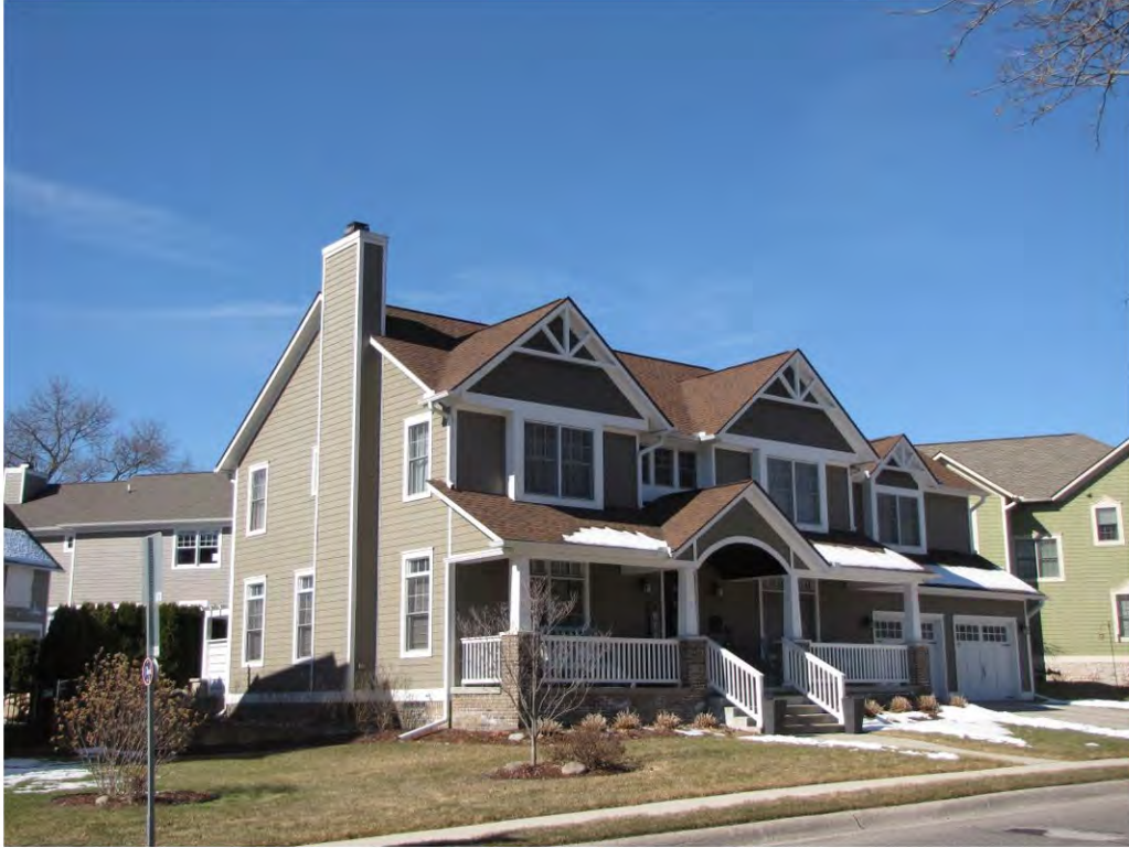
Randolph 405_Looking Southeast