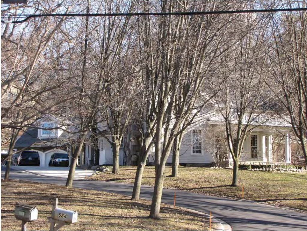
Randolph 562_Looking North