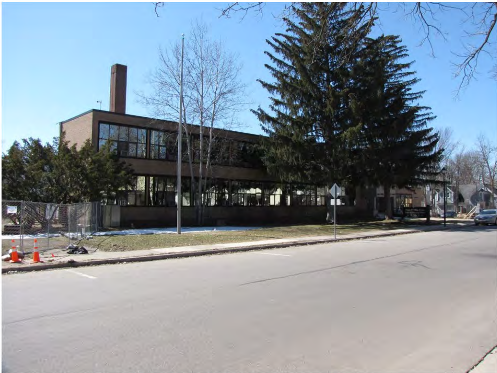
Main West 501_ Looking Southwest