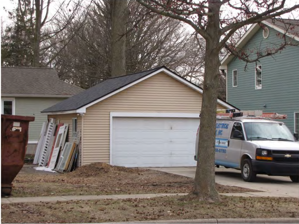
Cady West 495, Garage_Looking Southeast