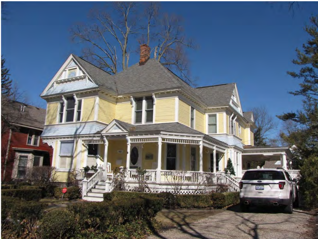
Dunlap West 412_Looking North