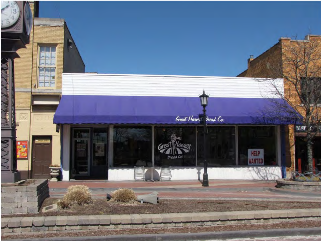
Main East 139_Looking North