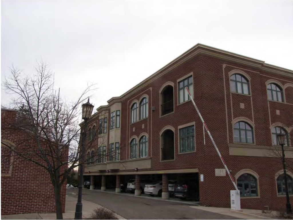
Cady East 300_Looking Southeast