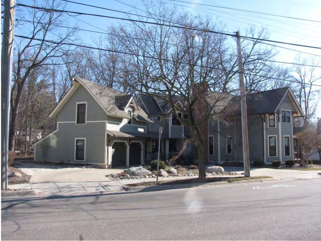
Randolph 402_Looking Northeast