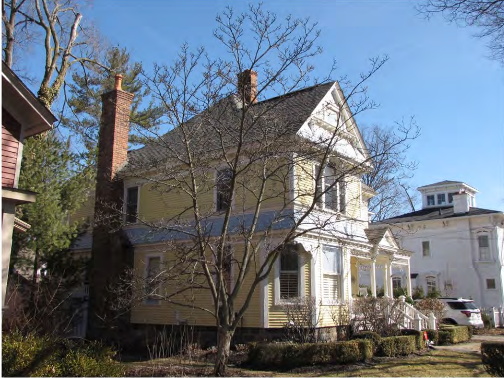
Dunlap West 412_Looking Northeast