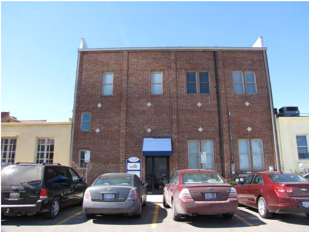
Center North 124-128_Looking Southeast