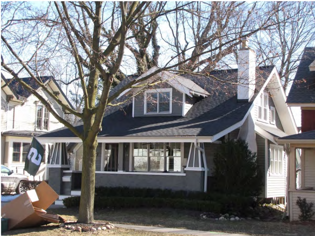
Wing North 214_Looking Northwest