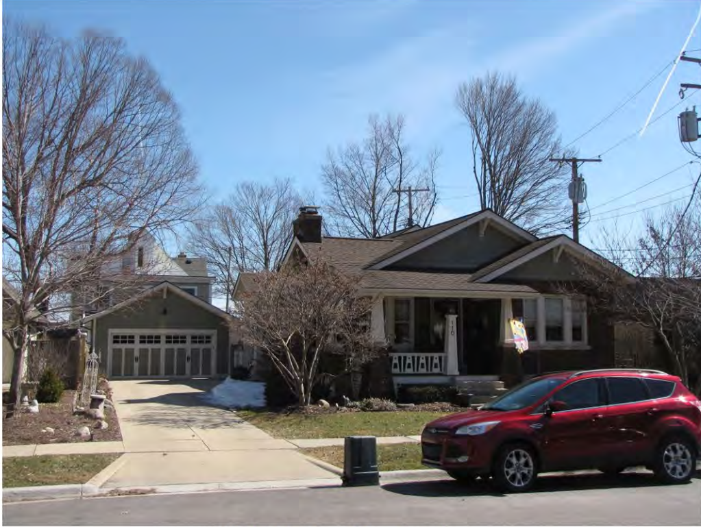
High 116_Looking Southeast