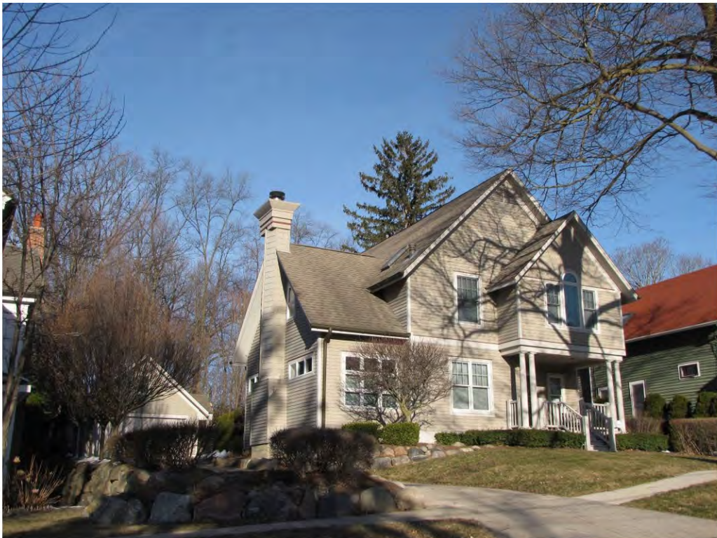
Rogers North 353_Looking Northwest