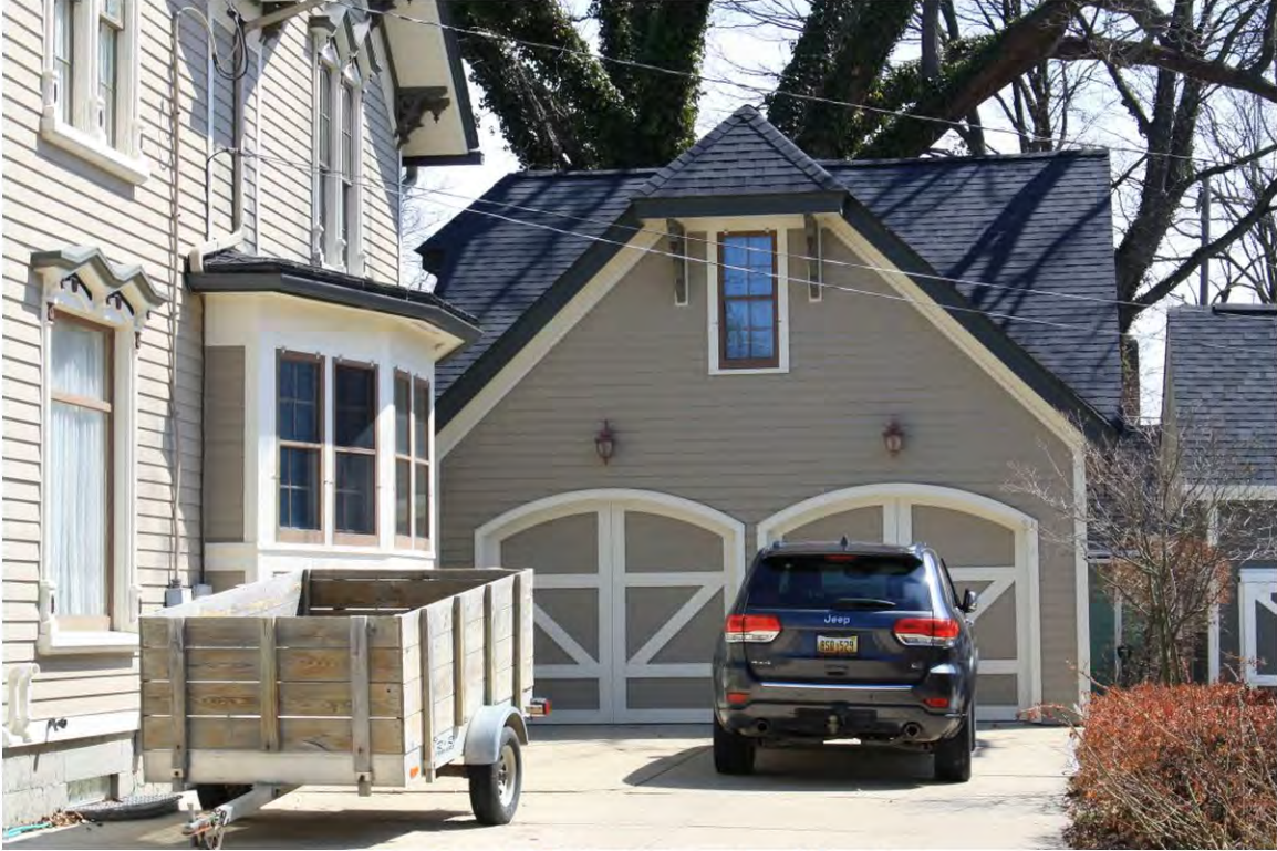
Wing North 220, Garage_Looking East