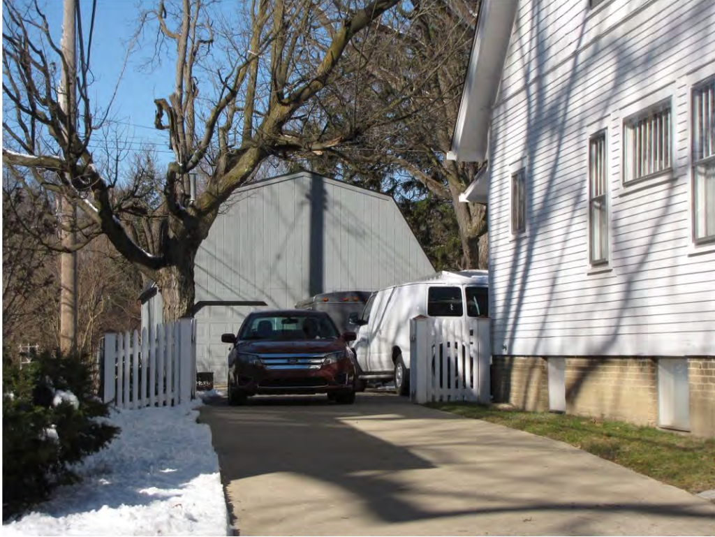
Rogers South 110, Garage_Looking West