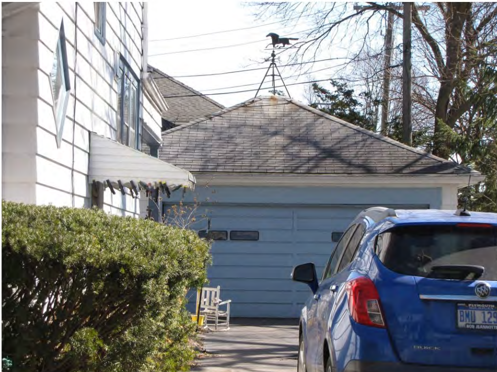
West 114, Garage_Looking East