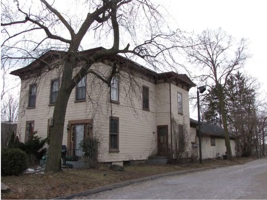
Main East 342_ Looking Southeast