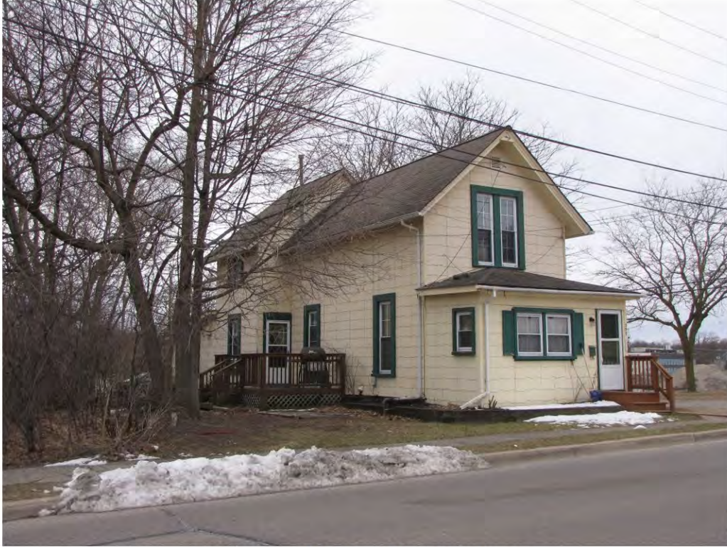
Cady East 350_Looking Southwest