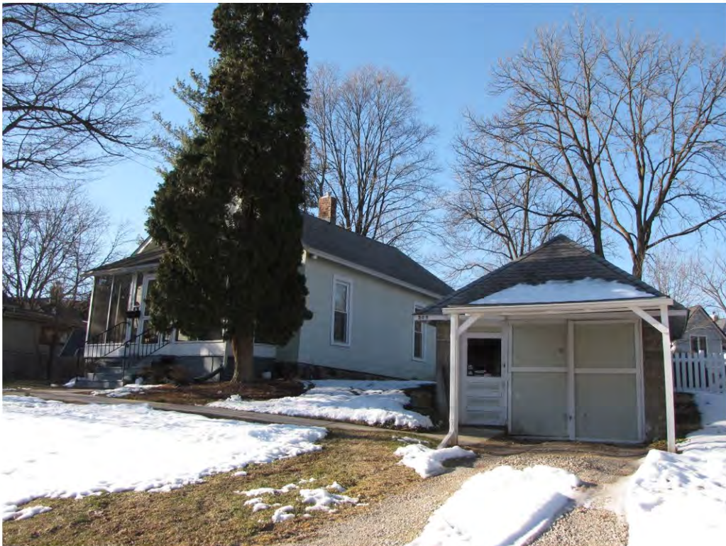
Randolph 509_Looking Southeast