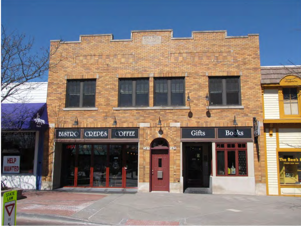
Main East 141-145_ Looking North