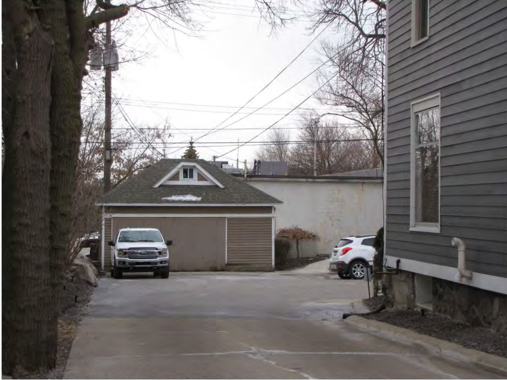
Main East 422, Garage_Looking South