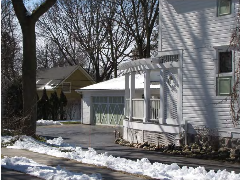
Dunlap West 537, Garage_Looking Southwest