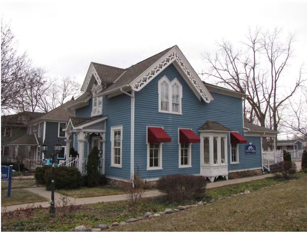
Main East 410_Looking Southeast