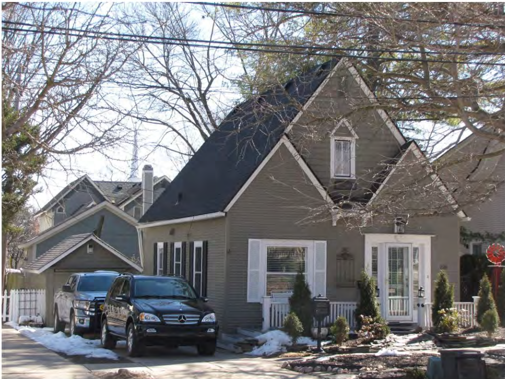
West 228_Looking Southeast