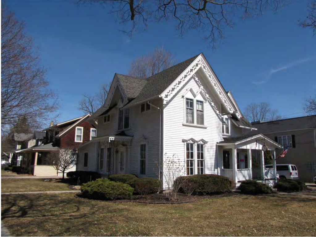
Dunlap West 132_Looking Northeast