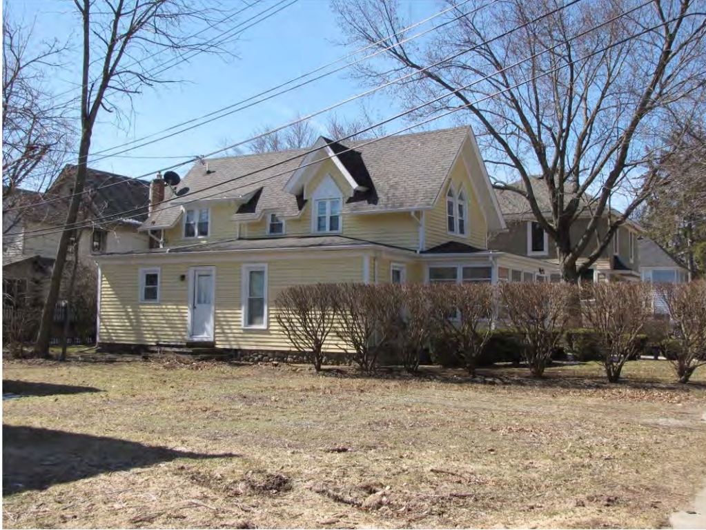
Dunlap West 211_Looking Southwest