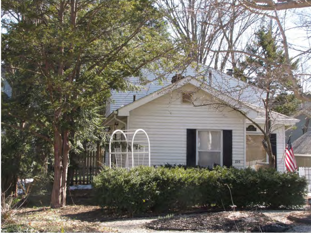
West 236-Looking East