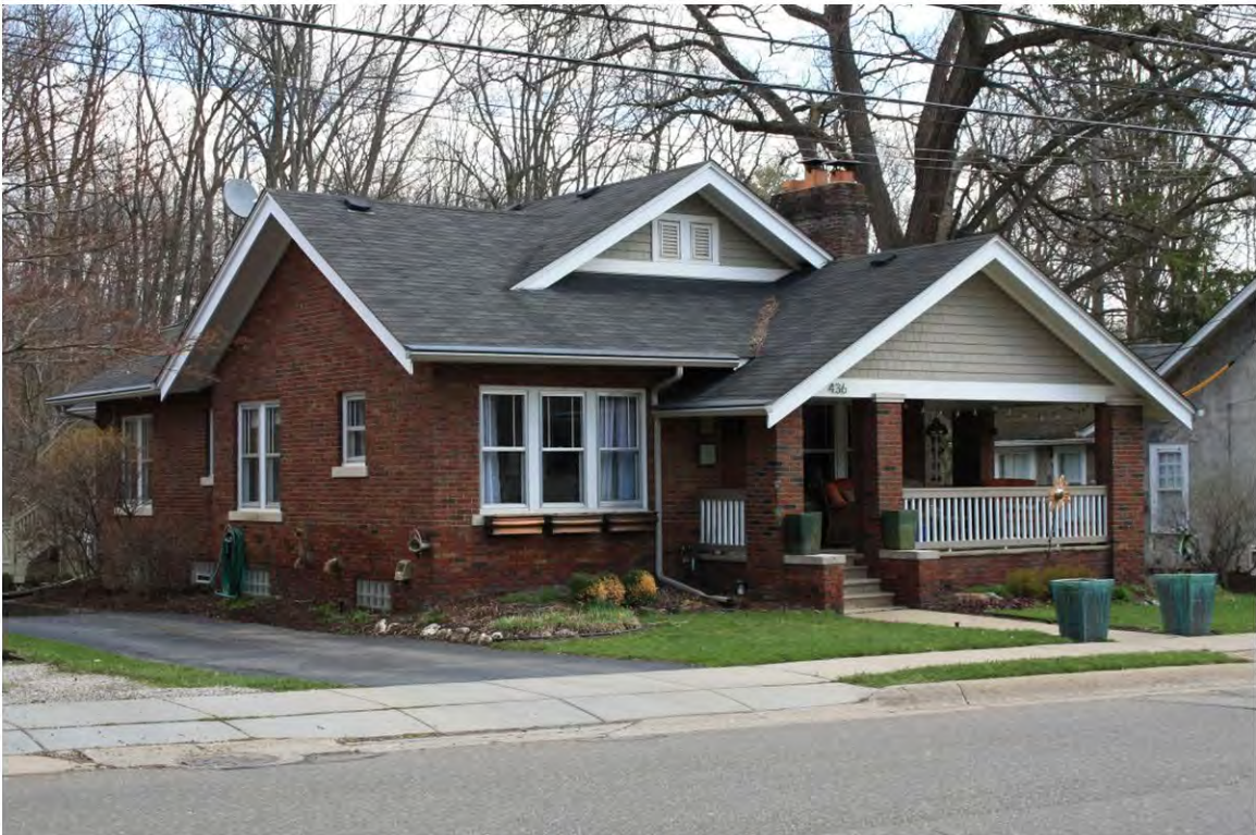
Randolph 436_Looking Northeast