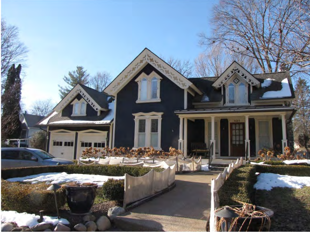
Randolph 521_Looking South