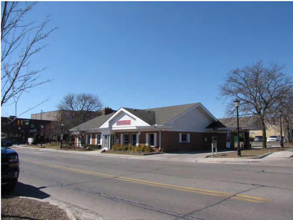
Hutton 127_Looking Southwest