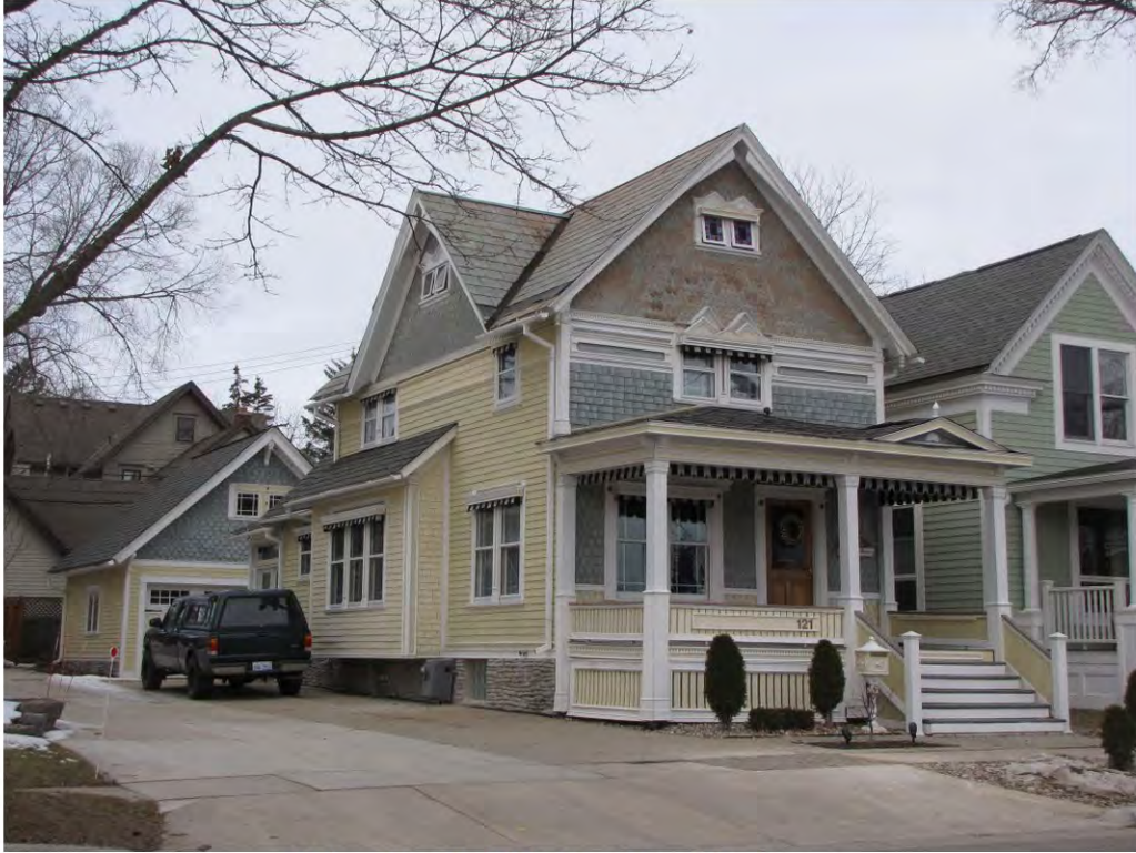
Wing North 121_Looking Northwest