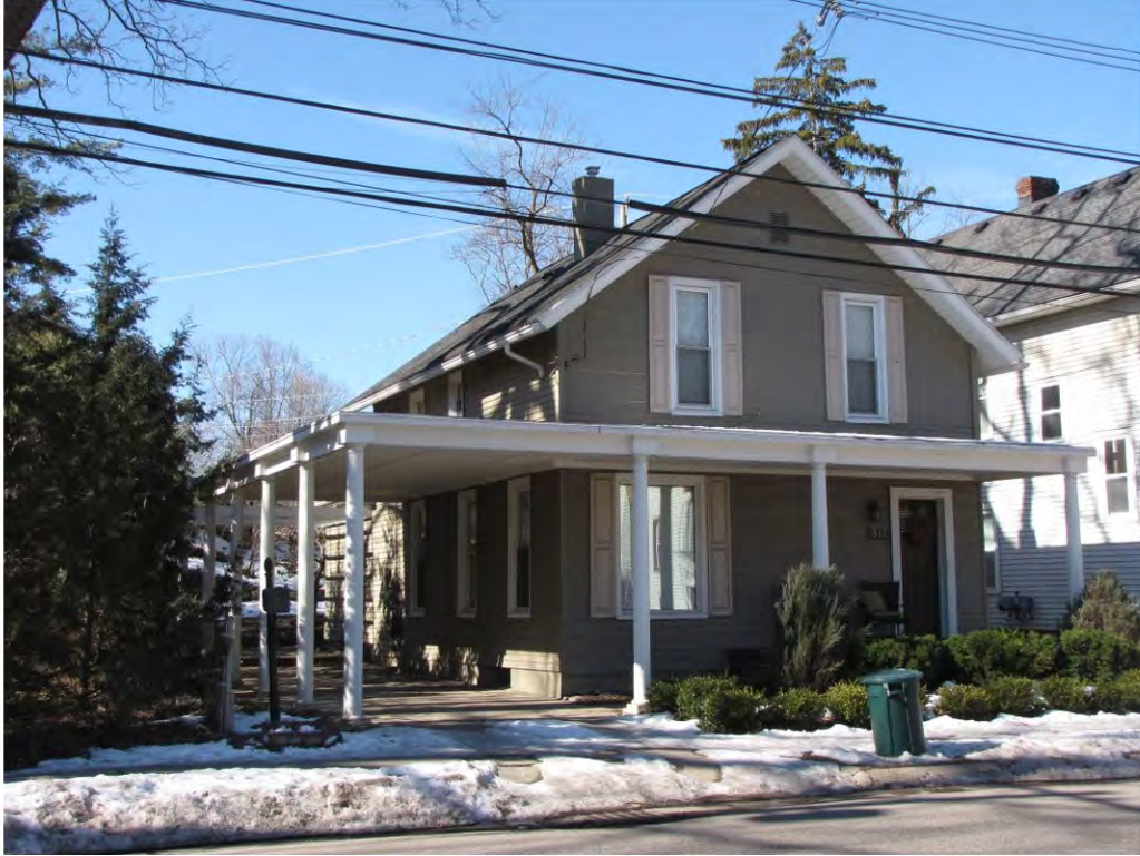
Randolph 317_Looking Southwest