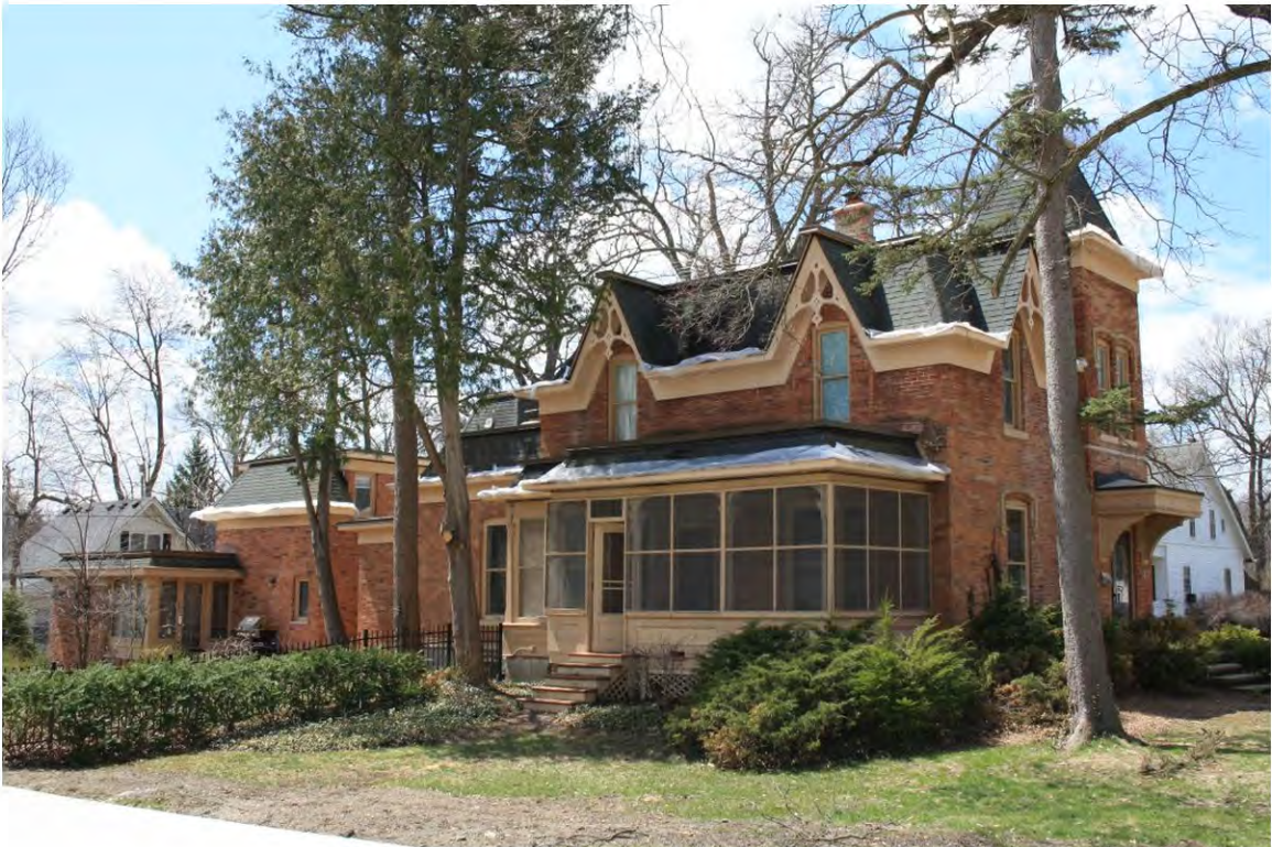
Main West 547_ Looking Southwest