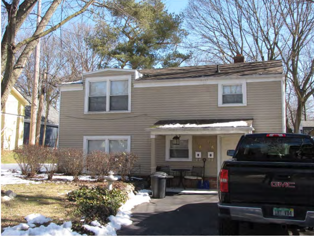
Rogers North 114-116_Looking East