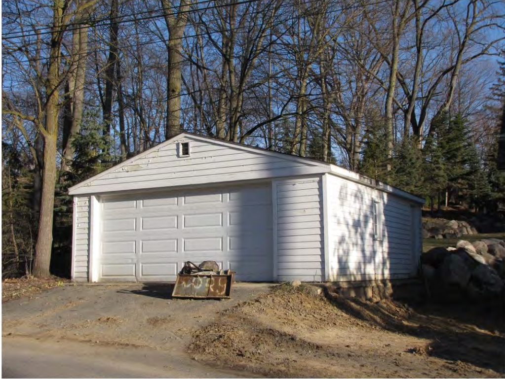
Rogers North 333, Garage_Looking Northwest