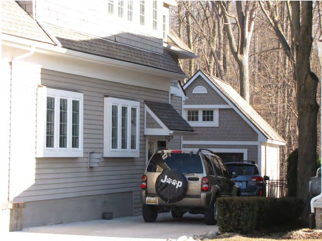
Randolph 418, Garage_Looking North