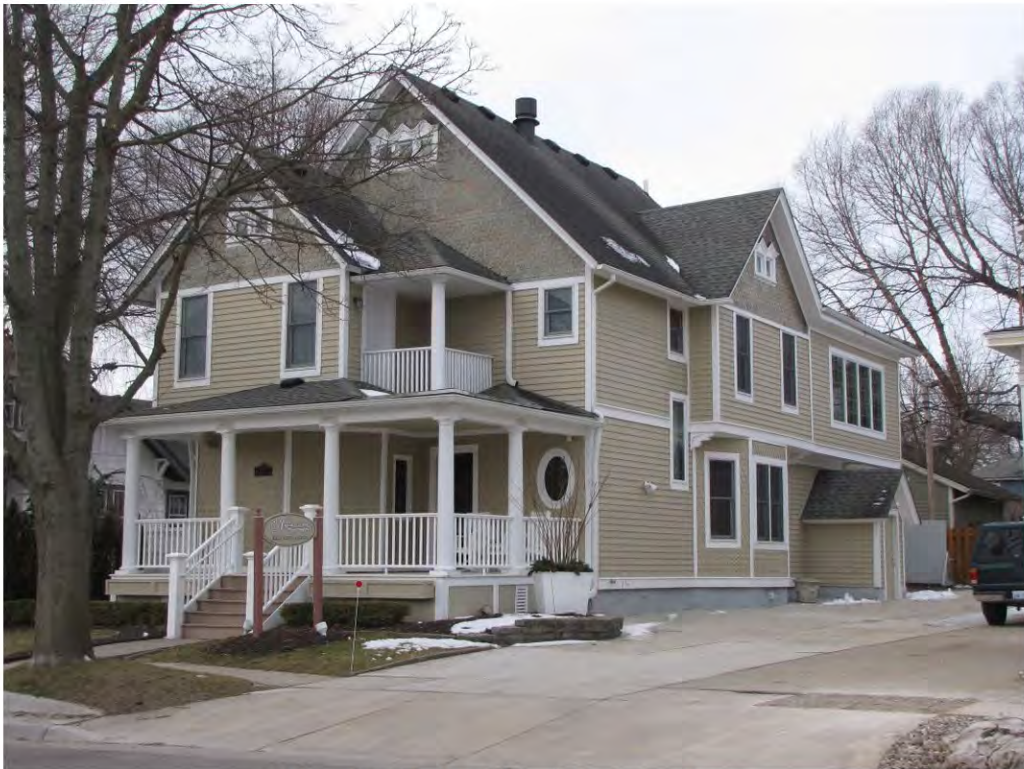
Wing North 117_Looking Southwest