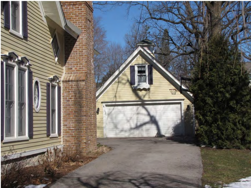
Dunlap West 542, Garage_Looking North