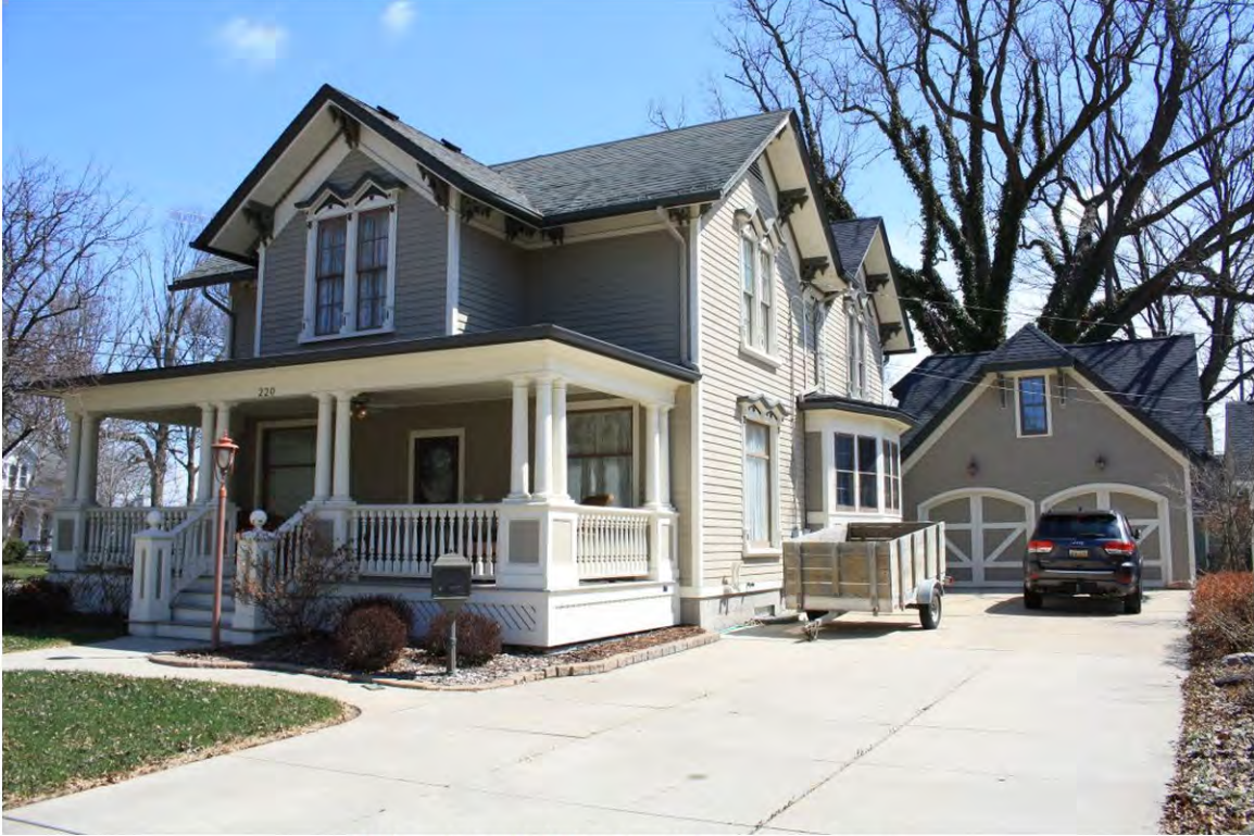
Wing North 220_Looking Southwest