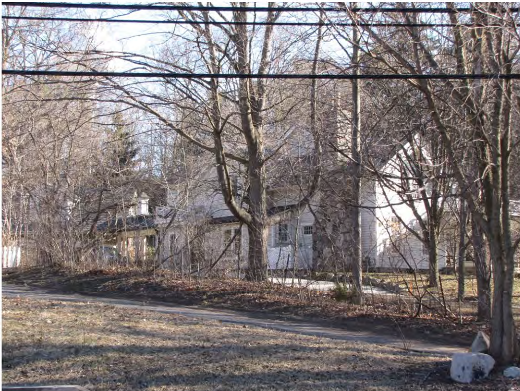
Randolph 562_Looking Northeast