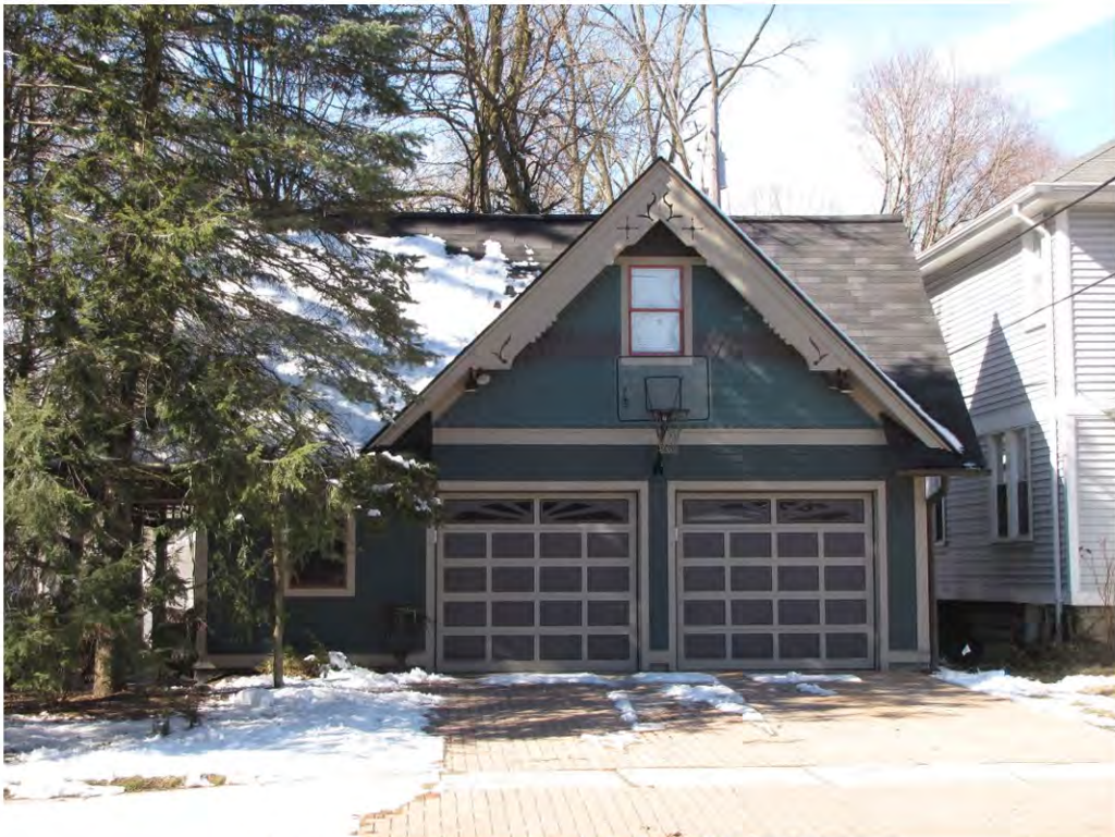
Dunlap West 504, Garage_Looking West