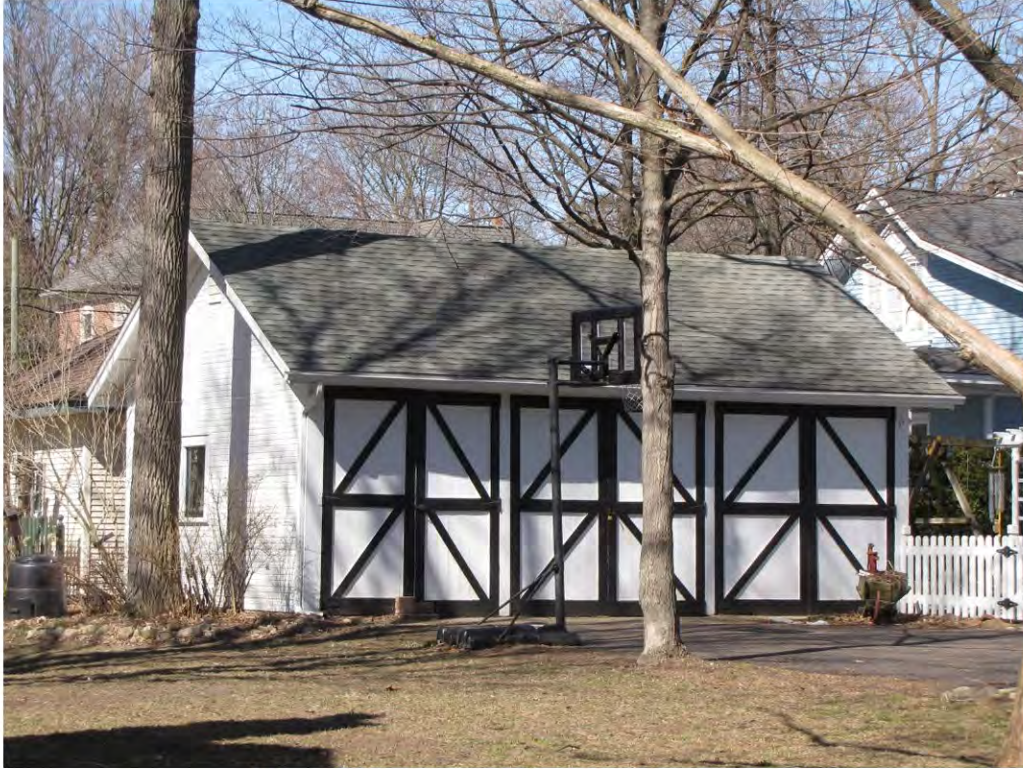
West 121, Garage_Looking Northwest