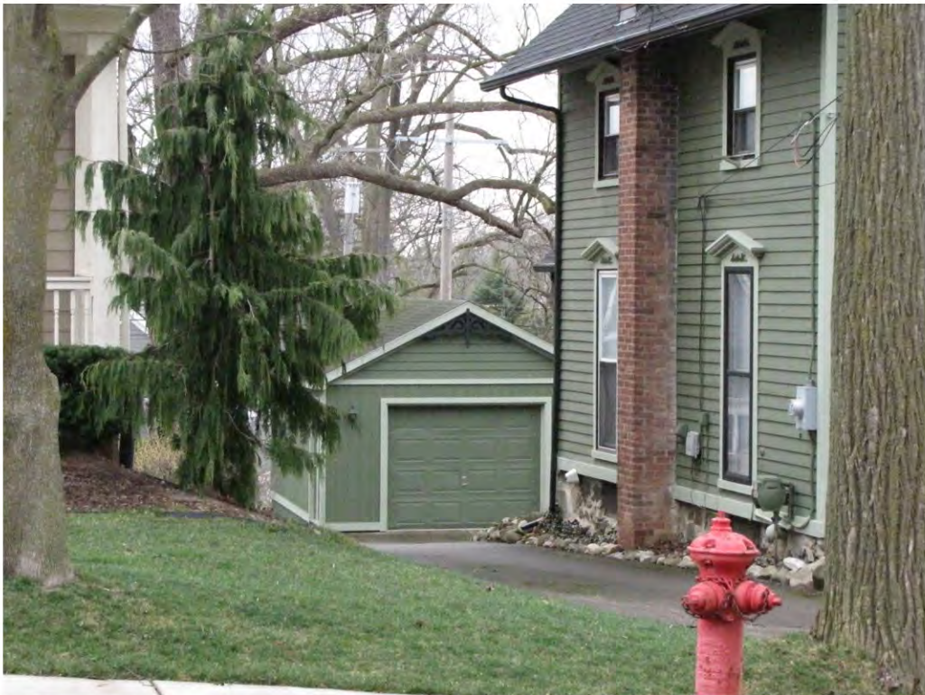
Rogers North 322, Garage_Looking East