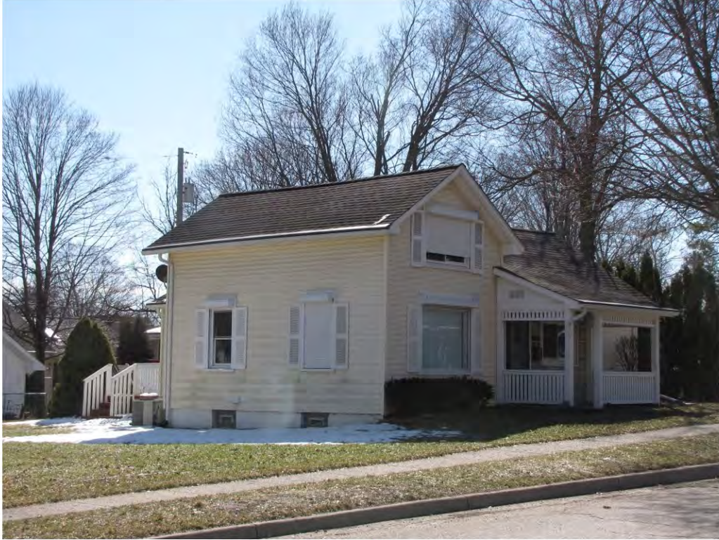
Linden 238_ Looking Southeast