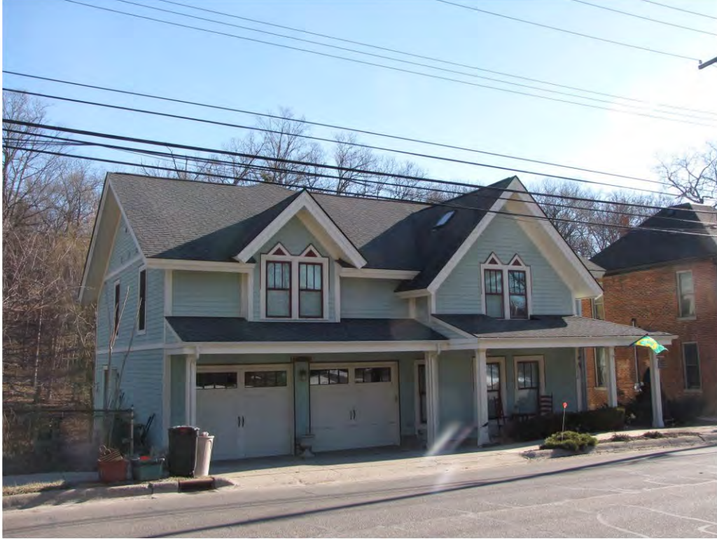
Randolph 516_Looking Northeast