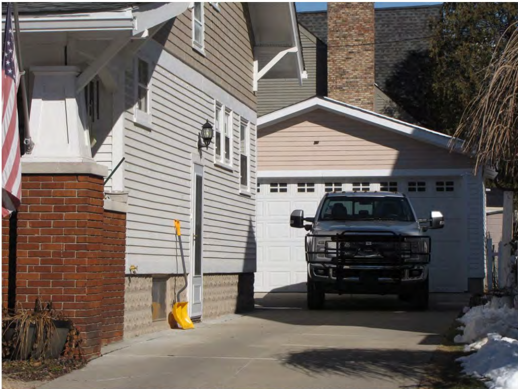
Dubuar 406, Garage_Looking North