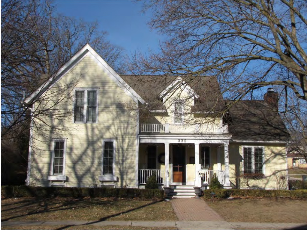
Linden 335_Looking West