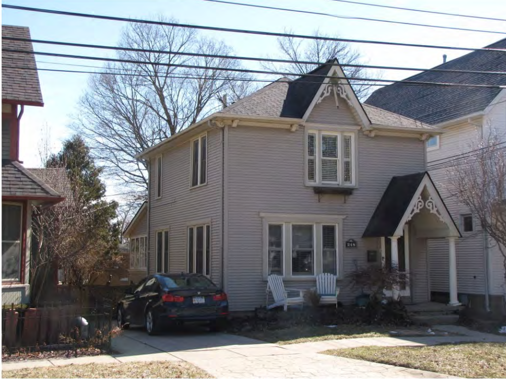
West 218_Looking Southeast