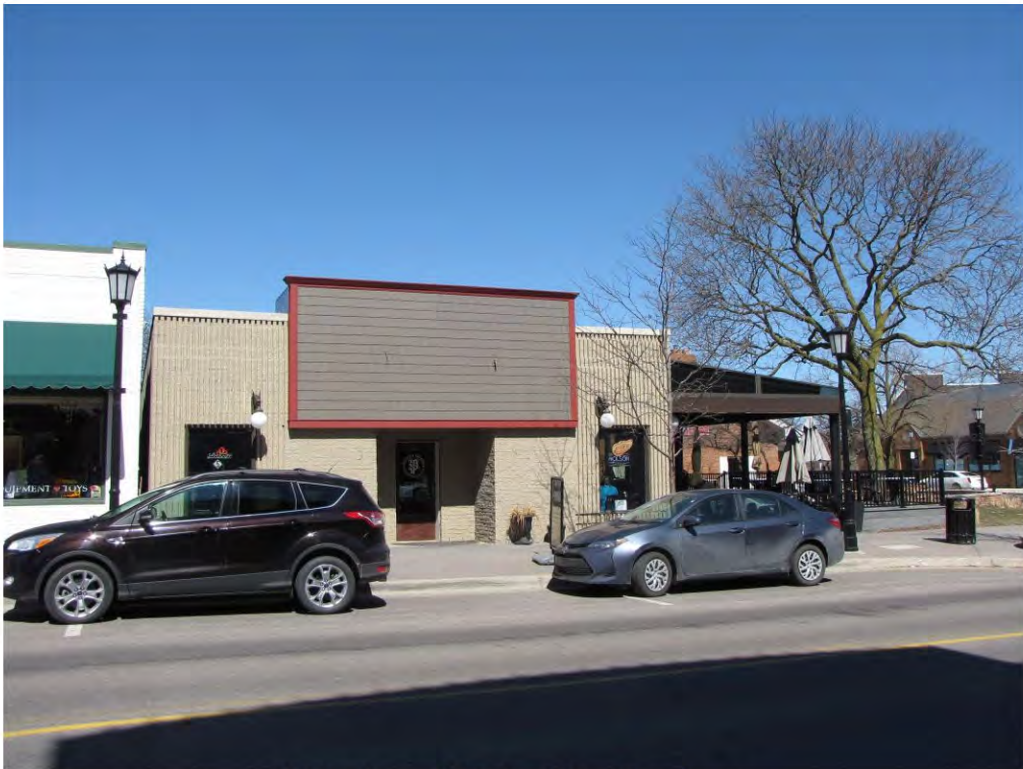
Main East 157_Looking Northeast