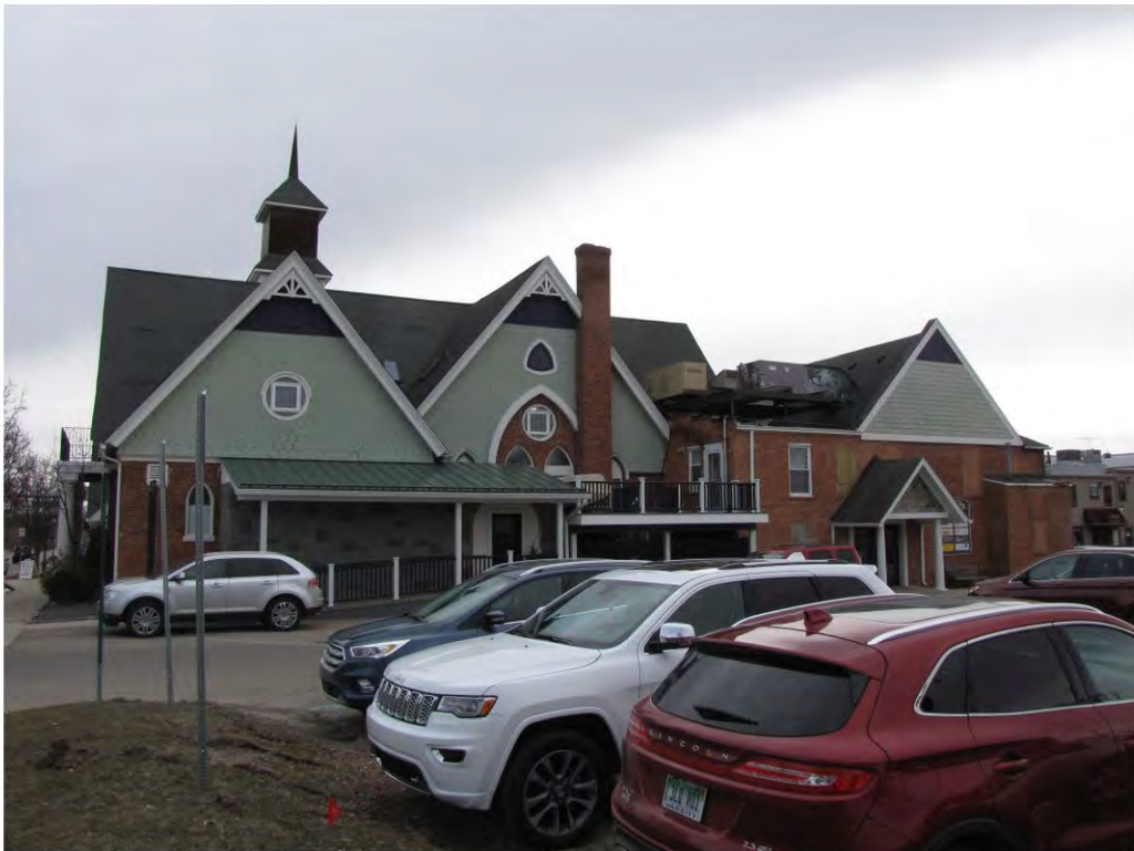
Center North 145-Looking East