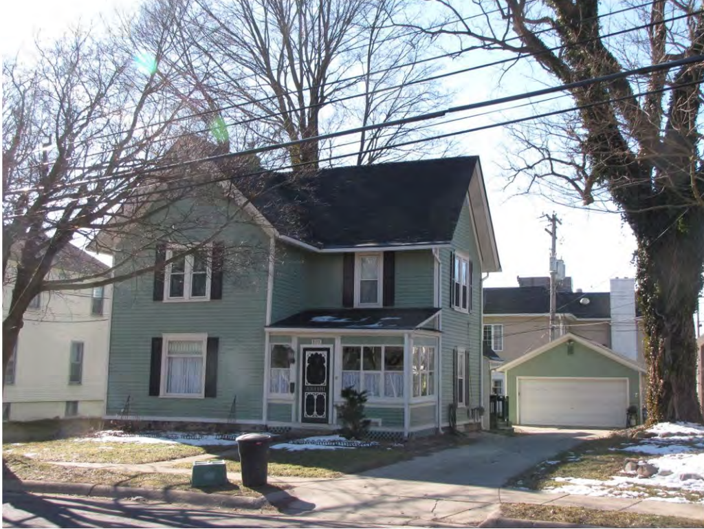
Randolph 125, Garage_Looking South