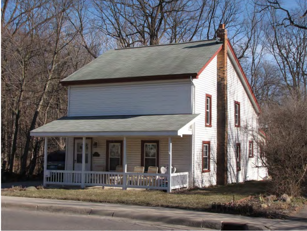
Randolph 318_Looking Northwest