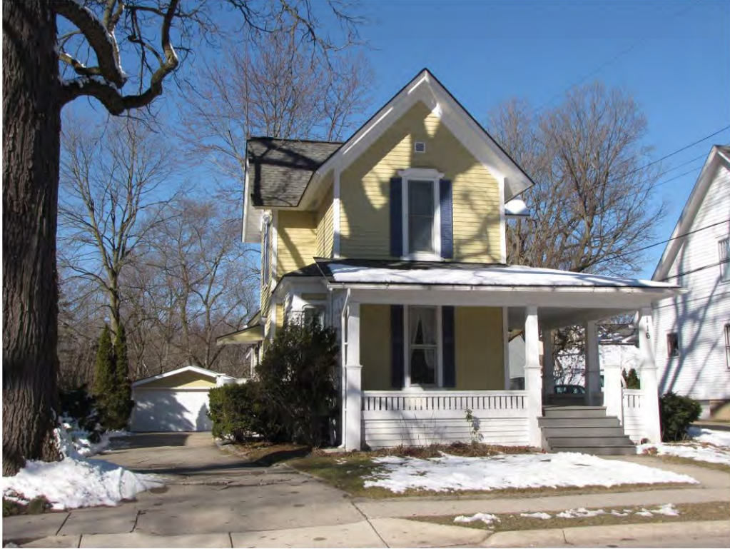
Rogers South 116_Looking West