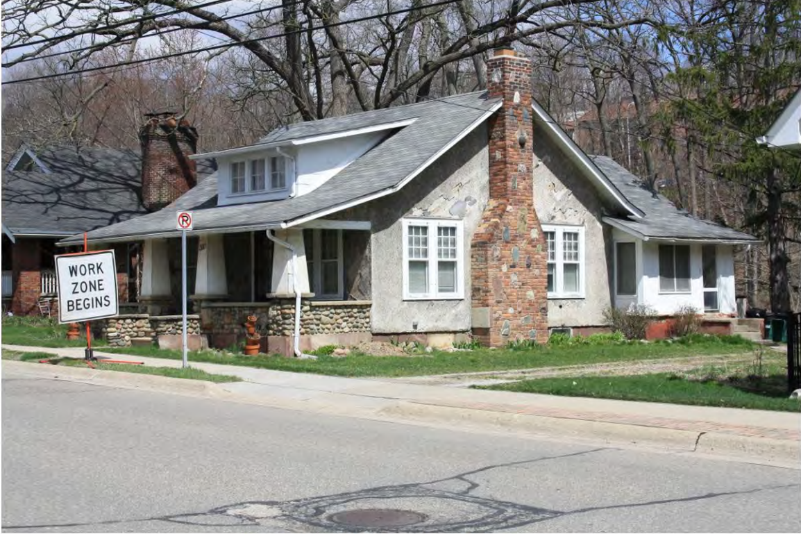
Randolph 424_Looking Northwest