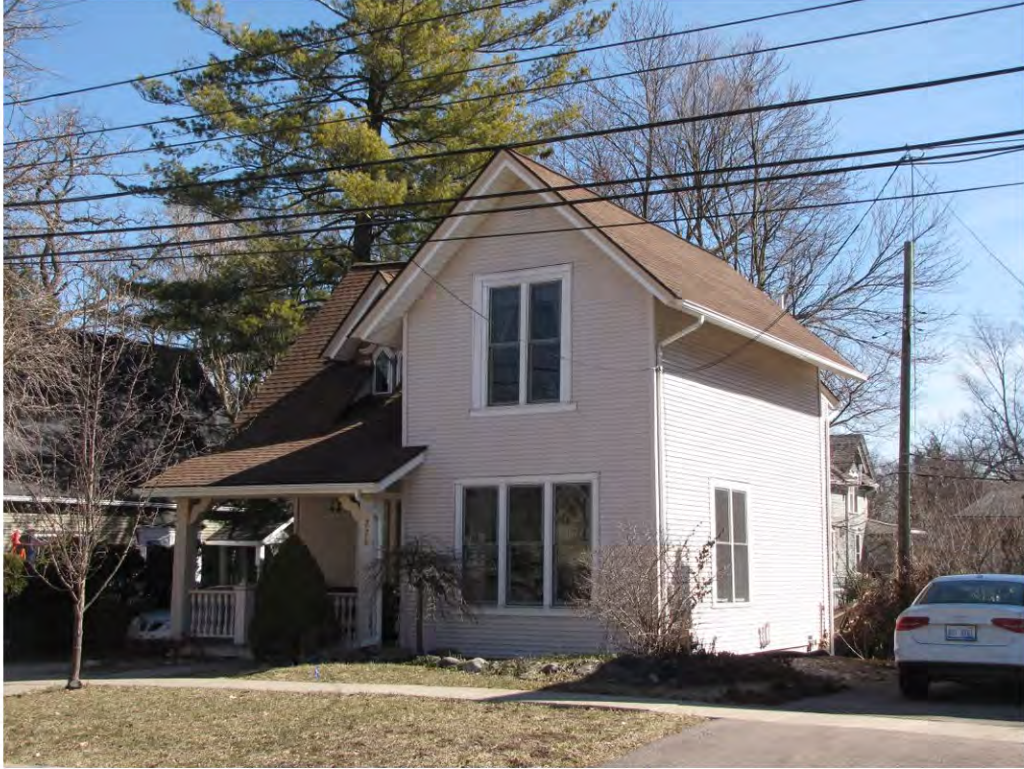
West 226_Looking Northeast