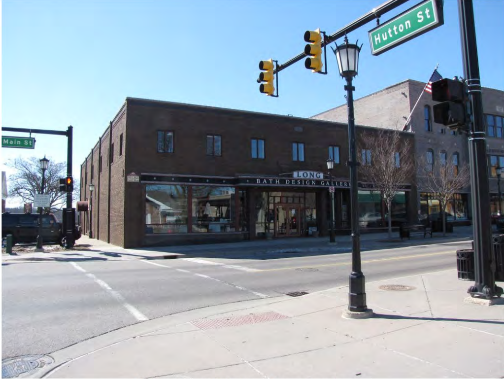
Main East 190_Looking Southwest