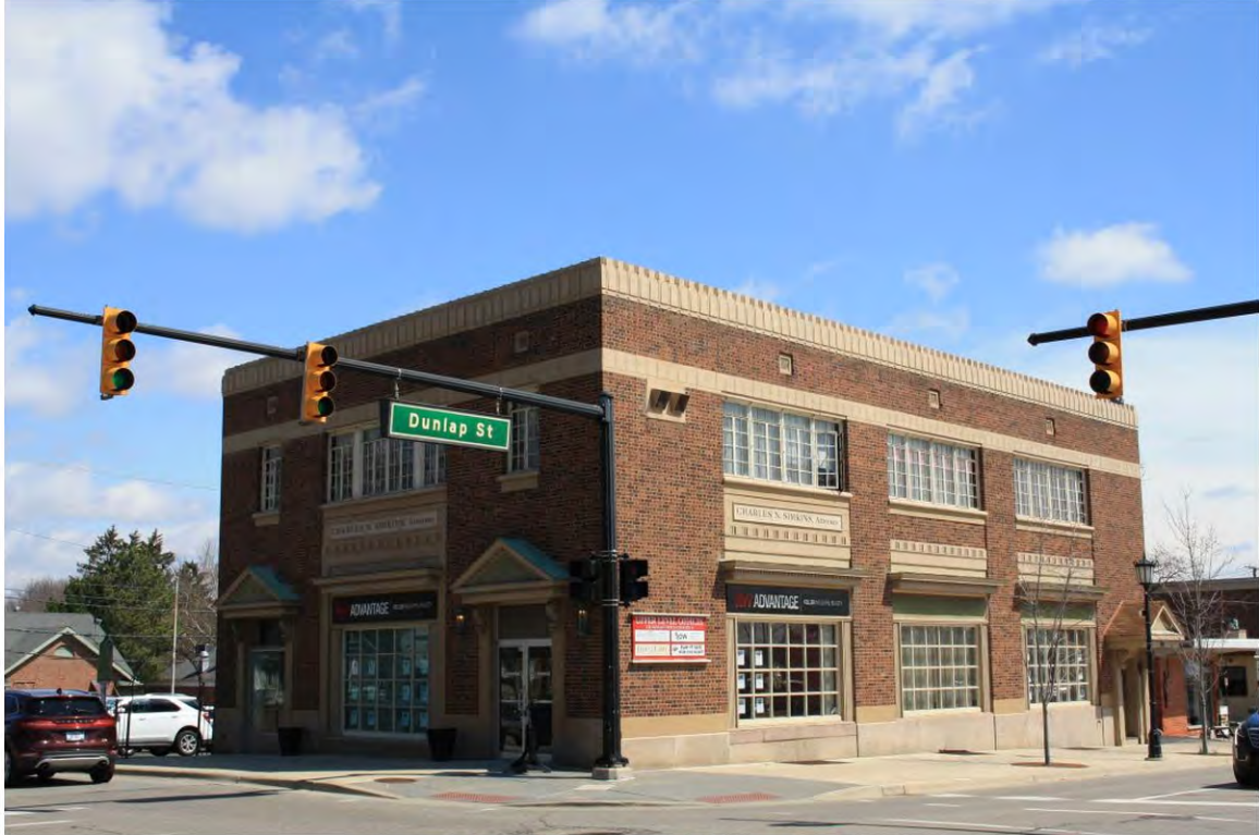
Center North 200_Looking Northeast