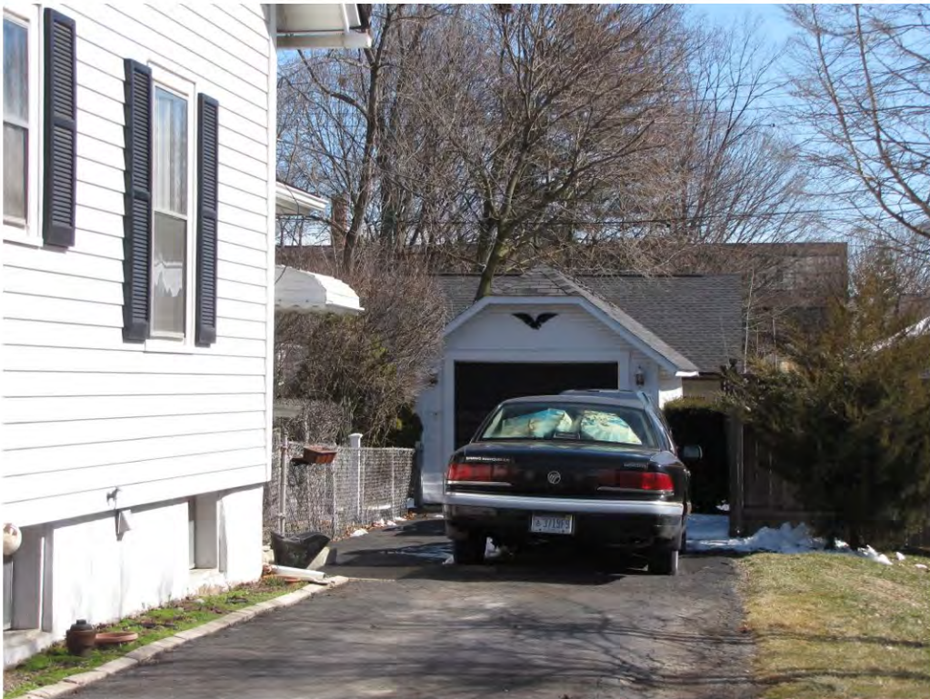
Rogers South 117, Garage_Looking East