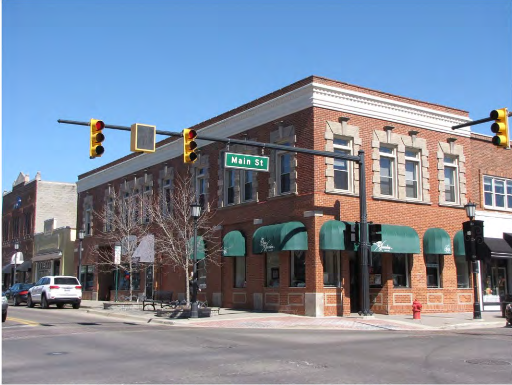
Main East 101 and Center North 108-110_Looking Northeast