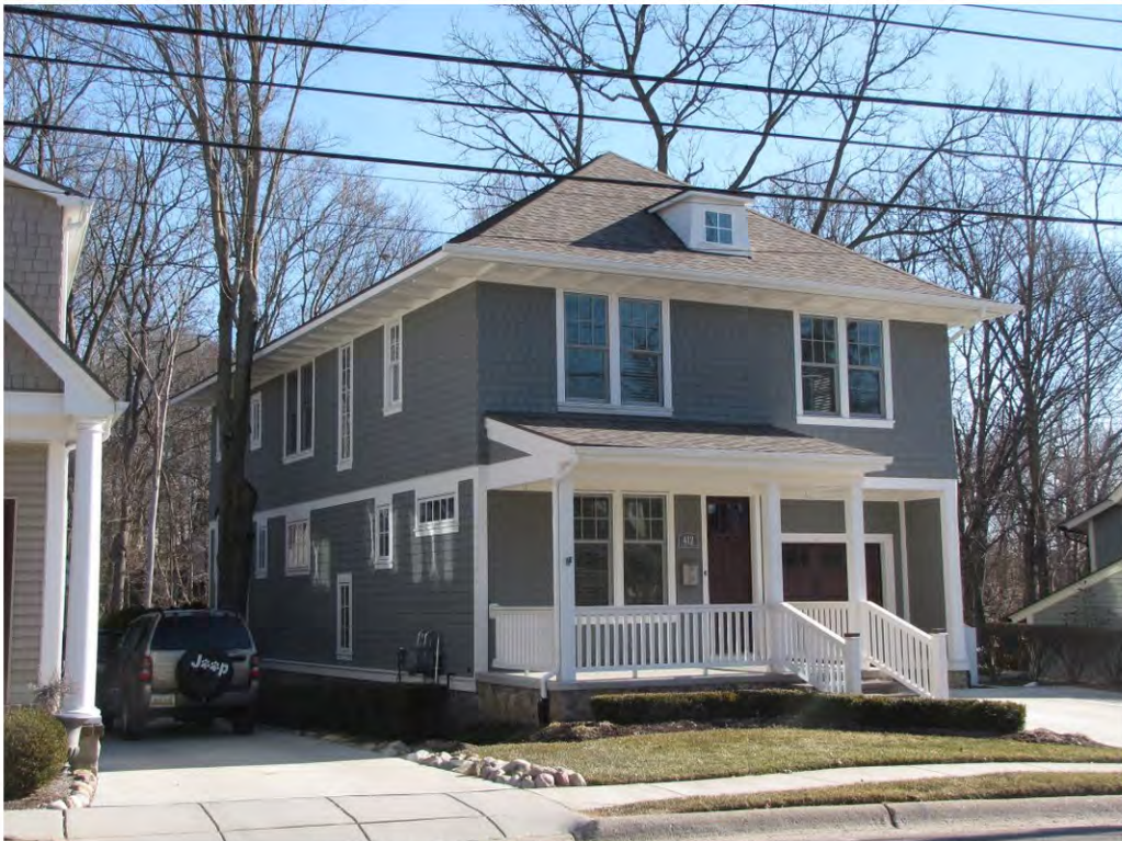
Randolph 412_Looking Northeast