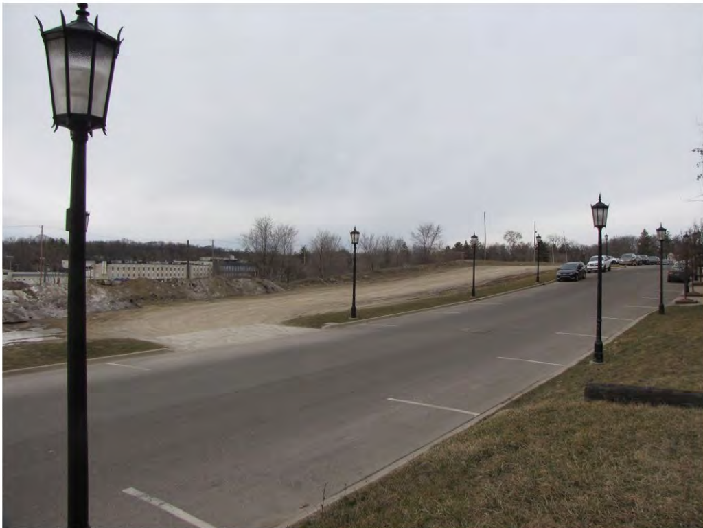
Cady East NVA 4_Looking Southeast