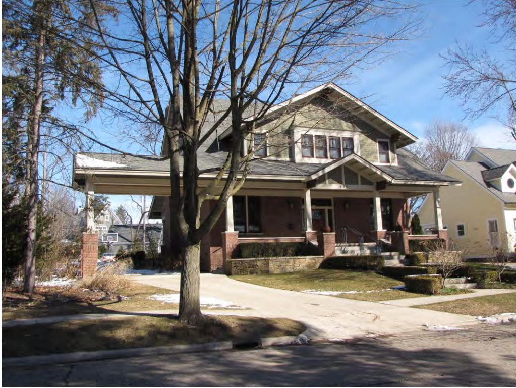
Dubuar 430_Looking Northeast