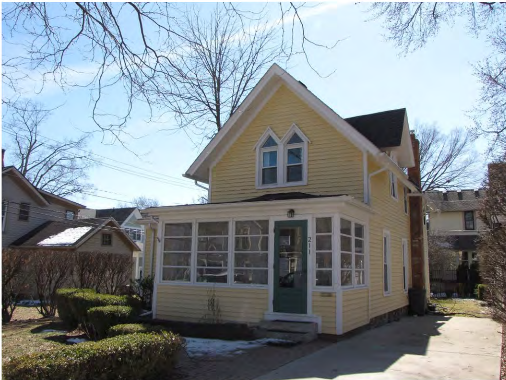
Dunlap West 211_Looking Southeast