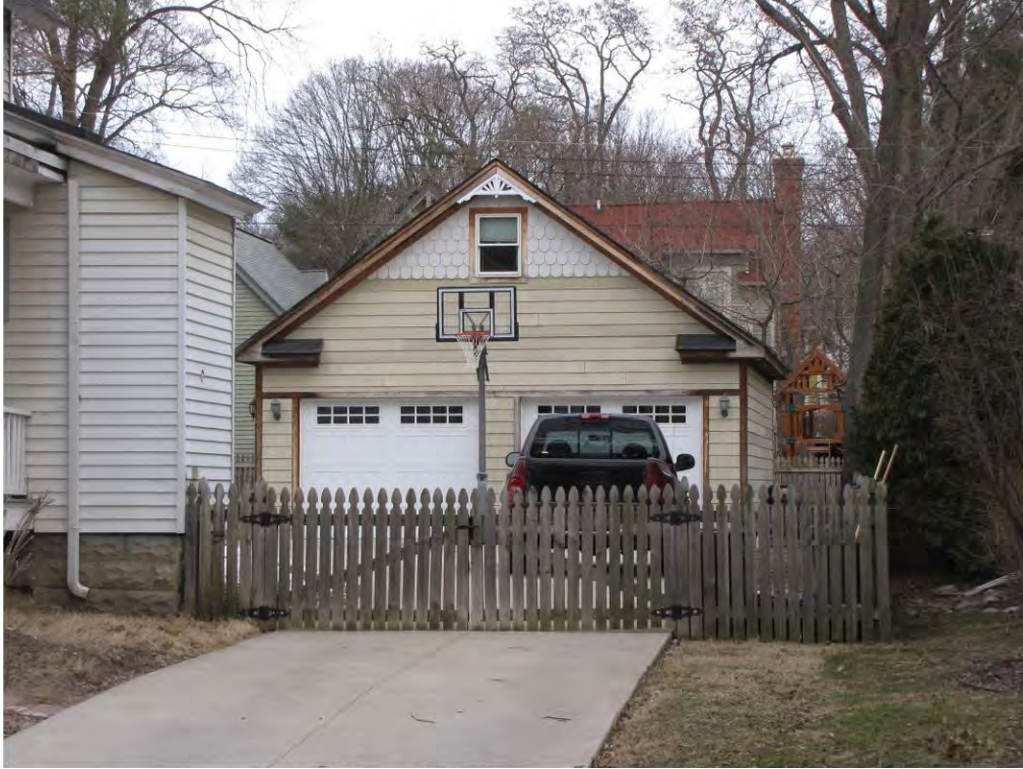
Cady West 508, Garage_Looking North