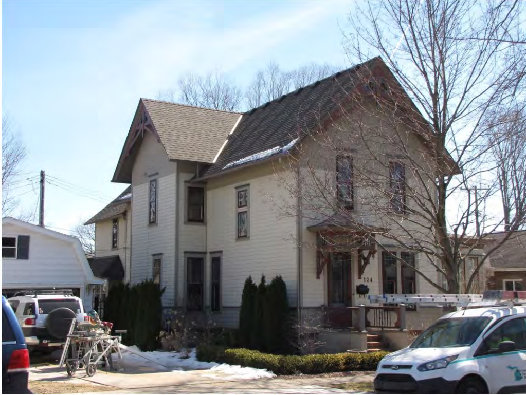
High 124_Looking Southeast