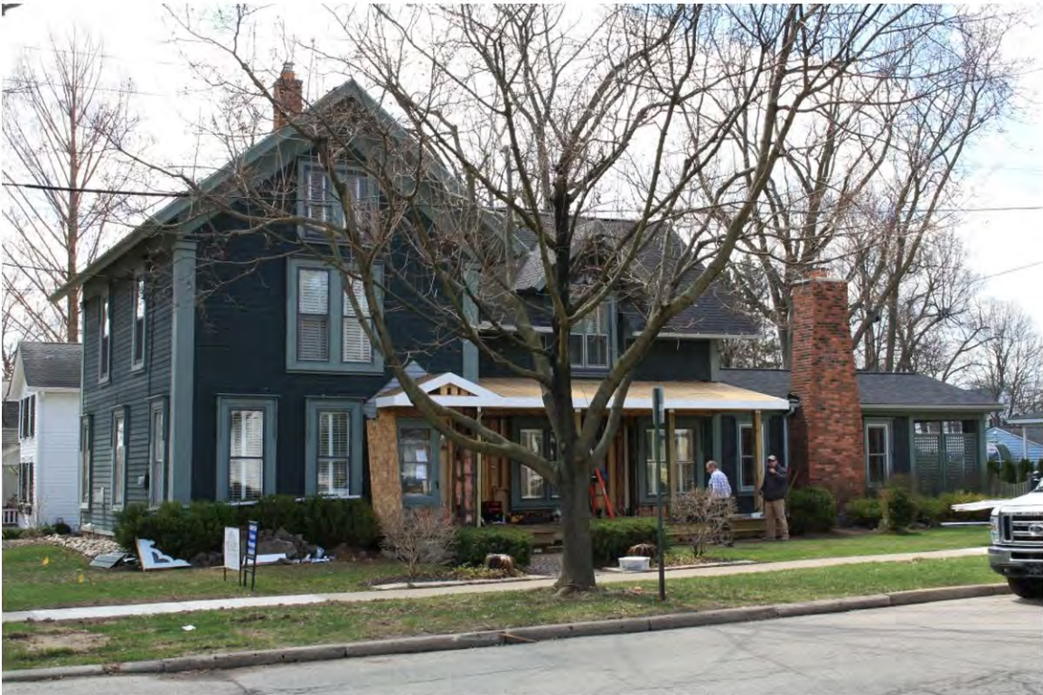
Dunlap West 401_Looking Southwest