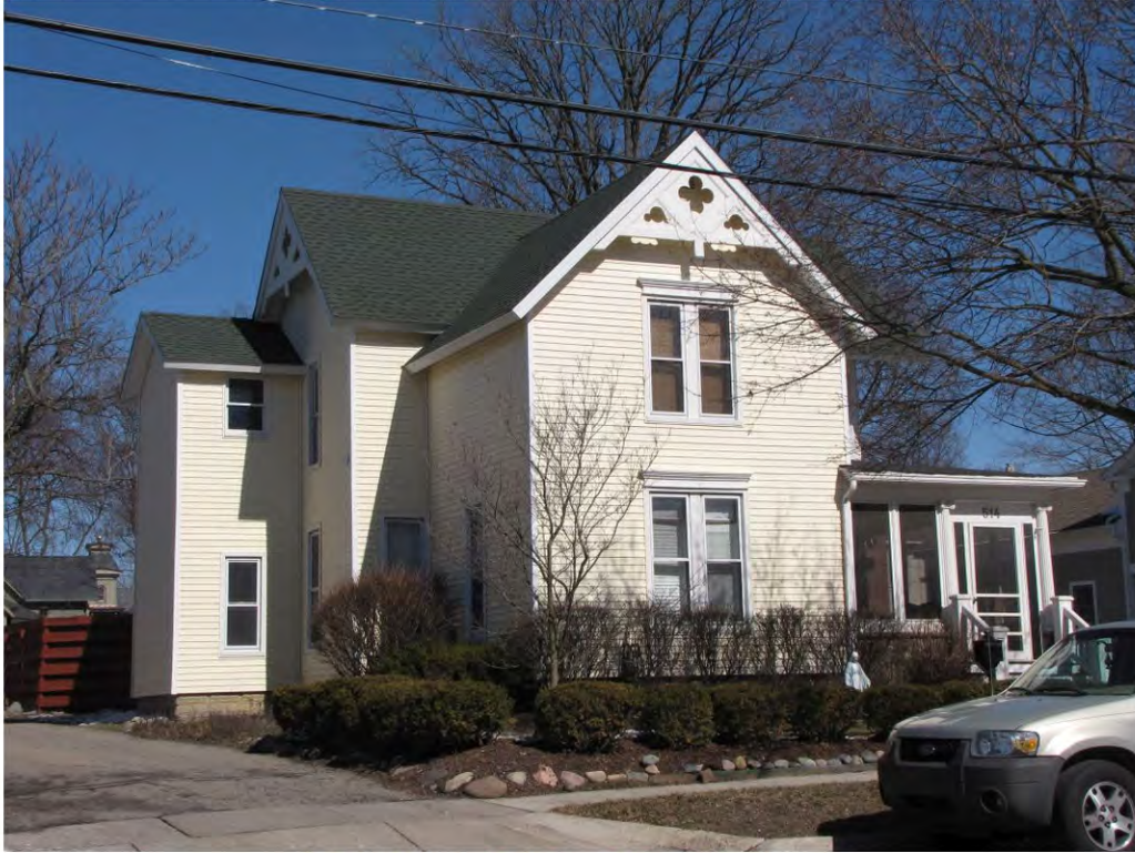
Main West 514_Looking Northeast