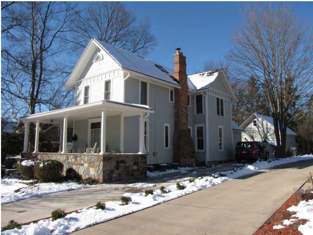
Rogers South 128_Looking Southwest