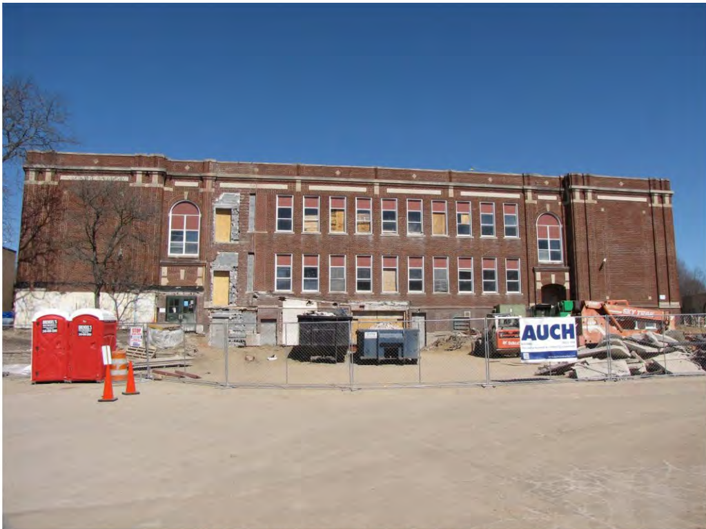
Main West 411_ Looking North