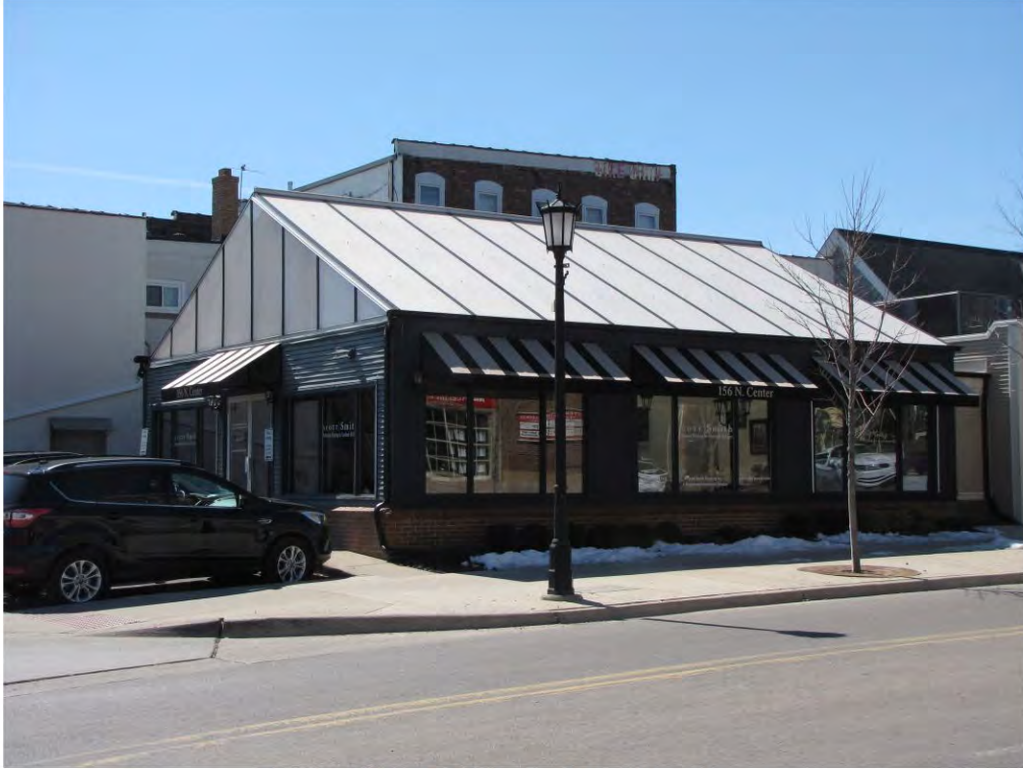
Center North 156_Looking Southeast