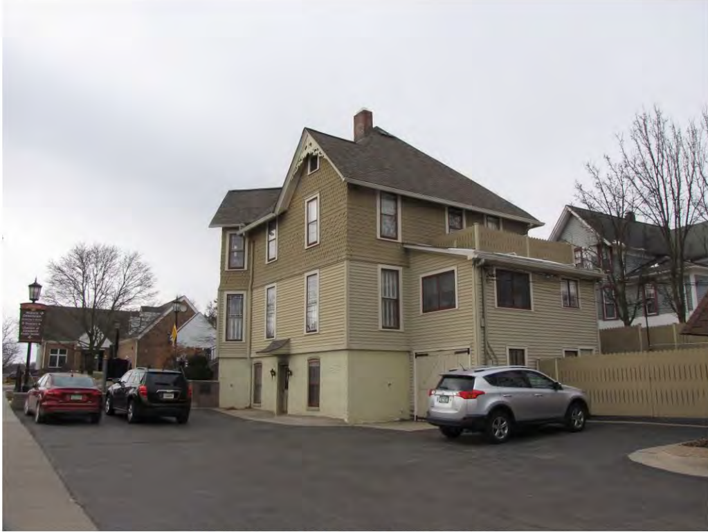
Main East 371_Looking Southwest