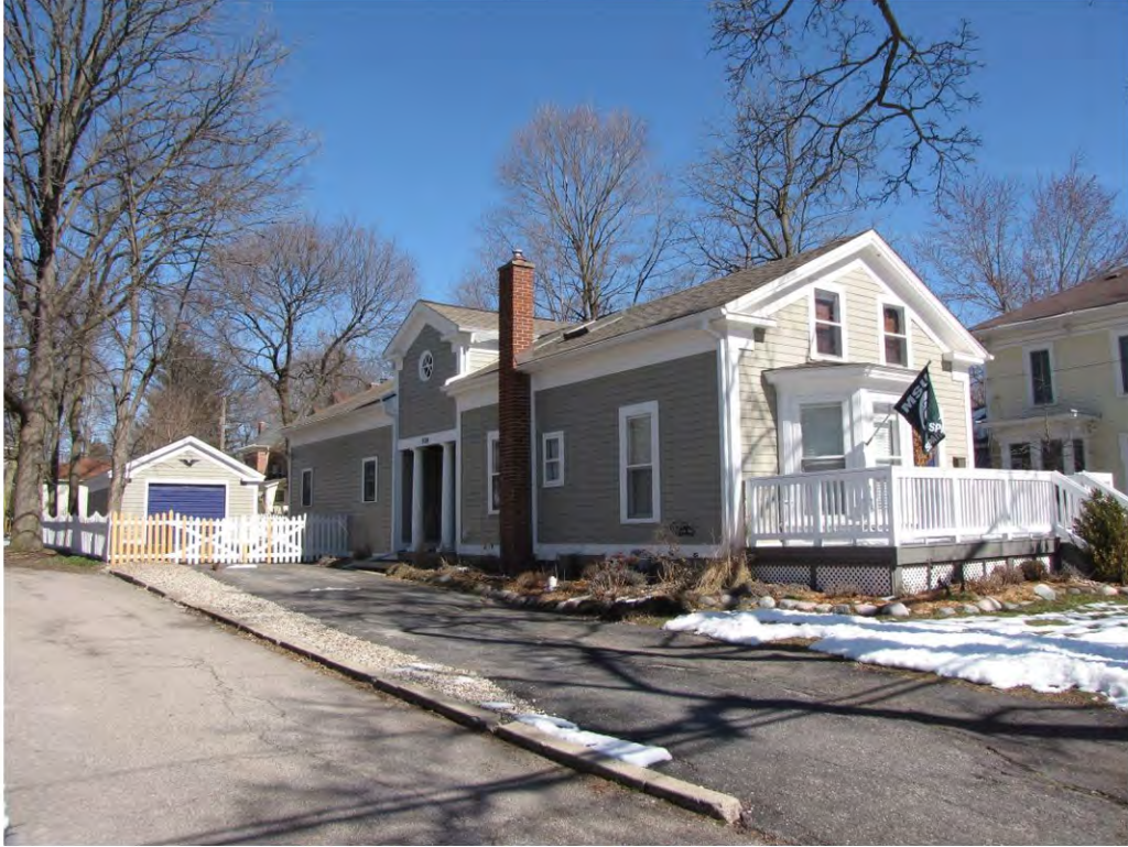
Main West 508_Looking Northeast