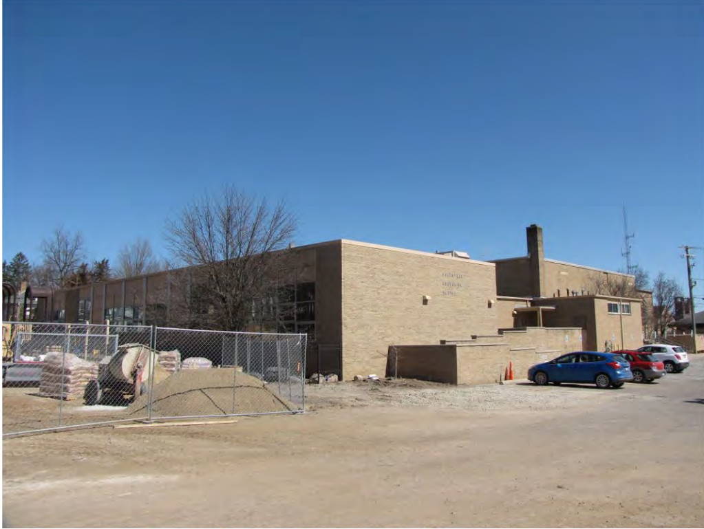
Main West 303_Looking Northeast