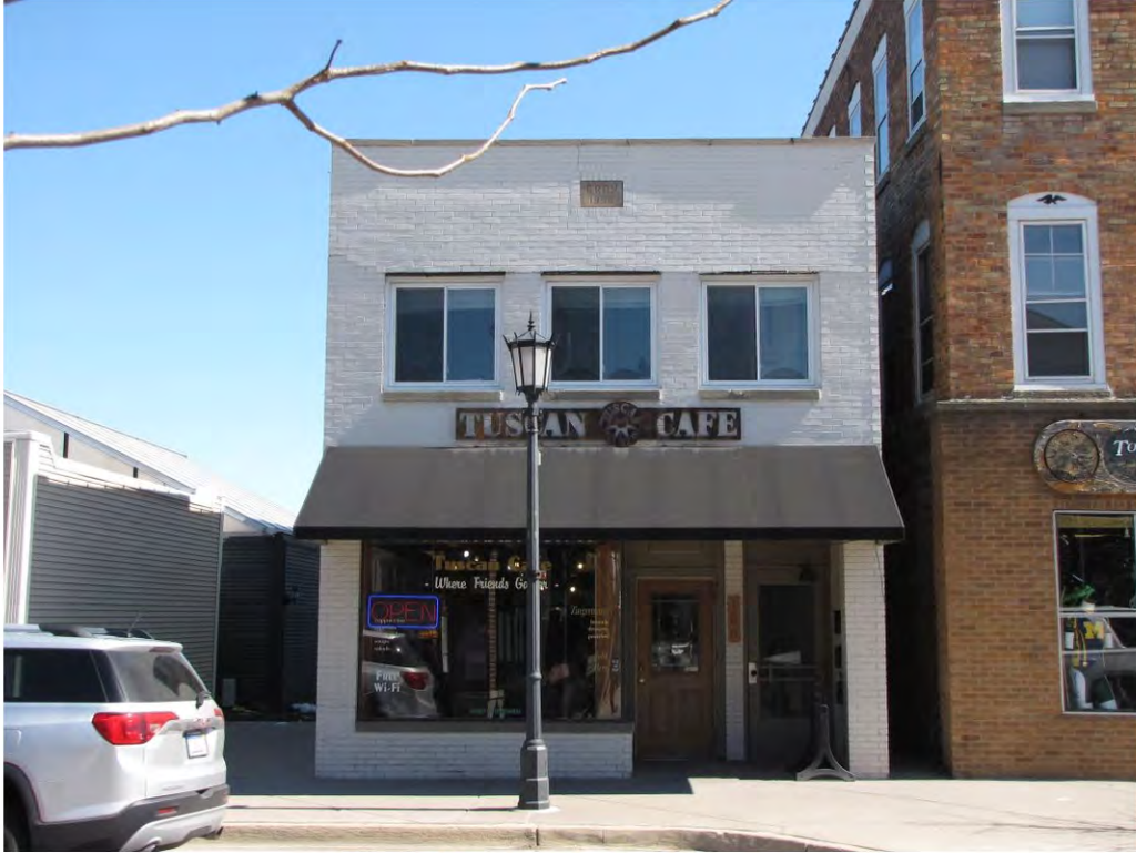
Center North 150_Looking East