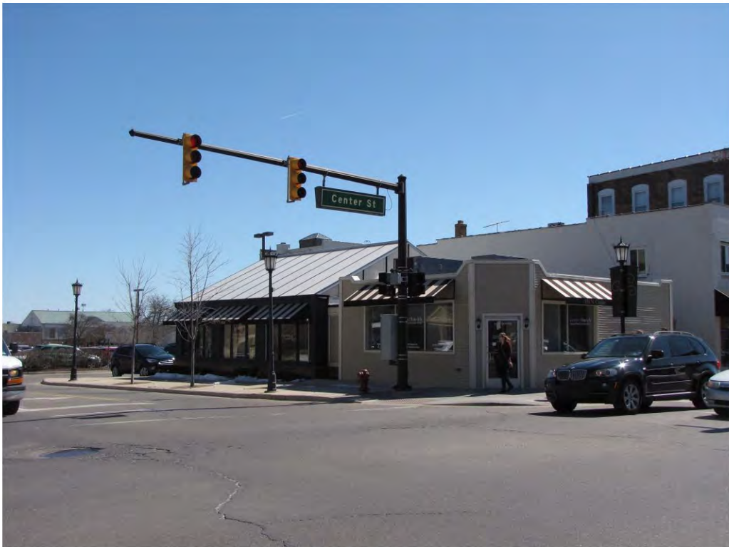
Center North 156-Looking Southeast