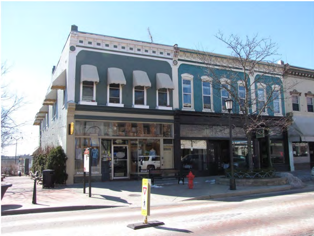
Main East 126-124_Looking Southwest