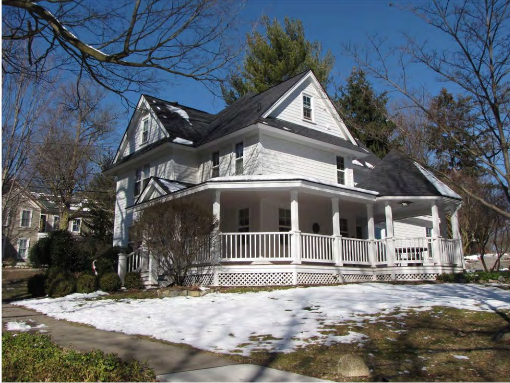
Dubuar 446_Looking Northwest