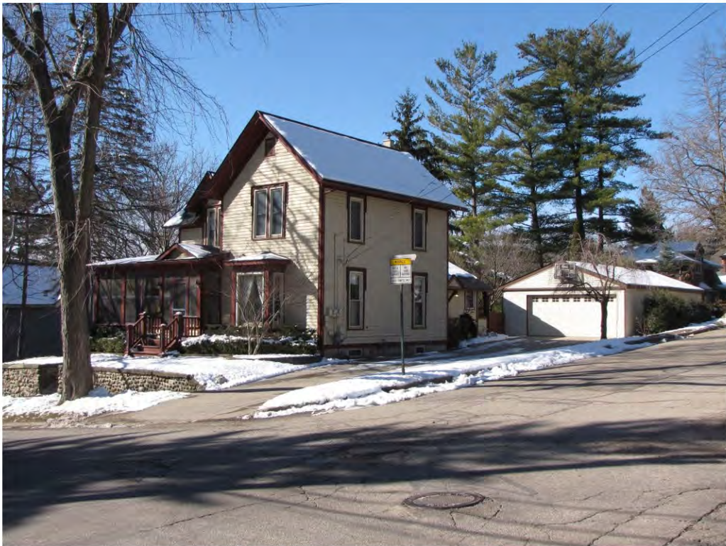
Rogers North 231, Garage_Looking West