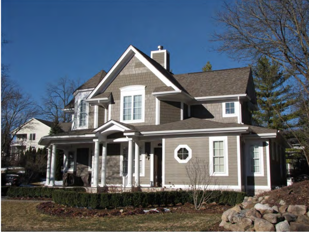
Linden 373_Looking West