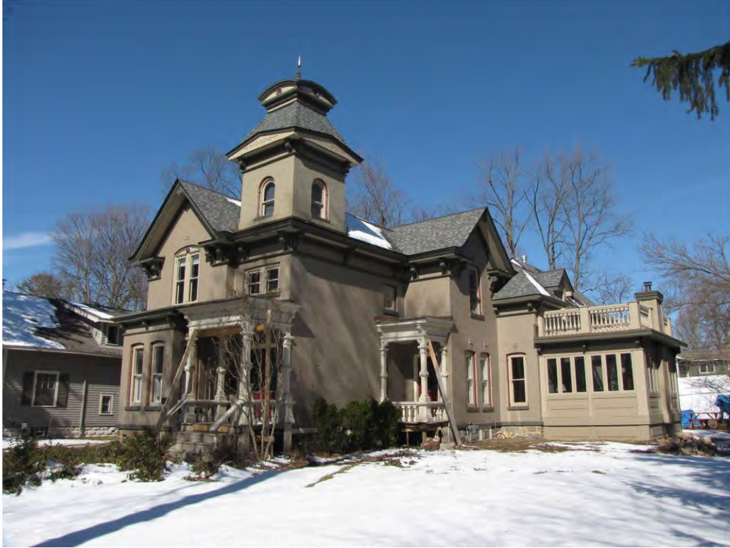
Dunlap West 512_Looking Northwest