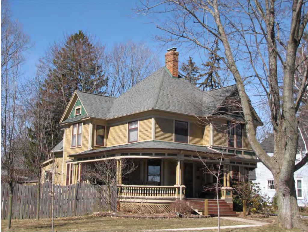
High 121_Looking Northwest