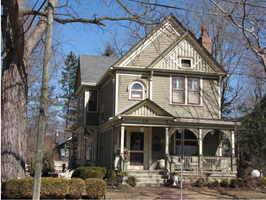
Main West 418_ Looking Northeast