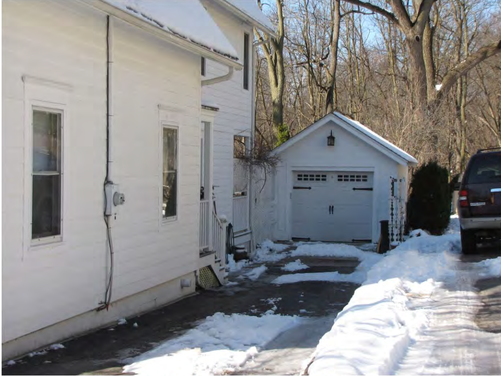
Rogers North 207, Garage_Looking West