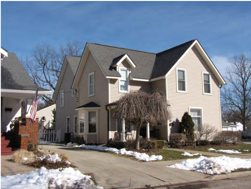
Dubuar 404_Looking Northeast