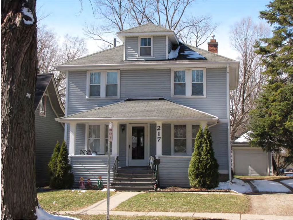
Linden 217, Garage_Looking West