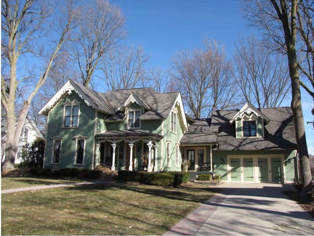
Randolph 124_Looking North