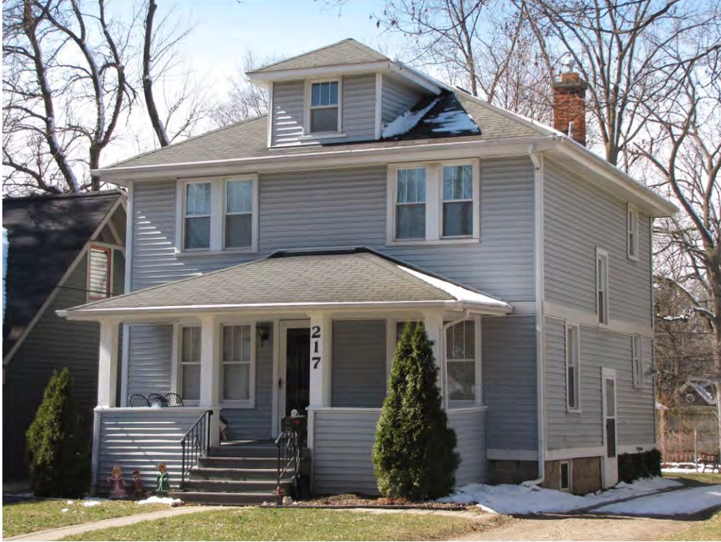
Linden 217_Looking Southwest