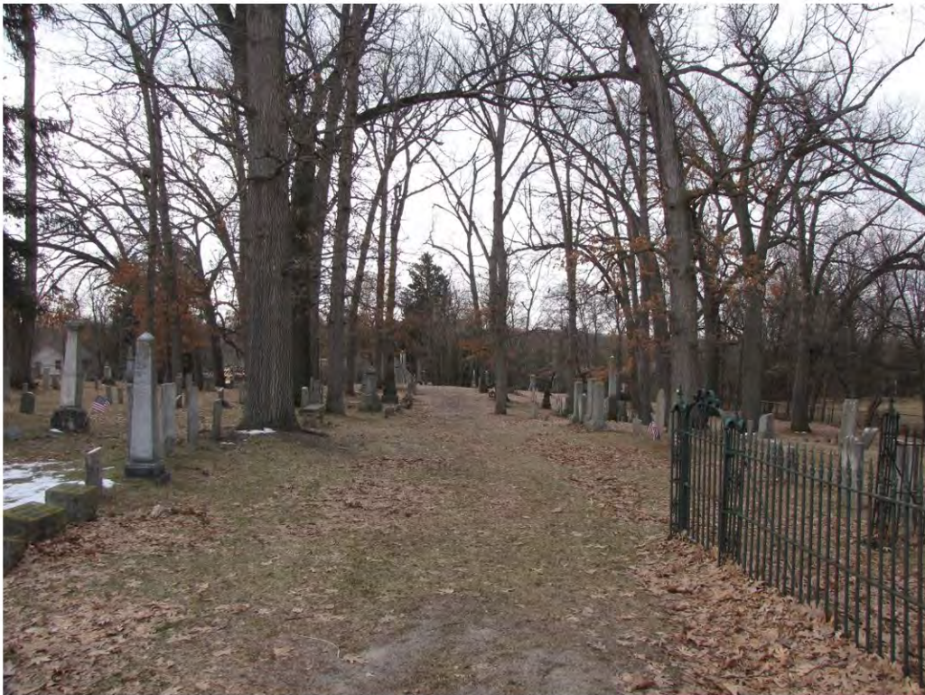
Cady West NVA 17_Looking South