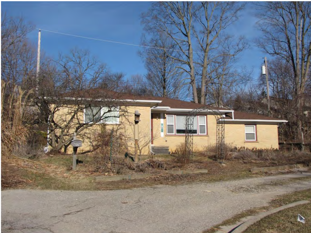
Linden Court 531_Looking Northwest