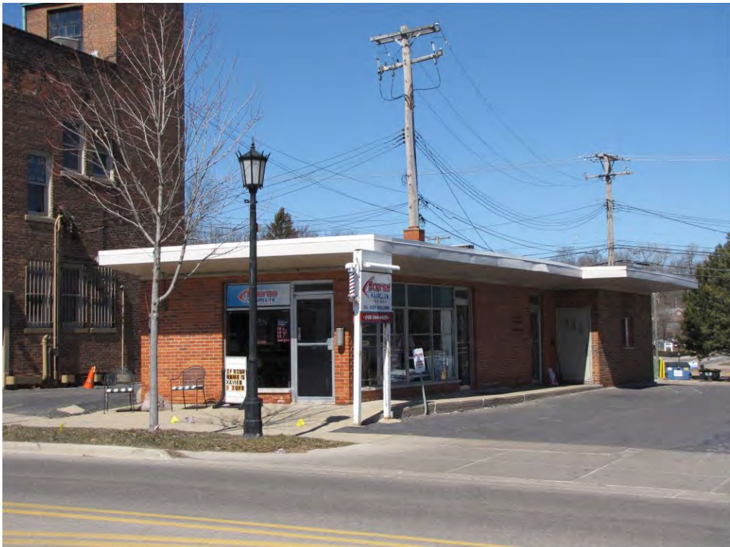
Dunlap East 111_Looking Northwest