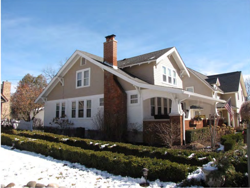
Dubuar 406_Looking Northeast