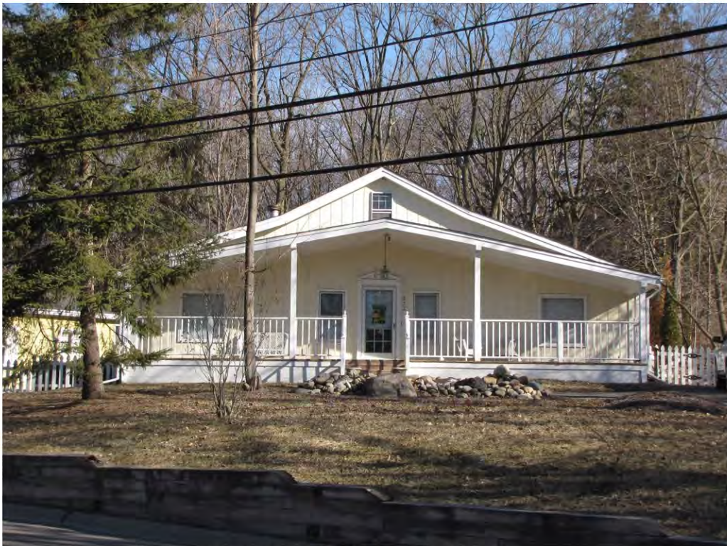
Randolph 572_Looking North