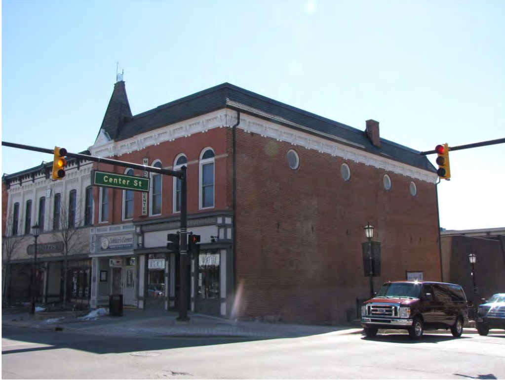
Main East 102-106 and Center South 113_Looking Southeast