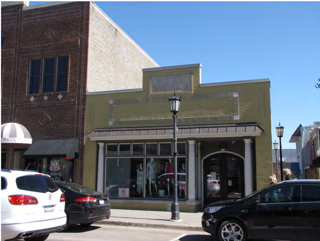
Center North 120_Looking East