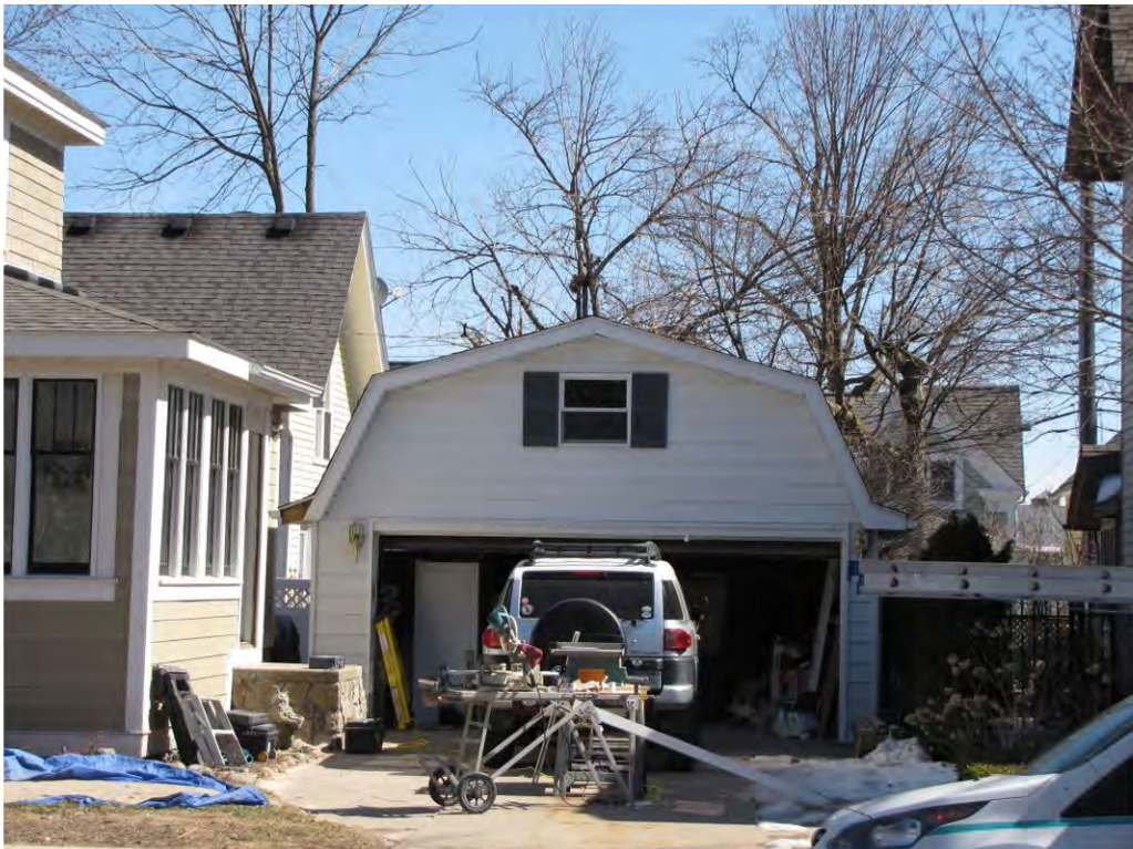
Dunlap West 217, Garage_Looking East