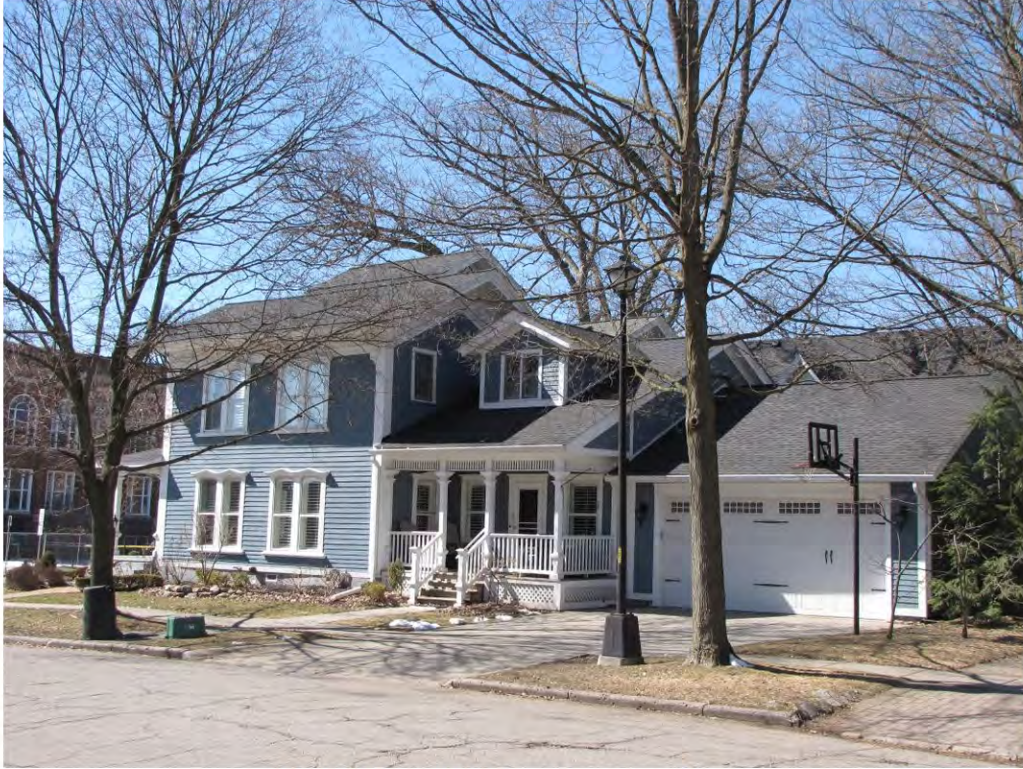
Main West 404_ Looking Southwest