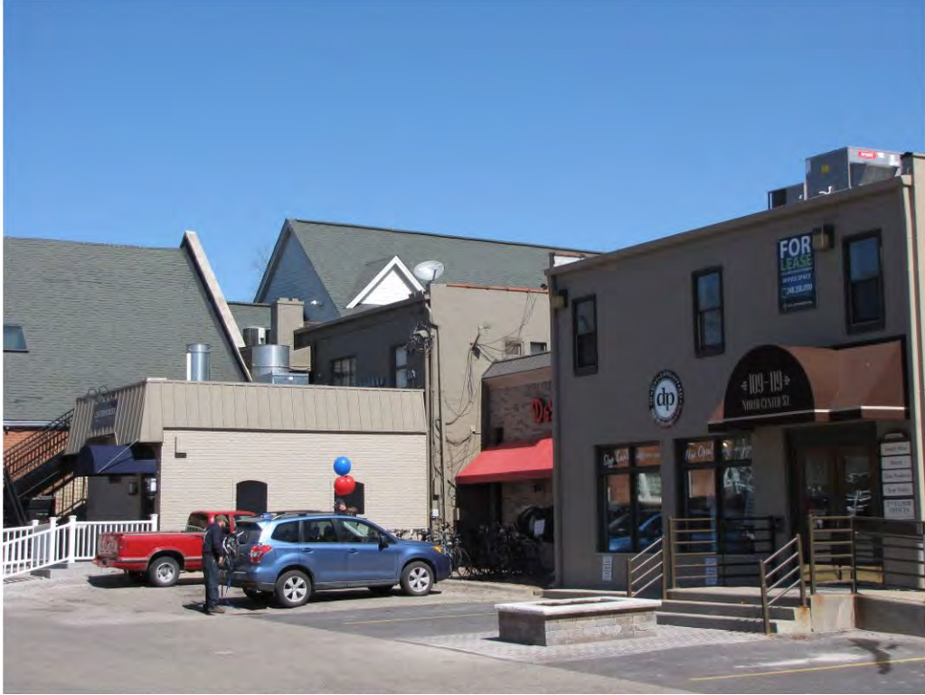
Center North 135-137_Looking Northeast