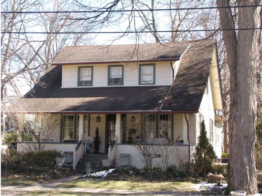
Linden 118_Looking East