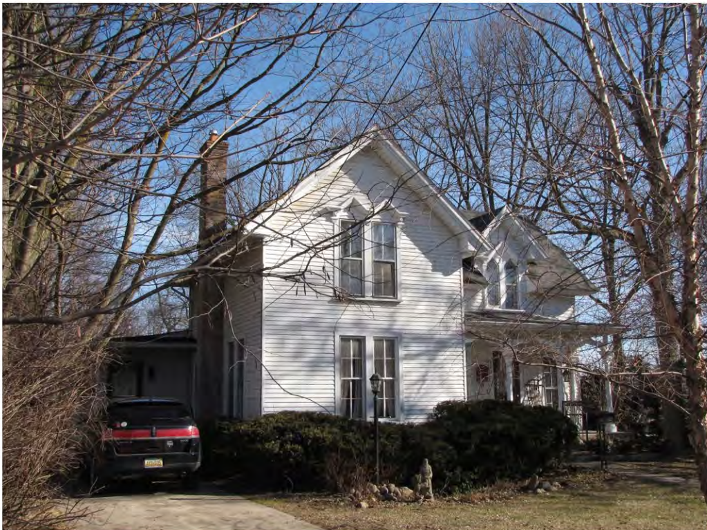
Randolph 132_ Looking Northeast