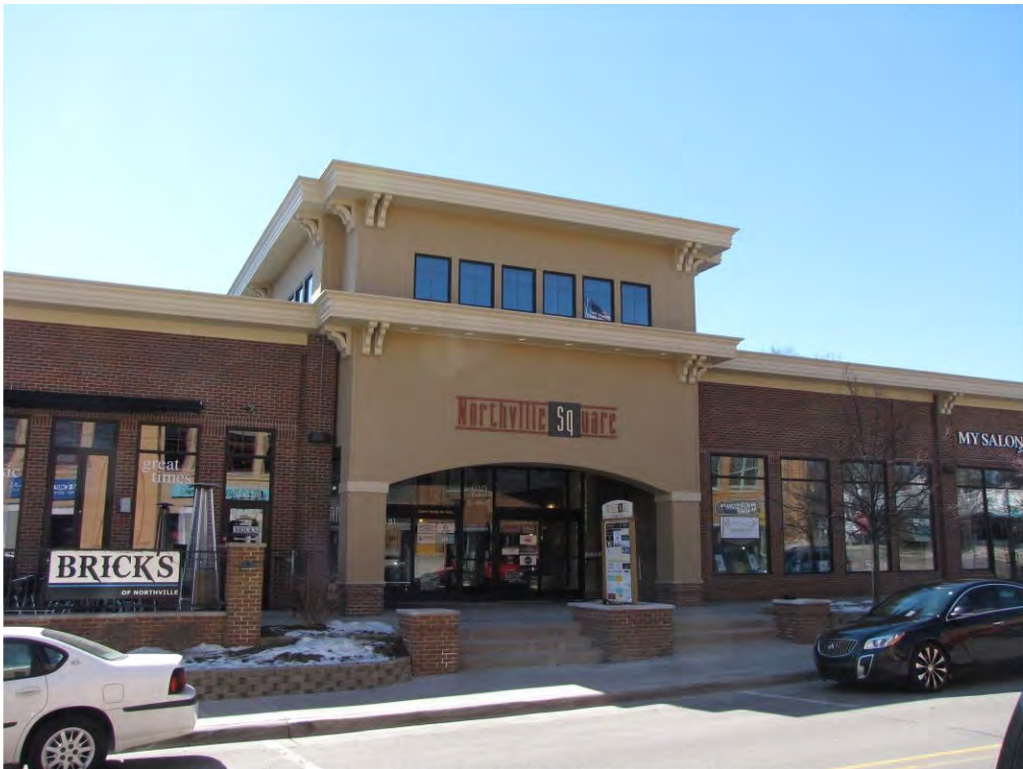
Main West 133_Looking South