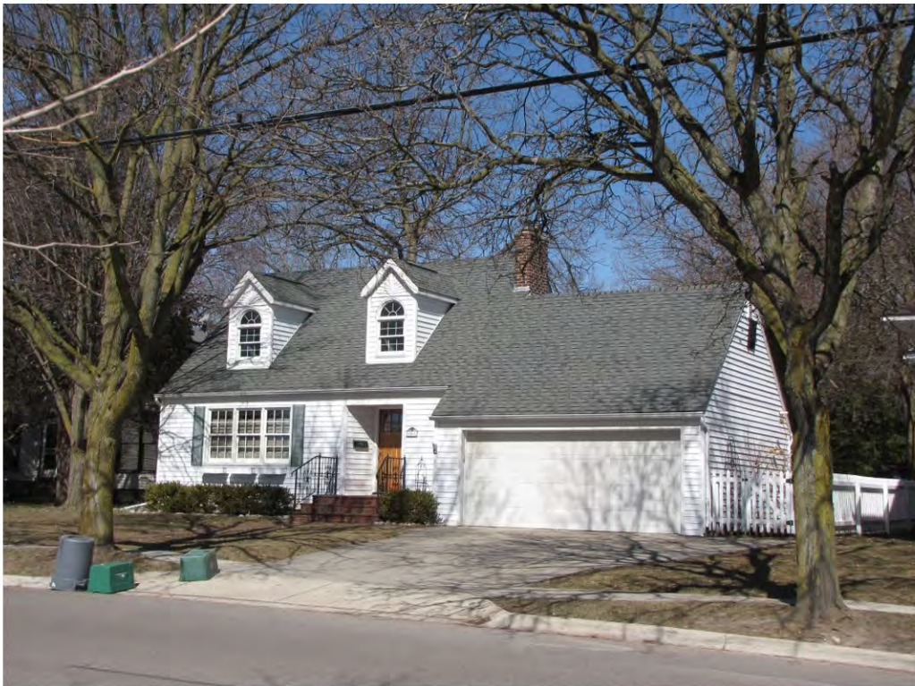
Main West 306_Looking Northwest