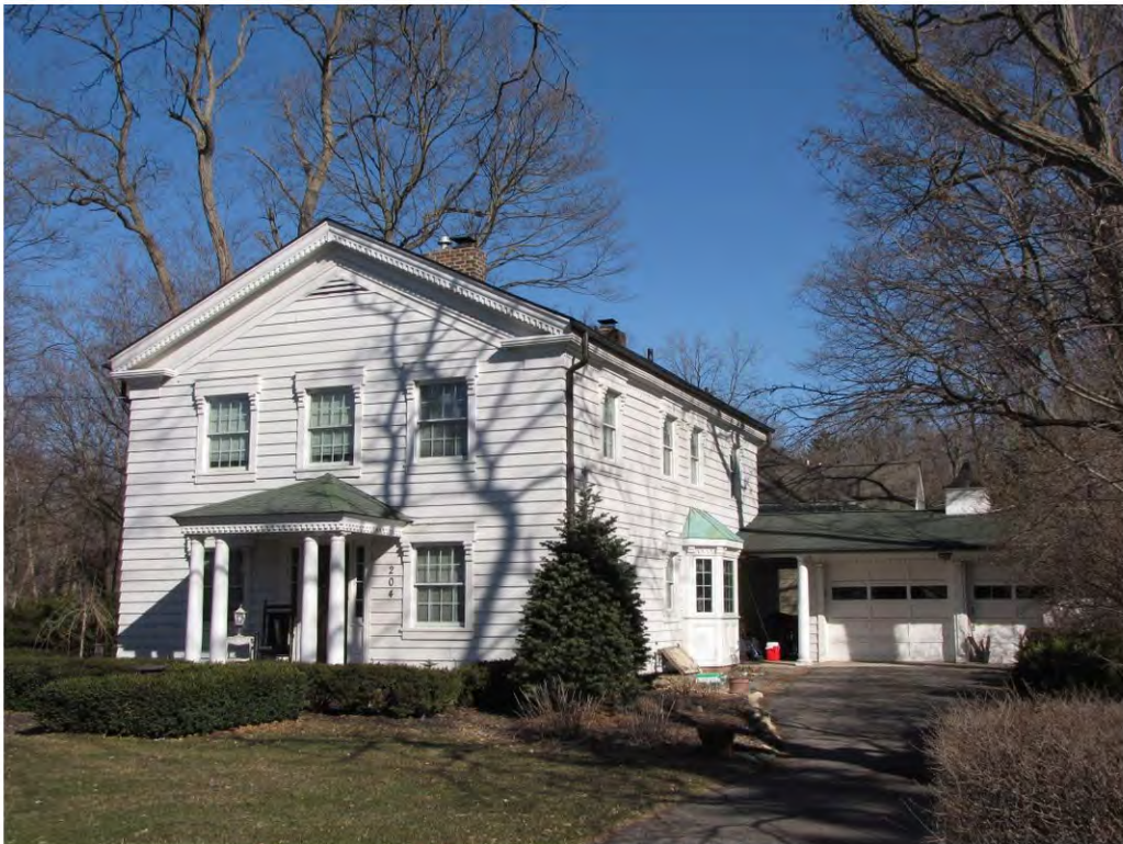
Randolph 204_Looking Northwest