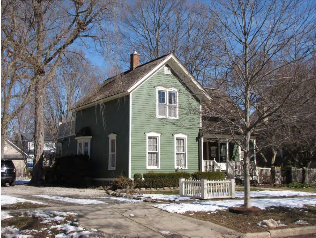
Dunlap West 534_Looking Northeast