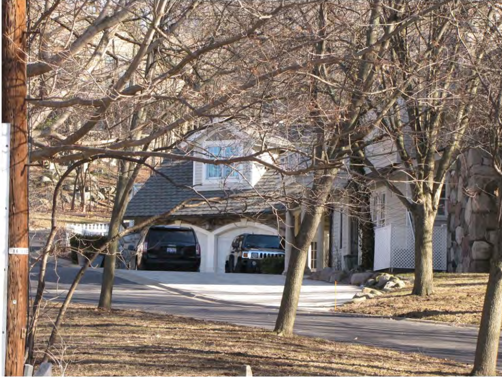
Randolph 562, Garage_Looking North