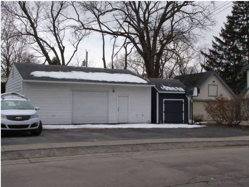
Rogers South 102, Garage_Looking Southwest