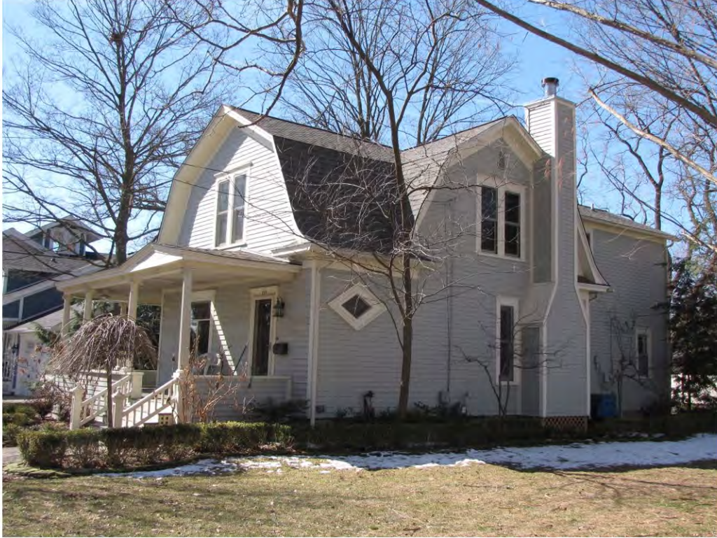
West 113_Looking Southwest