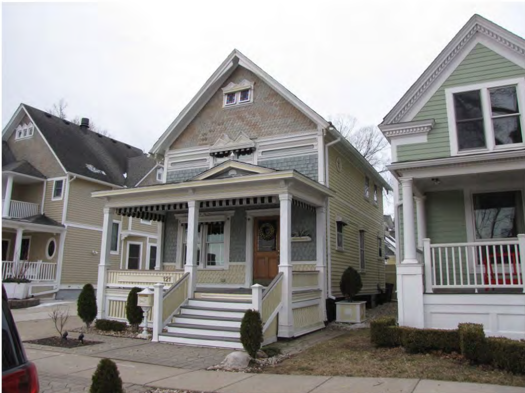
Wing North 121_Looking Southwest