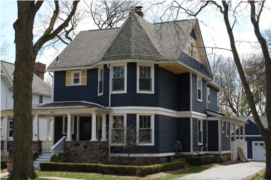
Dunlap West 543_Looking Southeast