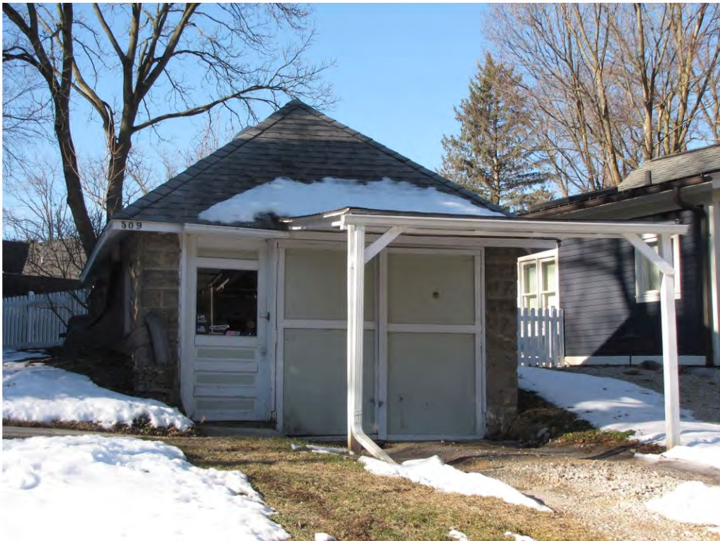
Randolph 509, Garage_Looking South