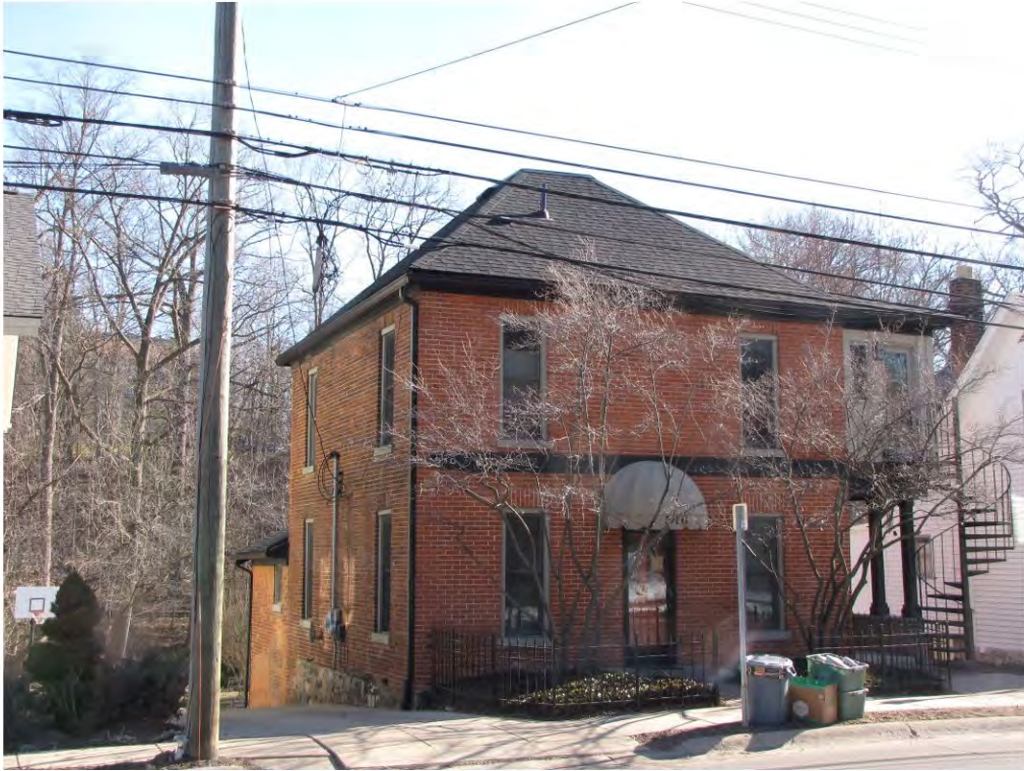
Randolph 510_Looking Northeast