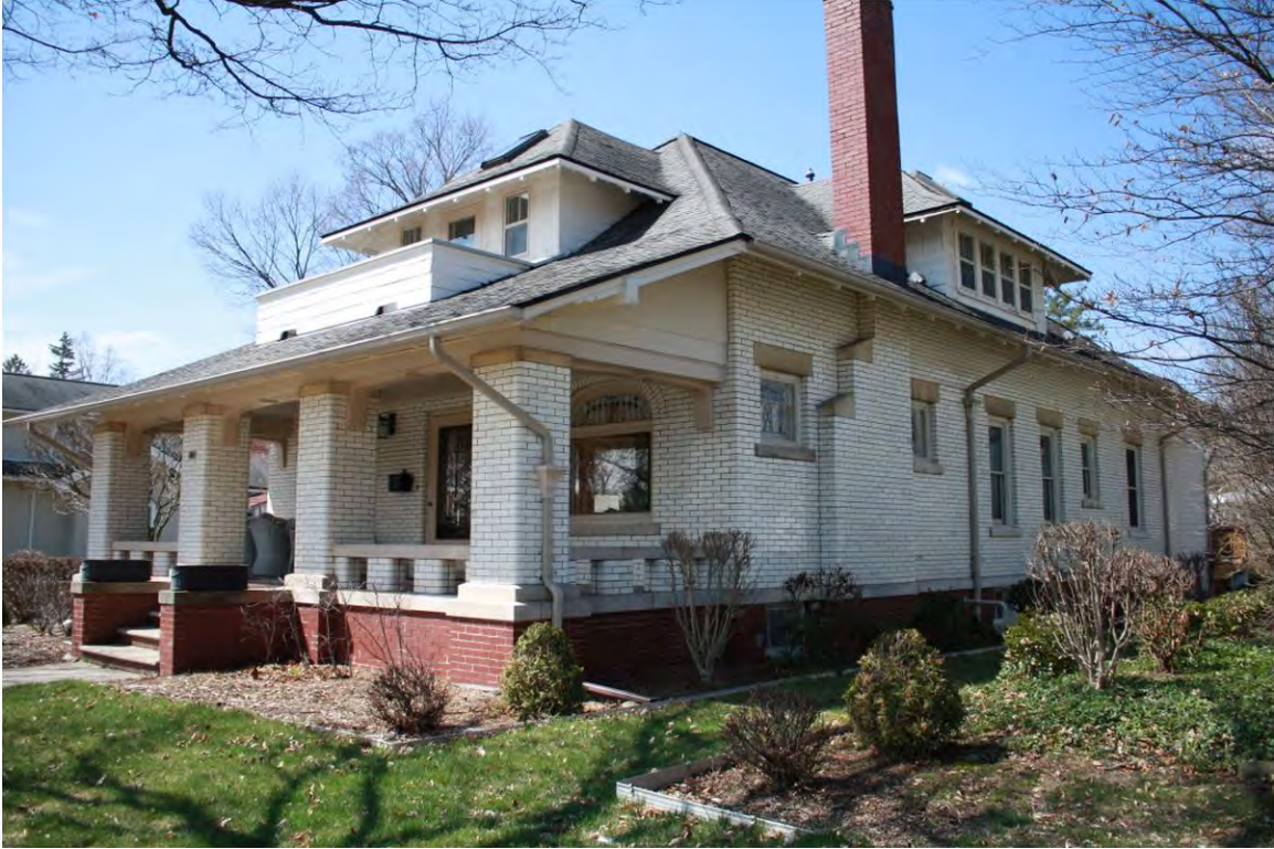
High 223_Looking Southwest