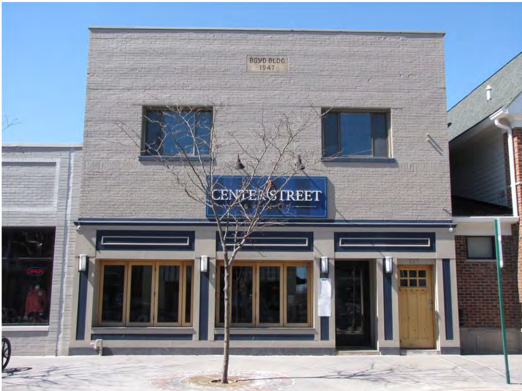
Center North 135-137_Looking West