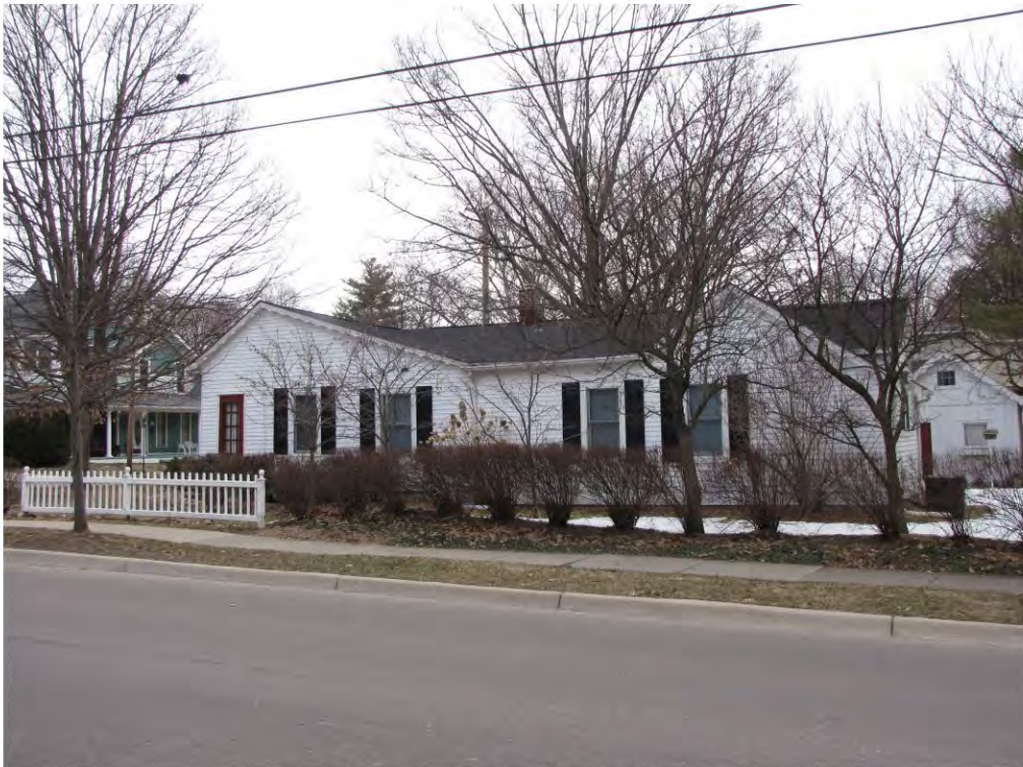
Cady West 521_Looking Northwest