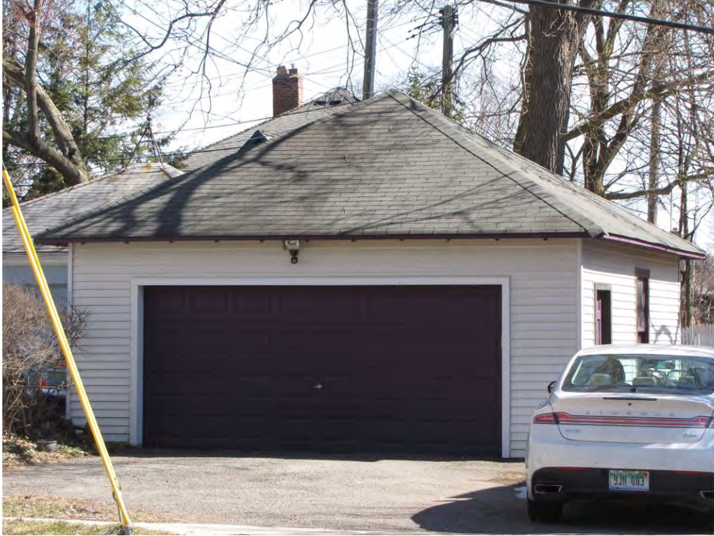
Main West 312, Garage_Looking East