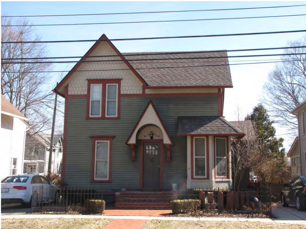
West 222_Looking East