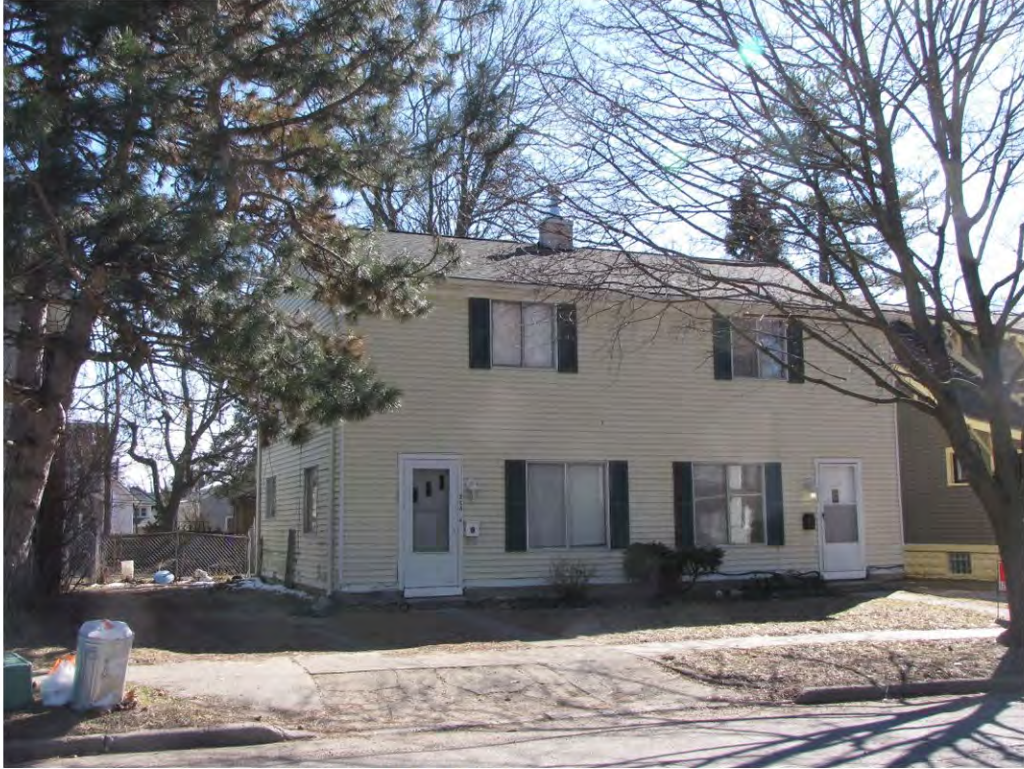
Linden 222-224_ Looking Southeast