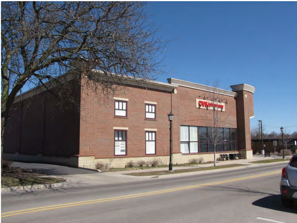
Dunlap East 133_ Looking Northeast