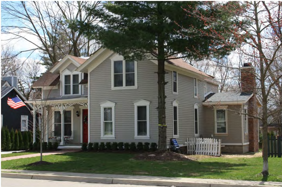
Main West 531_ Looking southeast