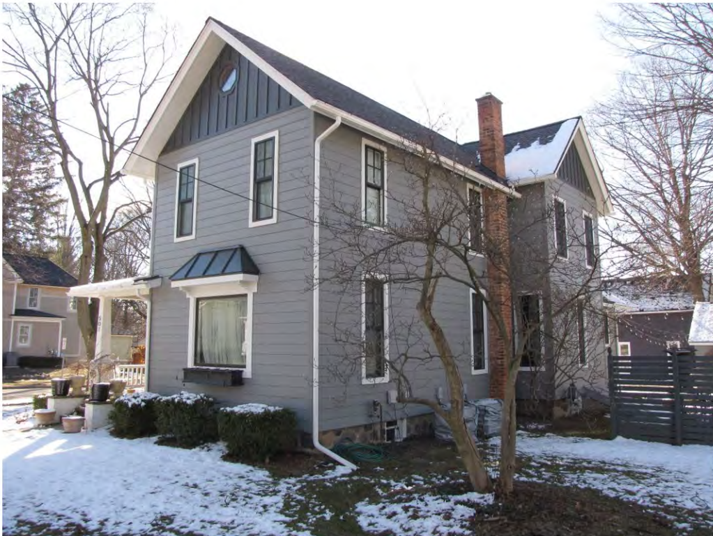
Cady West 501_Looking Southeast