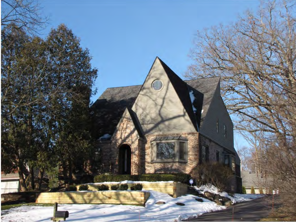
Linden 265_Looking Southwest