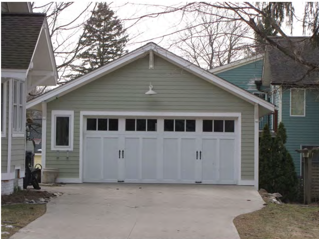
Cady West 487, Garage_Looking South