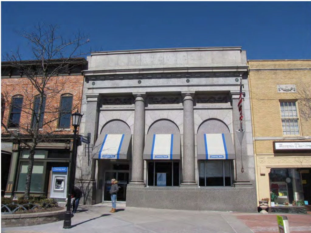
Main East 129_Looking North