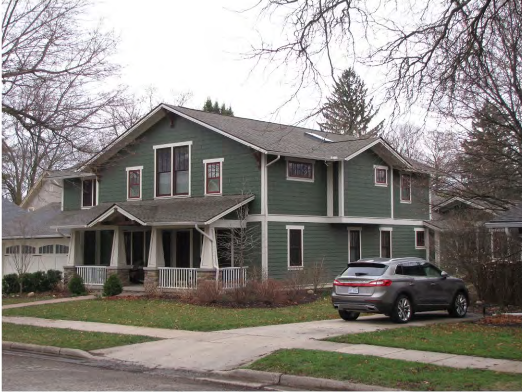
Dubuar 417_Looking Southeast