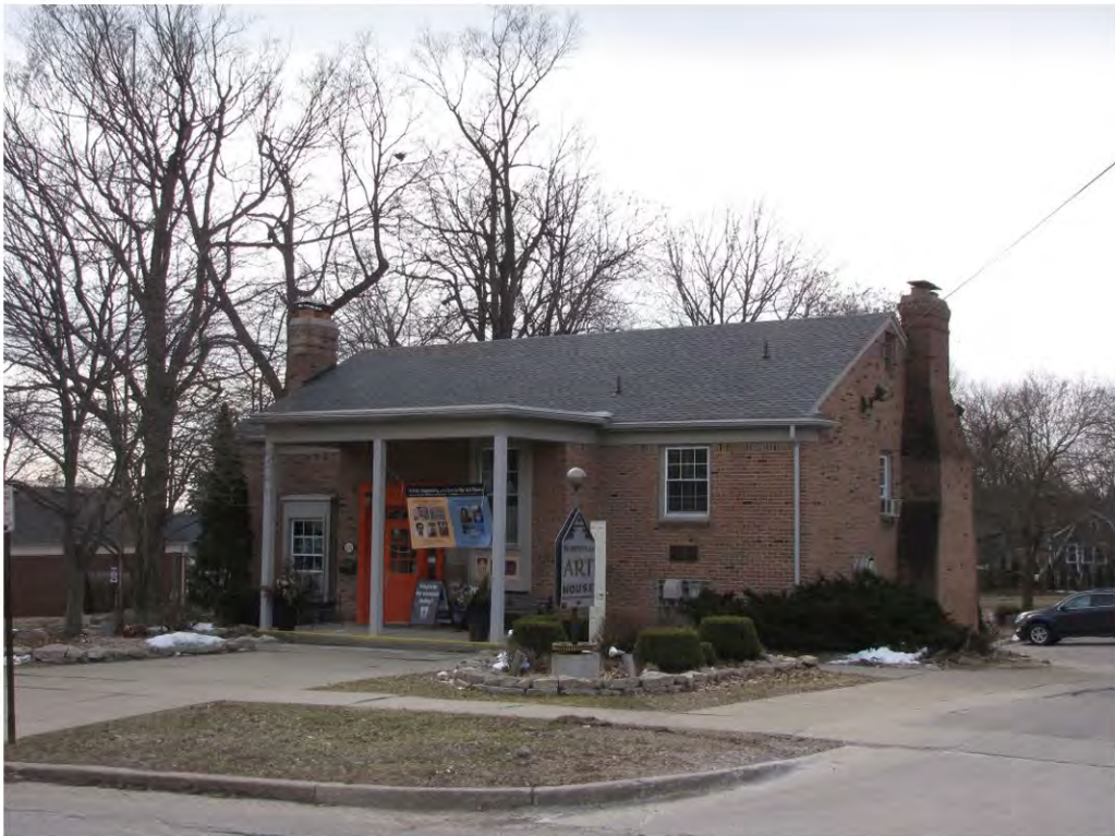
Cady West 215_Looking Southeast