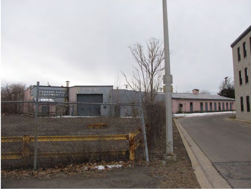
Cady East 456_Looking Southwest