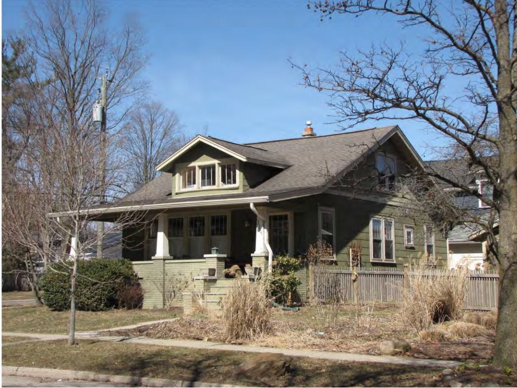
Dunlap West 314_Looking Northwest