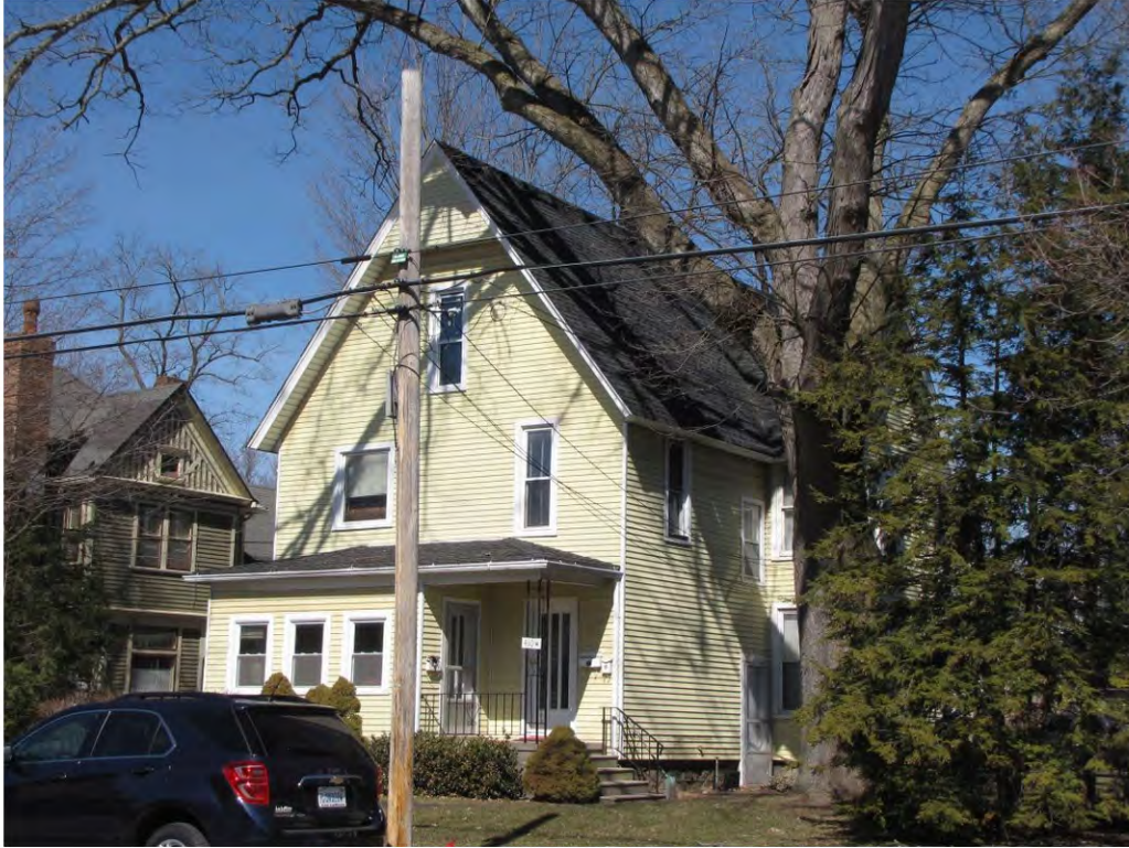
Main West 410_ Looking Northwest