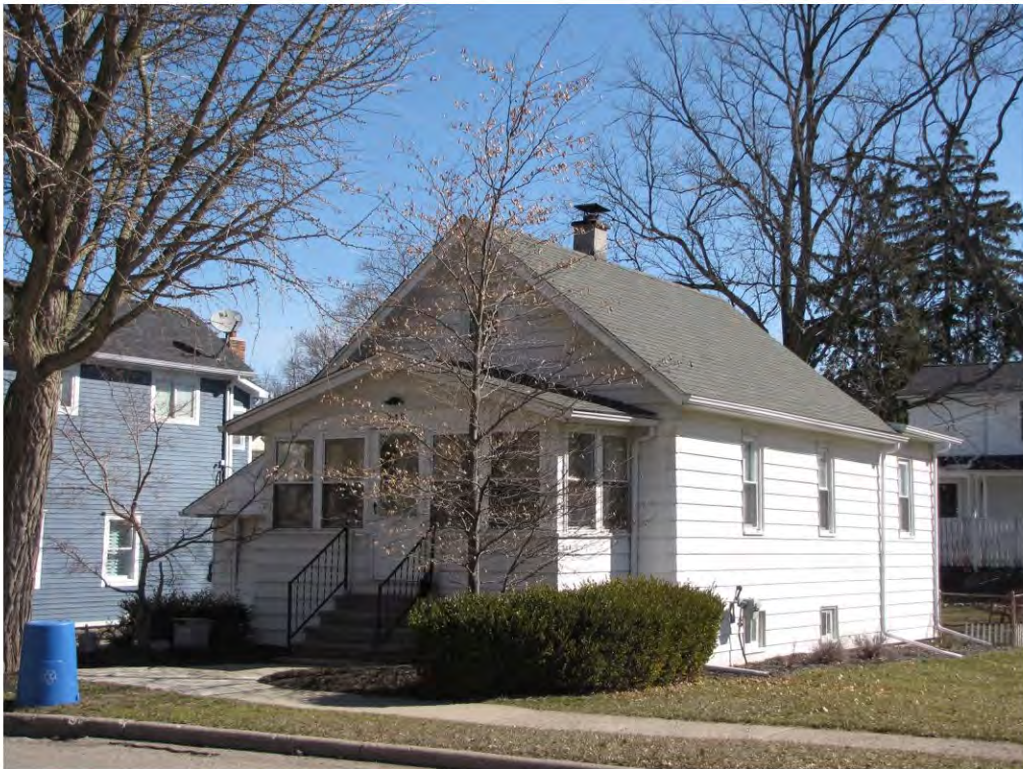
Linden 248_ Looking Northeast