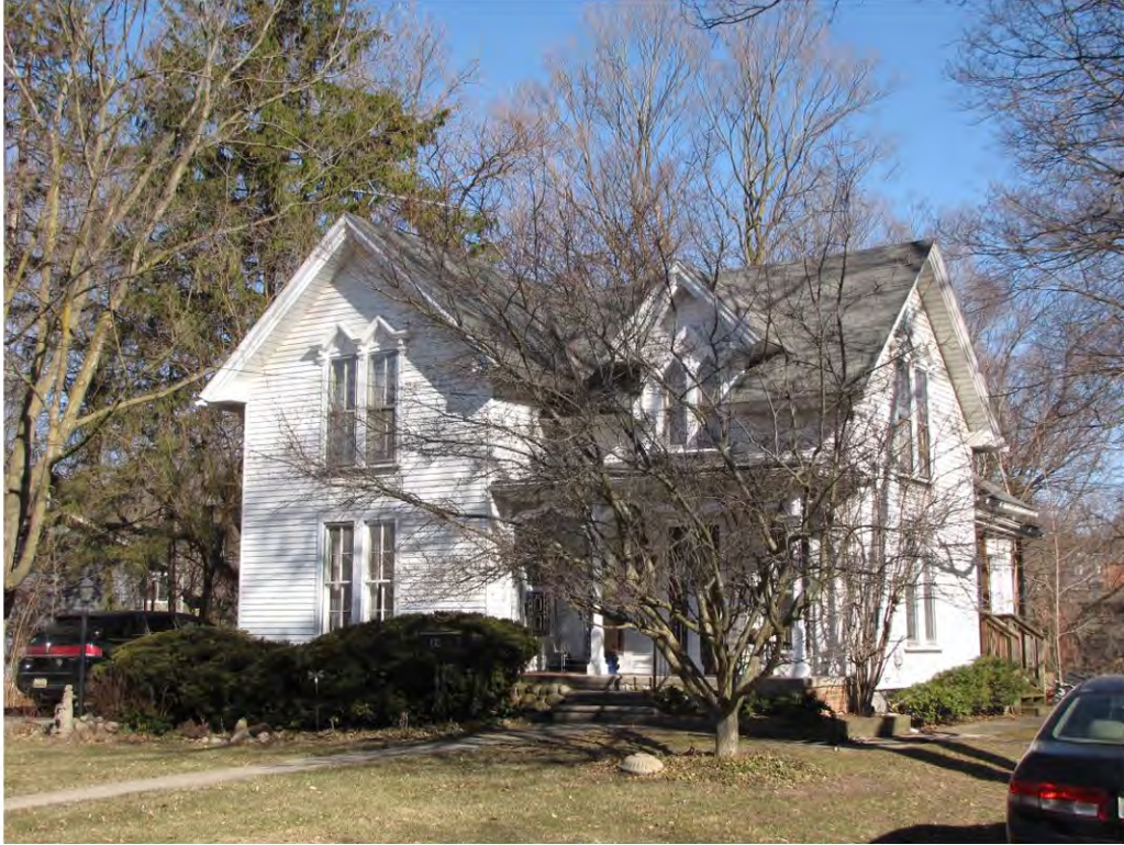
Randolph 132_looking Northwest