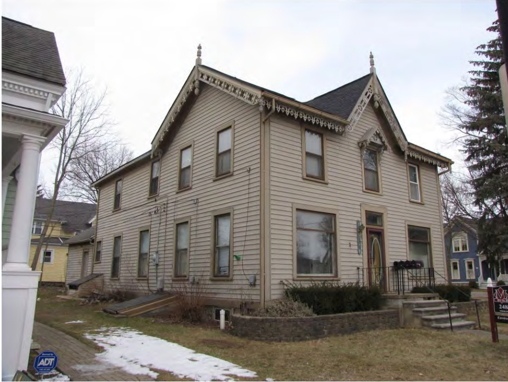
Wing North 129_Looking Northwest