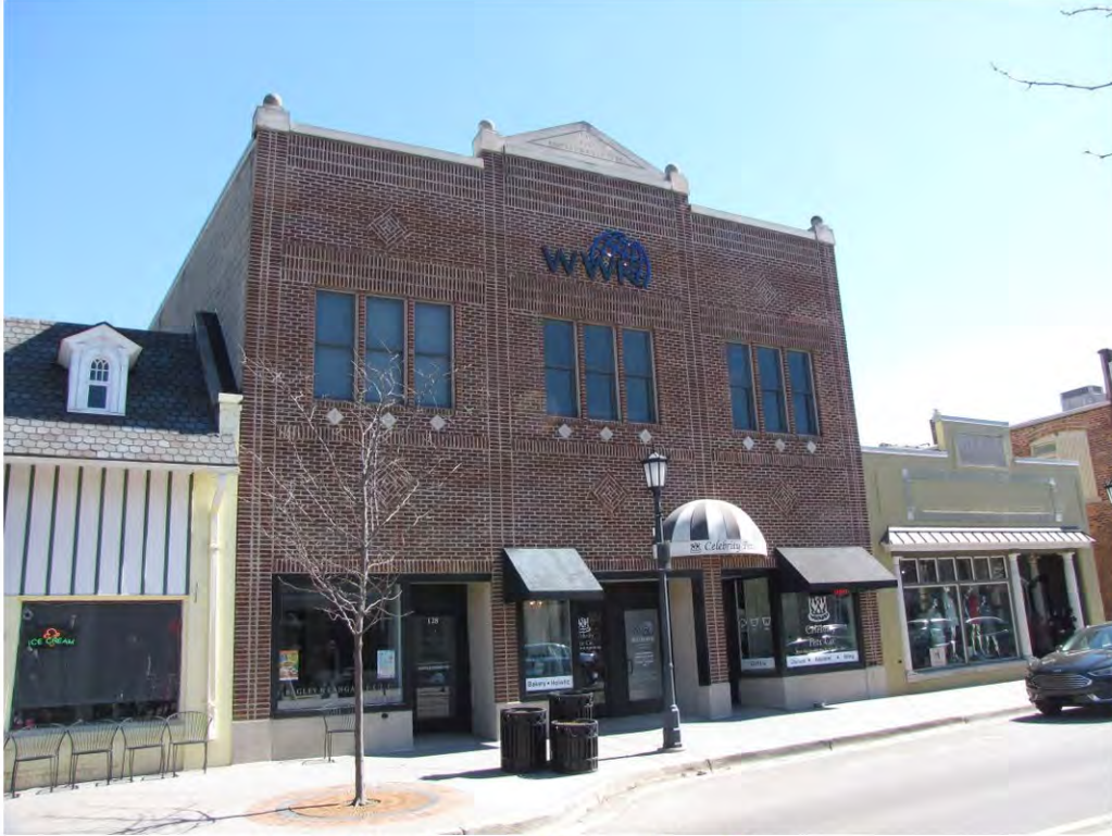
Center North 124-128_Looking Northeast