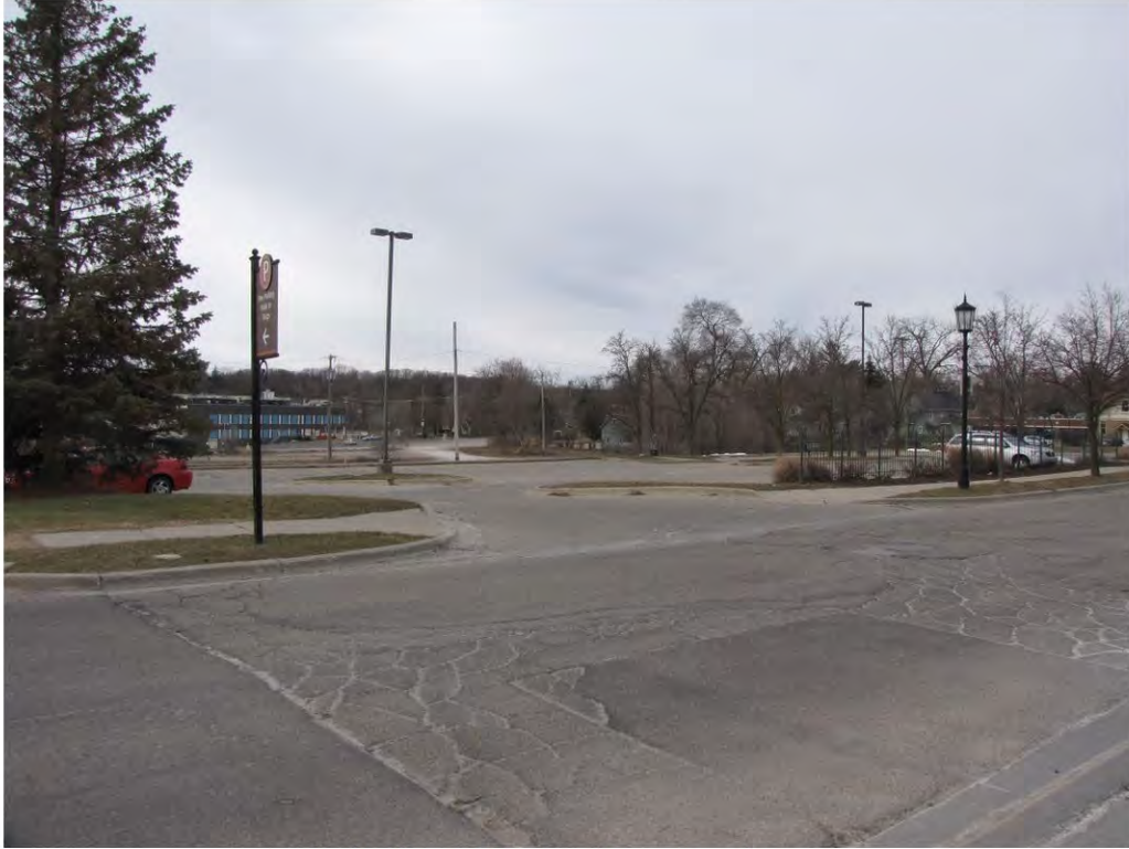
Cady East 118_Looking Southwest