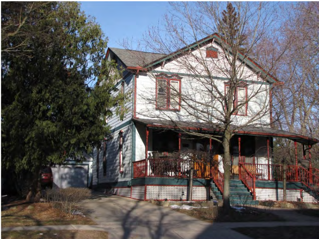
Rogers North 365_Looking Northwest