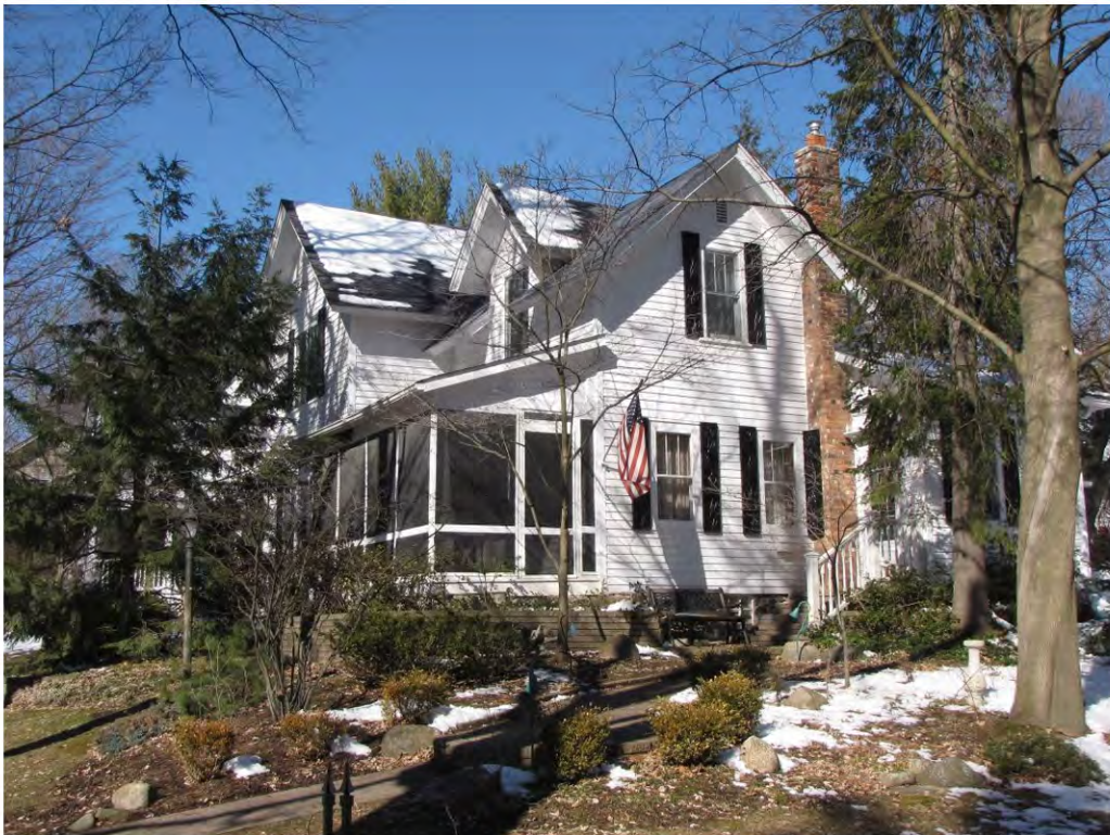
Dubuar 440_Looking Northwest