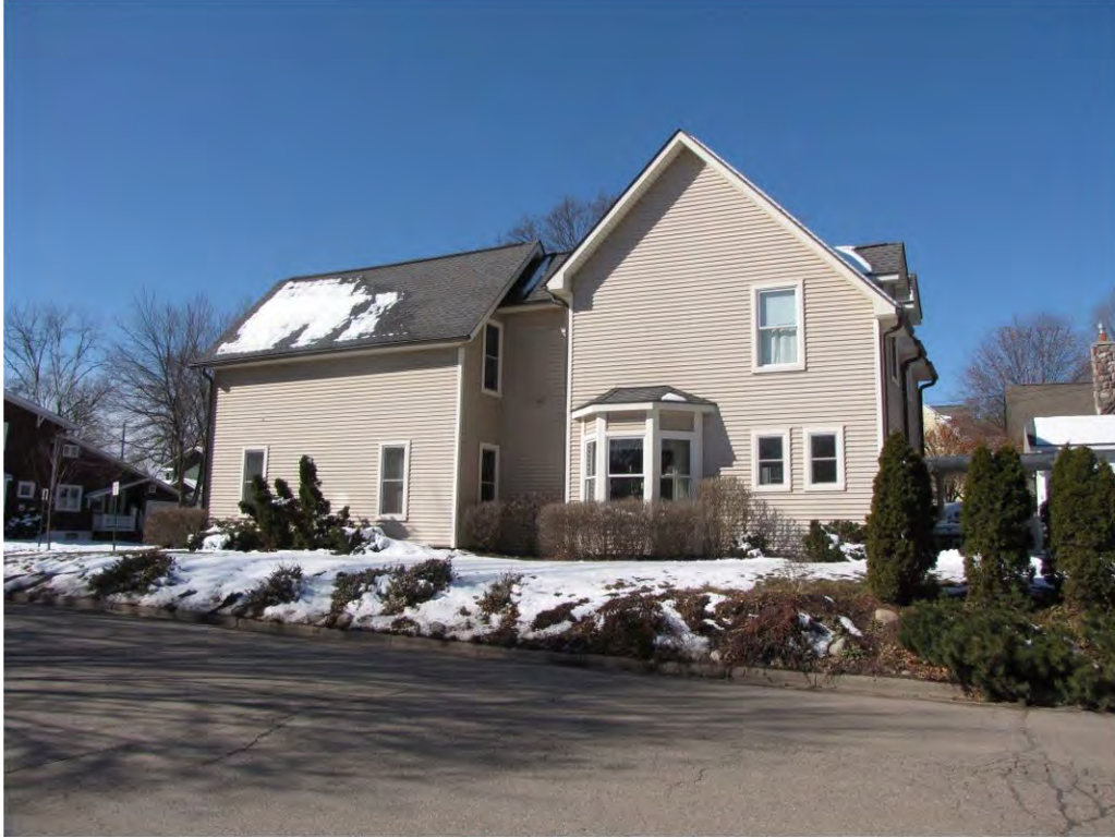
Dubuar 404_Looking West