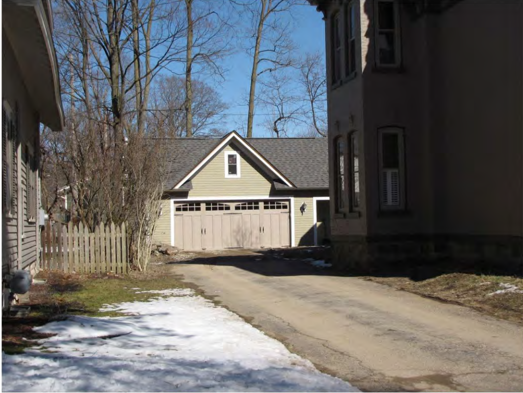
Dunlap West 512, Garage_Looking North