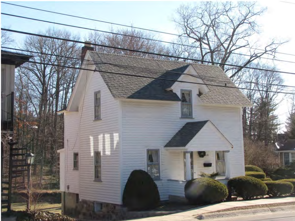
Randolph 504_Looking Northeast