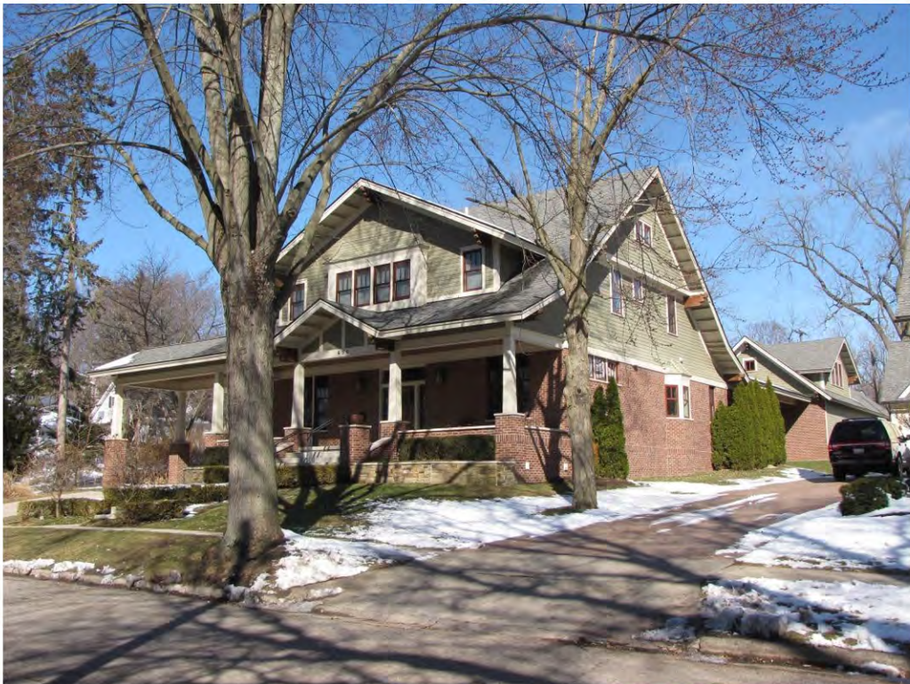
Dubuar 430_Looking Northwest