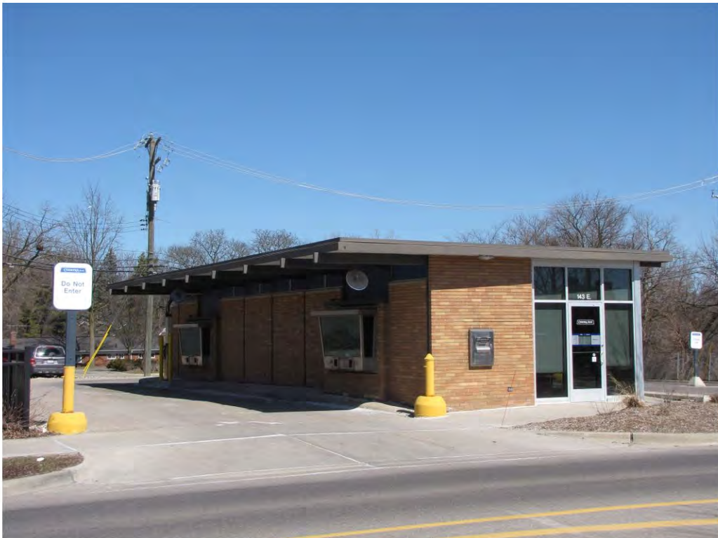
Dunlap East 143_Looking Northeast