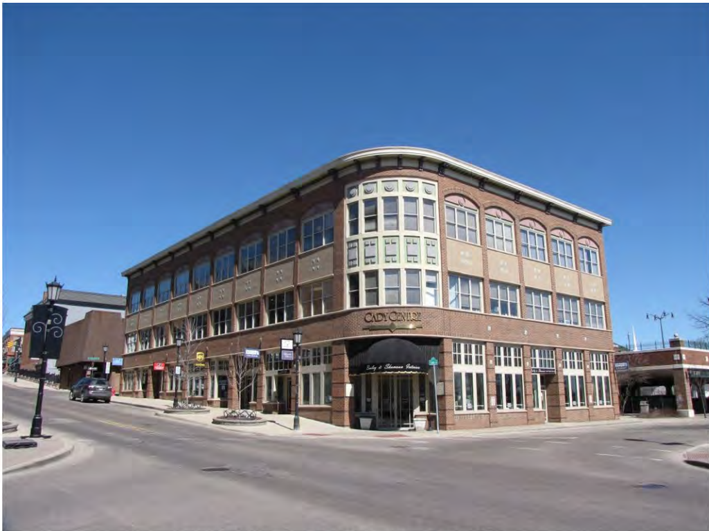
CadyCentre 125_Looking Northeast