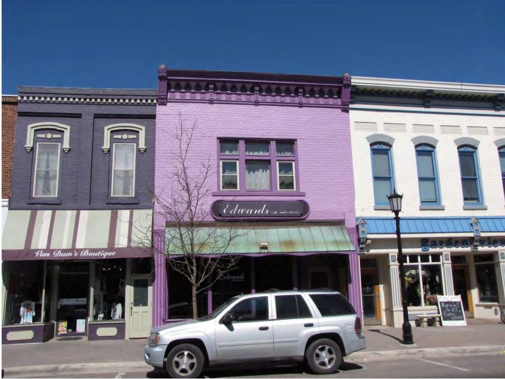
Main East 115_Looking North