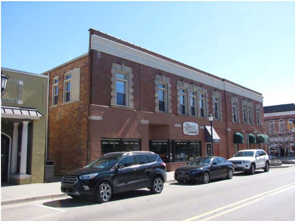
Main East 101 and Center North 108-110_Looking Southeast