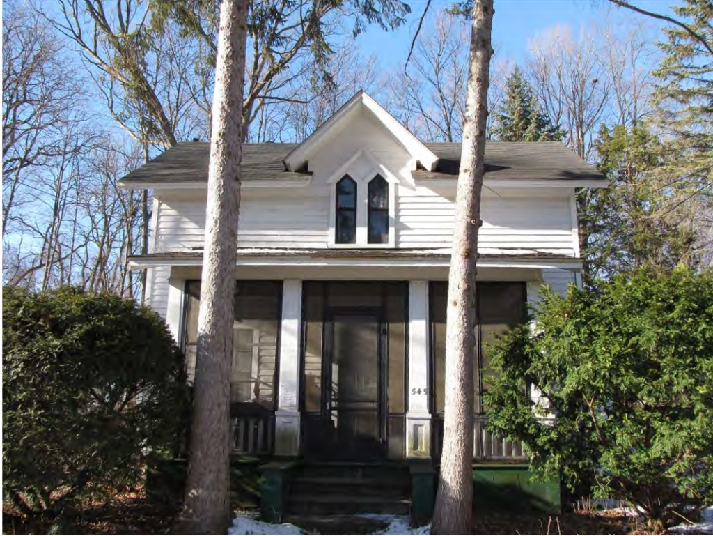
Randolph 545_Looking South