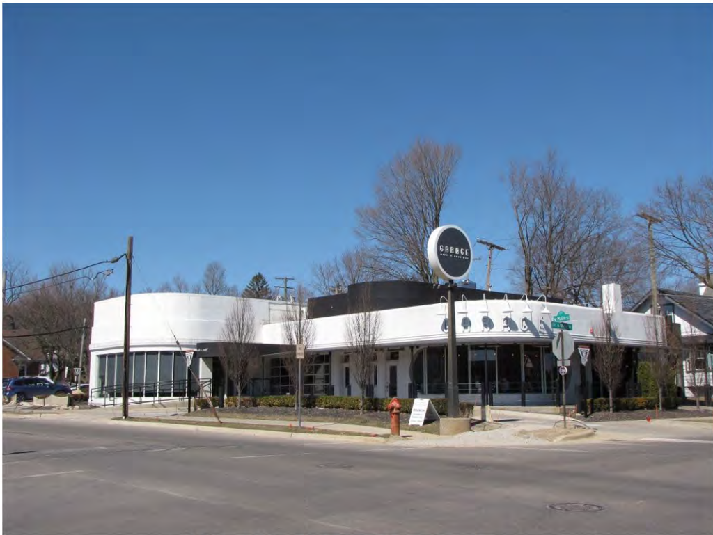
Main West 202_Looking Northwest