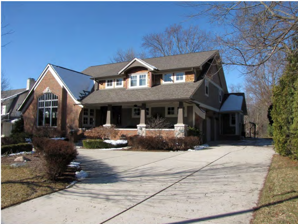
Rogers South 208_ Looking Southwest