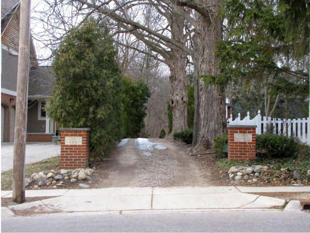
Rogers South 146_ Looking West