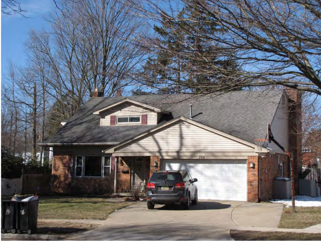
Wing North 209_Looking Southwest