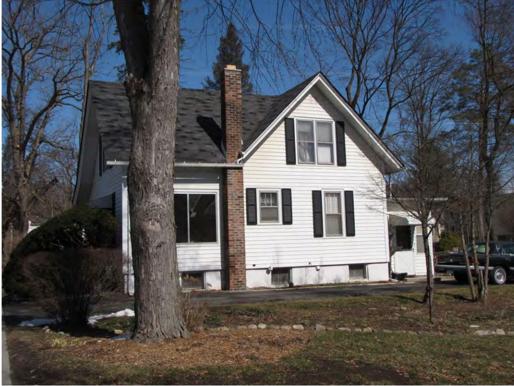
Rogers South 117_Looking Northeast