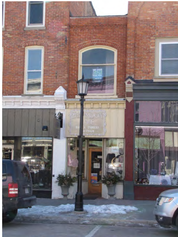
Main East 116_Looking South