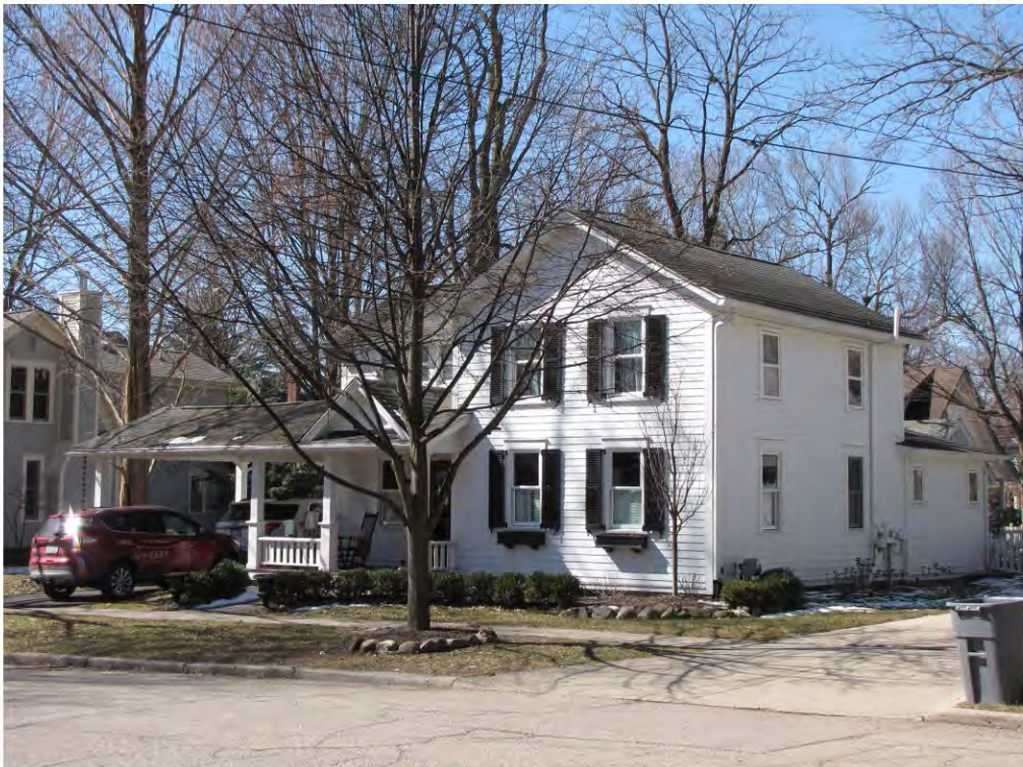
West 121_Looking Southwest