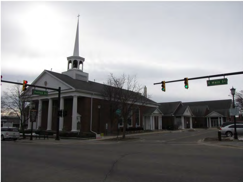
Main East 200_Looking Southeast