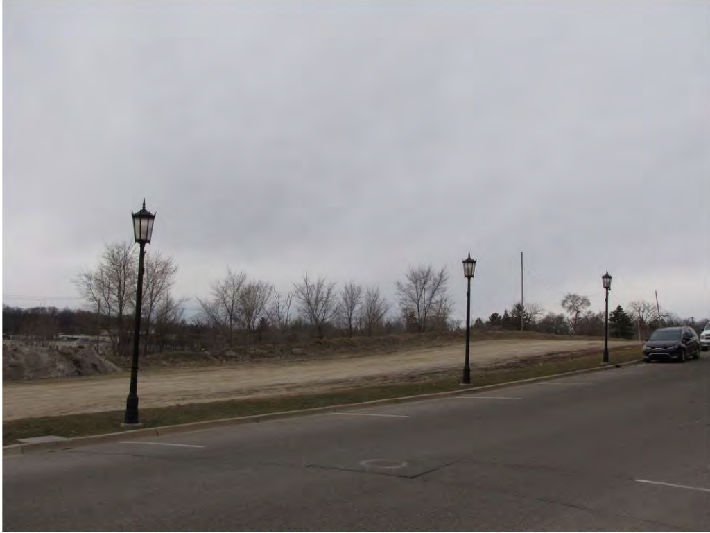
Cady East NVA 2 and 3_Looking Southeast