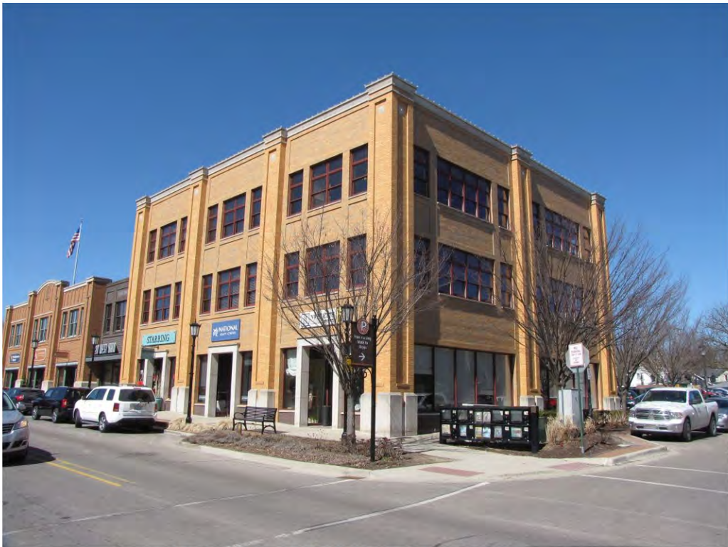
Main West 114-126_Looking Northwest