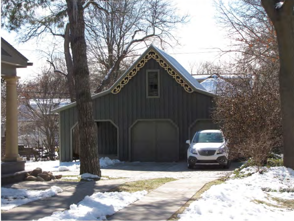
Dunlap West 527, Garage_Looking South