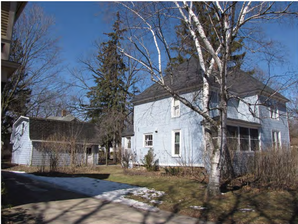
Dunlap West 305_Looking Northwest