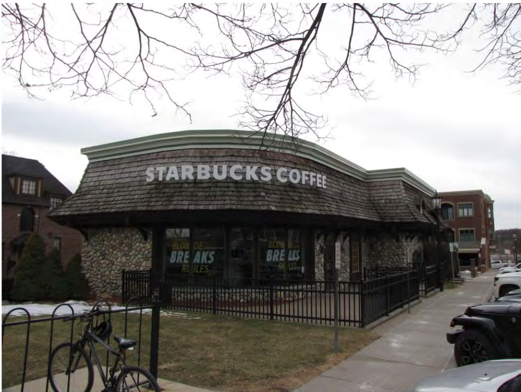
Main East 302_Looking South