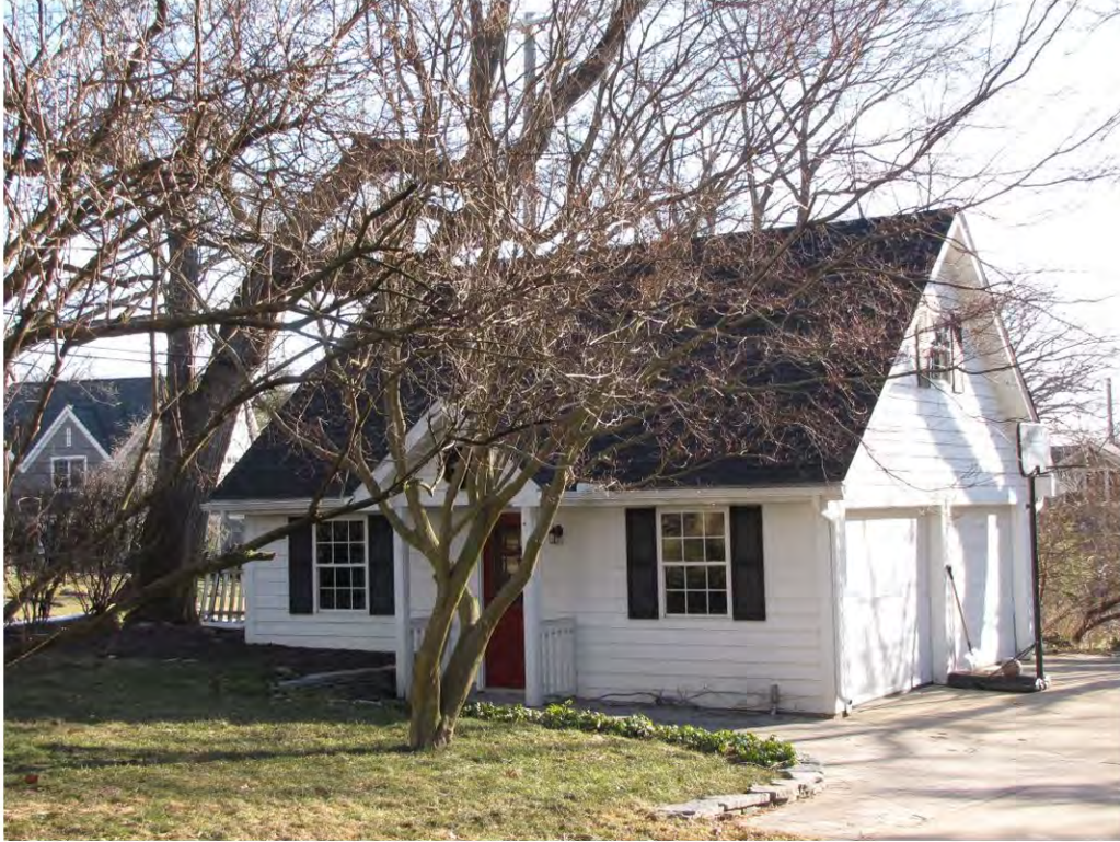
Dubuar 446, Garage_Looking East