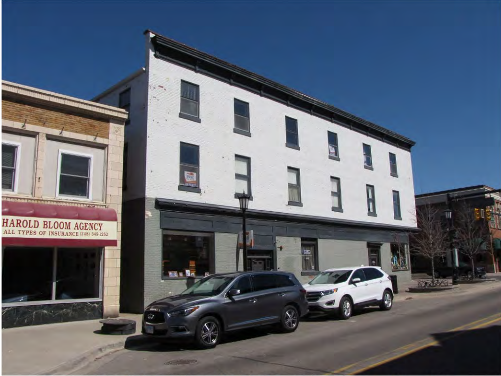
Center North 101-103 and Main West 102-106_Looking West