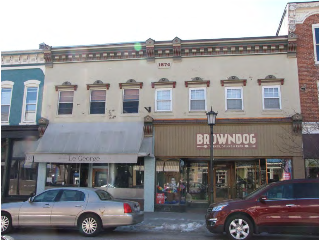
Main East 120-124_Looking South