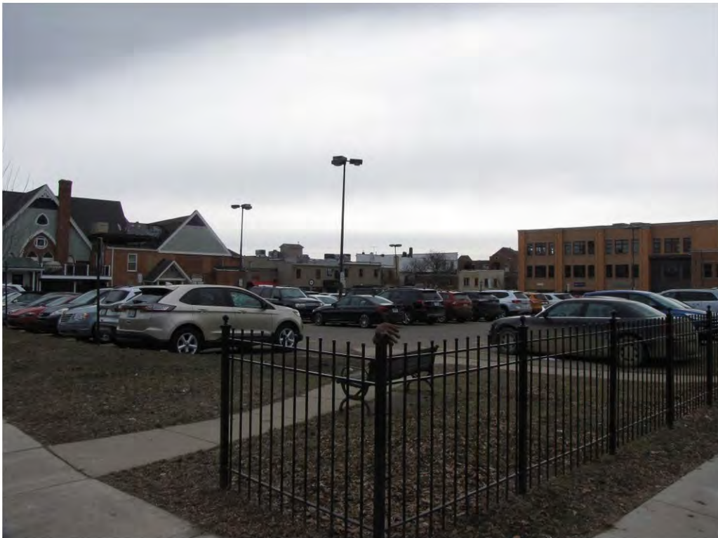
Dunlap West NVA 18_Looking Southeast