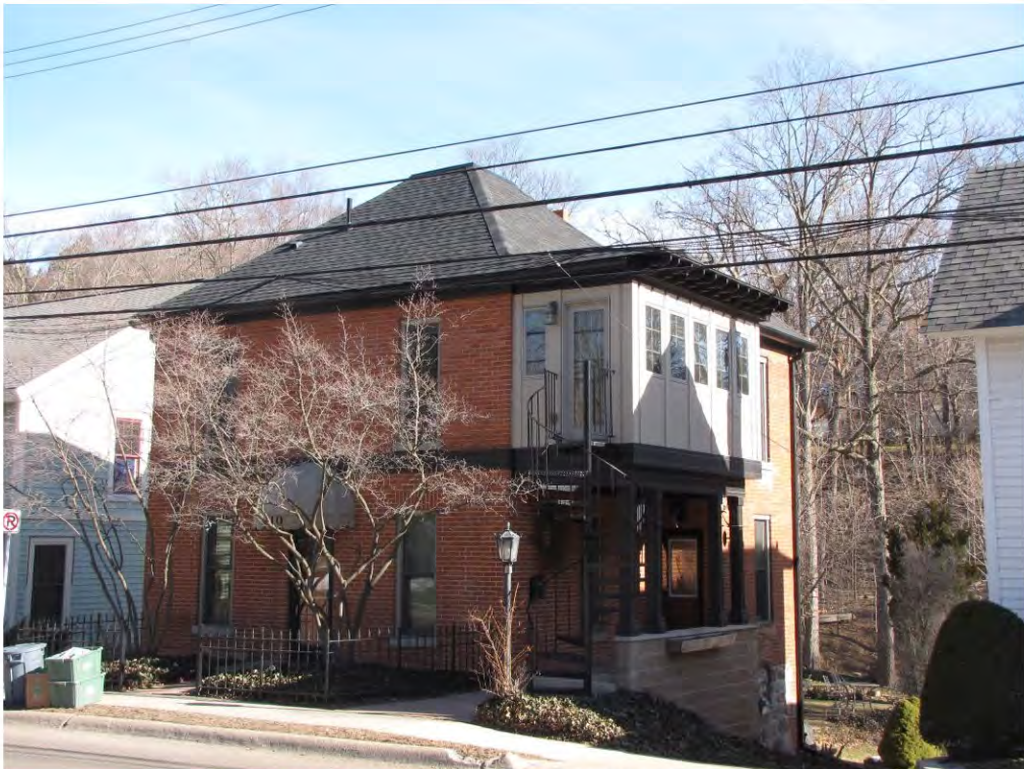
Randolph 510_Looking Northwest