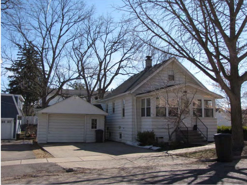
Linden 248_Looking Southeast