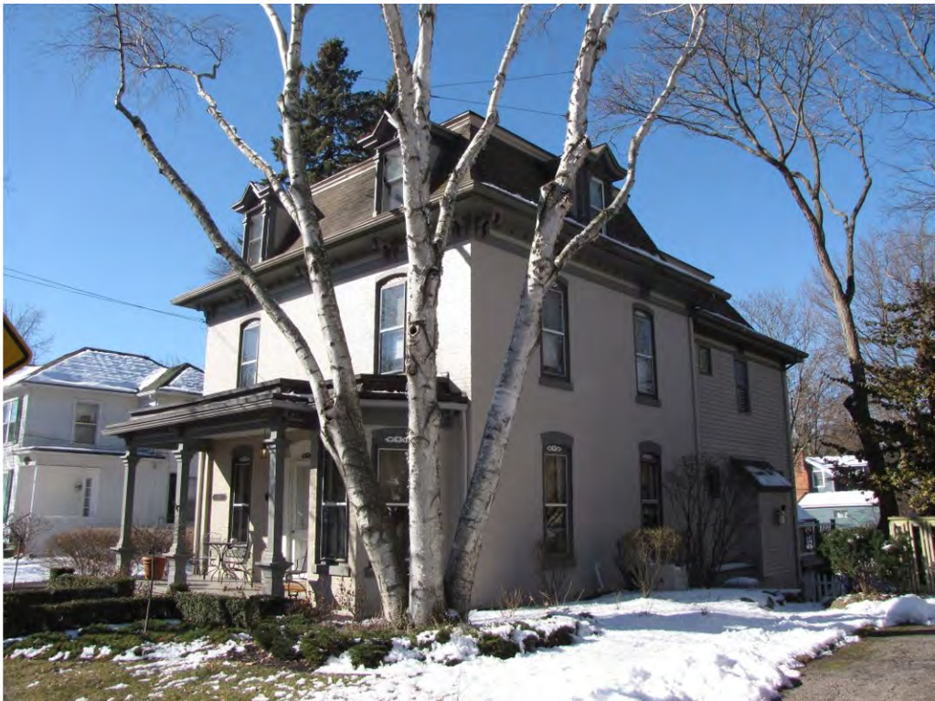
Rogers North 109_Looking Southwest