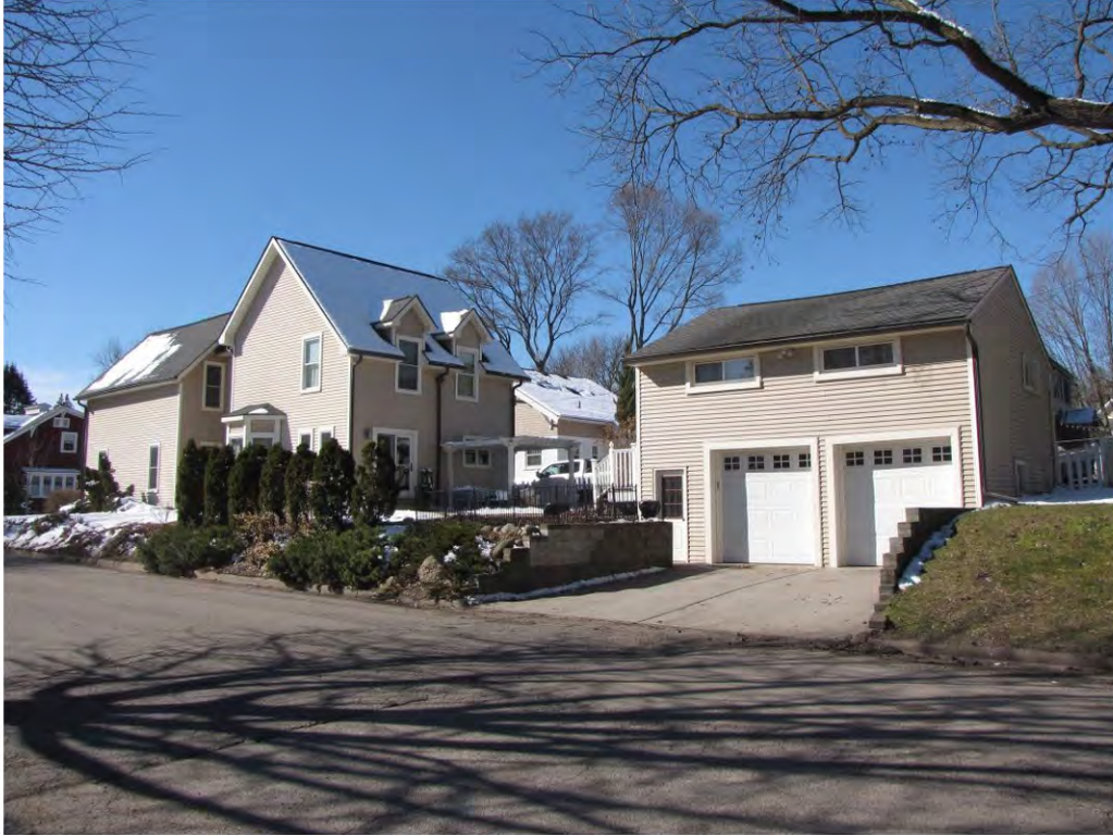
Dubuar 404, Garage_Looking Southwest