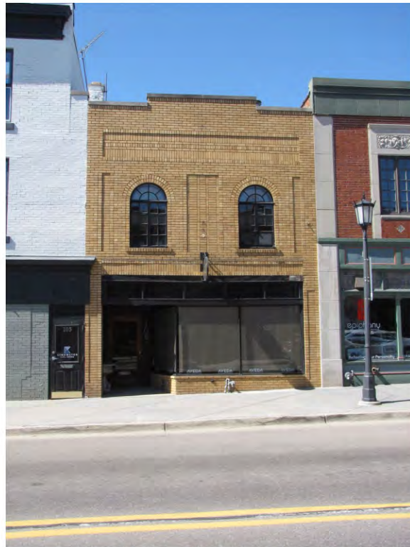
Center North 105_Looking West