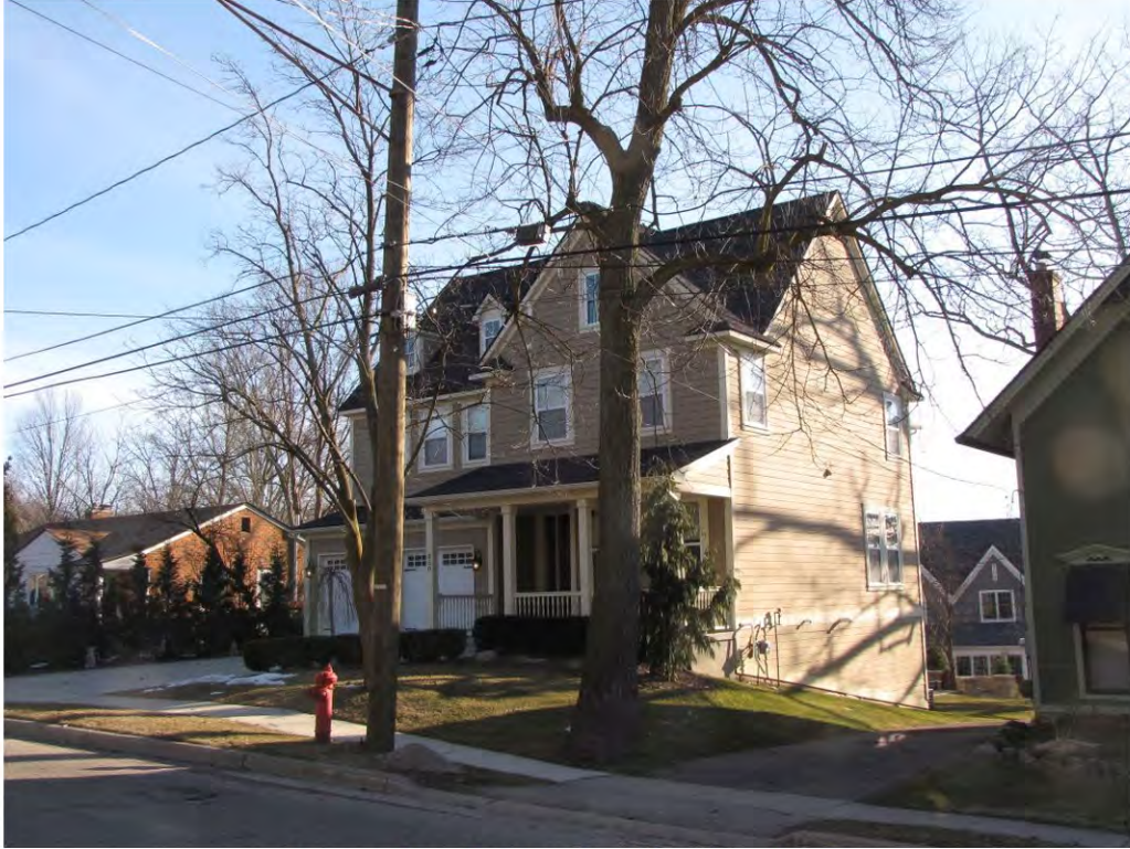
Rogers North 350_Looking Northeast