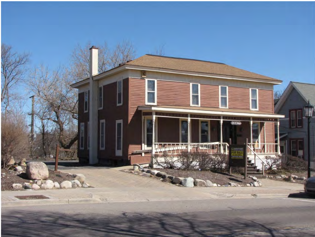
Main East 341_Looking Northeast