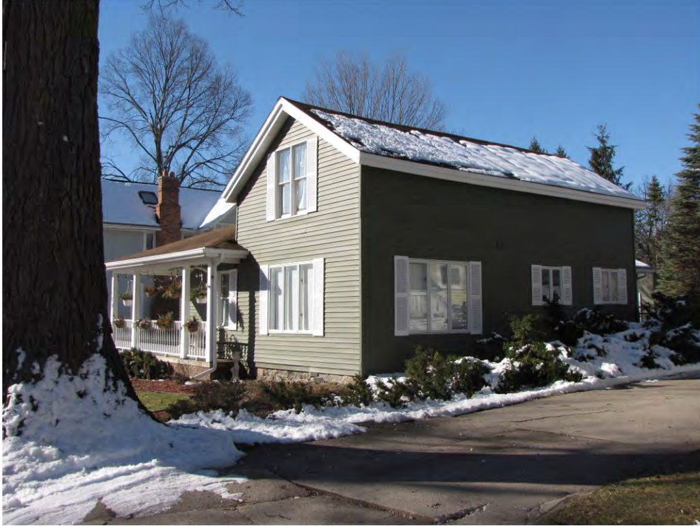
Rogers South 122_Looking Southwest