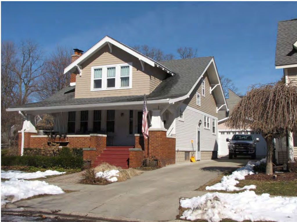
Dubuar 406_Looking Northwest