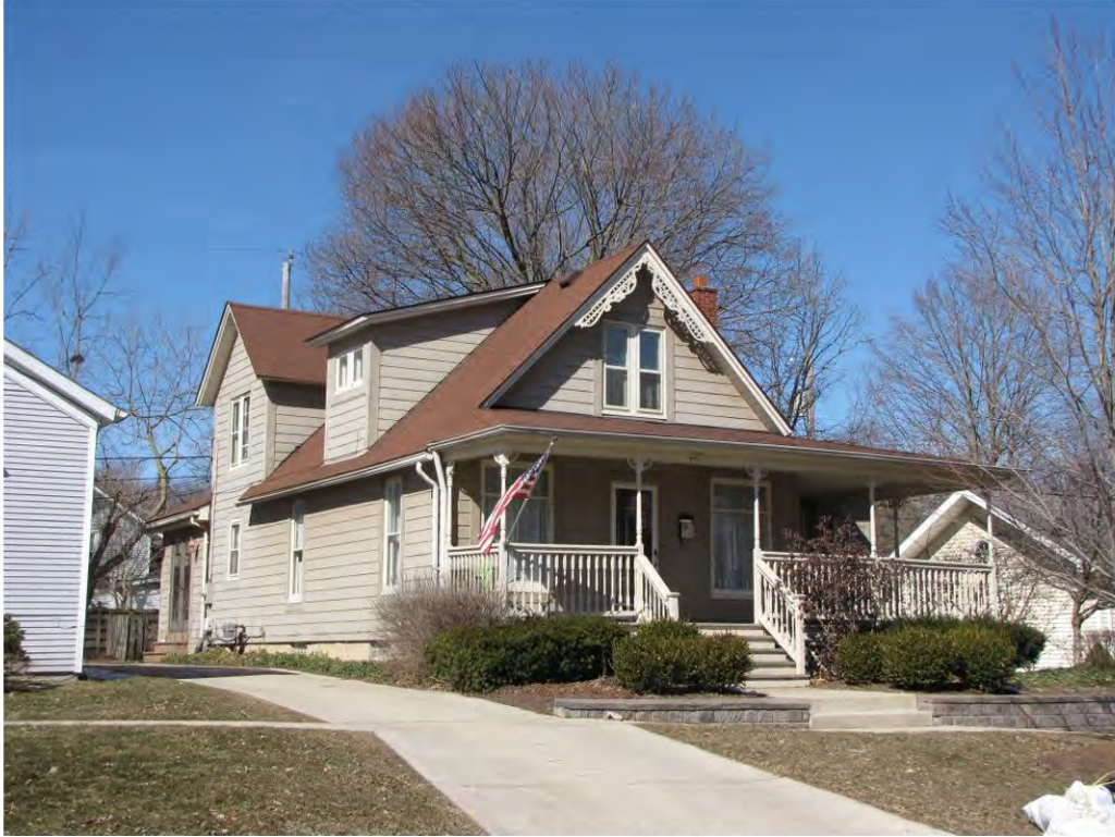
West 227_Looking Northwest