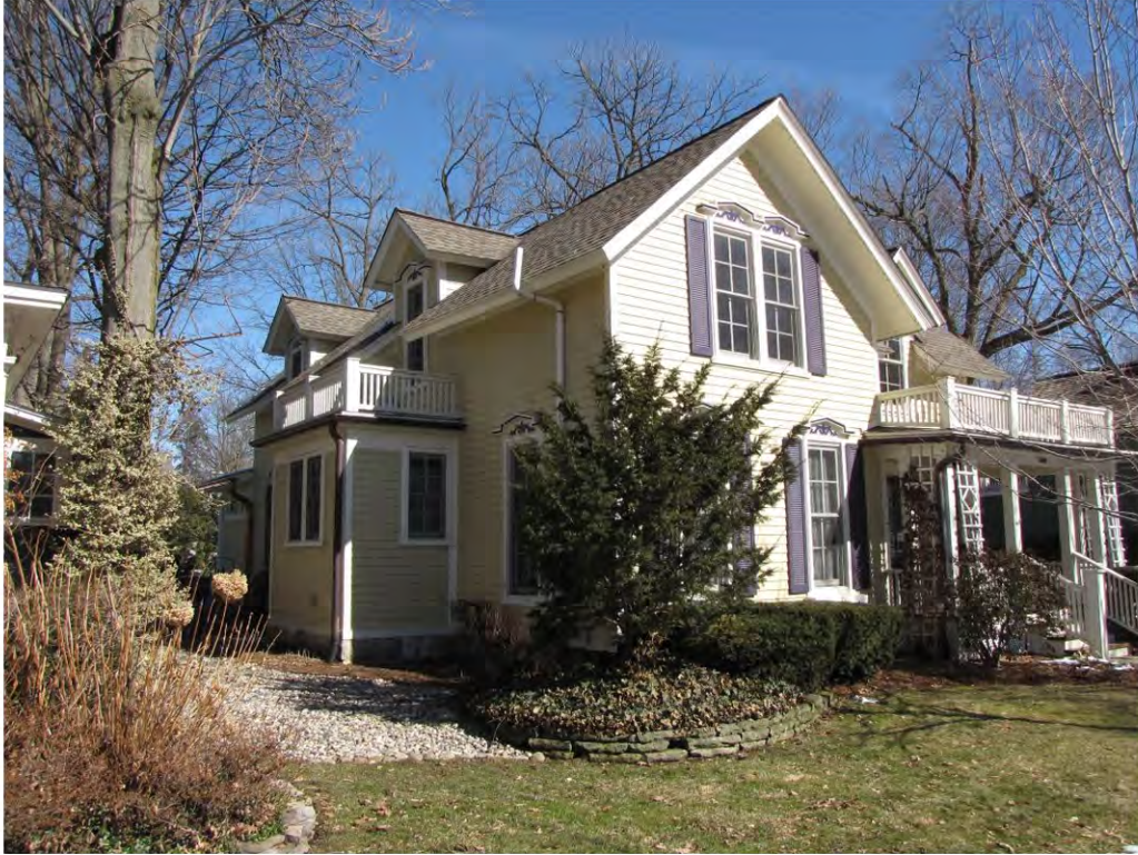
Dunlap West 542_Looking Northeast