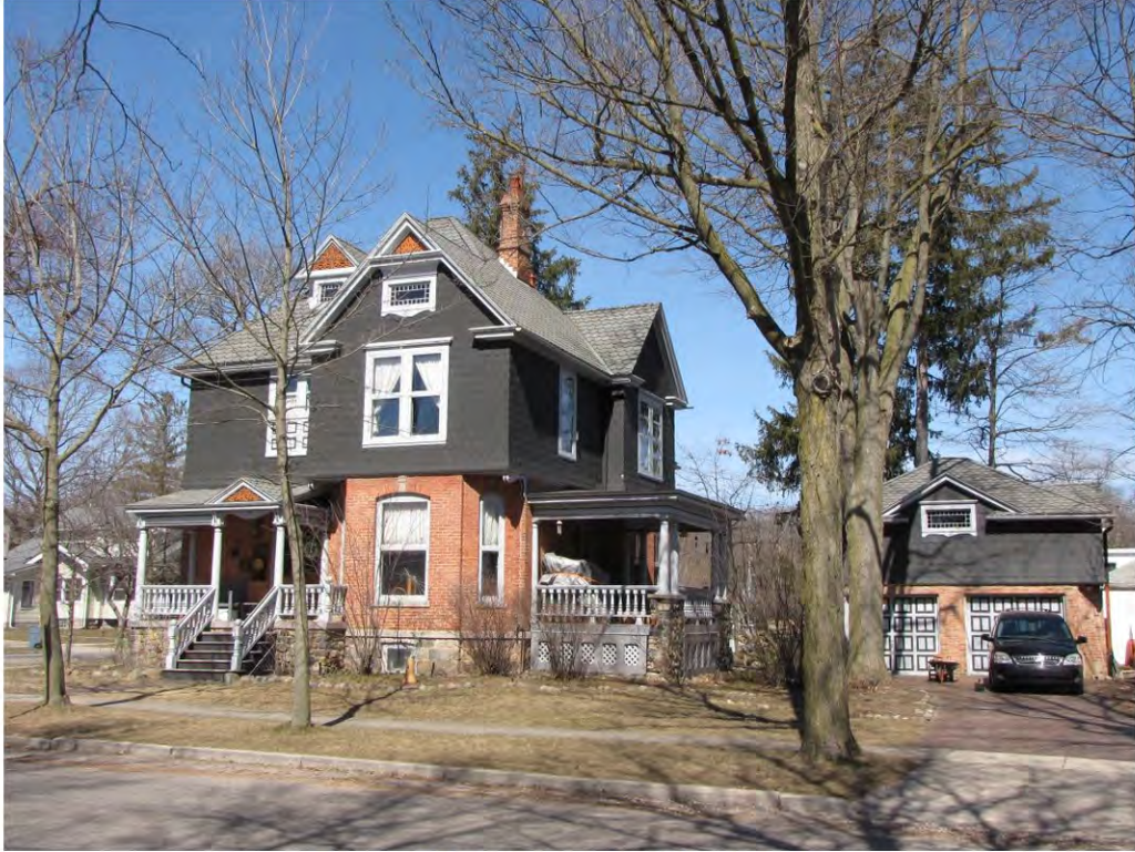
Dunlap West 218_Looking North