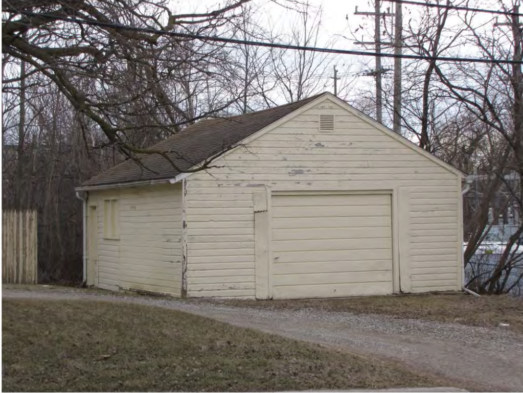
Cady East 350, Garage_Looking Southeast