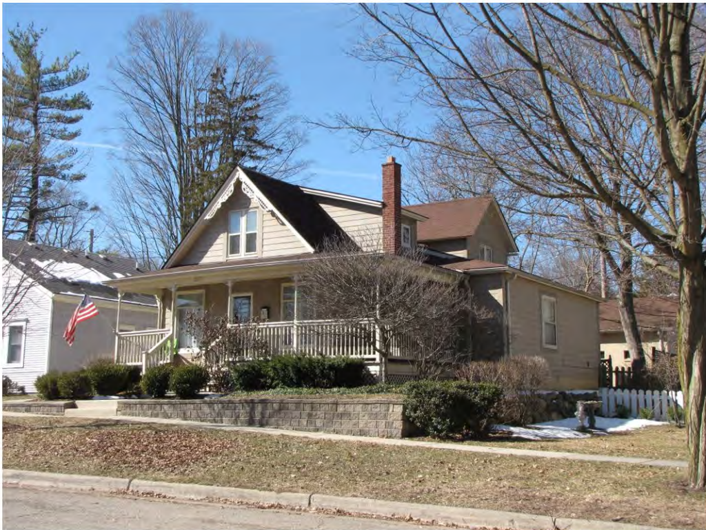
West 227_Looking Southwest