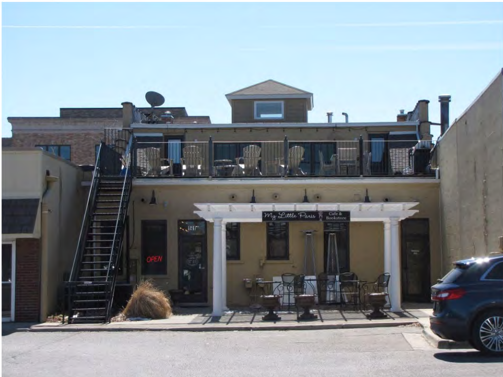
Main East 141-145_ Looking South