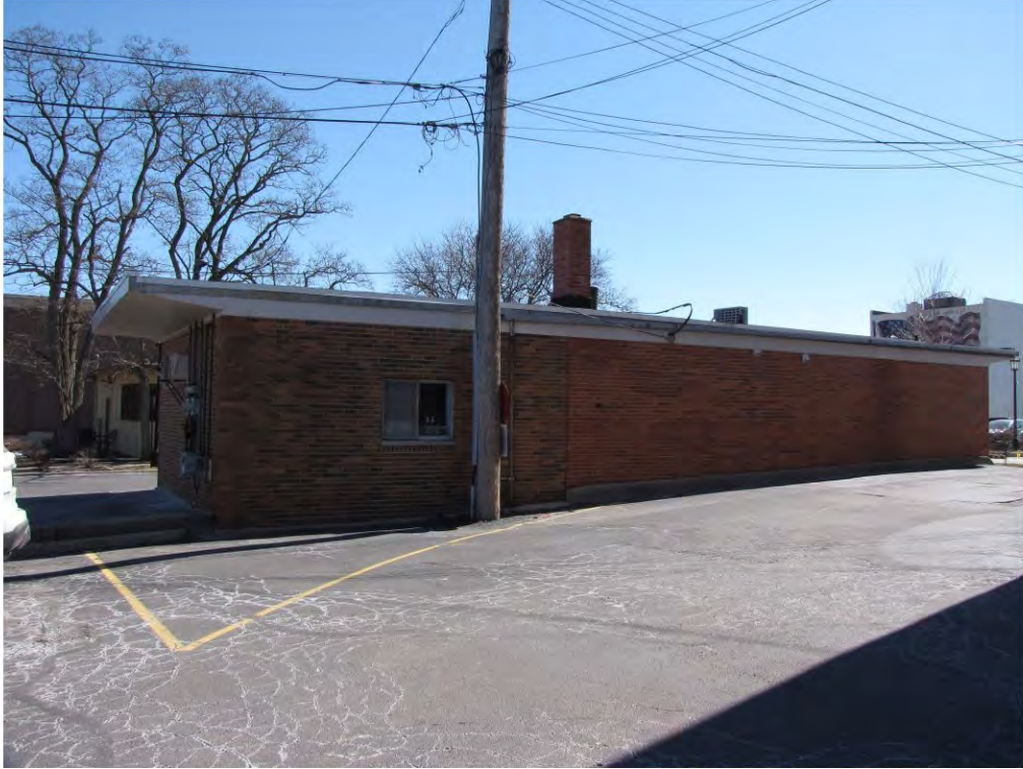
Dunlap East 111_Looking Southeast