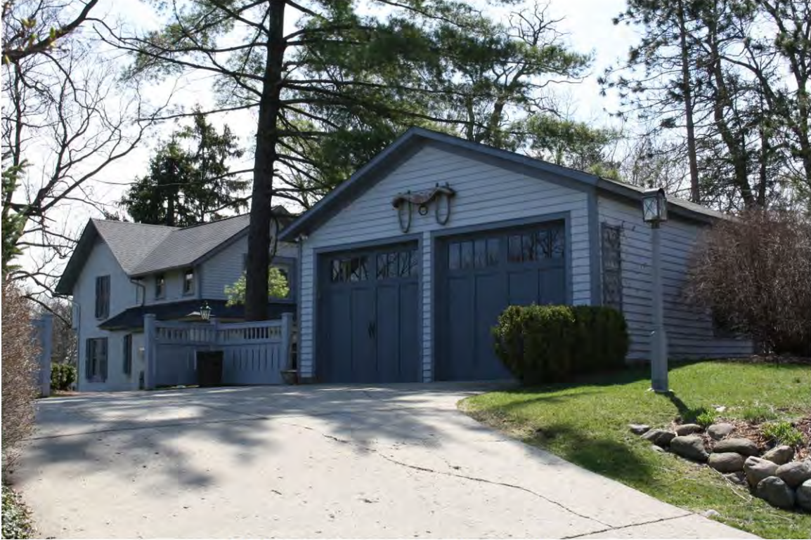
High 239, Garage_Looking Southeast