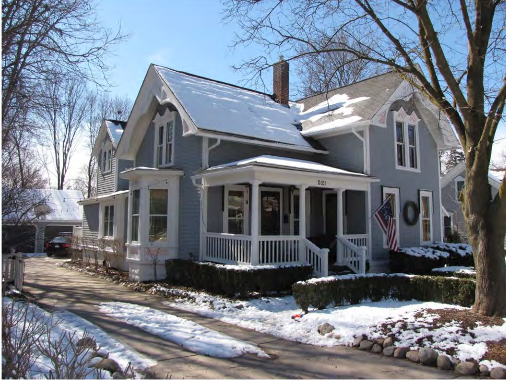
Main West 521_Looking Southwest