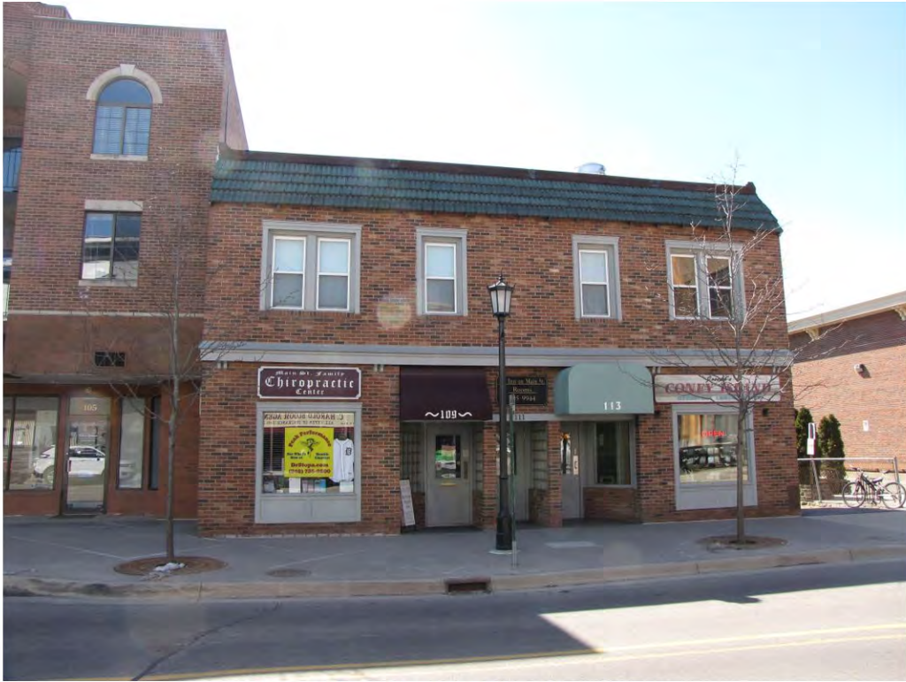
Main West 109-113_Looking South