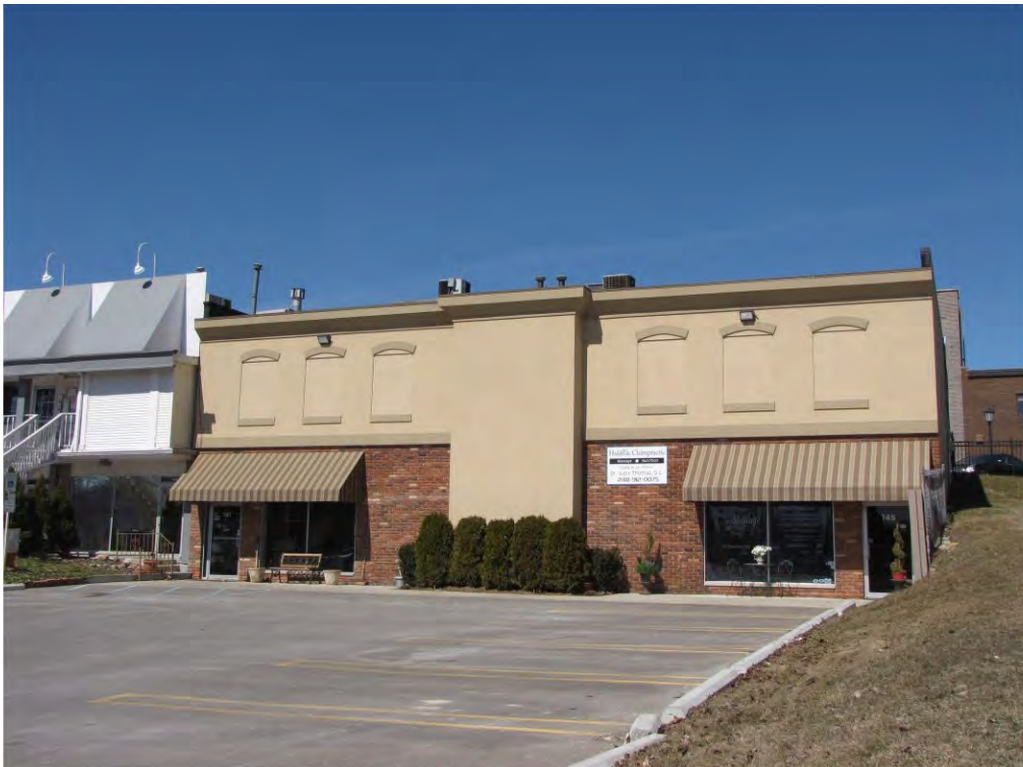
Cady East 141_Looking Northwest