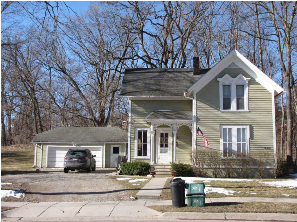
Randolph 537-539_Looking South