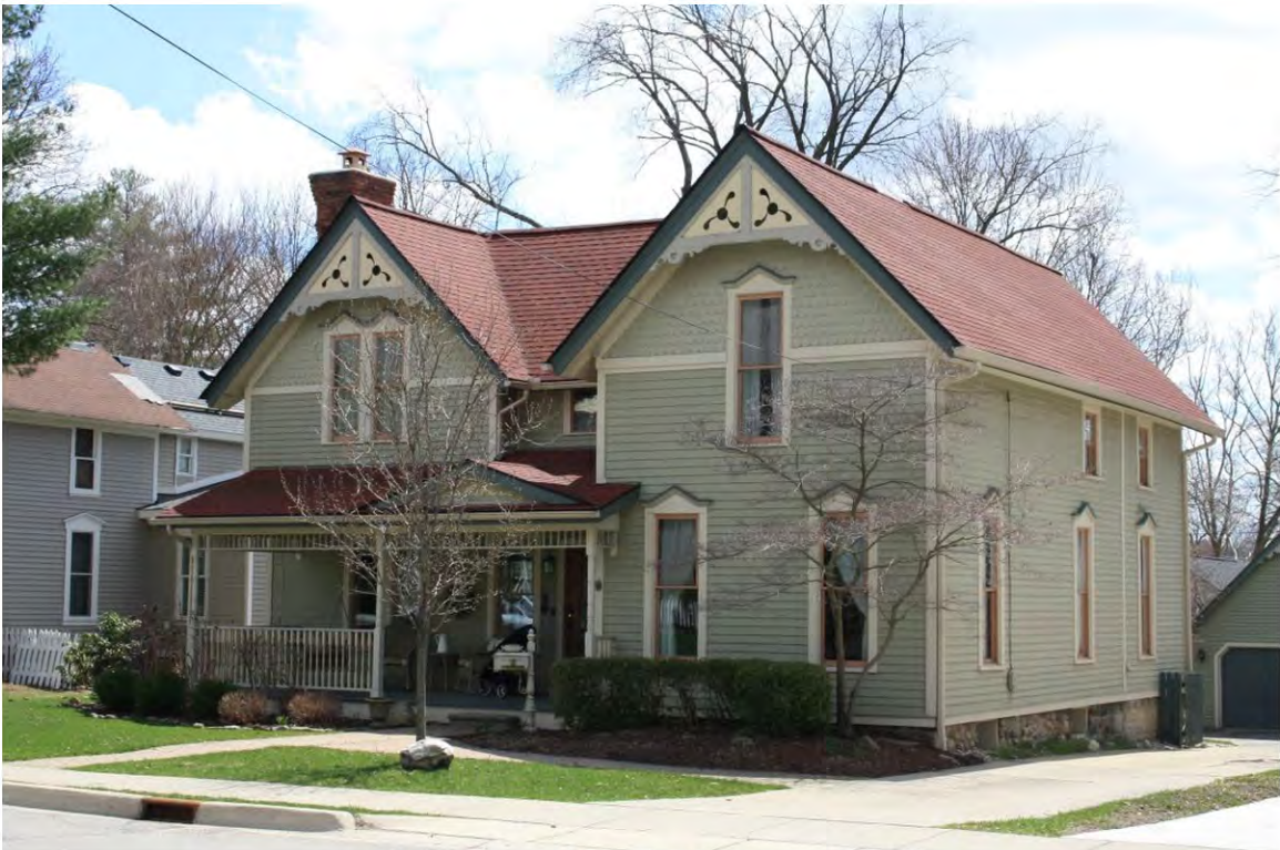
Main West 537_Looking Southeast