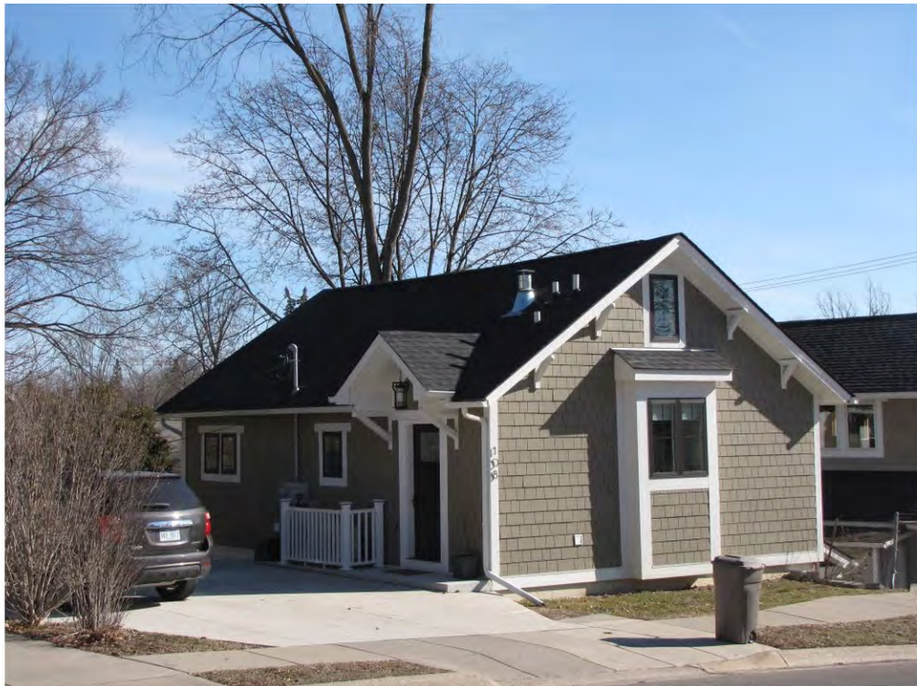
Randolph 108_Looking Northeast