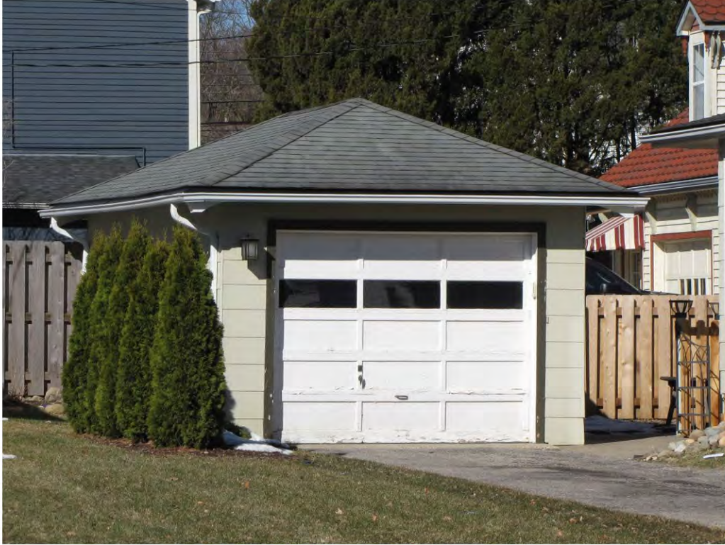
High 213, Garage_Looking West