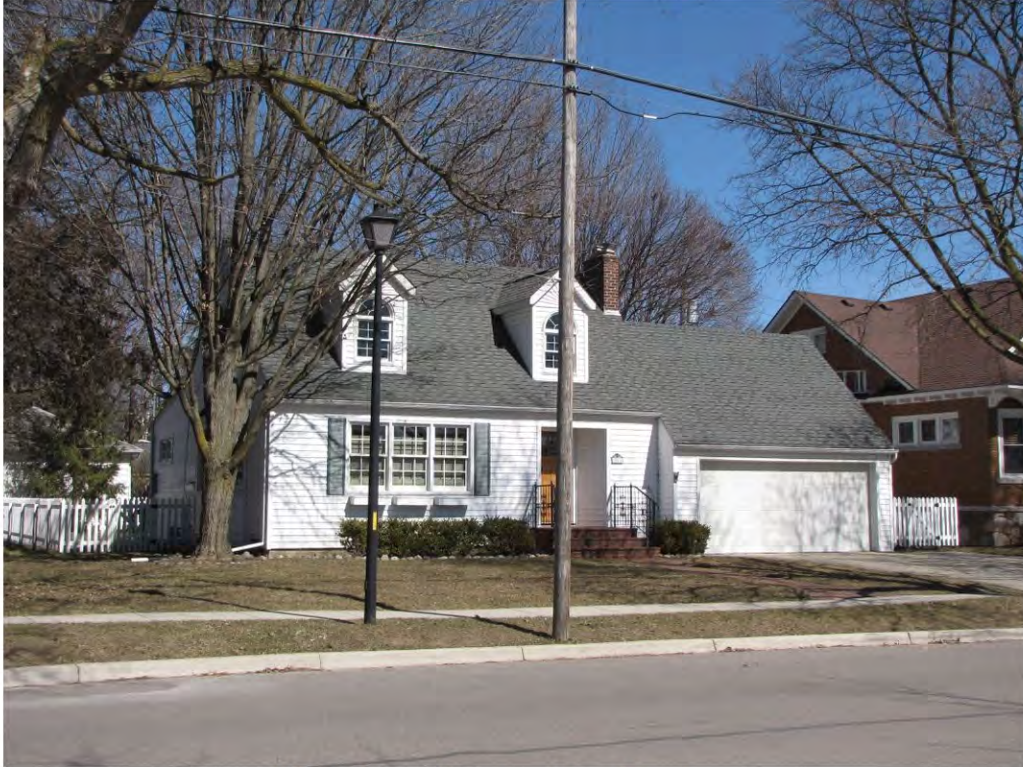
Main West 306_Looking Northeast