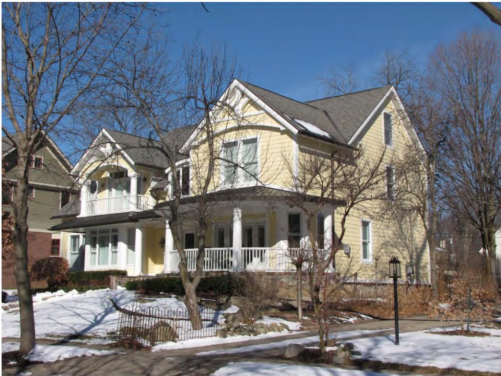
Dubuar 422-Looking Northwest