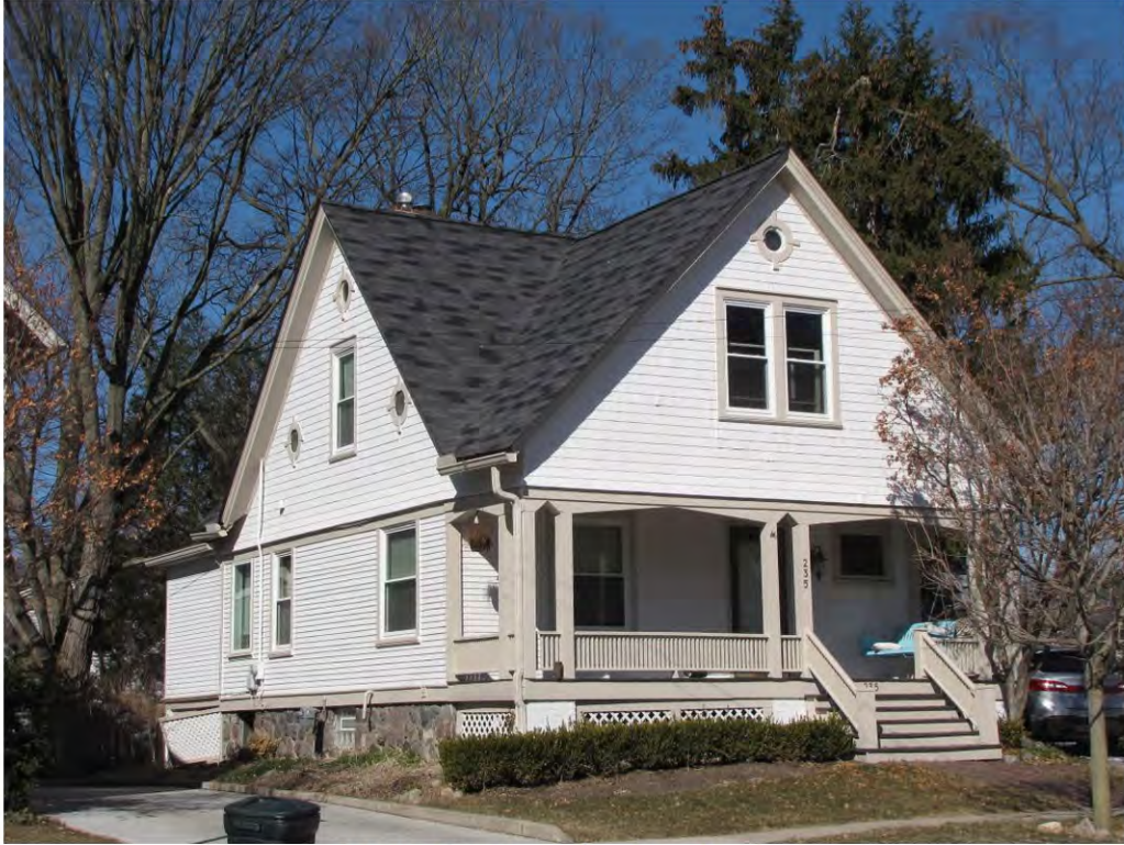
High 235_ Looking Northwest