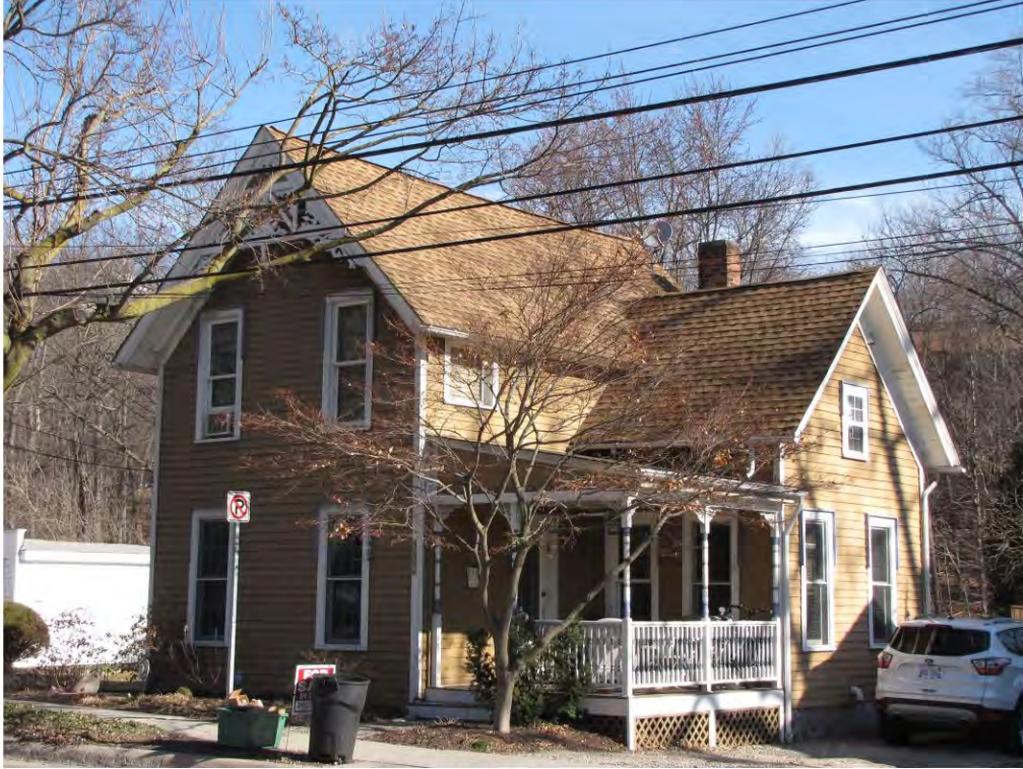
Randolph 442_ Looking Northwest