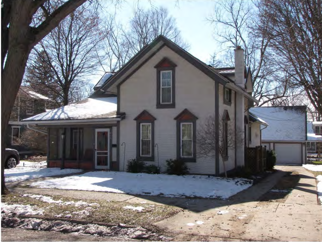
Dubuar 419_Looking South