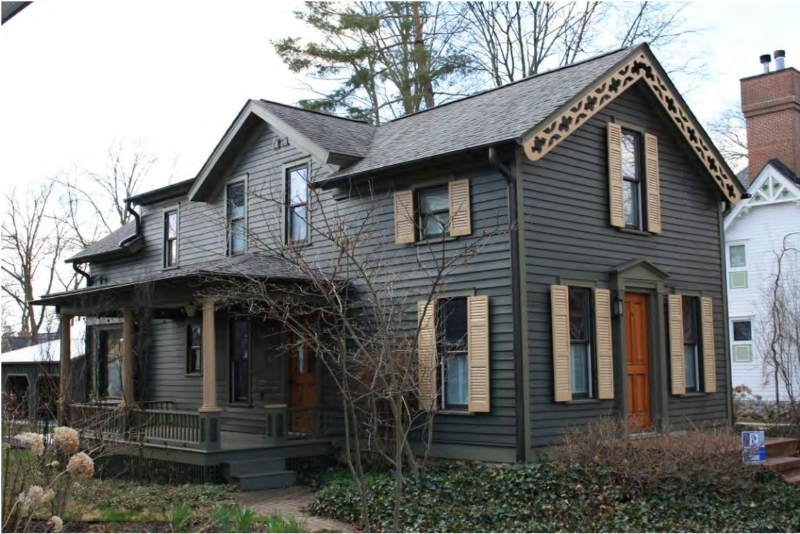
Dunlap West 527_Looking Southwest