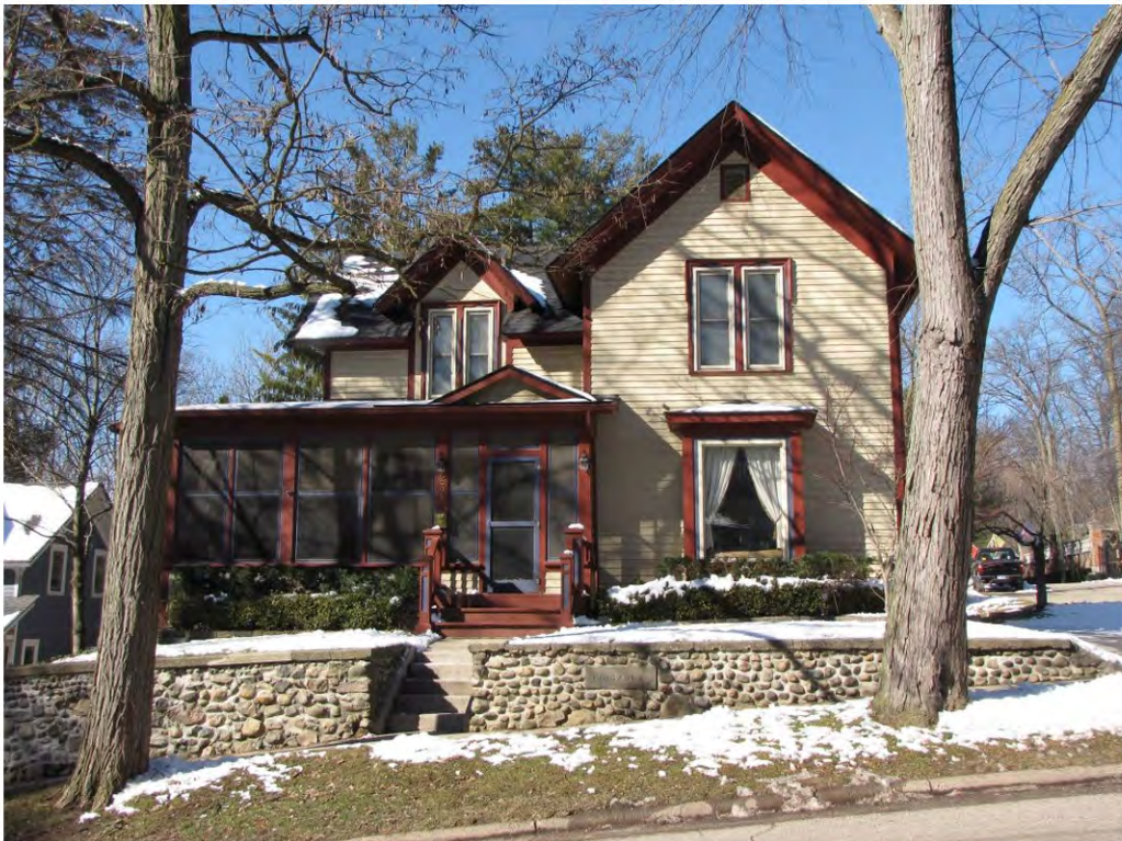
Rogers North 231_Looking West