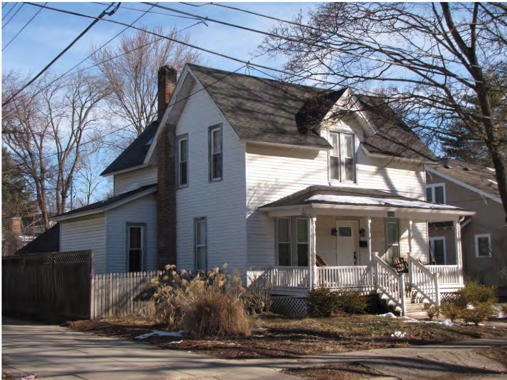
Cady West 508_Looking Northeast