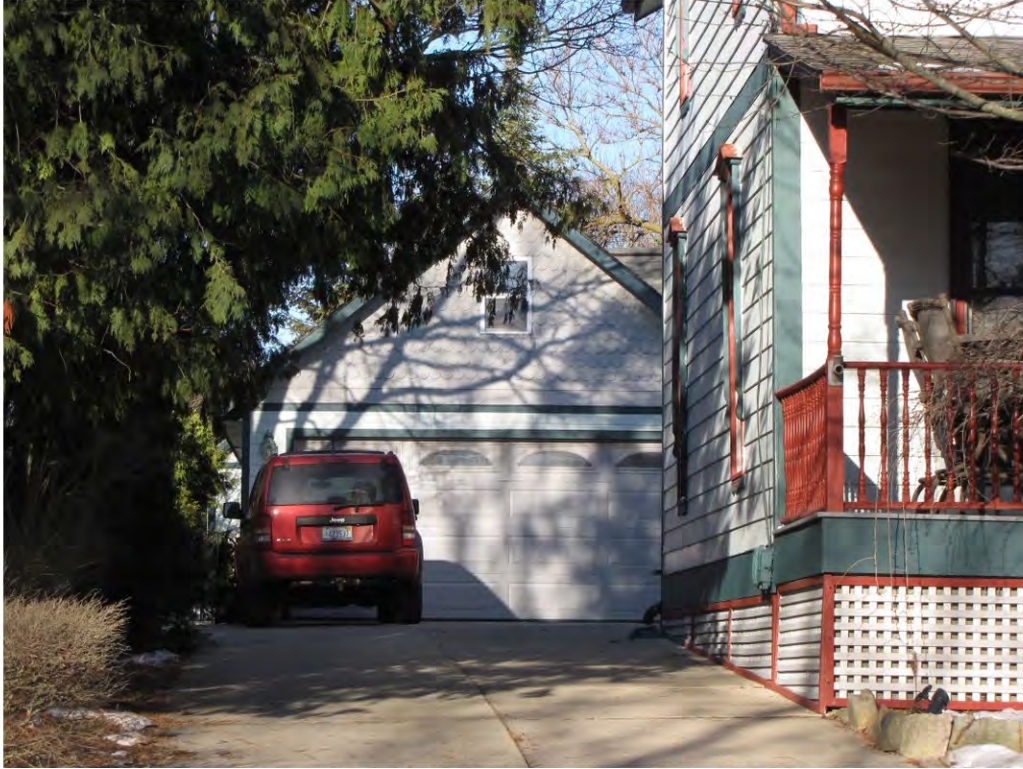
Rogers North 365, Garage_Looking West