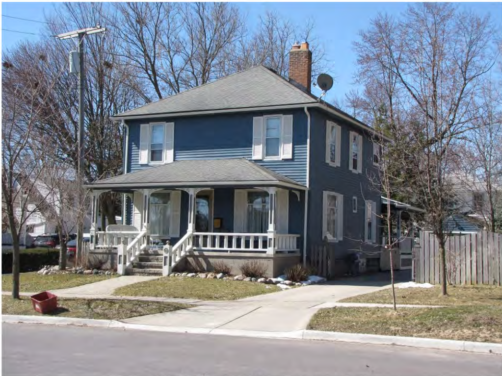
High 113_Looking Southwest