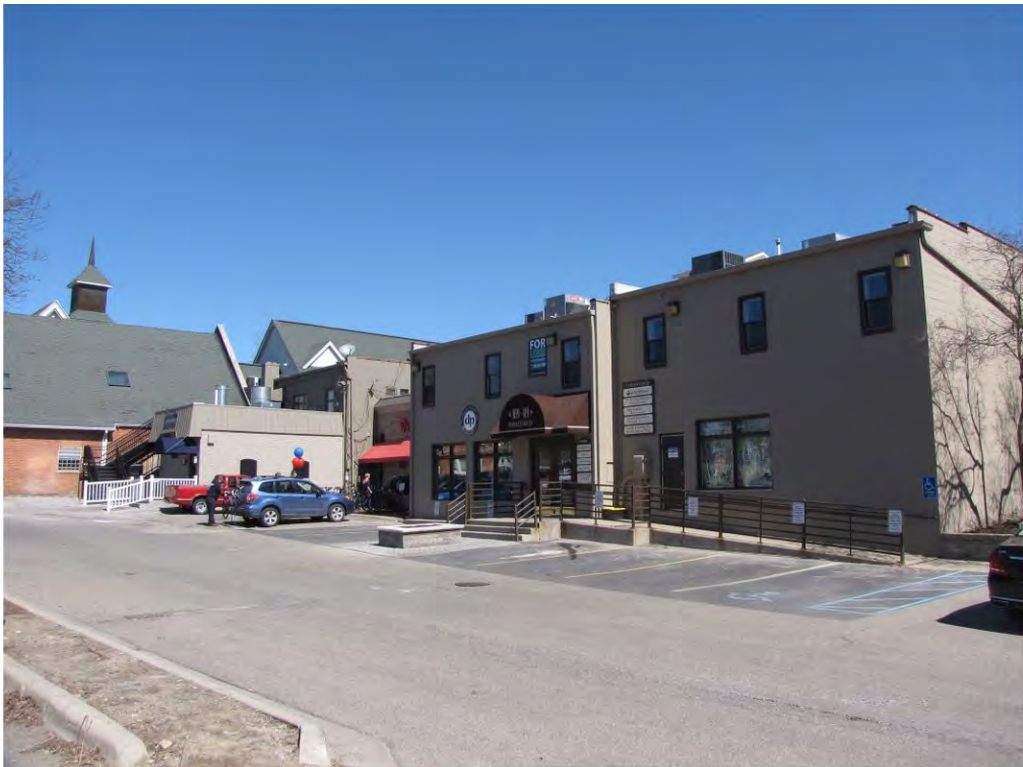
Center North 109-115_Looking Northeast