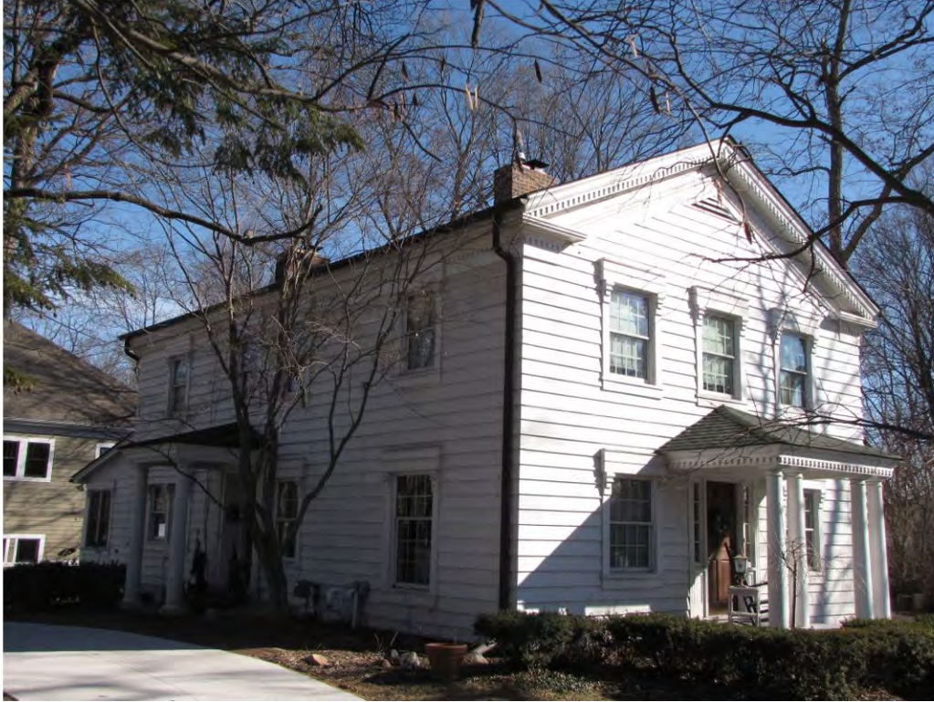
Randolph 204_Looking Northeast