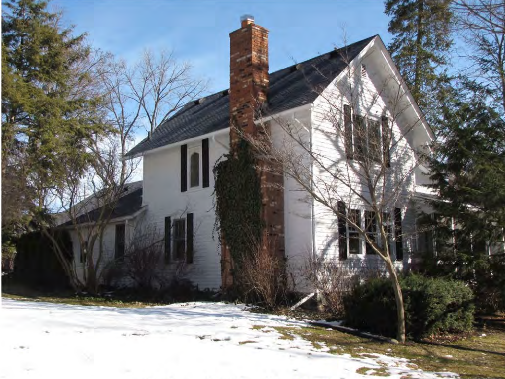
Dubuar 440_Looking Northeast