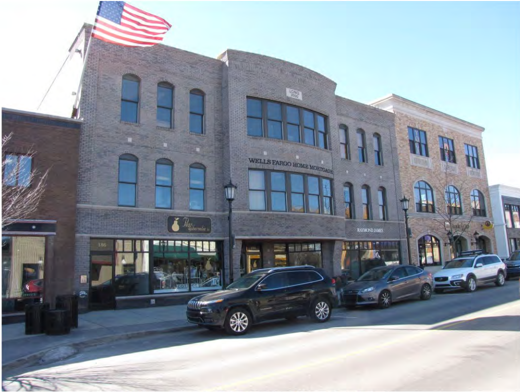
Main East 182-186_Looking Southwest