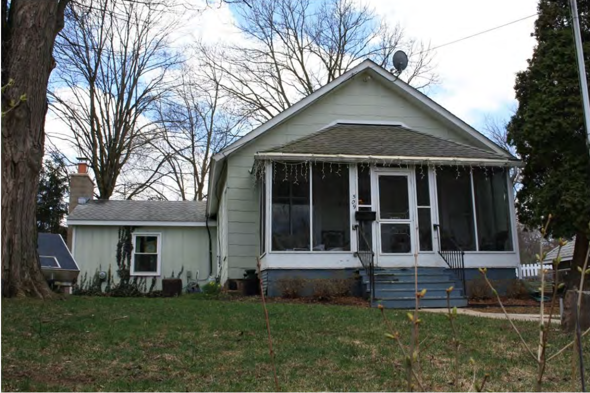
Randolph 509_Looking South