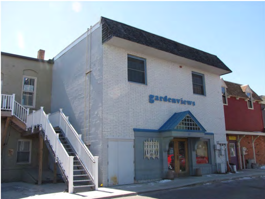
Main East 117_Looking Southwest