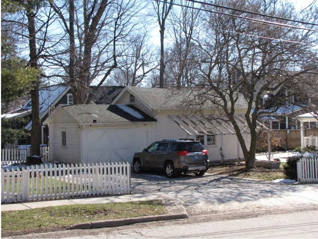
Dunlap West 552, Garage_Looking Southeast