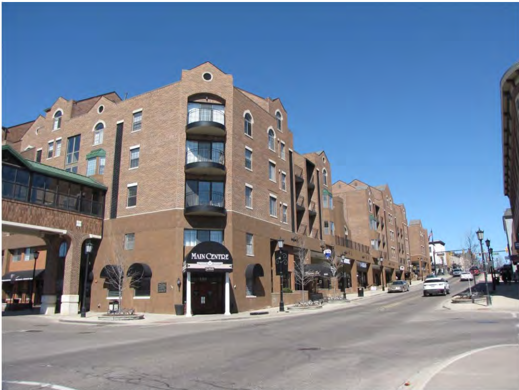
MainCentre 150_Looking Northwest