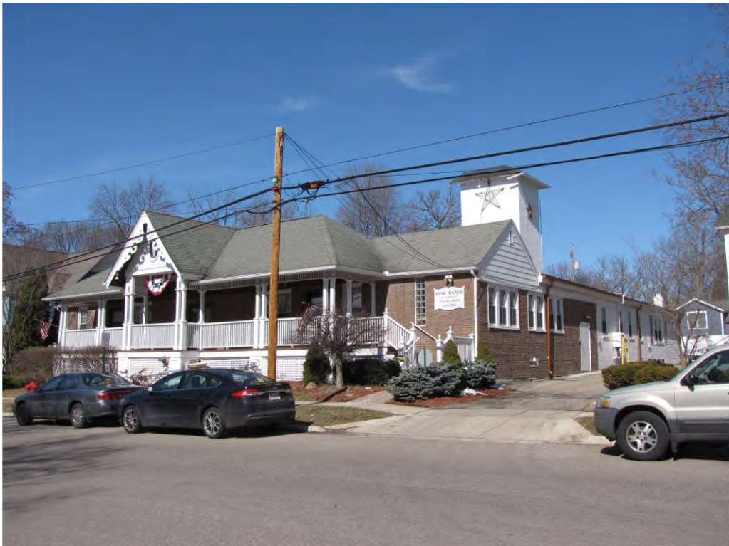
Main West 520_Looking Northwest