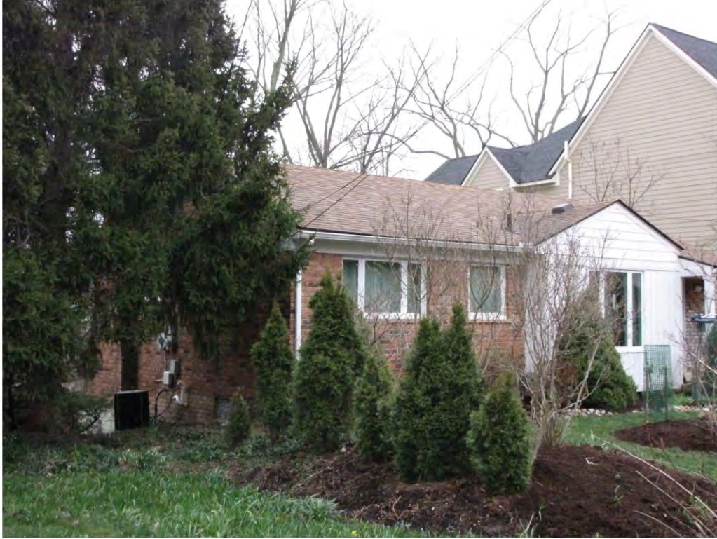
Rogers North 368_Looking Southeast