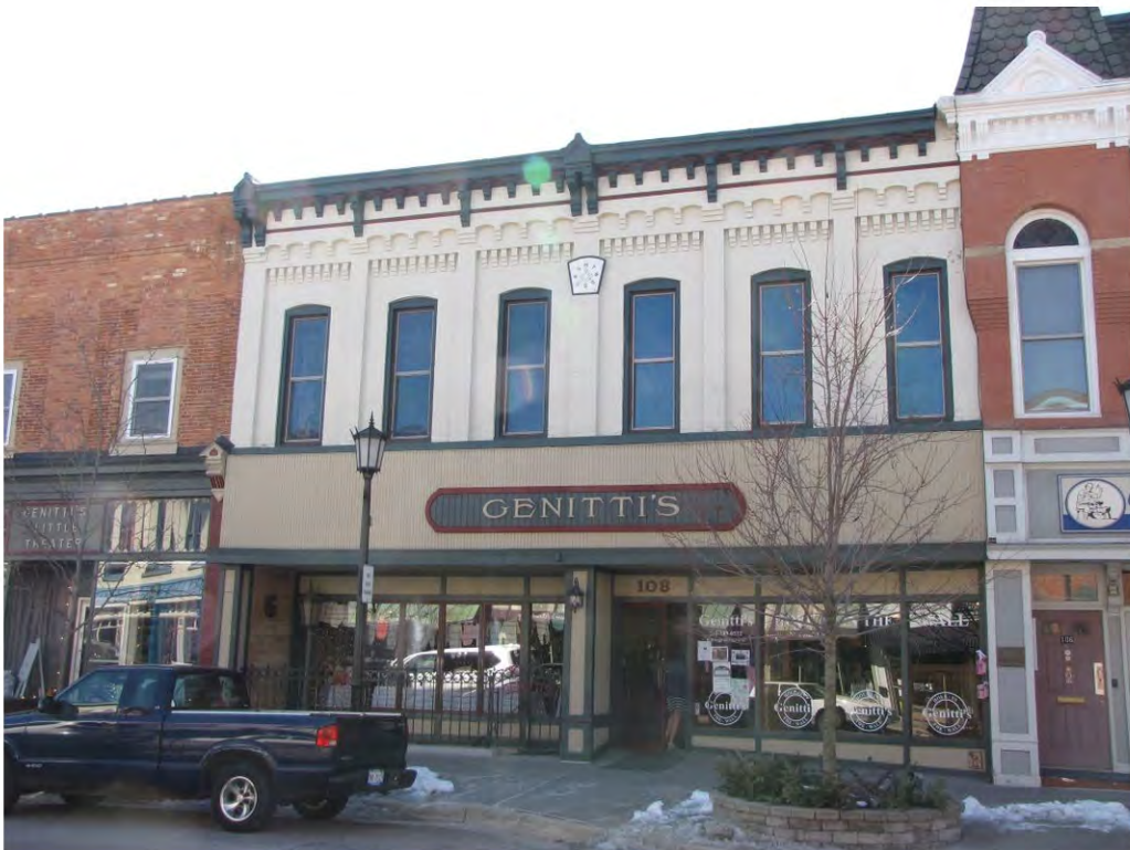
Main East 108-110_Looking Southwest