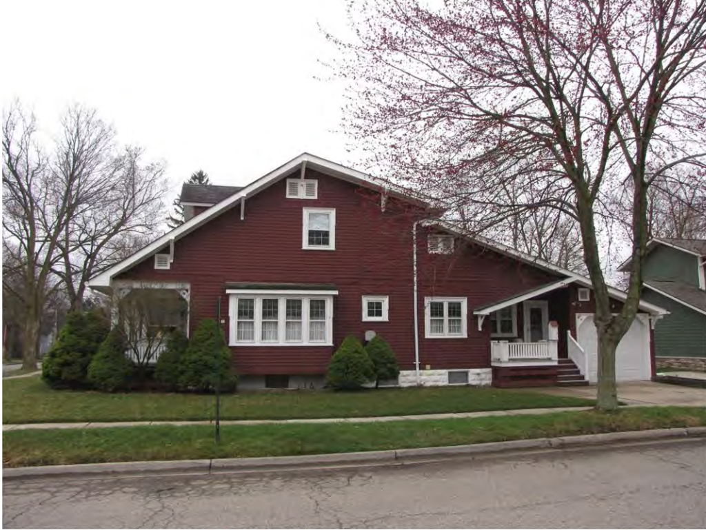
Linden 229_Looking South