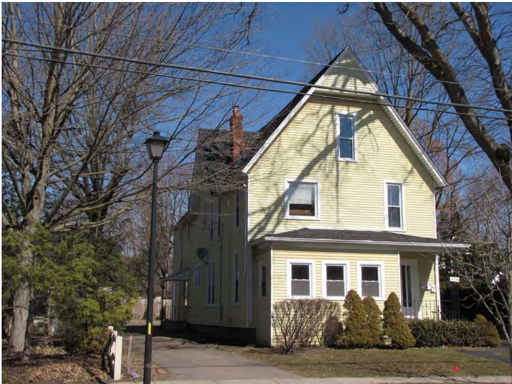
Main West 410_ Looking Northeast