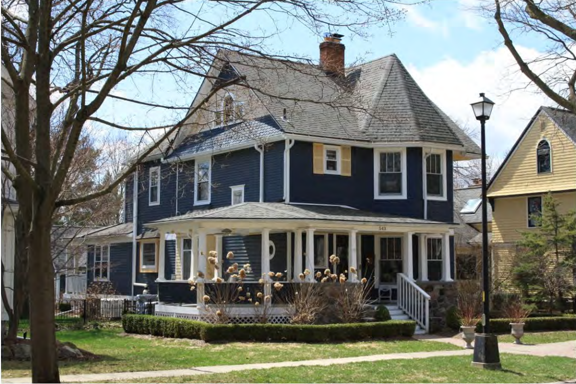
Dunlap West 543_Looking Southwest