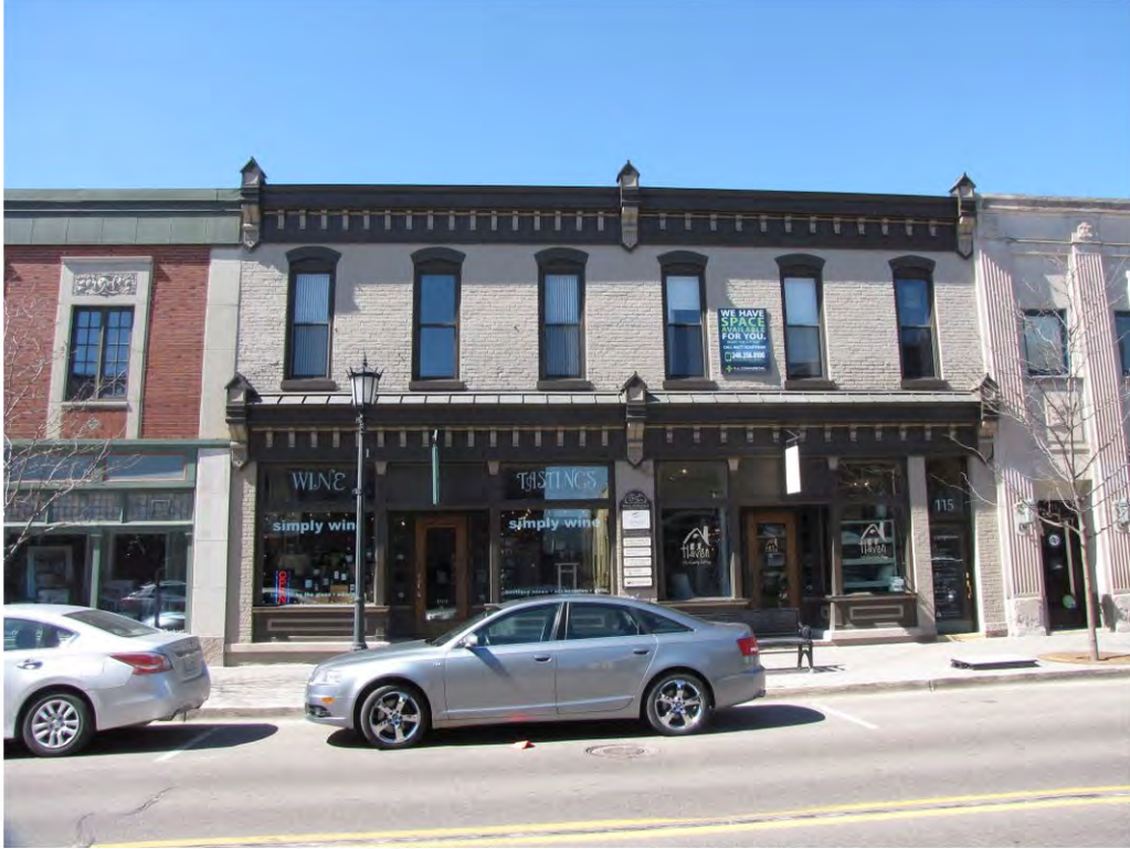
Center North 109-115_Looking West