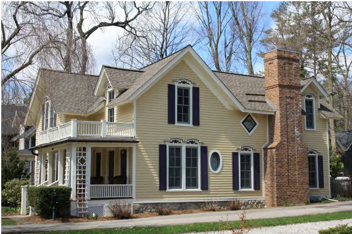
Dunlap West 542_Looking Northwest