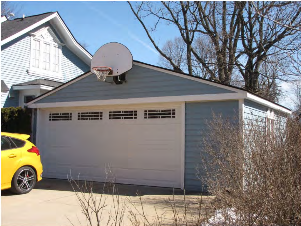
Dunlap West 417, Garage_Looking Northeast