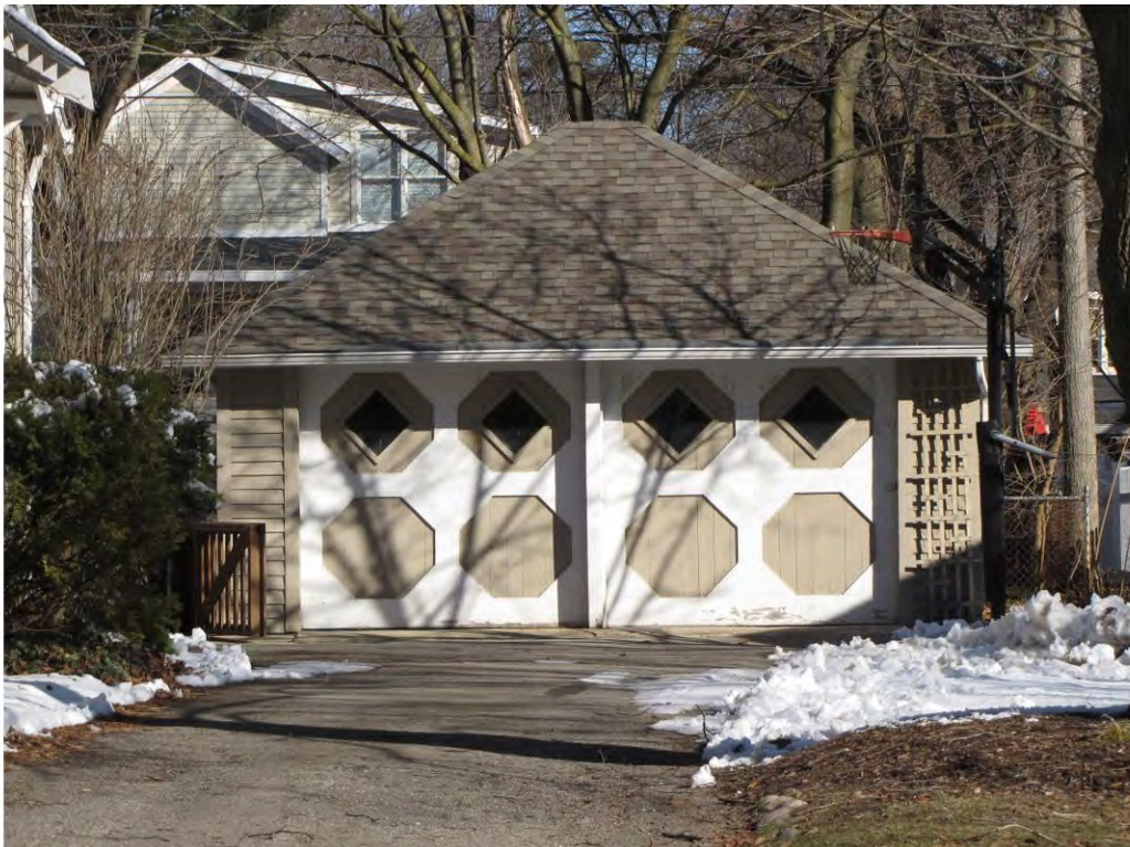
Cady West 504, Garage_Looking North