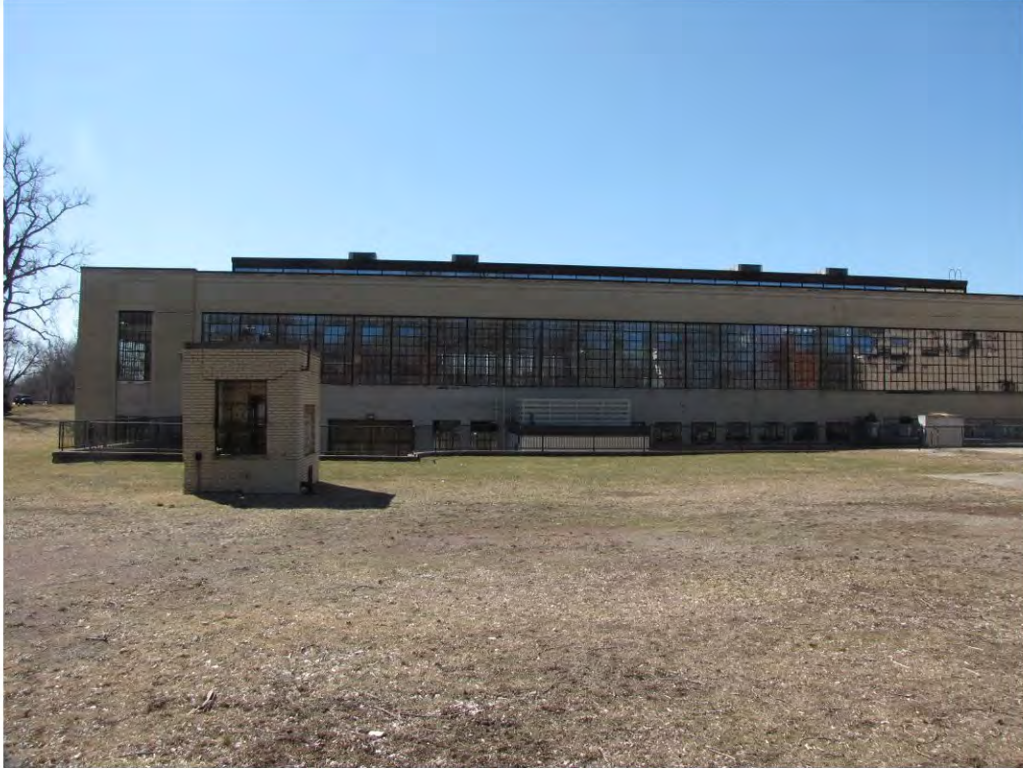
Main East 235_Looking South