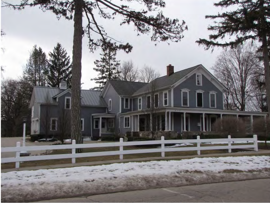
Cady West 473_Looking Southwest