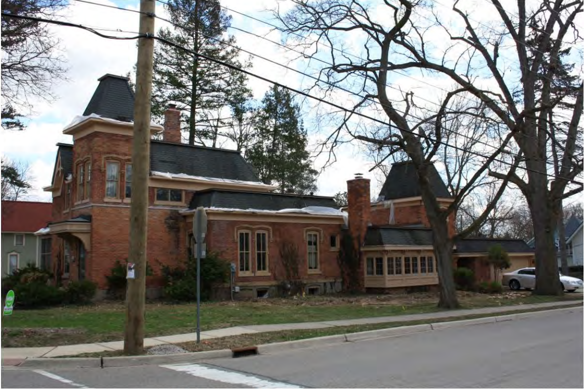
Main West 547_ Looking Southeast