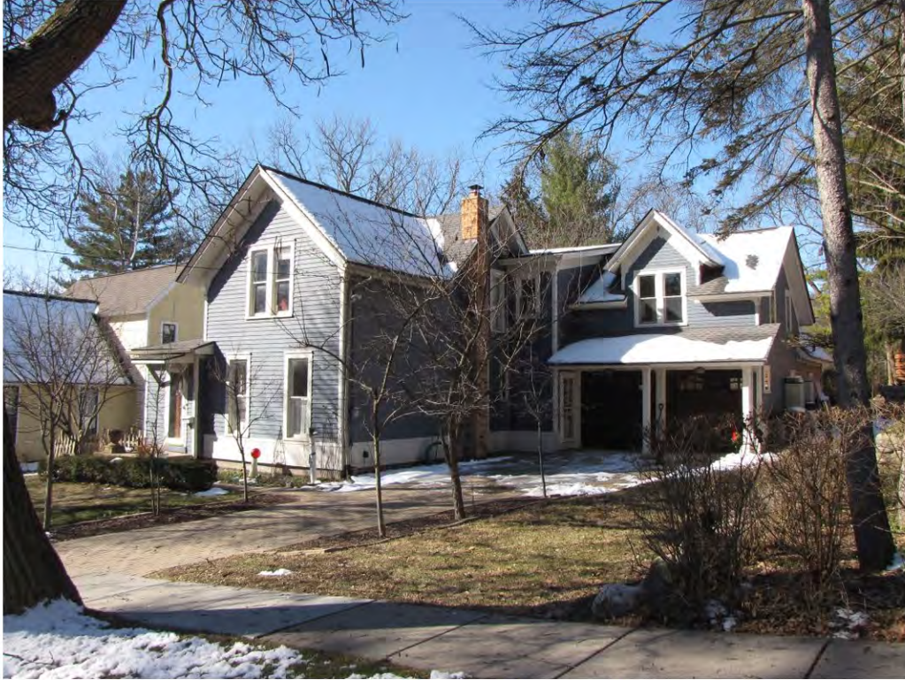
Rogers North 227_Looking Southwest