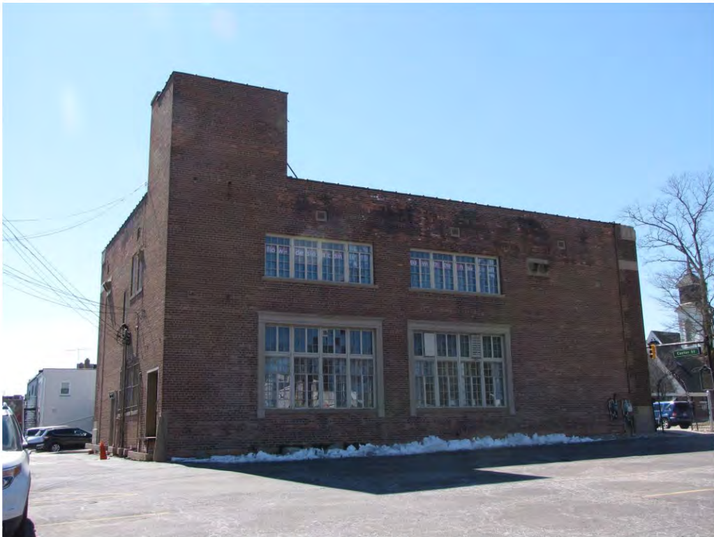
Center North 200_Looking Southwest