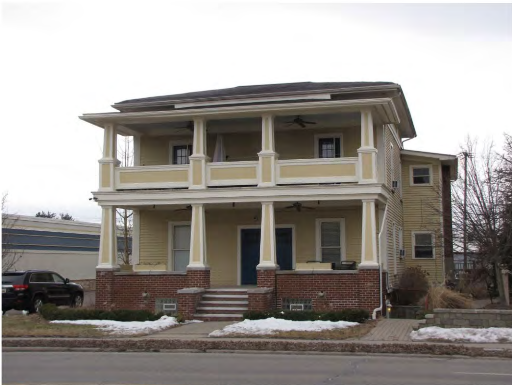
Main East 450_Looking Southeast