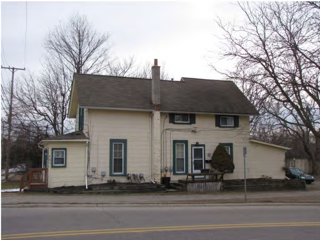
Cady East 350_Looking East