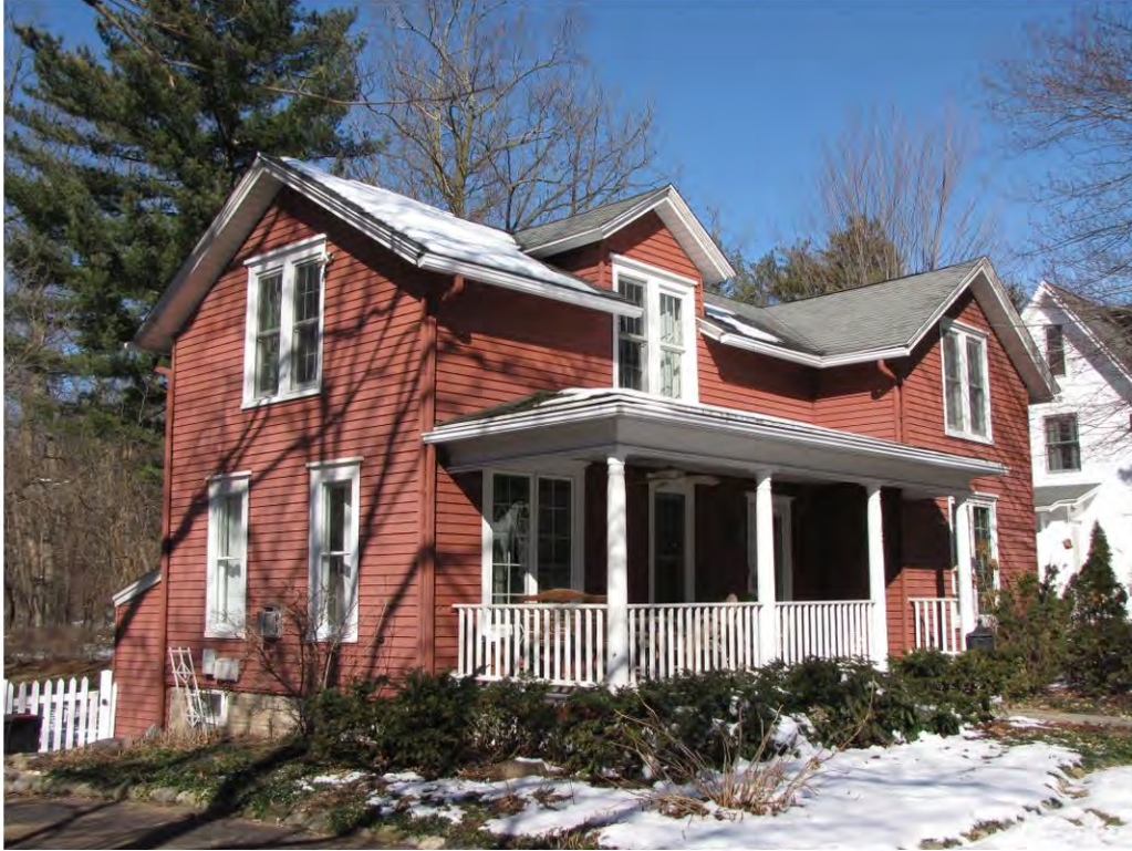
Rogers North 201_Looking Northwest