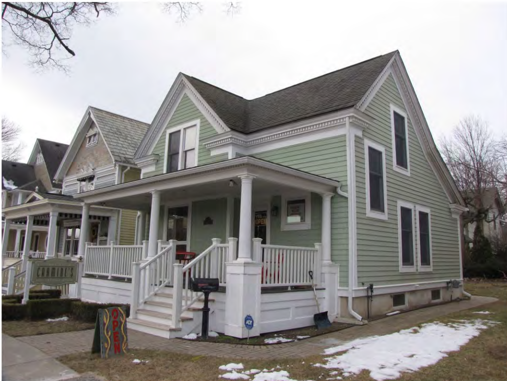
Wing North 125_ Looking Southwest