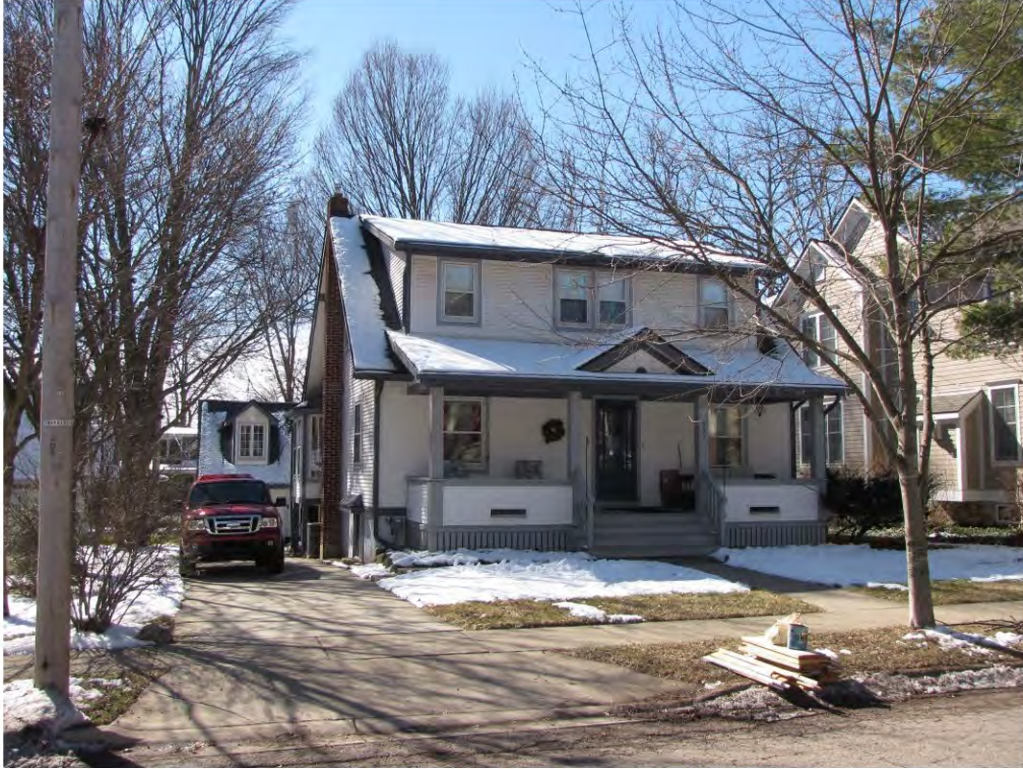
Dubuar 421_Looking South