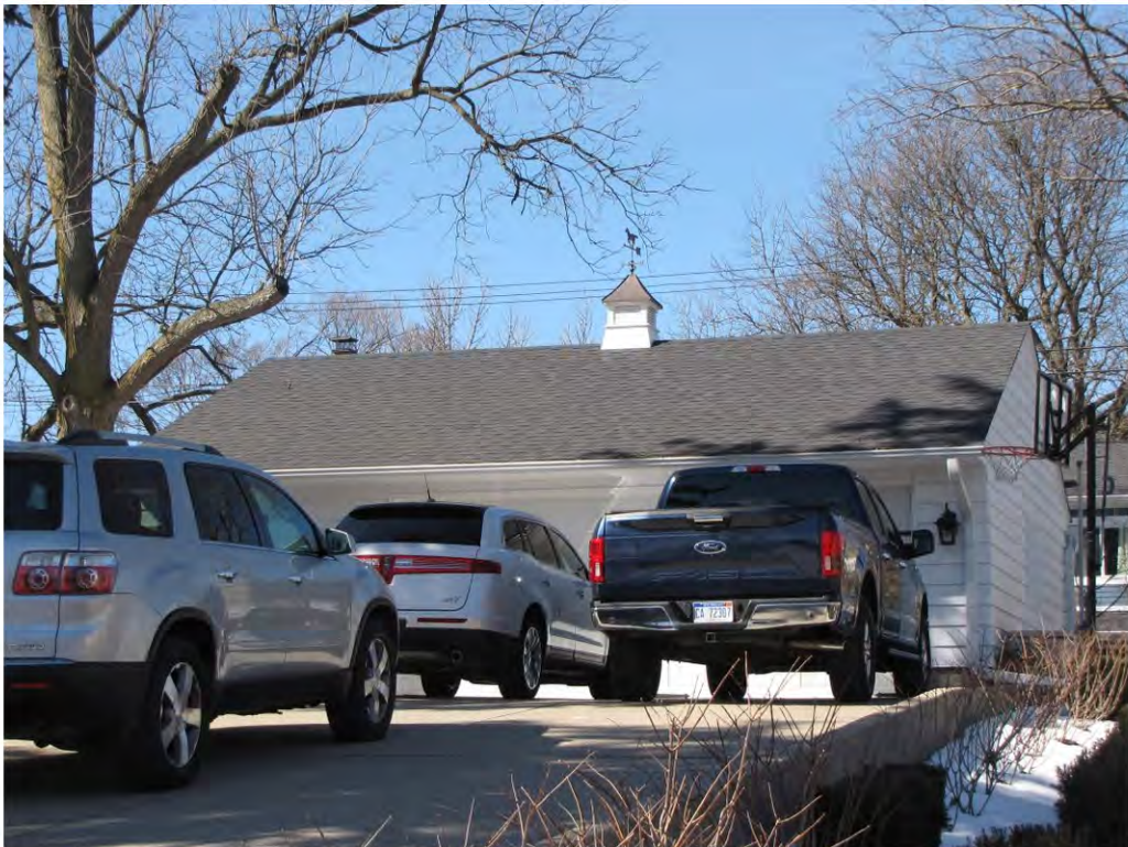
West 247, Garage_Looking West