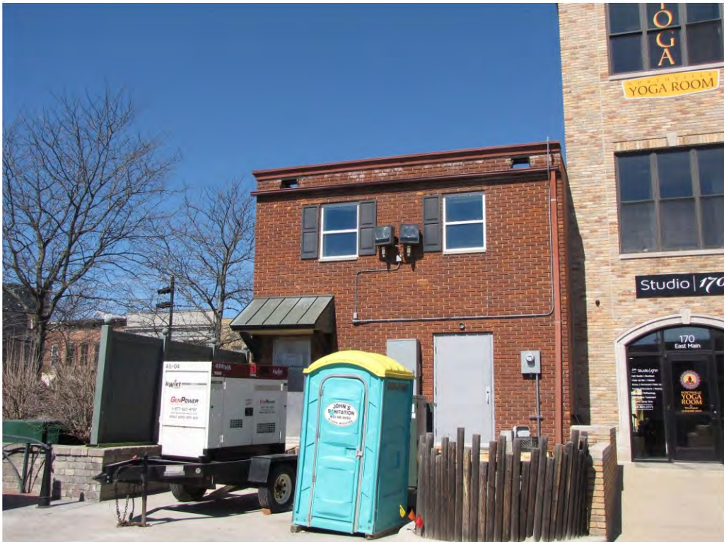
Main East 160_Looking North