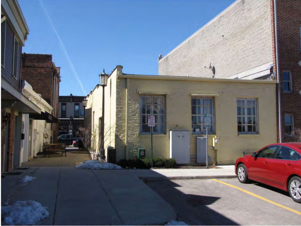
Center North 120_Looking West