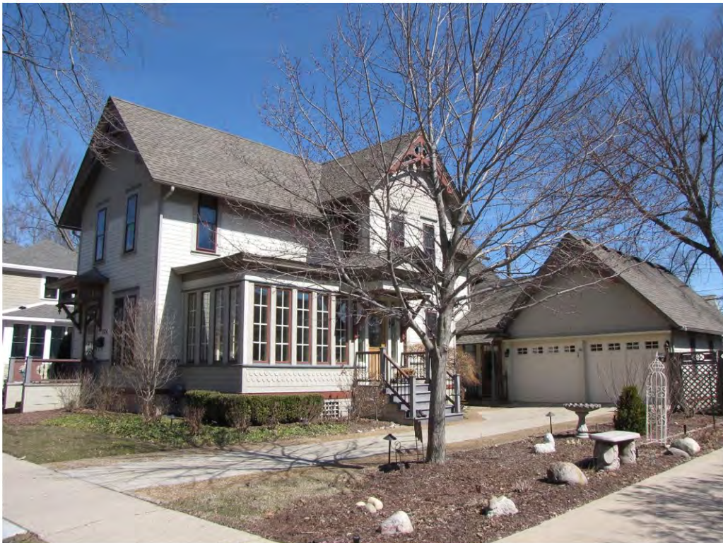
High 124-Looking Northeast