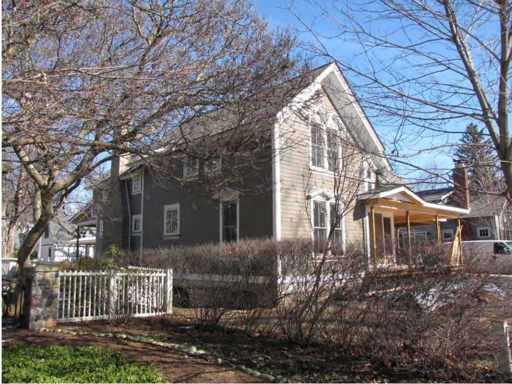
Dunlap West 528_Looking Northeast