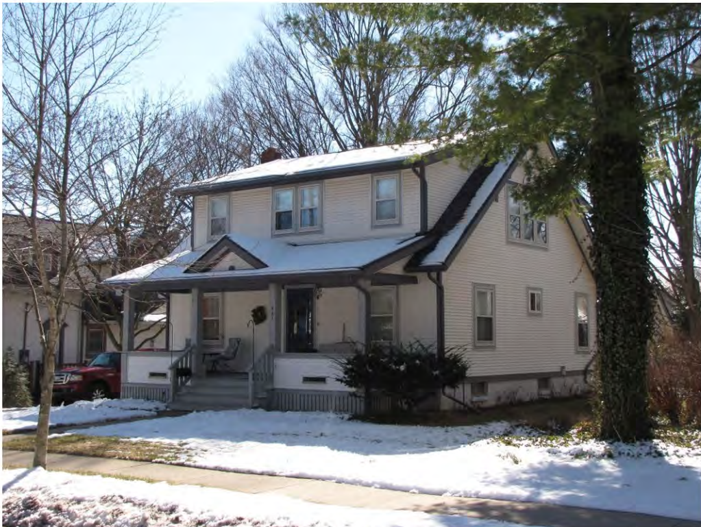
Dubuar 421_Looking Southeast