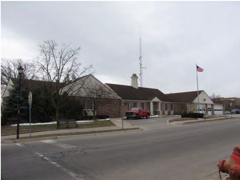
Main West 215_Looking Southwest