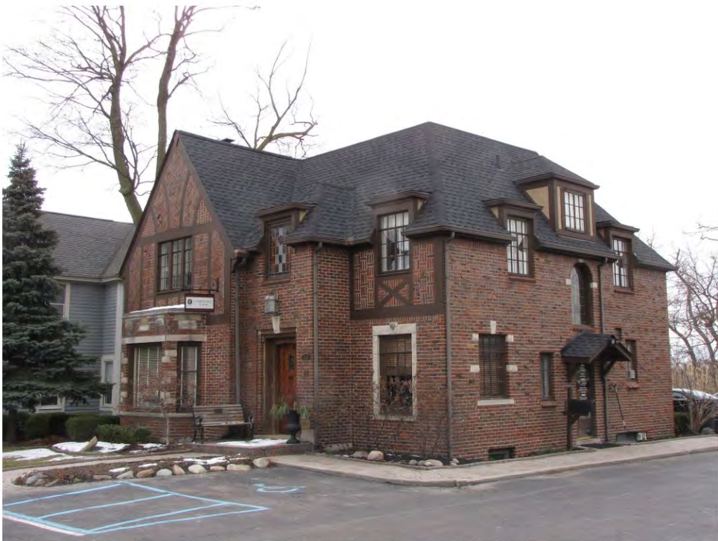
Main East 324_Looking Southeast