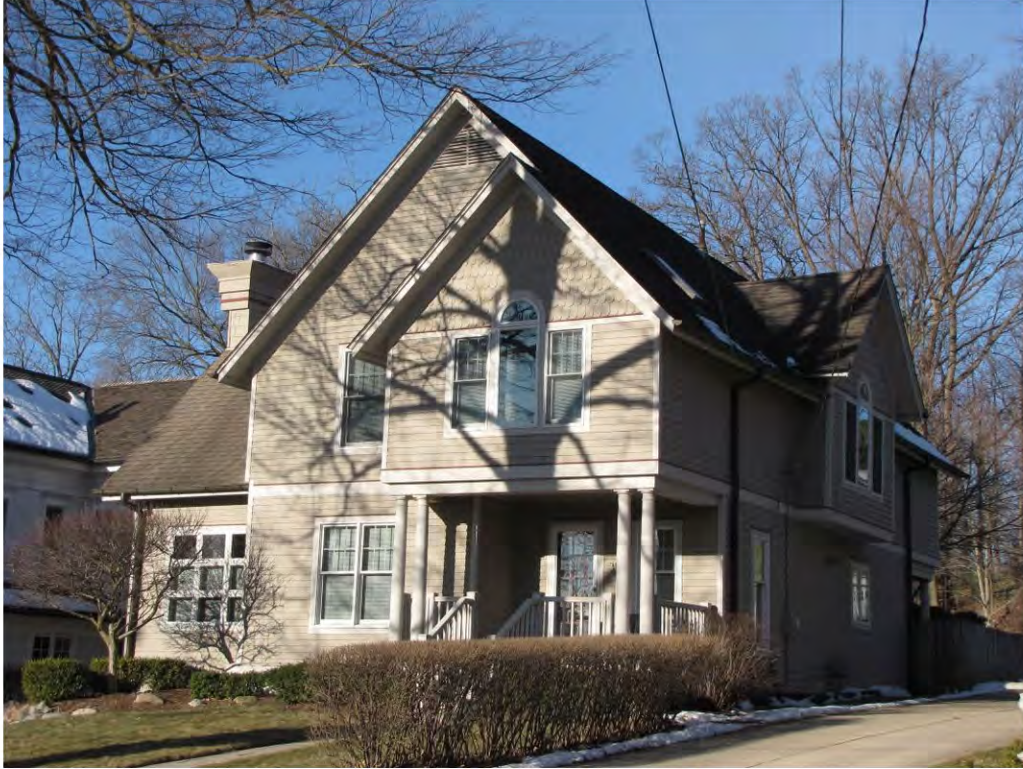
Rogers North 353_Looking Southwest