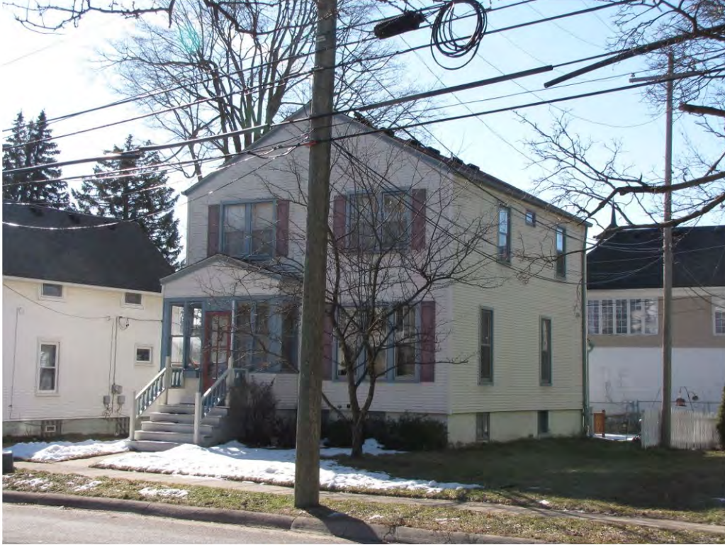
Randolph 119_Looking Southeast