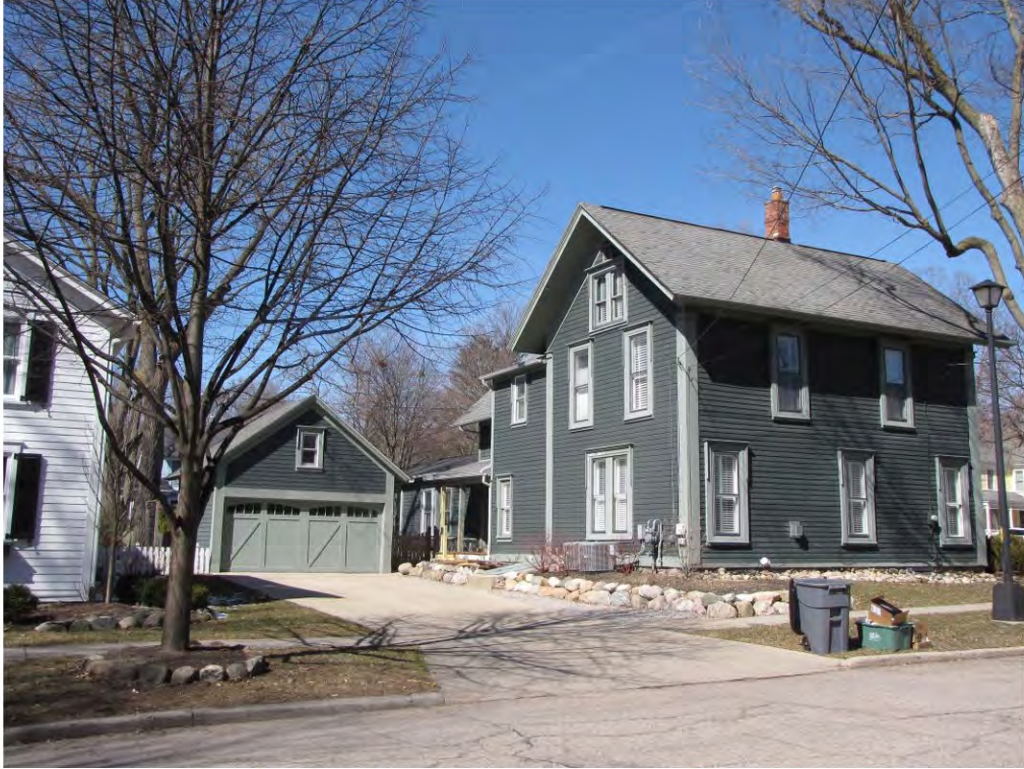
Dunlap West 401_Looking Northwest