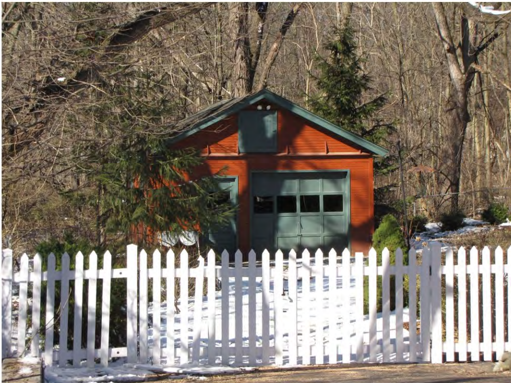
Rogers North 201,Garage_Looking West