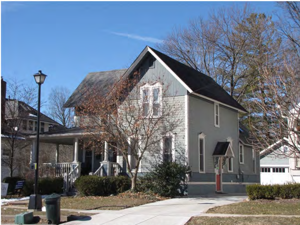
High 229_Looking Southwest