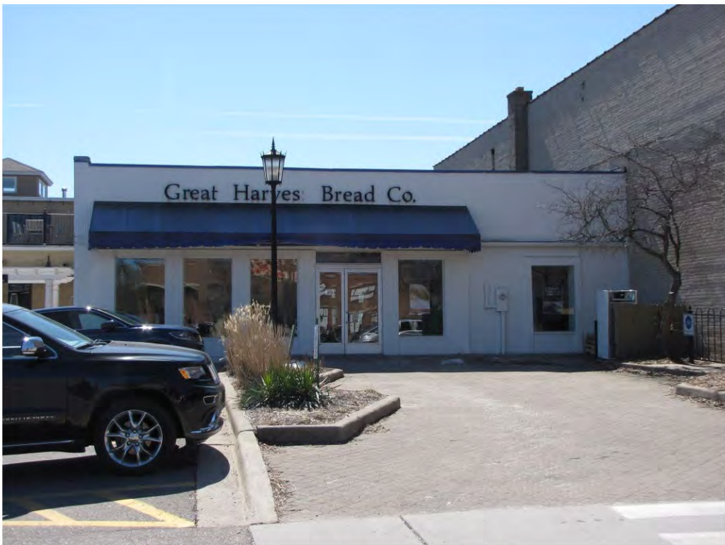
Main East 139_Looking South