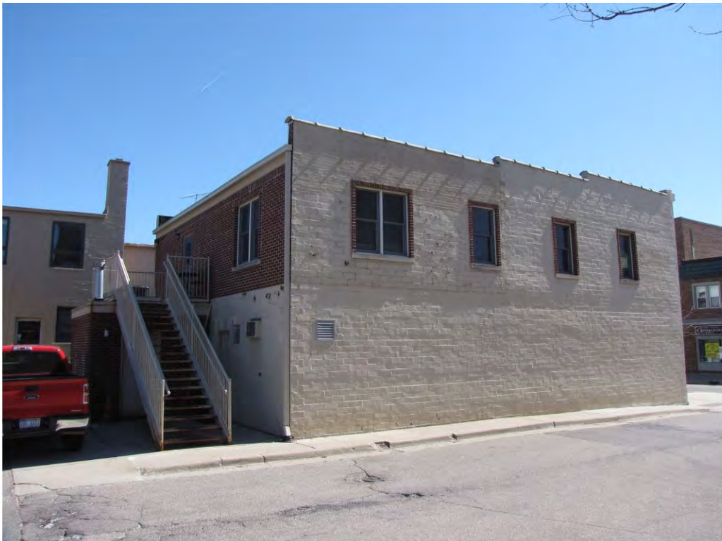
Main West 108-112_ Looking Southeast