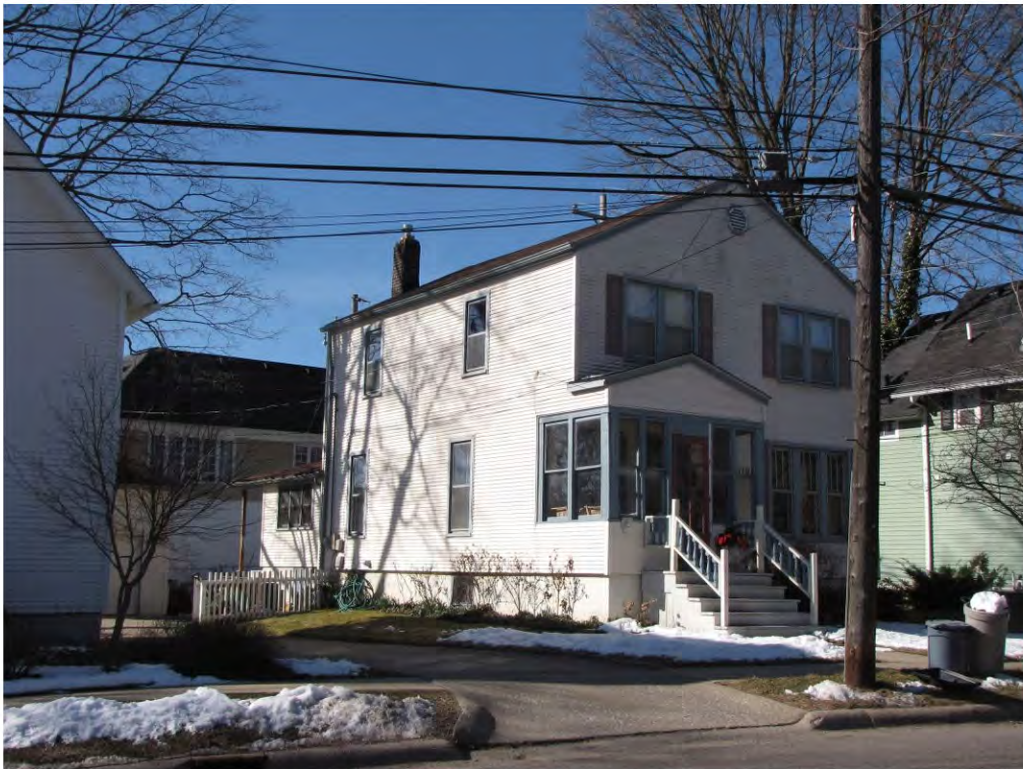
Randolph 119_Looking Southwest