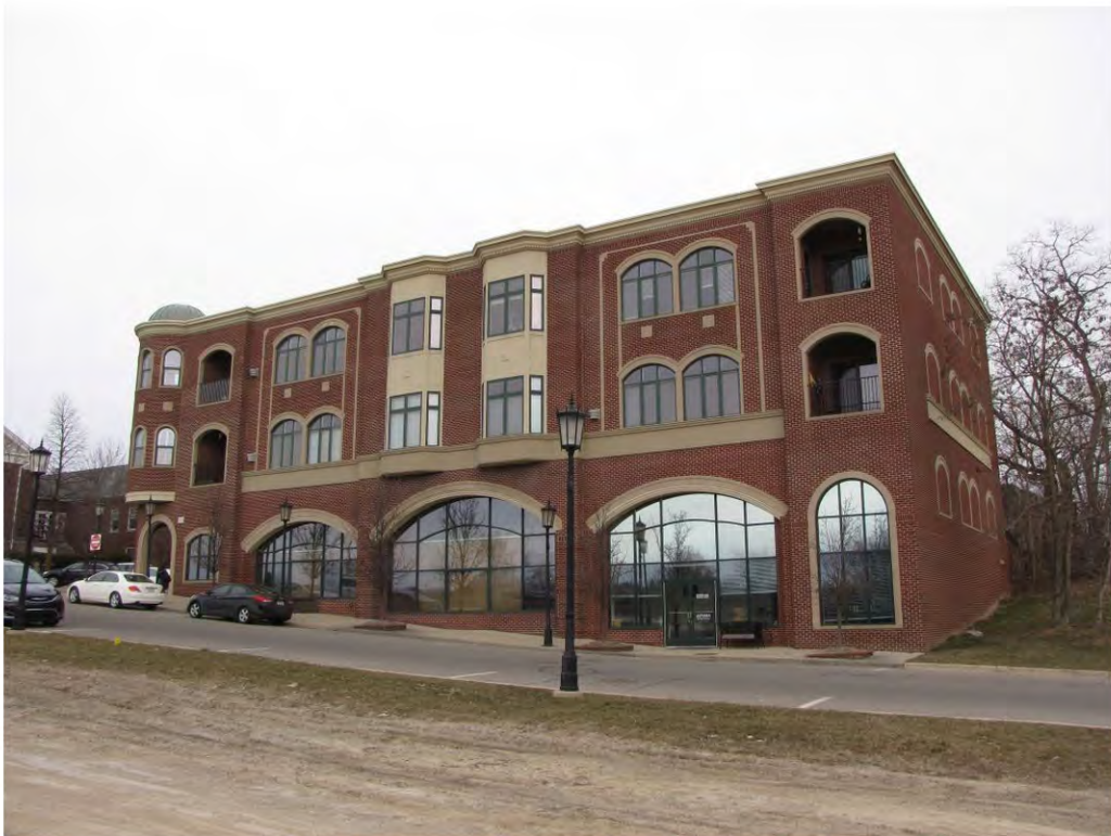
Cady East 300_Looking Northwest