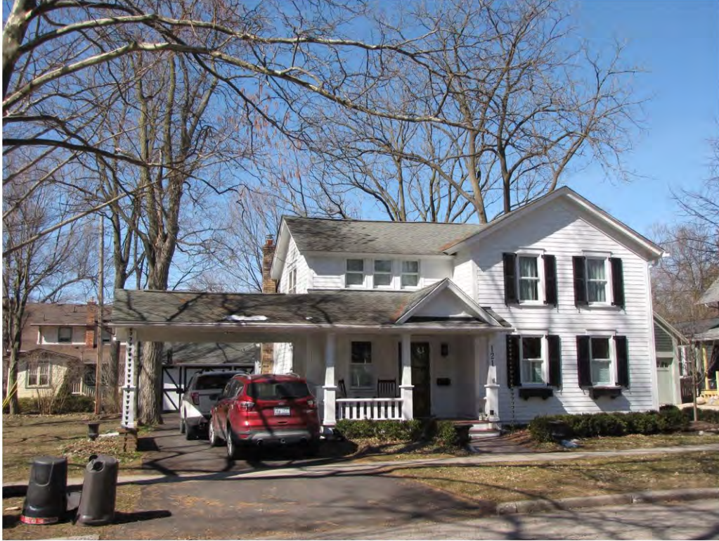
West 121_Looking West