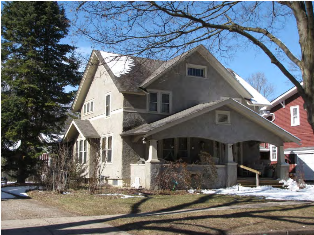
Linden 223_ Looking Northwest