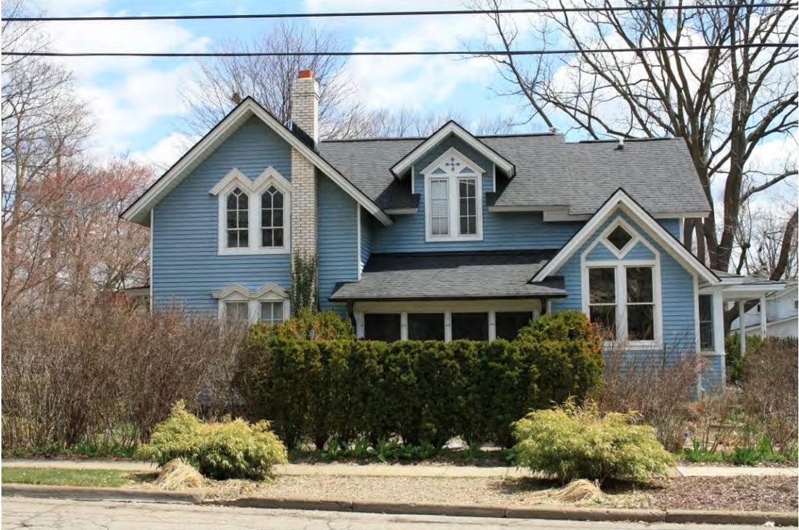
Dunlap West 417_Looking East