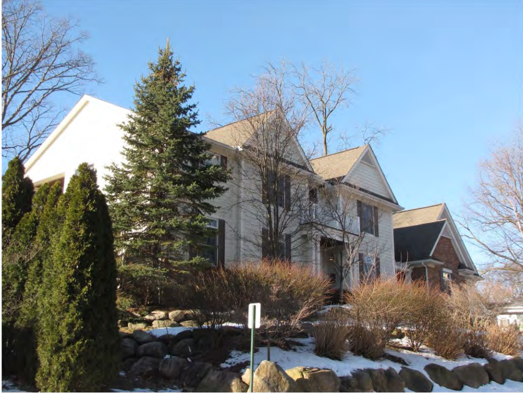
Linden Court 515_Looking Southwest