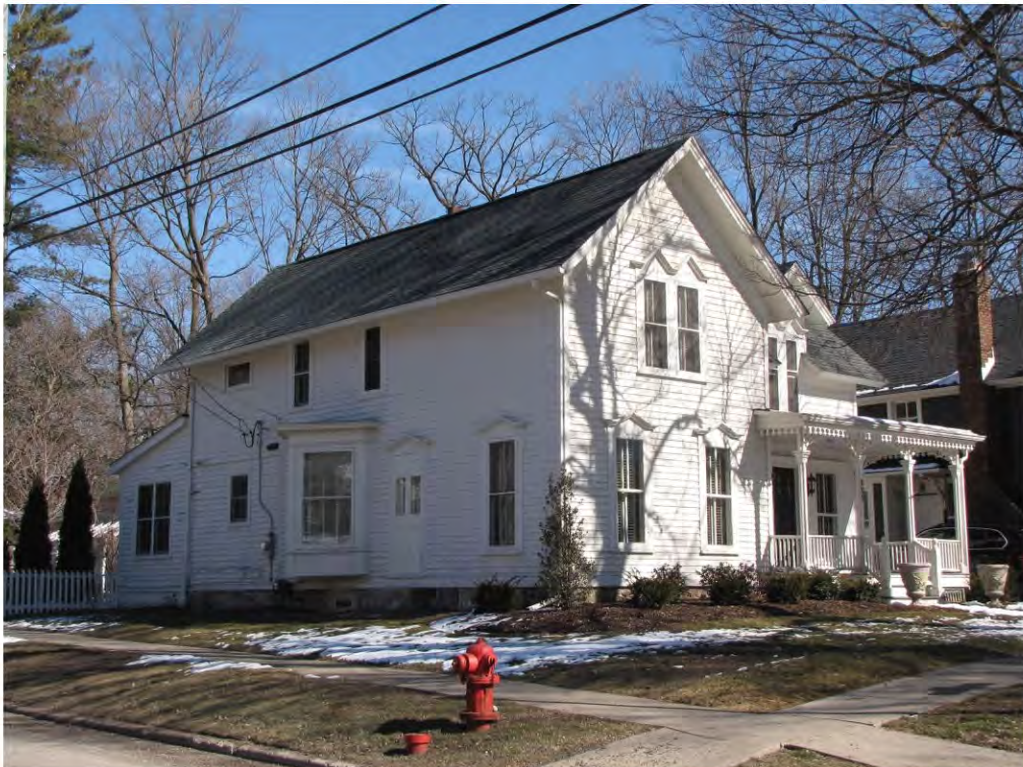
Dunlap West 552_Looking Northeast