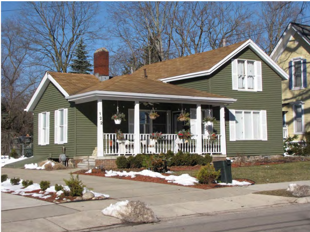
Rogers South 122_Looking Northwest