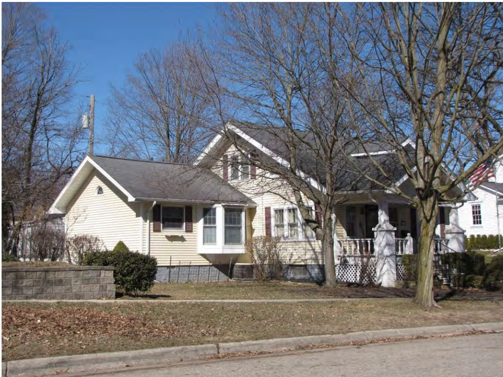
West 231_Looking Northwest