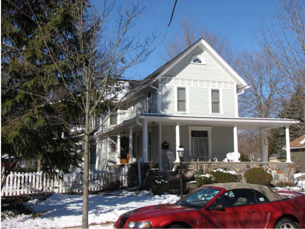
Rogers South 128_Looking Northwest