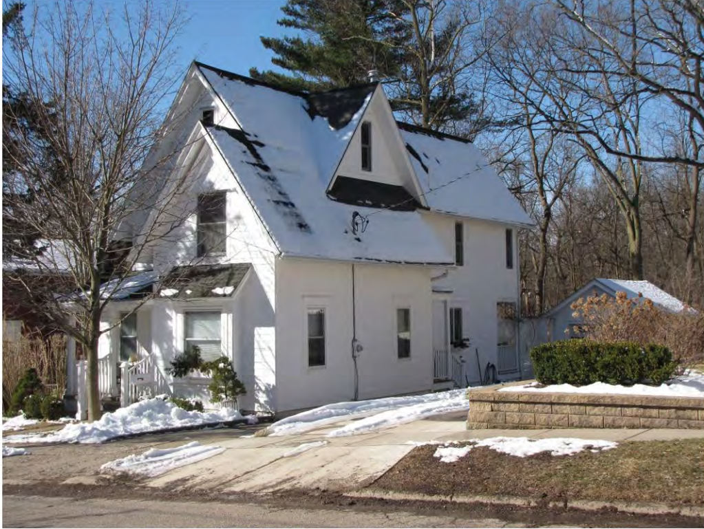
Rogers North 207_Looking Southwest