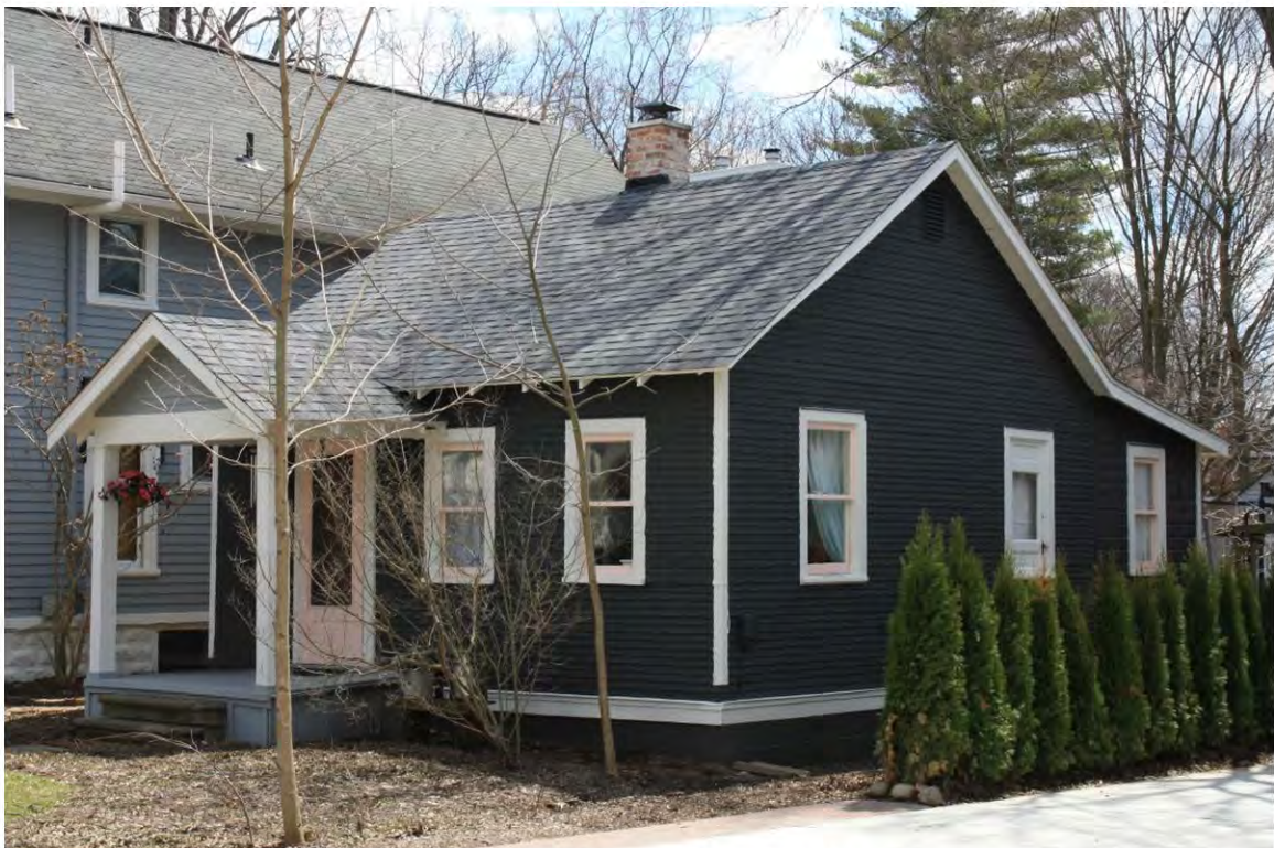
Main West 523_Looking Southeast