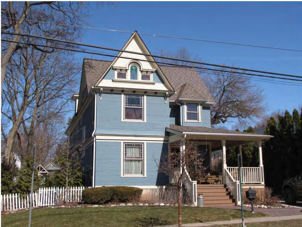
Main West 530_Looking North