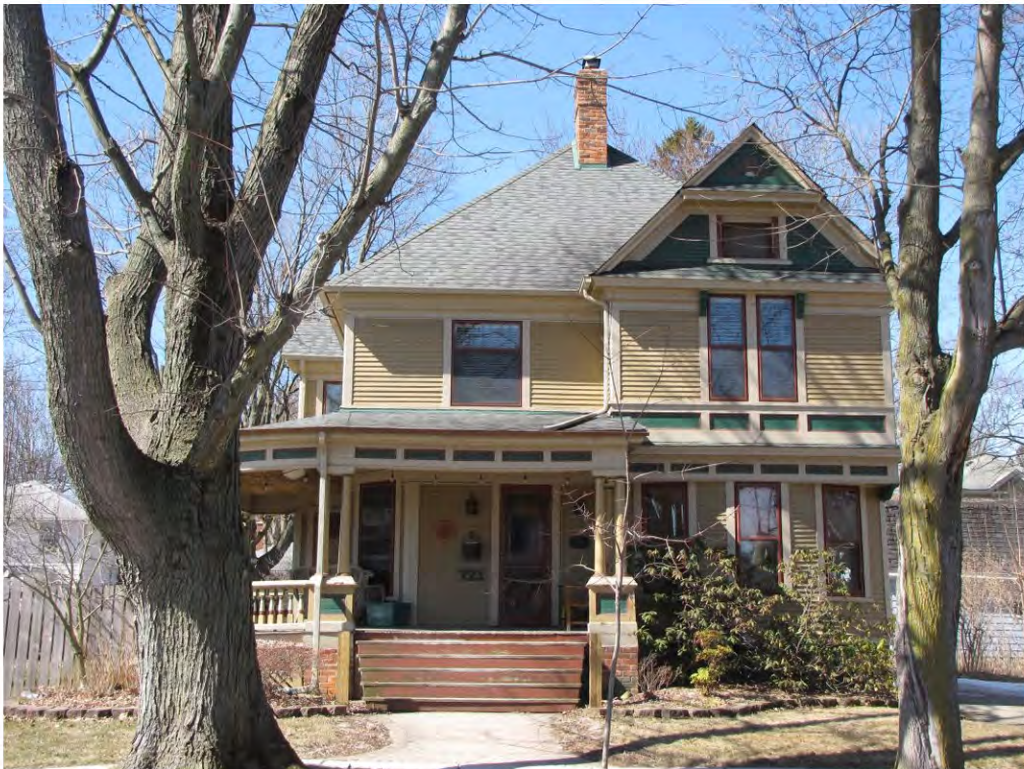
High 121_Looking West