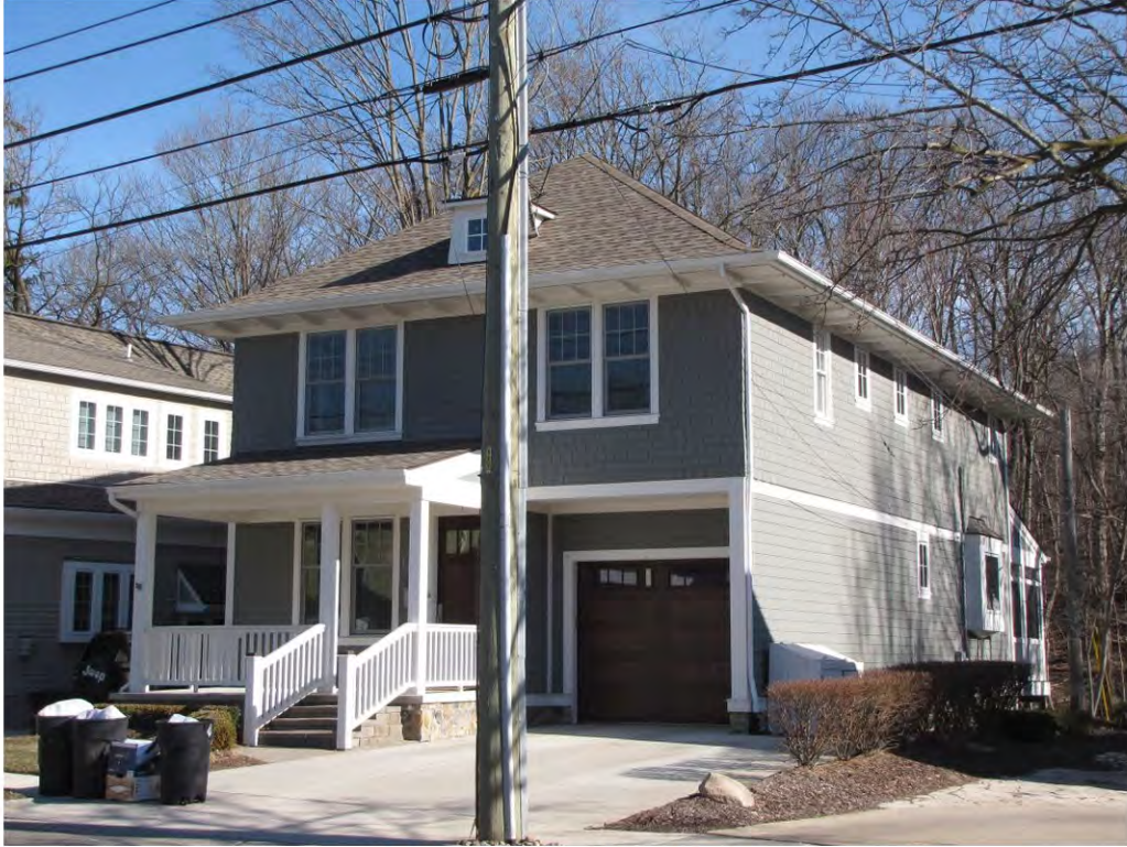
Randolph 412_Looking Northwest