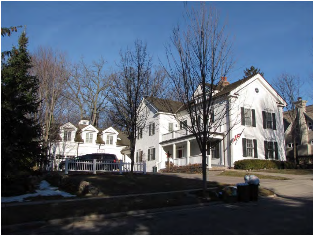
Rogers North 343_Looking Northwest