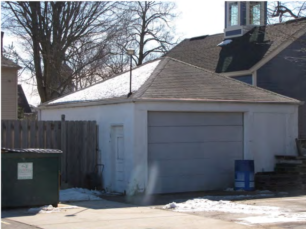
Wing North 217, Garage_Looking Southeast