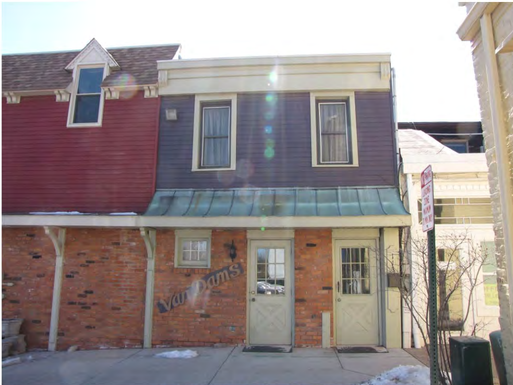
Main East 111_Looking South