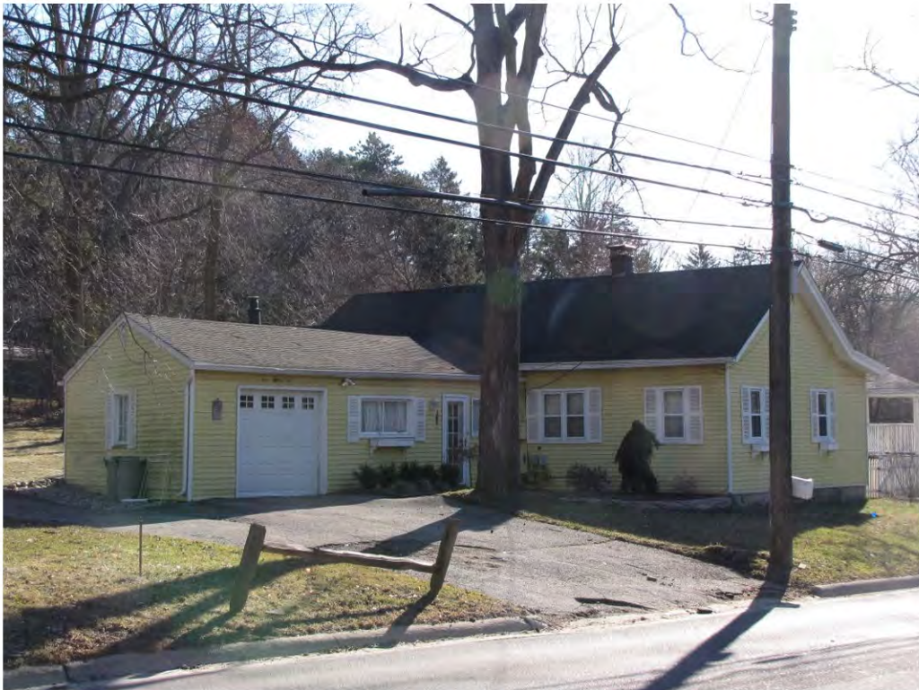
Randolph 588_looking Northeast