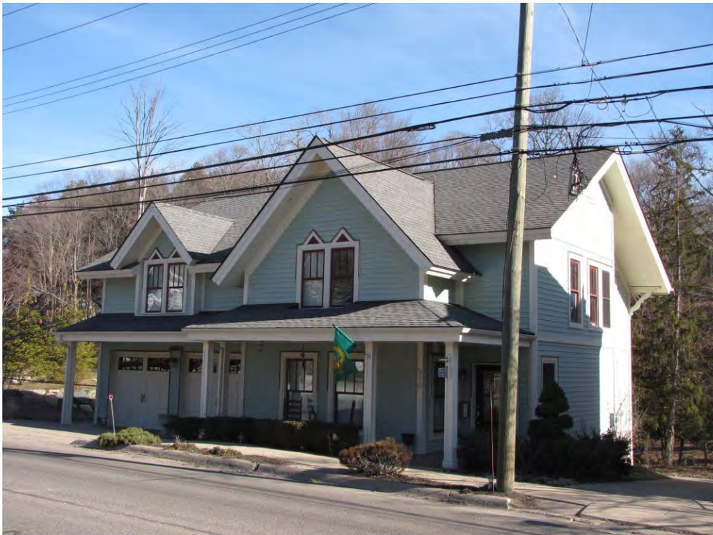
Randolph 516_Looking Northwest