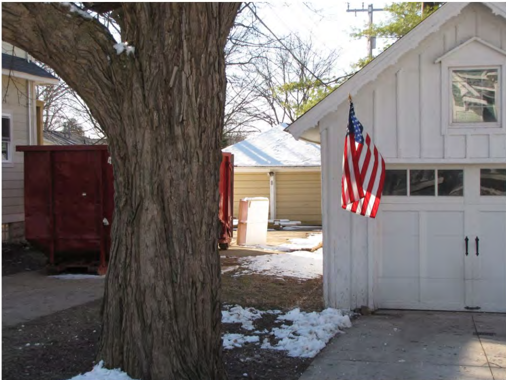
Cady West 511, Garage_Looking South