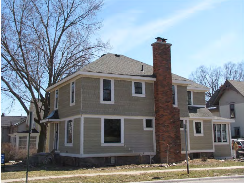
Dunlap West 217_Looking Southeast