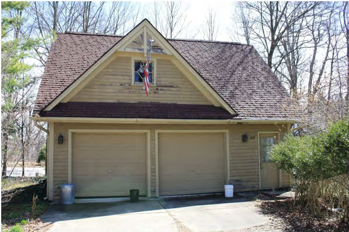
High 320, Garage_Looking East