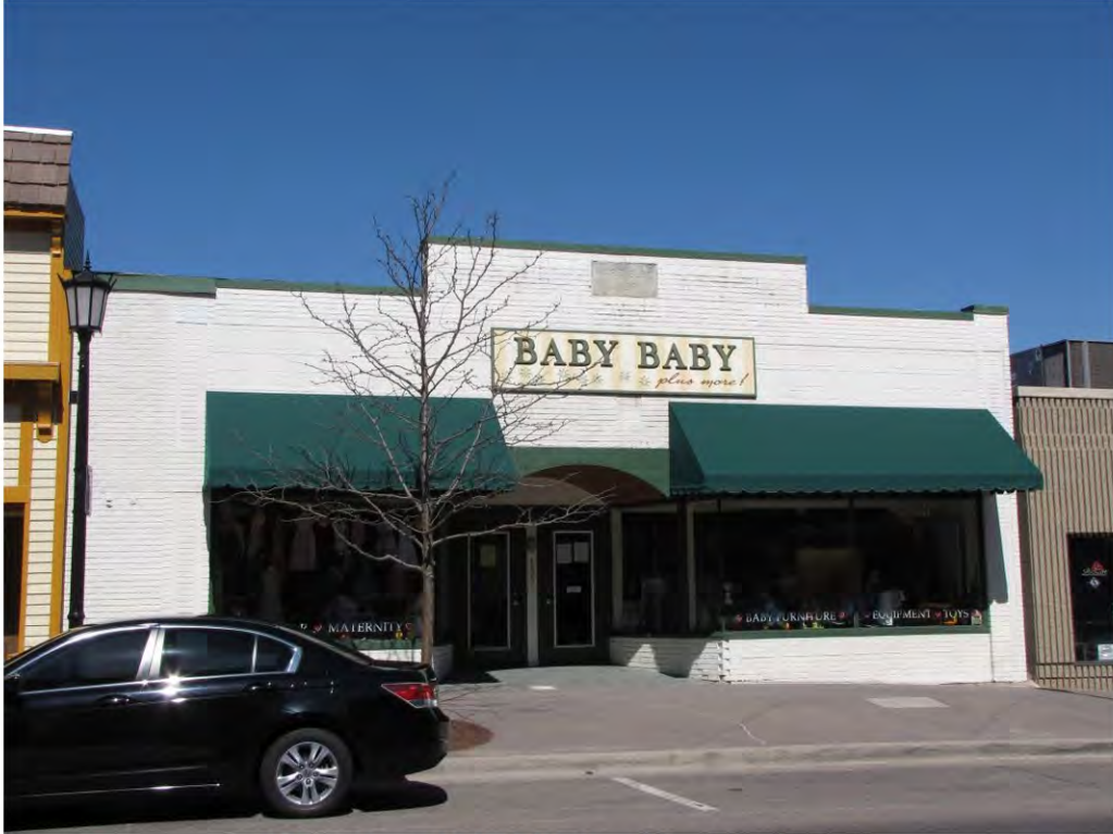
Main East 151- 153_ Looking Northeast