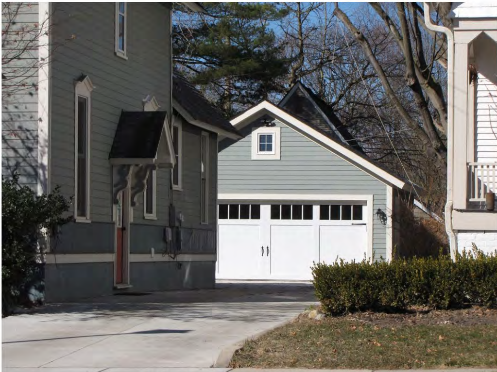
High 229, Garage_Looking West