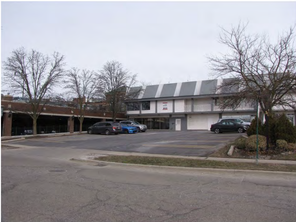
Cady East 131_Looking Northwest