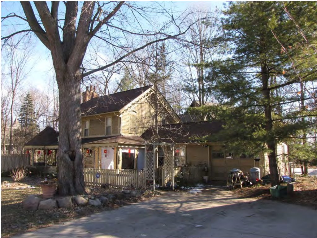
High 320_Looking Northeast