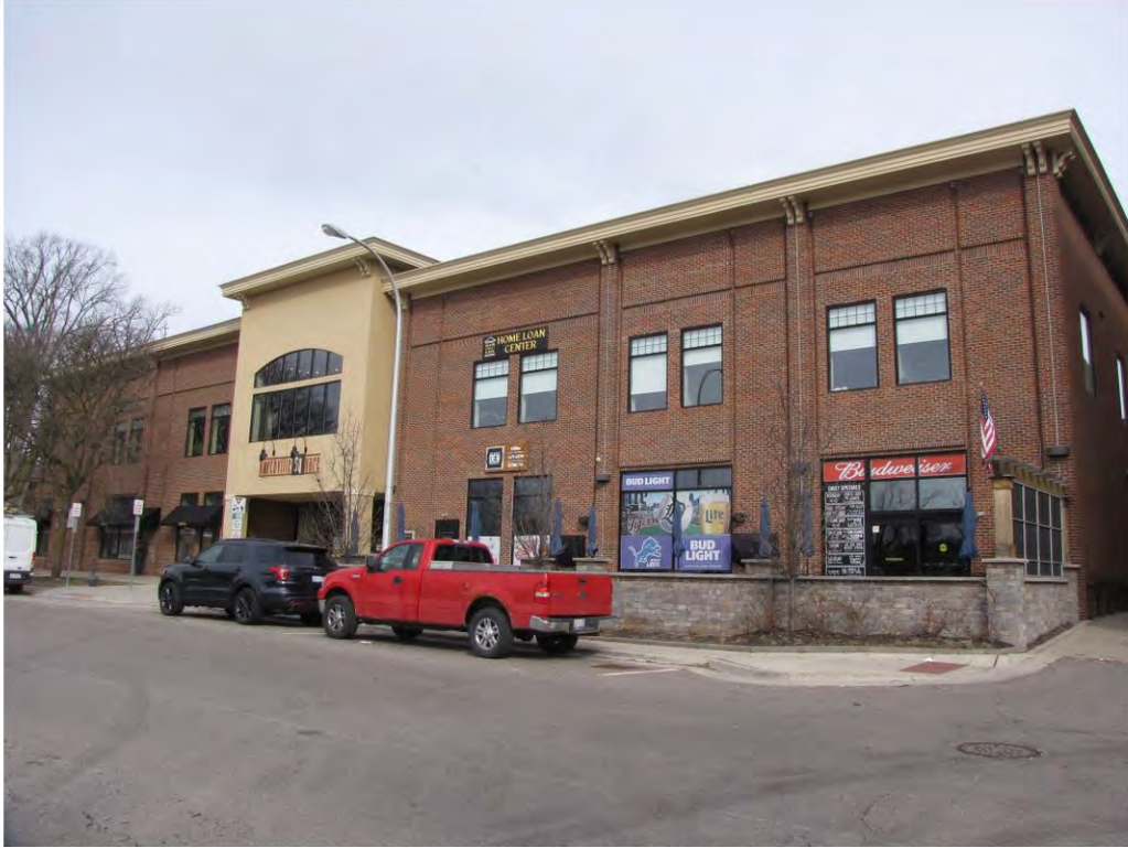
Main West 133_Looking Northwest