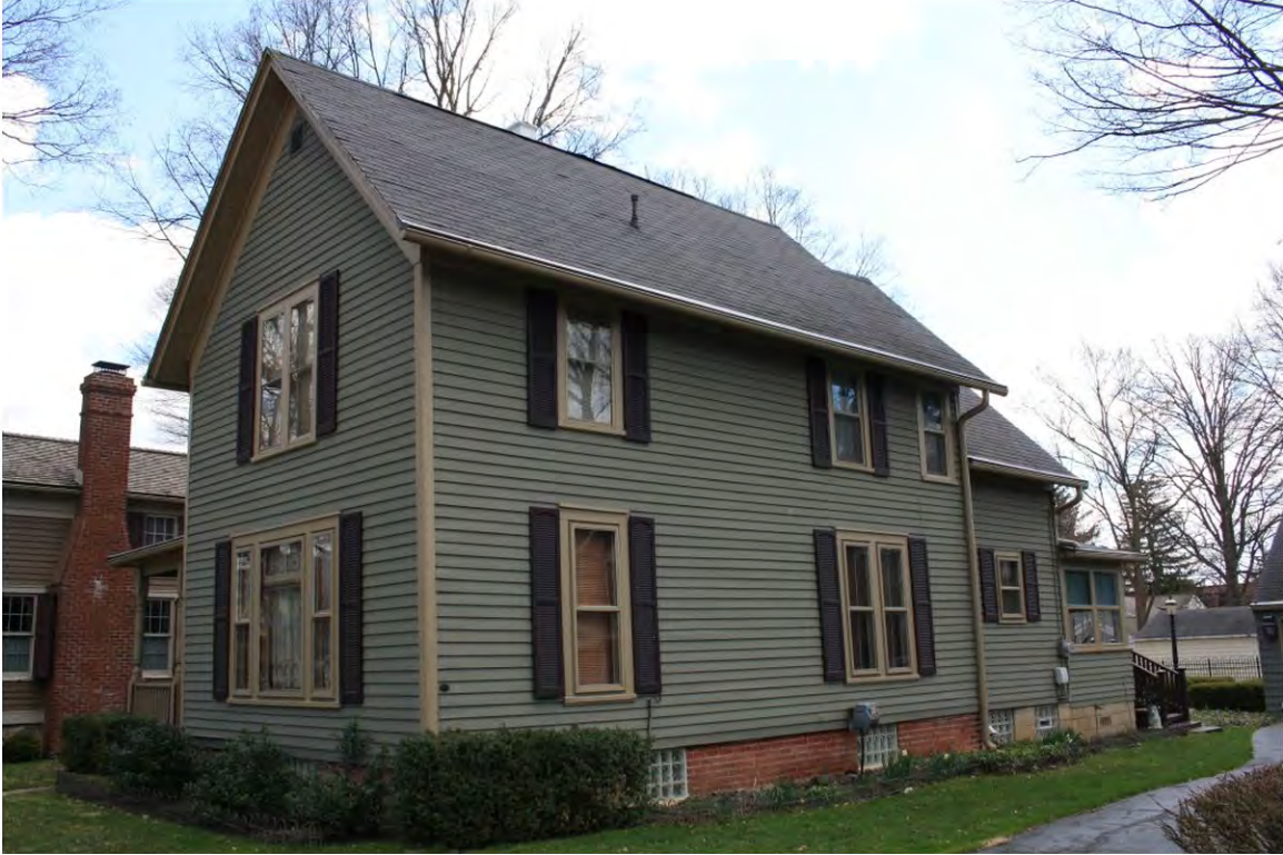
Dunlap West 515_Looking Southeast