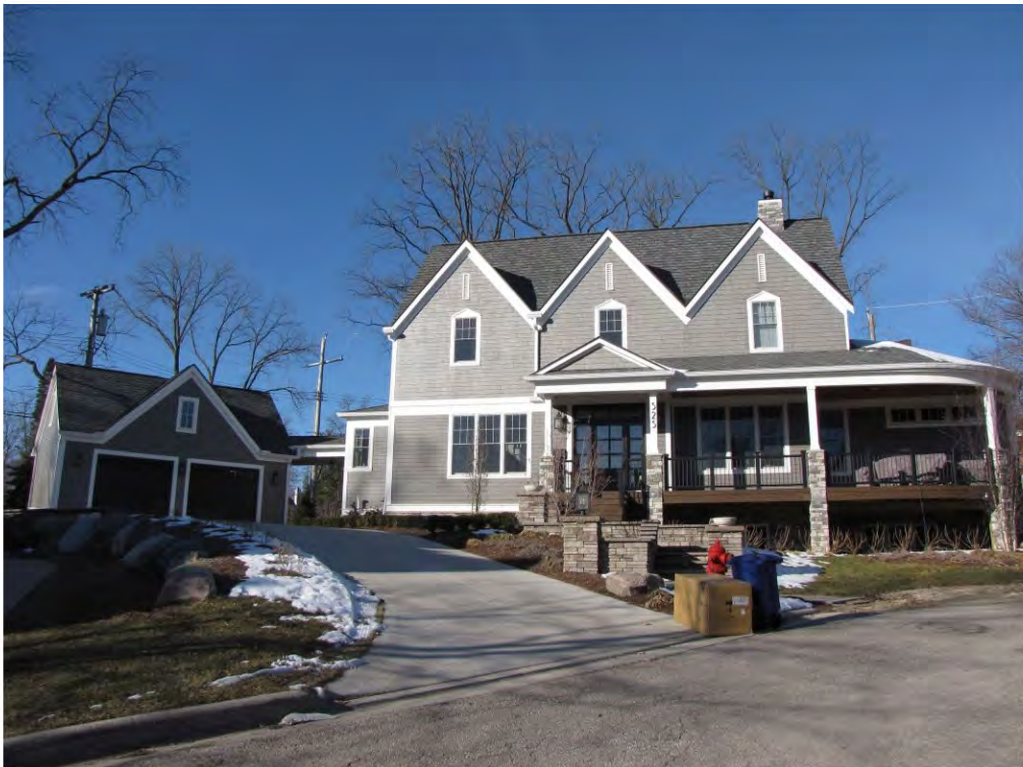
Linden Court 525_Looking Southwest