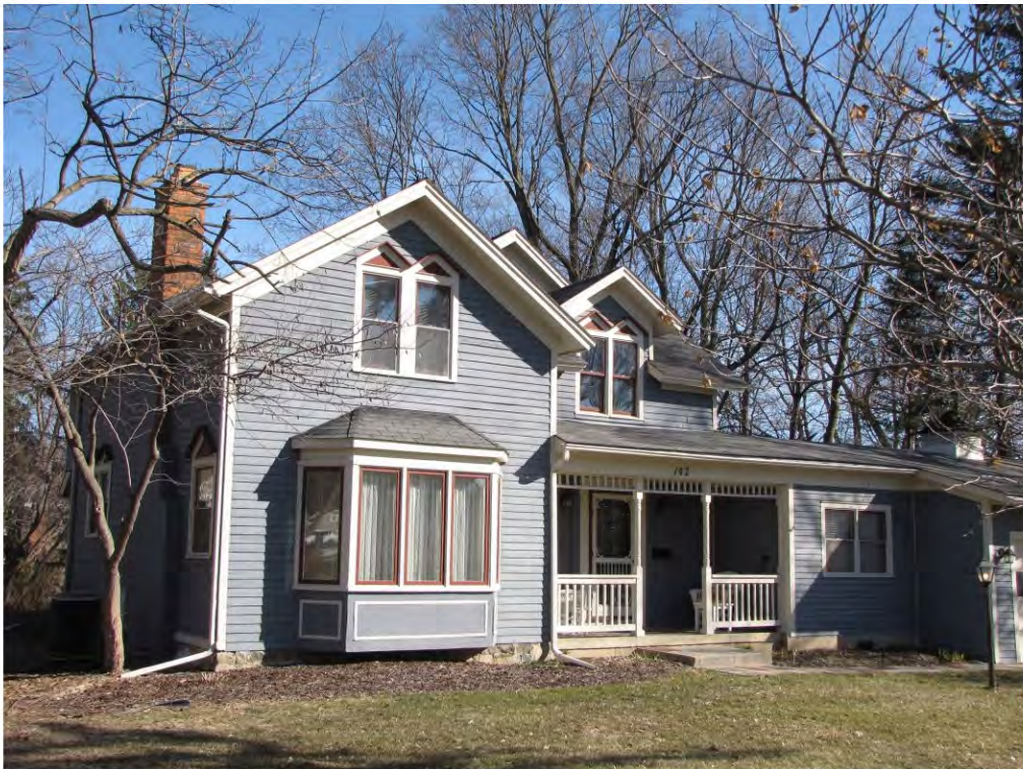
Randolph 142_Looking Northeast