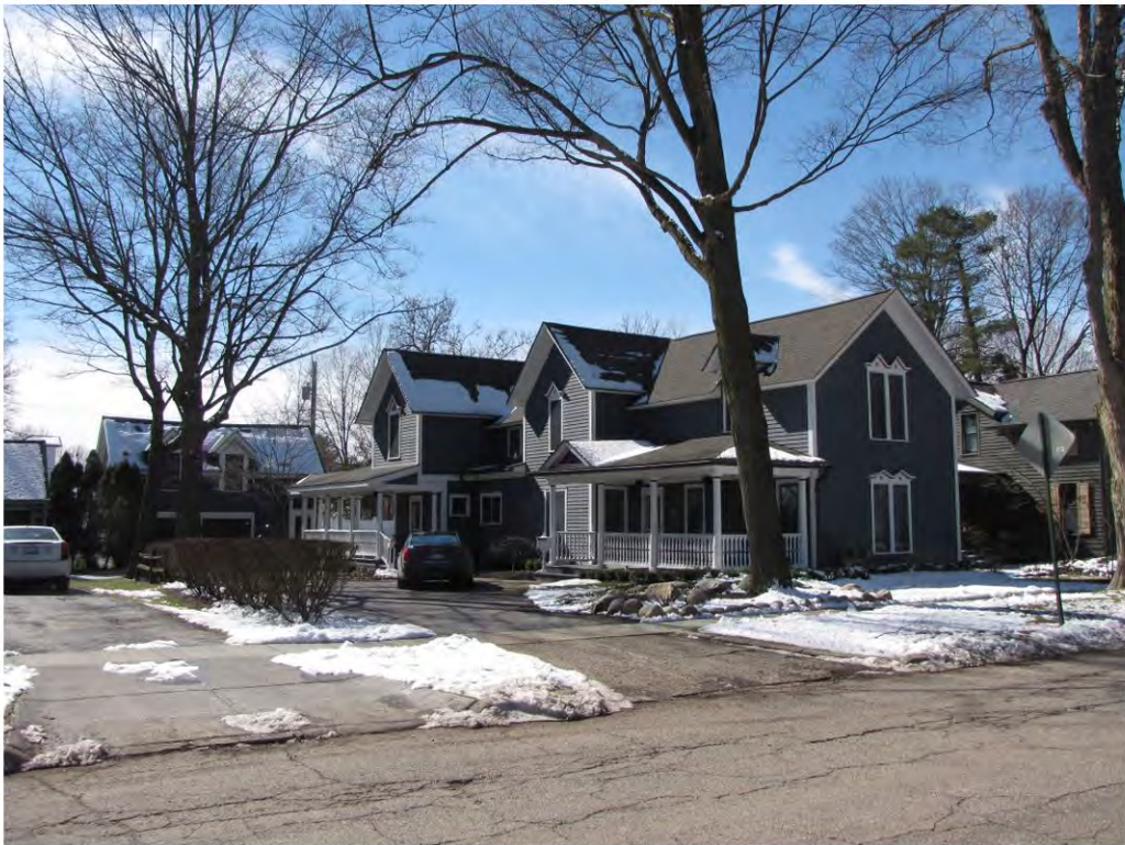
Dunlap West 523_Looking Southwest