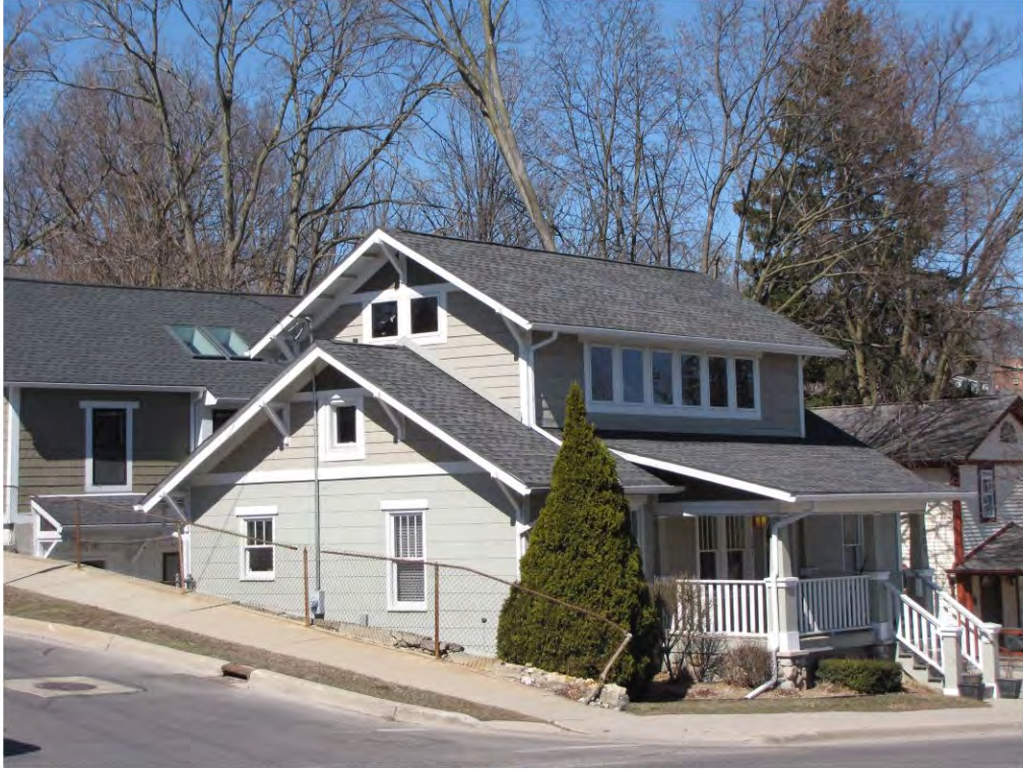
Center North 301_Looking Northwest