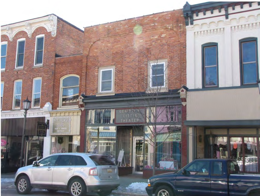
Main East 112_Looking Southeast