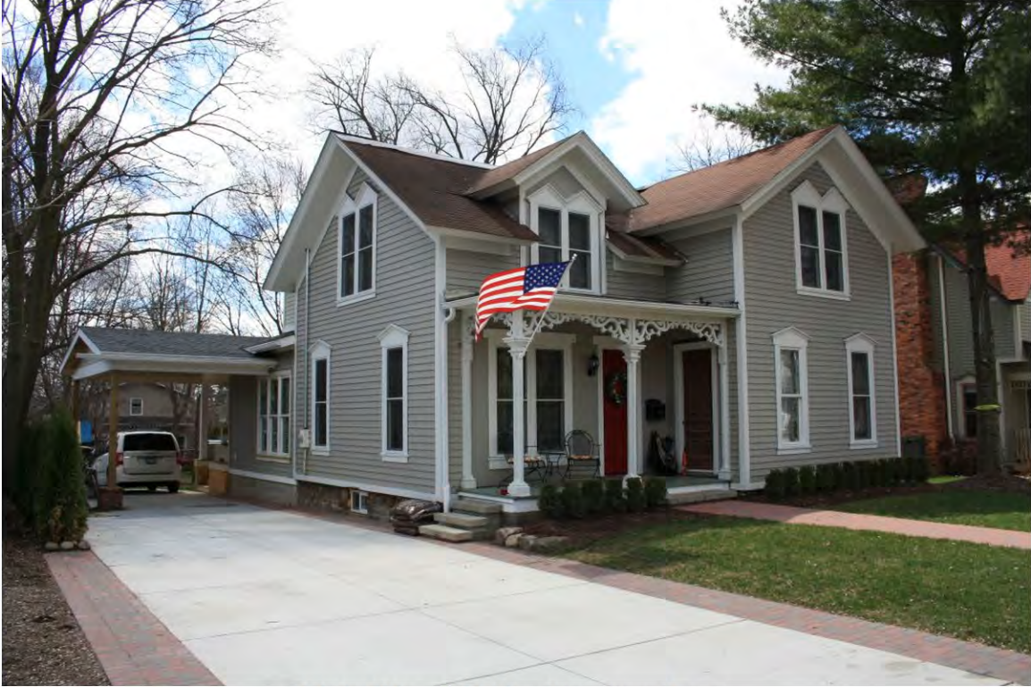
Main West 531_Looking Southwest