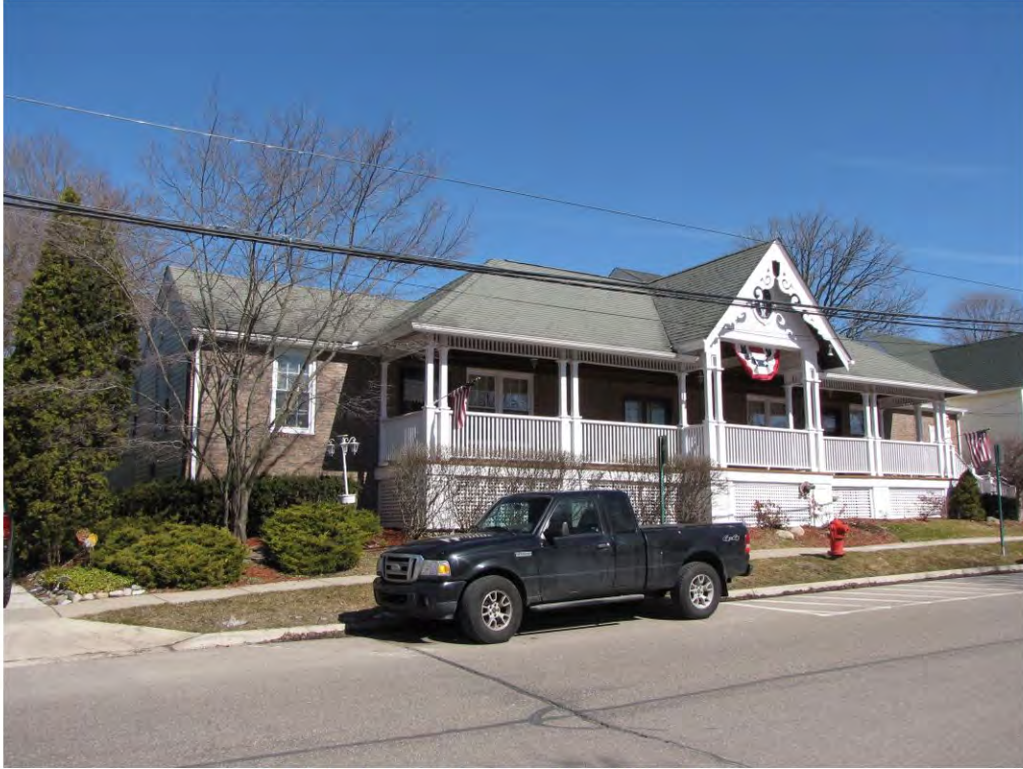
Main West 520_Looking Northeast