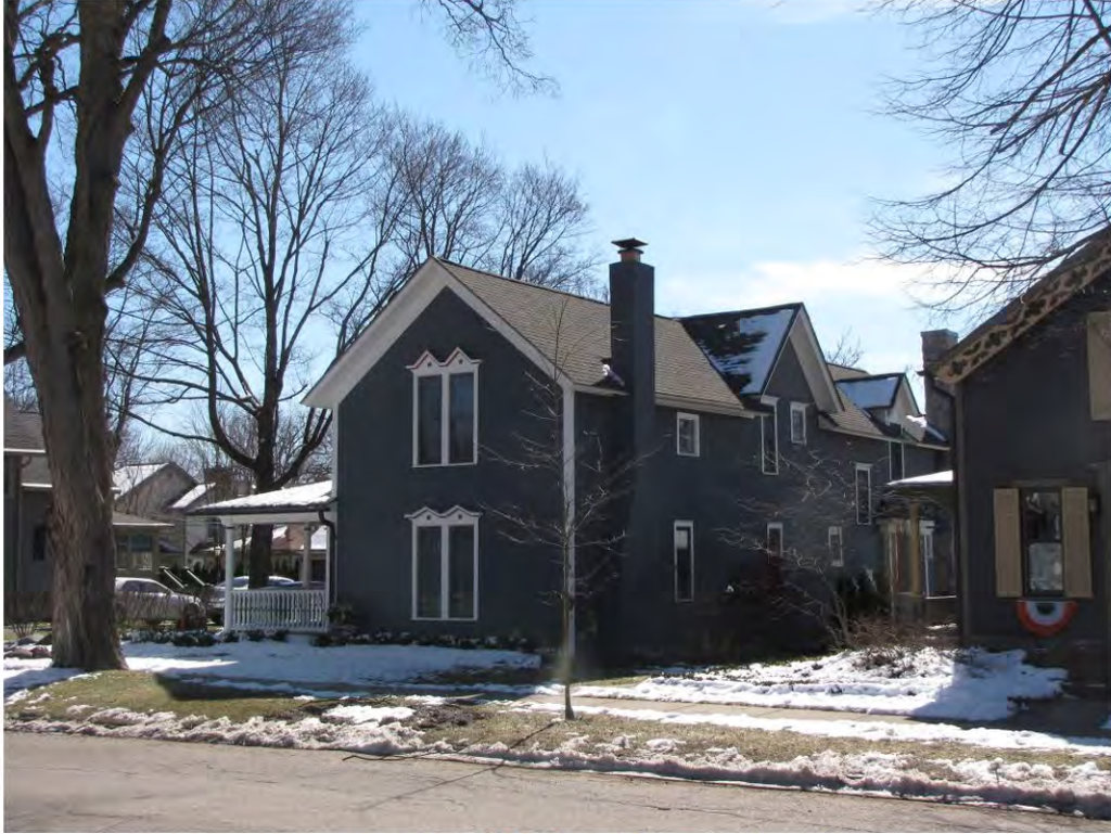
Dunlap West 523_Looking Southeast