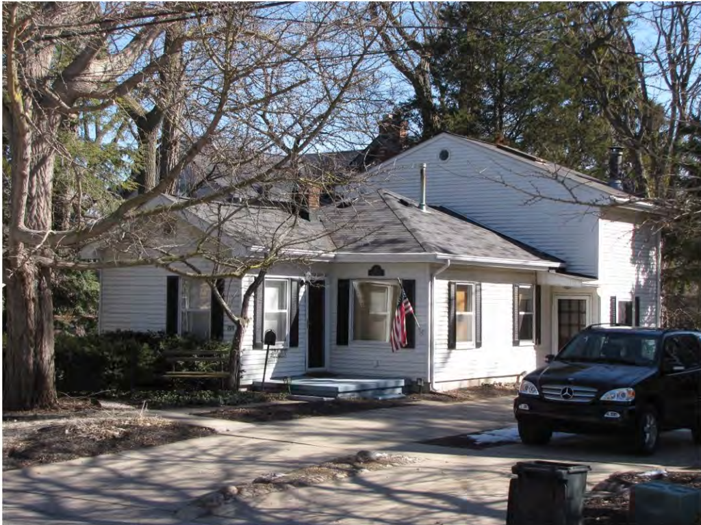
West 236_Looking East