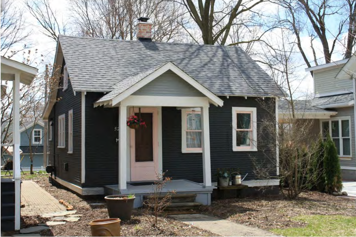
Main West 523_Looking Southwest