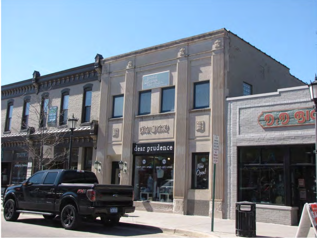
Center North 119_Looking Southwest