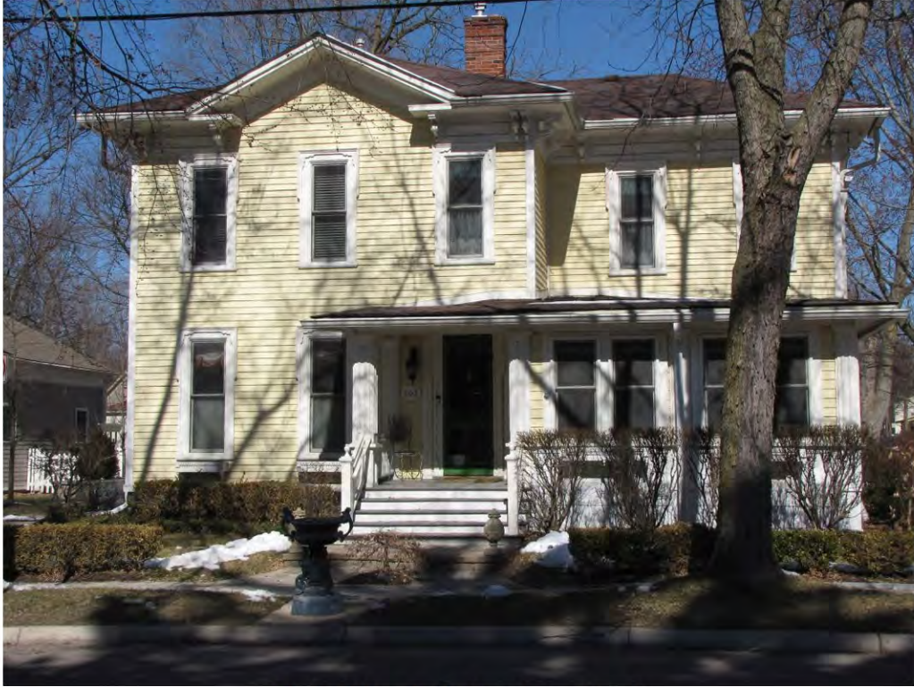
Main West 502_Looking North