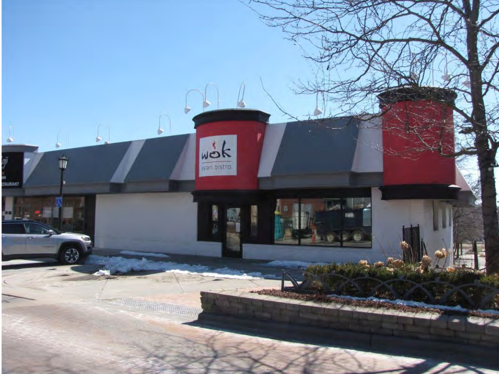
Cady East 131_Looking Southeast