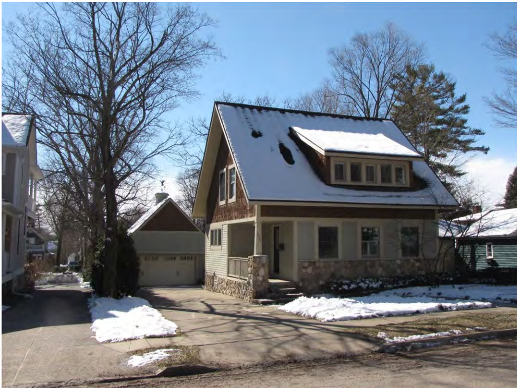
Dubuar 439_Looking Southwest