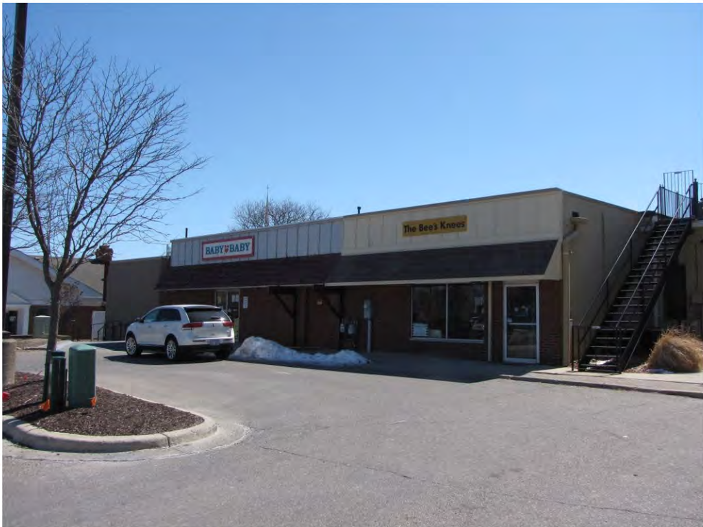
Main East 149_Looking Southwest