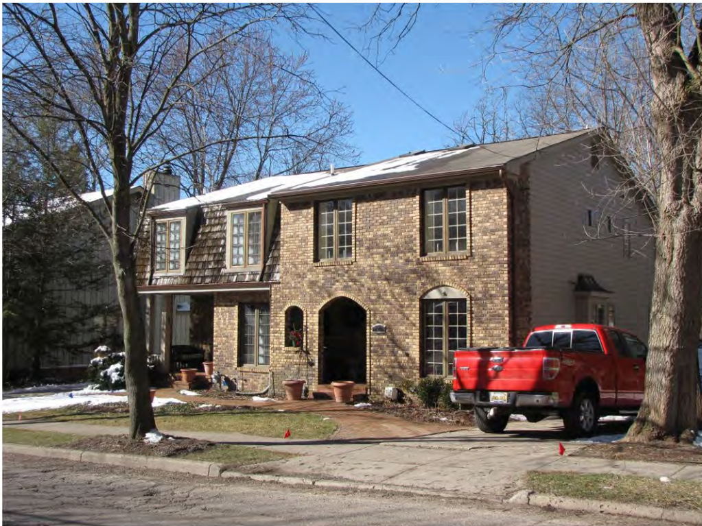
Rogers North 121-125_Looking Southwest