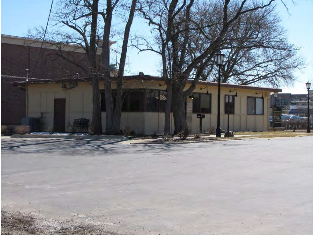
Dunlap East 115_ Looking Southeast