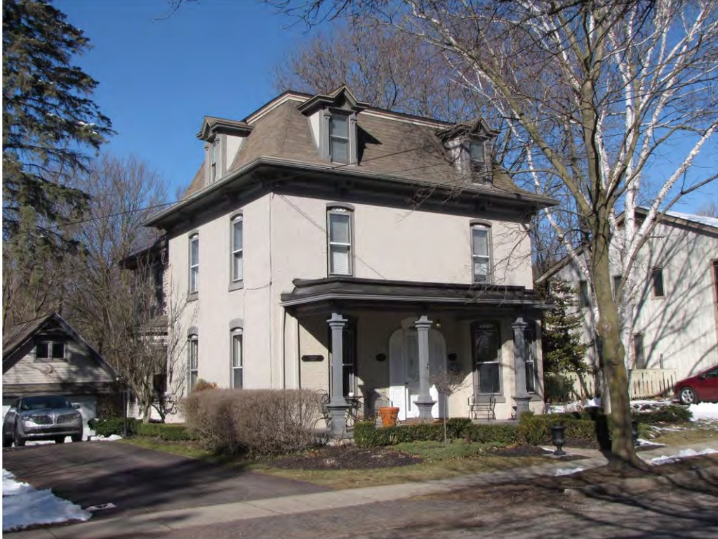
Rogers North 109_Looking Northwest