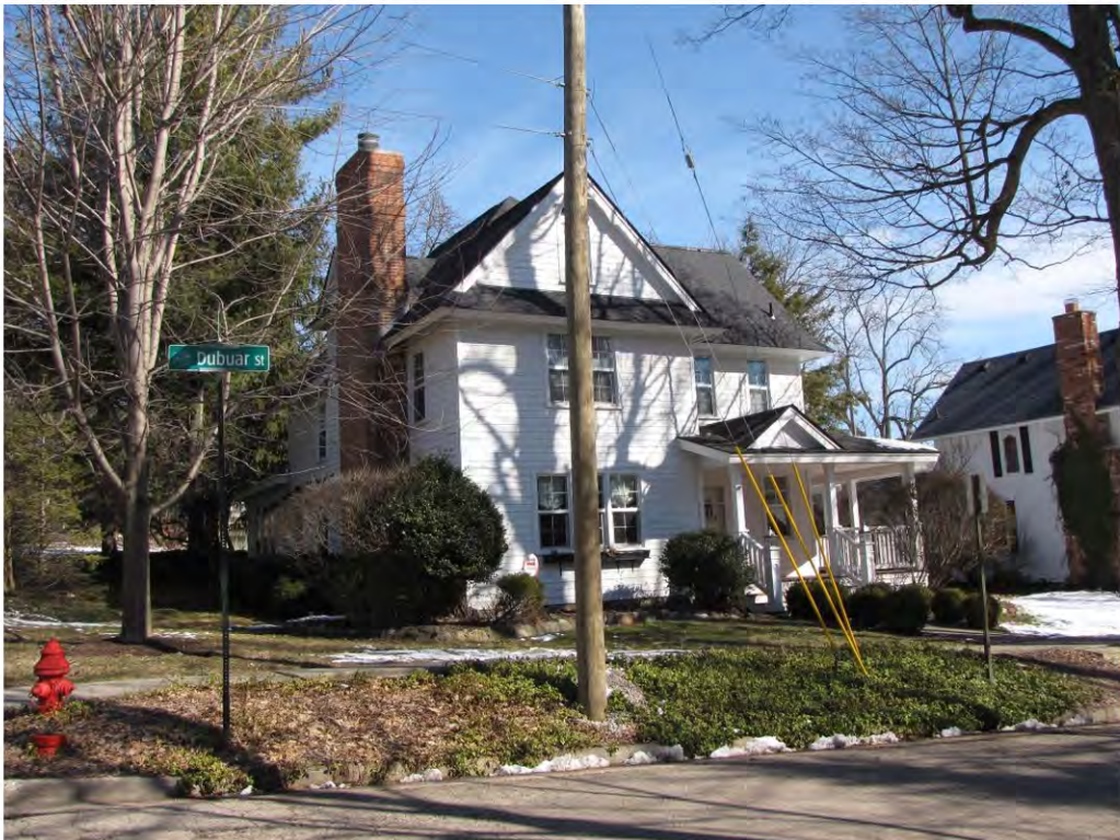
Dubuar 446_Looking Northeast