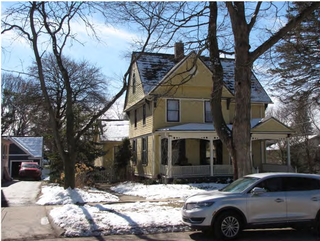
Dunlap West 549_ Looking Southwest