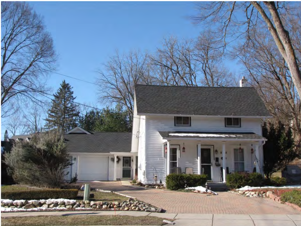
Randolph 529_ Looking South