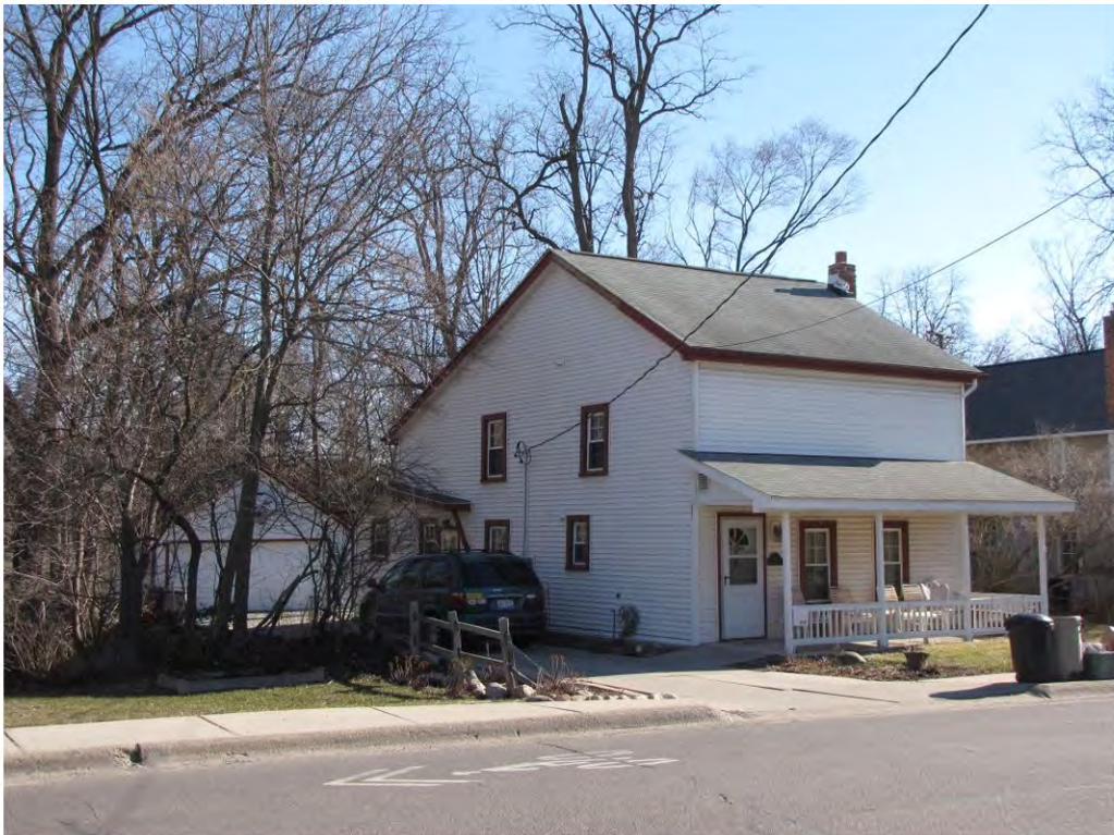
Randolph 318_Looking Northeast