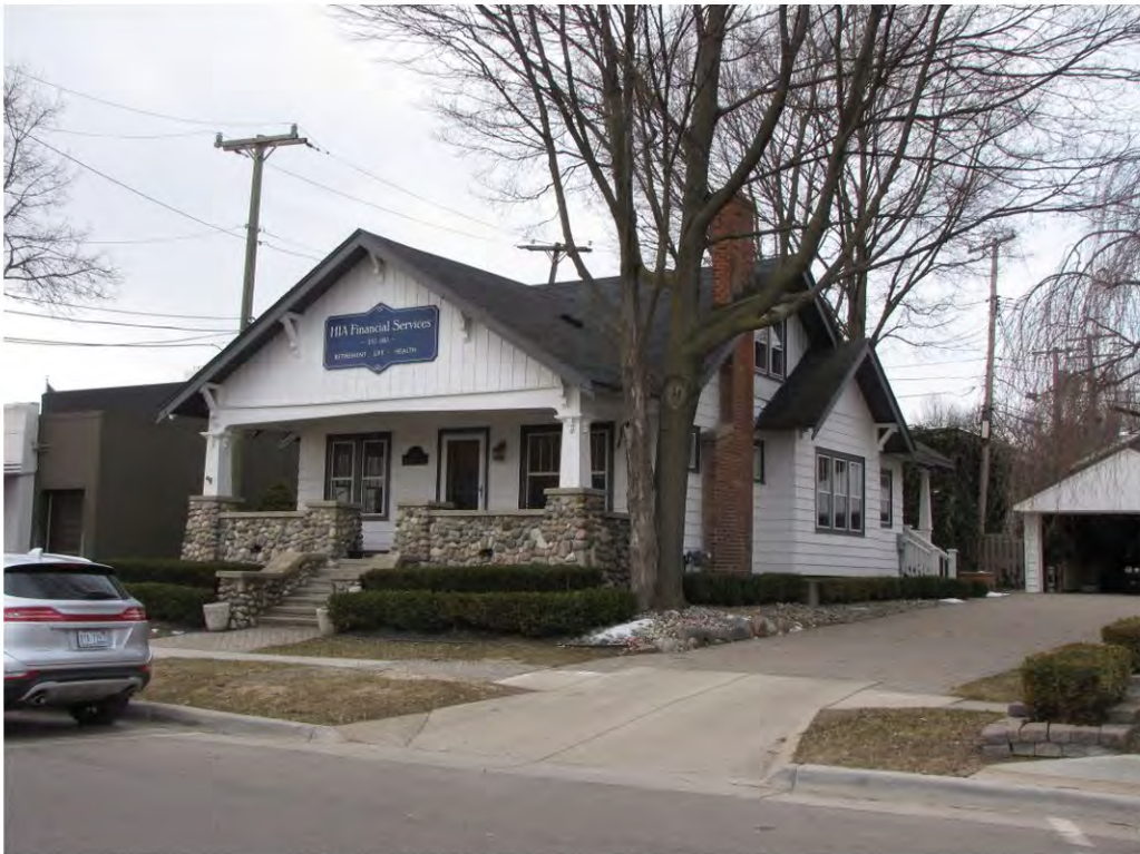
Wing North 111_Looking Southwest