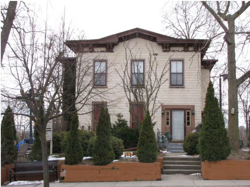
Main East 342_ Looking South