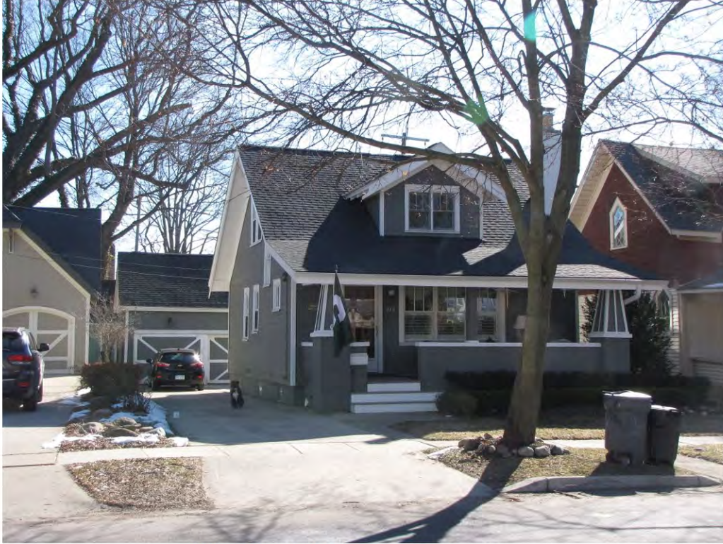
Wing North 214_Looking Southeast