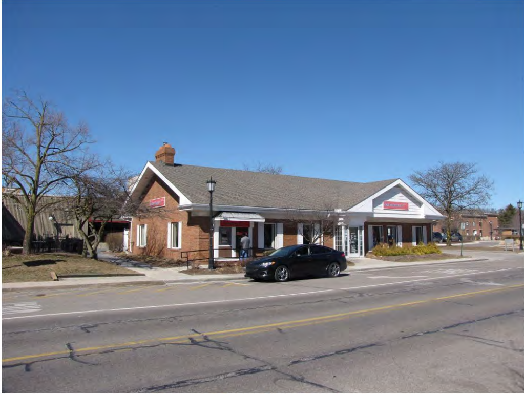
Hutton 127_Looking Northwest