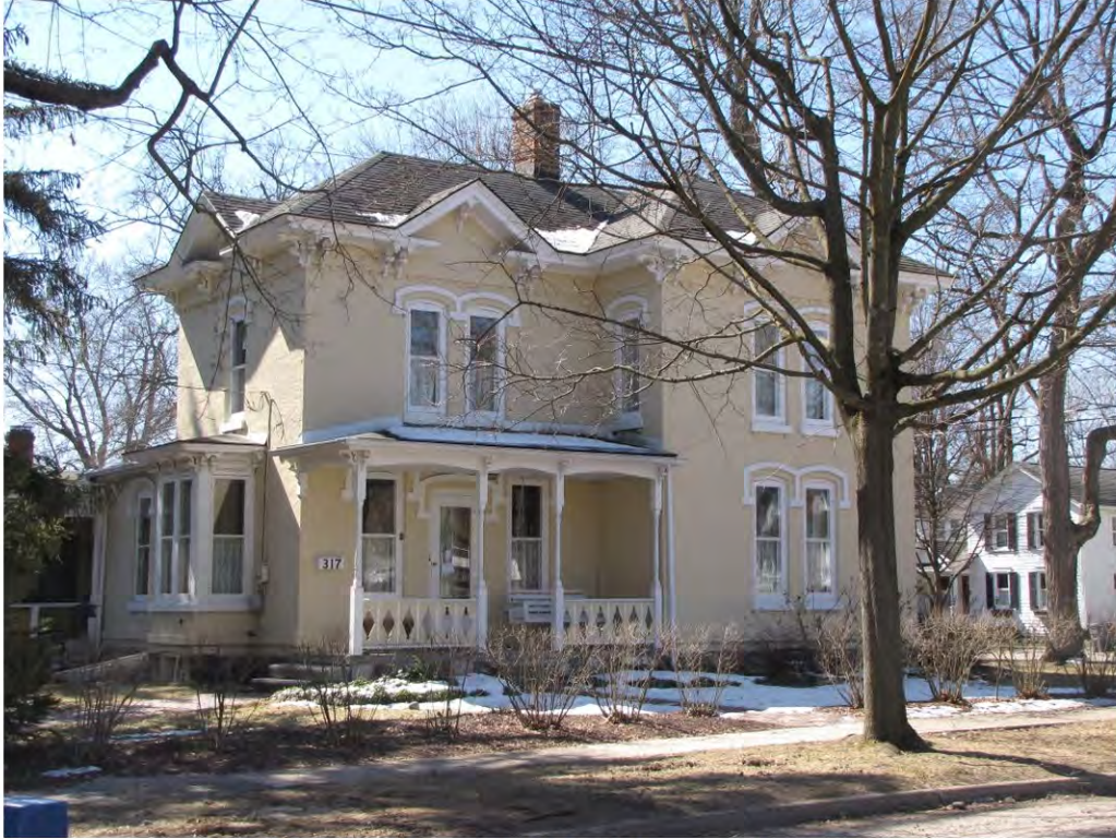
Dunlap West 317_Looking Southwest