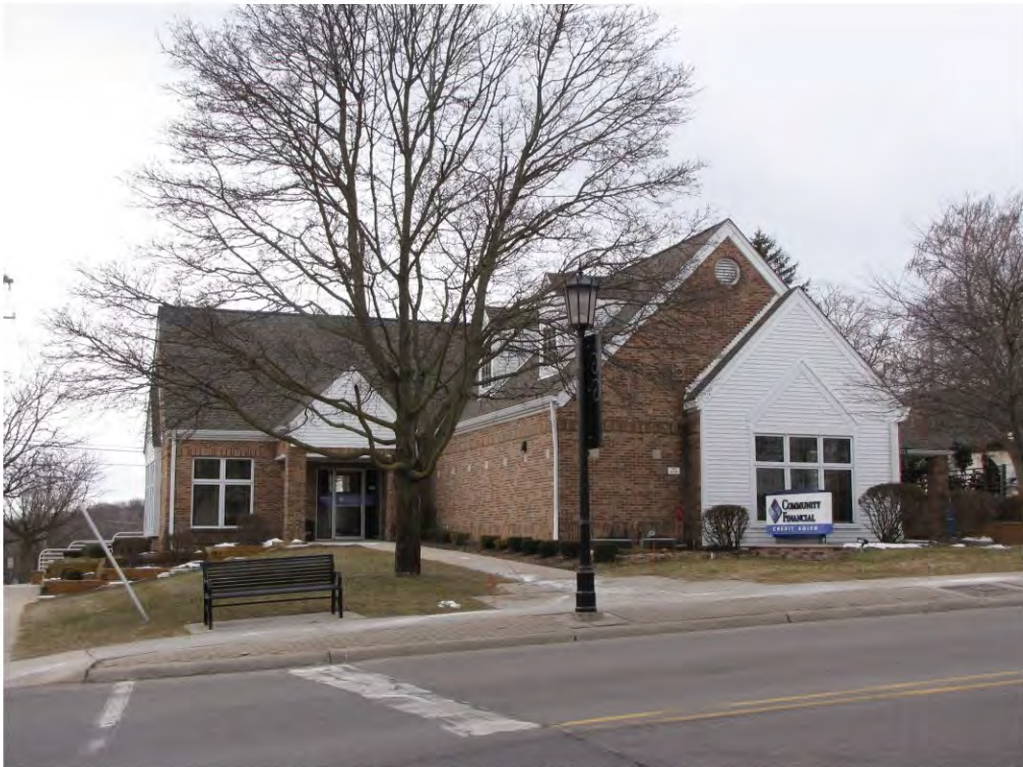
Main East 400_Looking Southwest