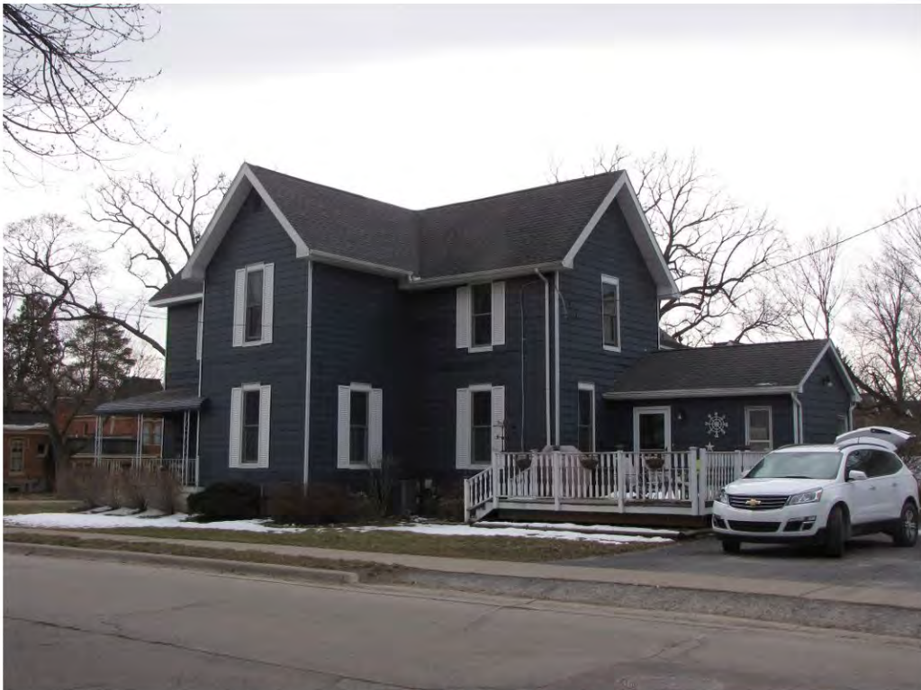
Rogers South 102_Looking Southeast