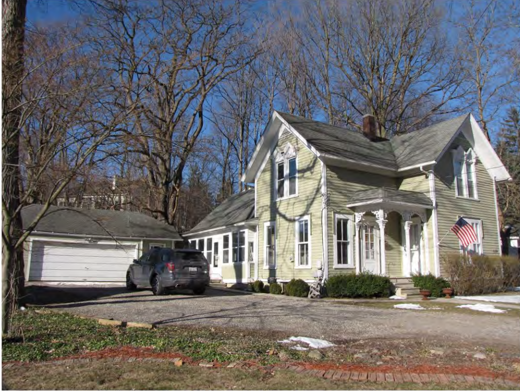
Randolph 537-539_Looking Southwest