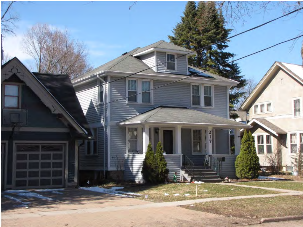
Linden 217_Looking Northwest