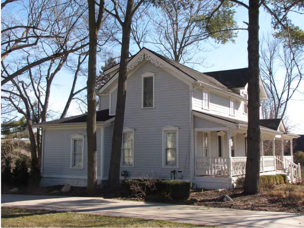
Randolph 116_Looking Northeast