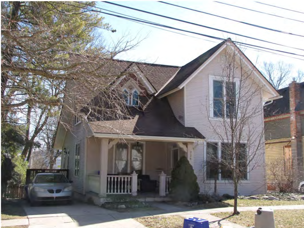
West 226_Looking Southeast