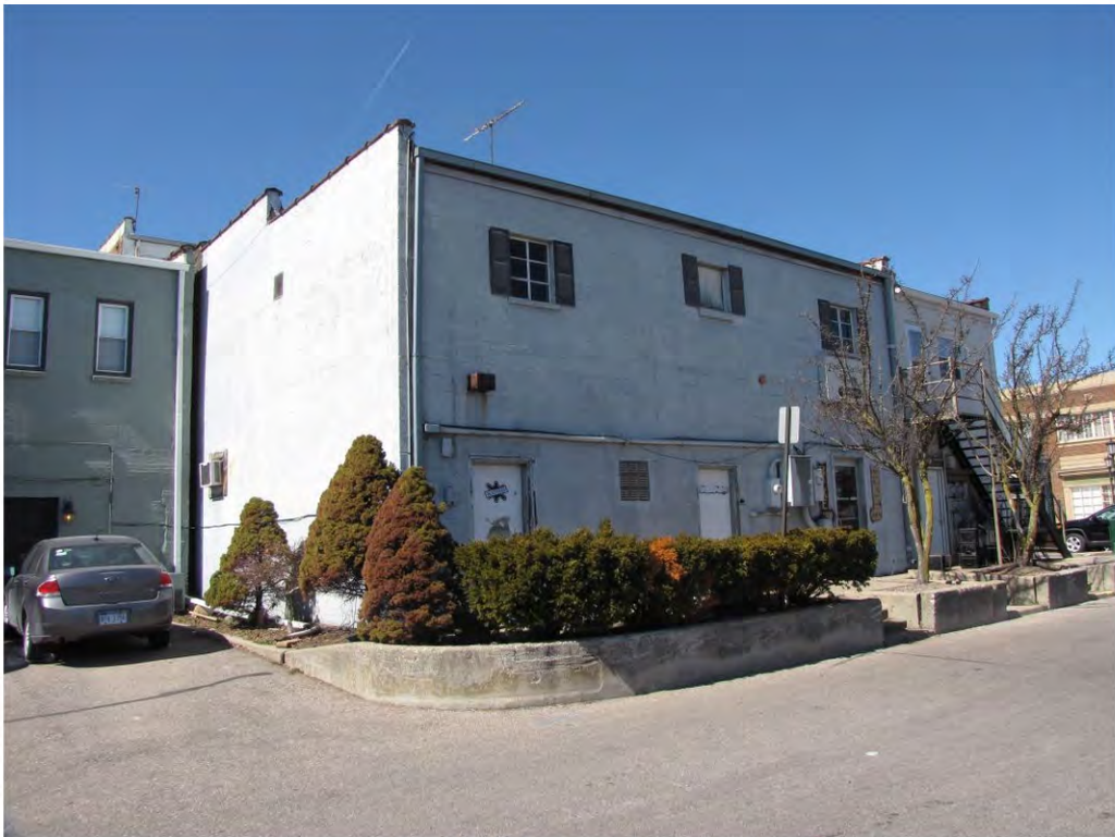
Center North 150_Looking Northwest