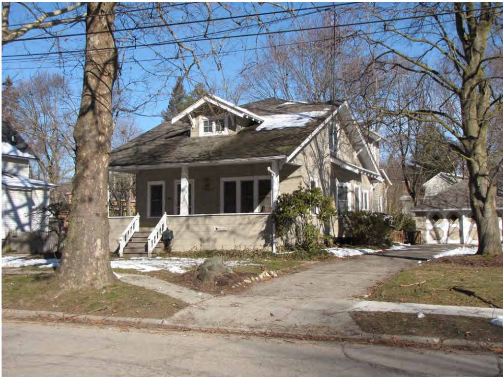
Cady West 504_Looking Northwest