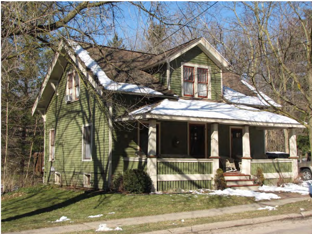
Rogers North 131_Looking Northwest