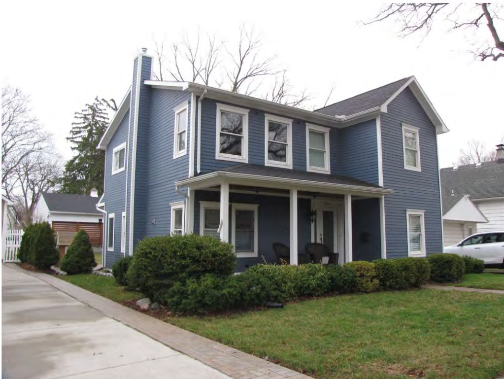
Linden 254_Looking Southeast