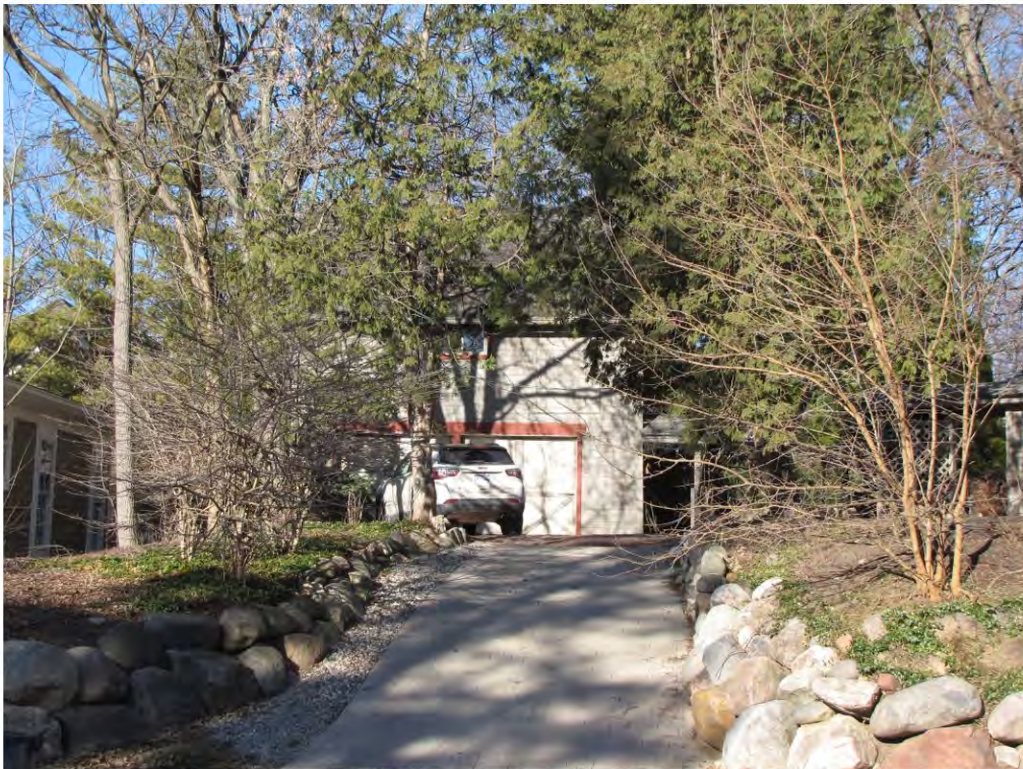
Randolph 503, Garage_ Looking West