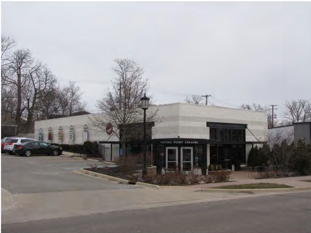
Cady East 361_Looking Northeast