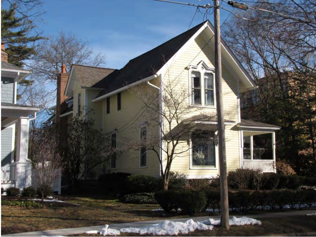
Cady West 494_ Looking Northeast