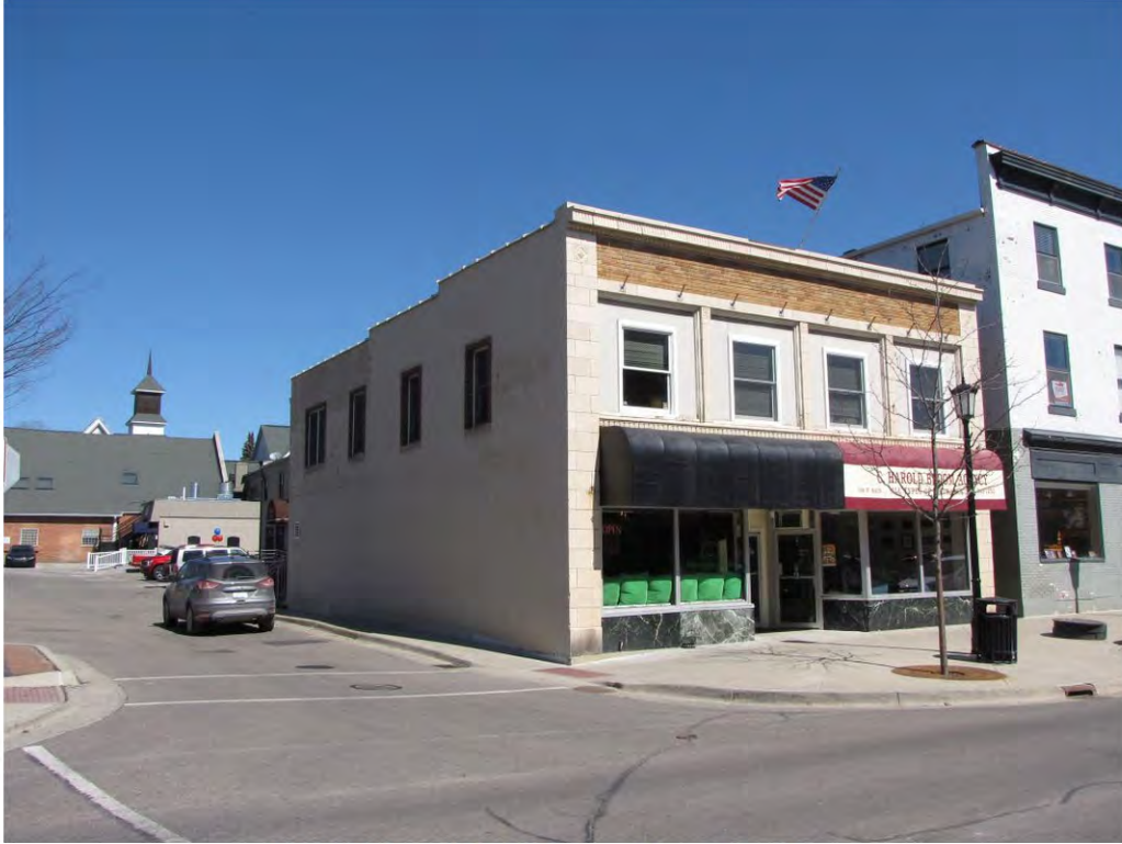
Main West 108-112_ Looking Northeast