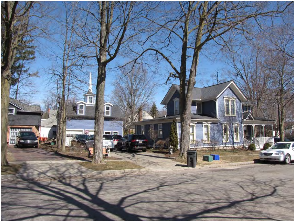
Dunlap West 206_Looking Northeast