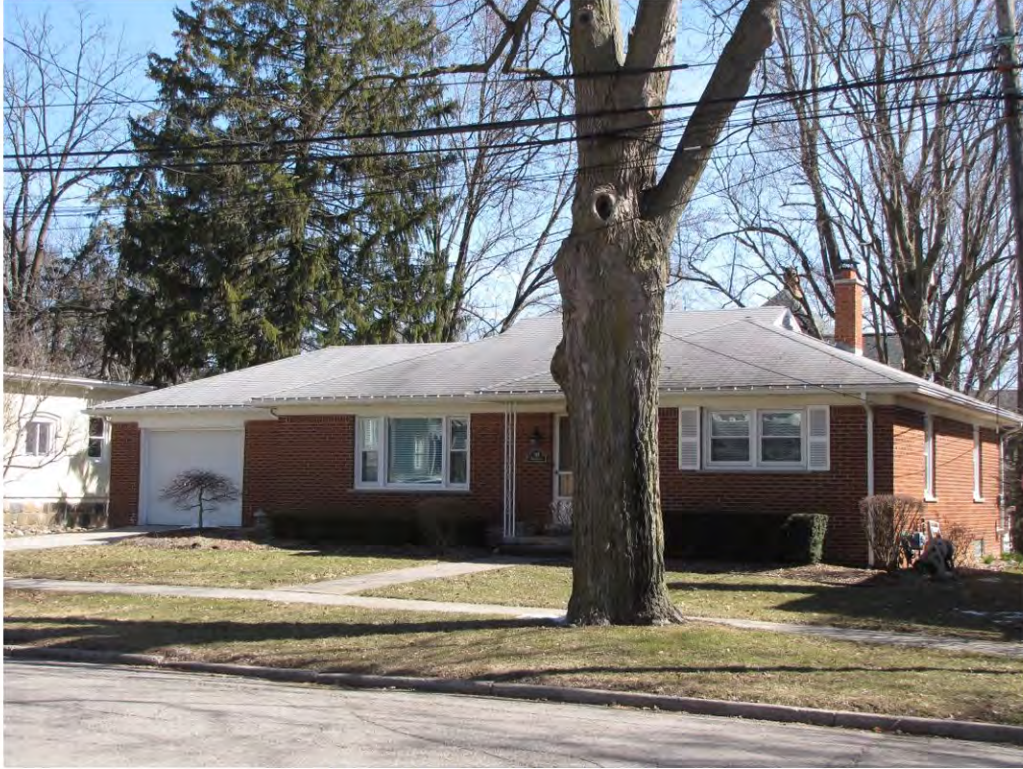
West 120_Looking Northeast