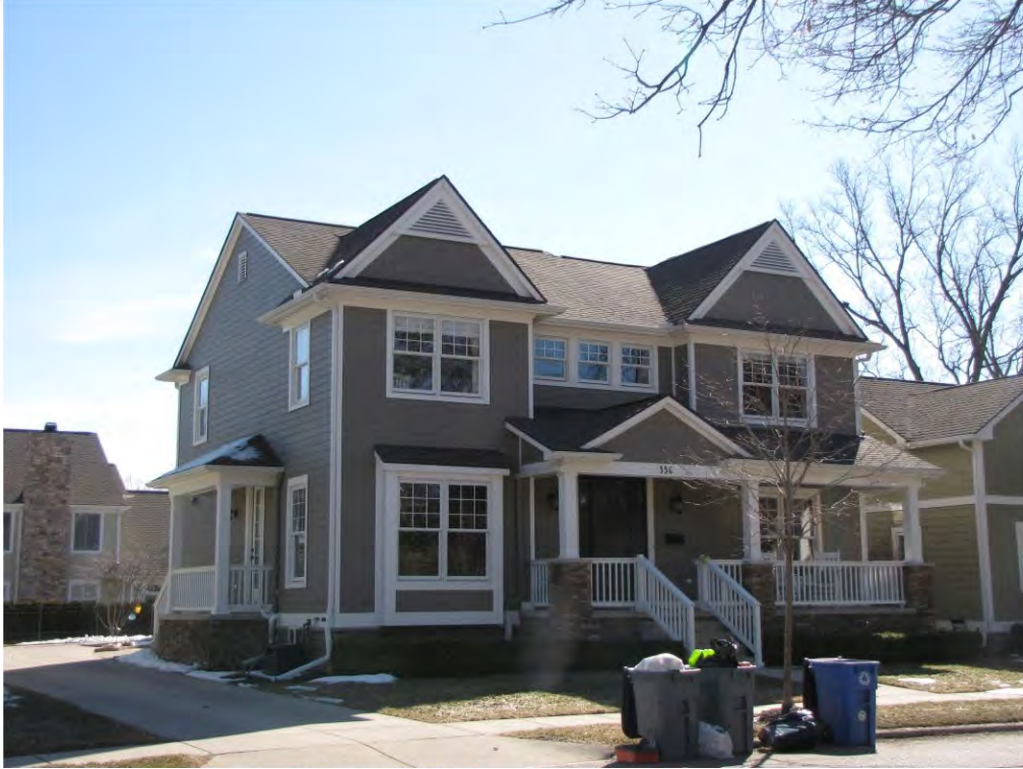
Linden 336_Looking Southeast