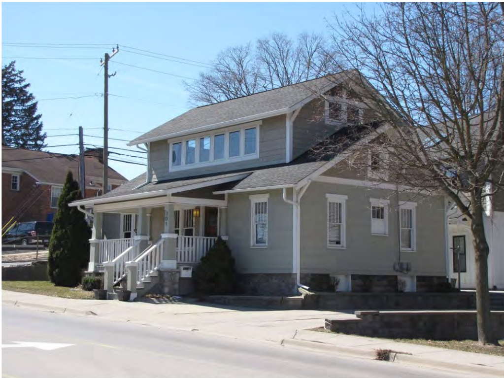
Center North 301_Looking Southwest