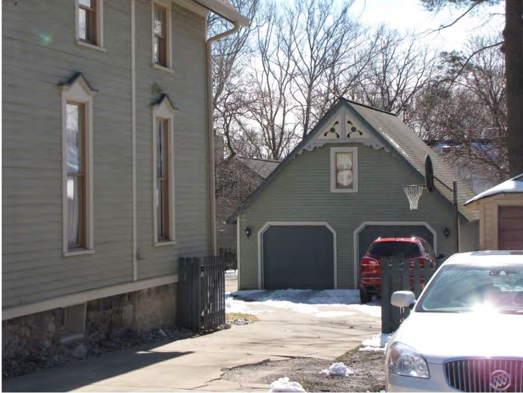
Main West 537, Garage_Looking South