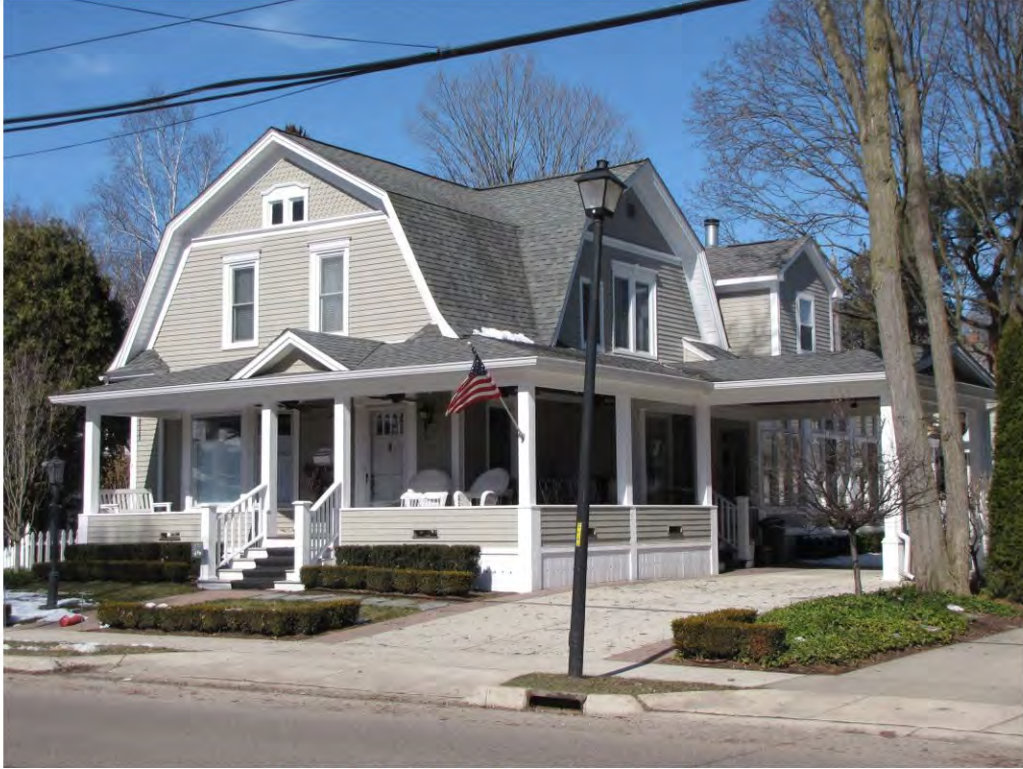
Main West 542_Looking Northwest