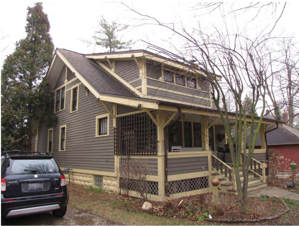
Linden 220_Looking Southeast