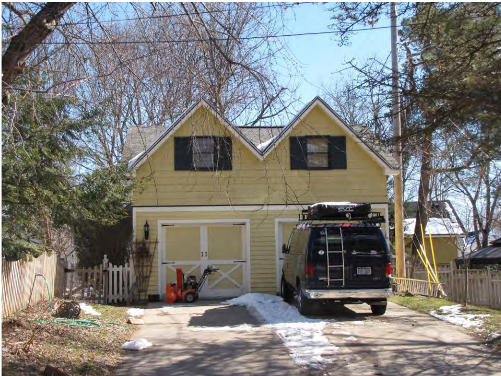
Dunlap West 549, Garage_Looking East