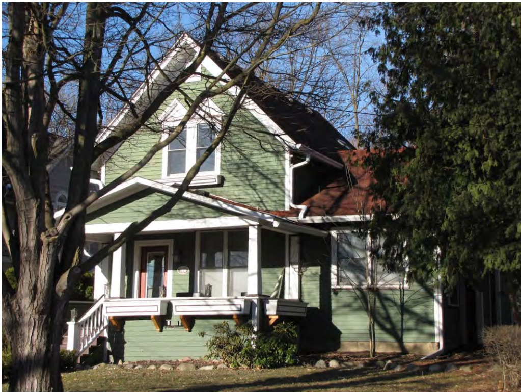
Rogers North 359_Looking Southwest