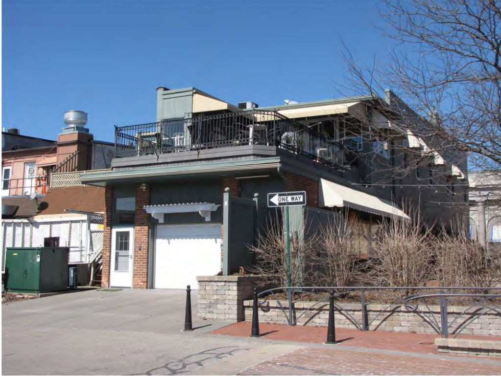
Main East 126-134_Looking South