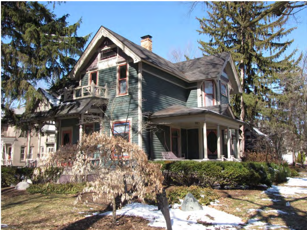
Dunlap West 504_Looking Northwest