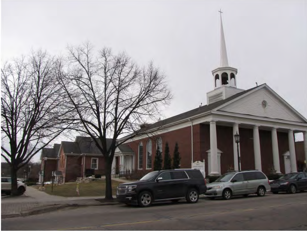
Main East 200_Looking Southwest