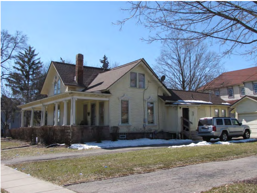
Dunlap West 304_Looking Southwest