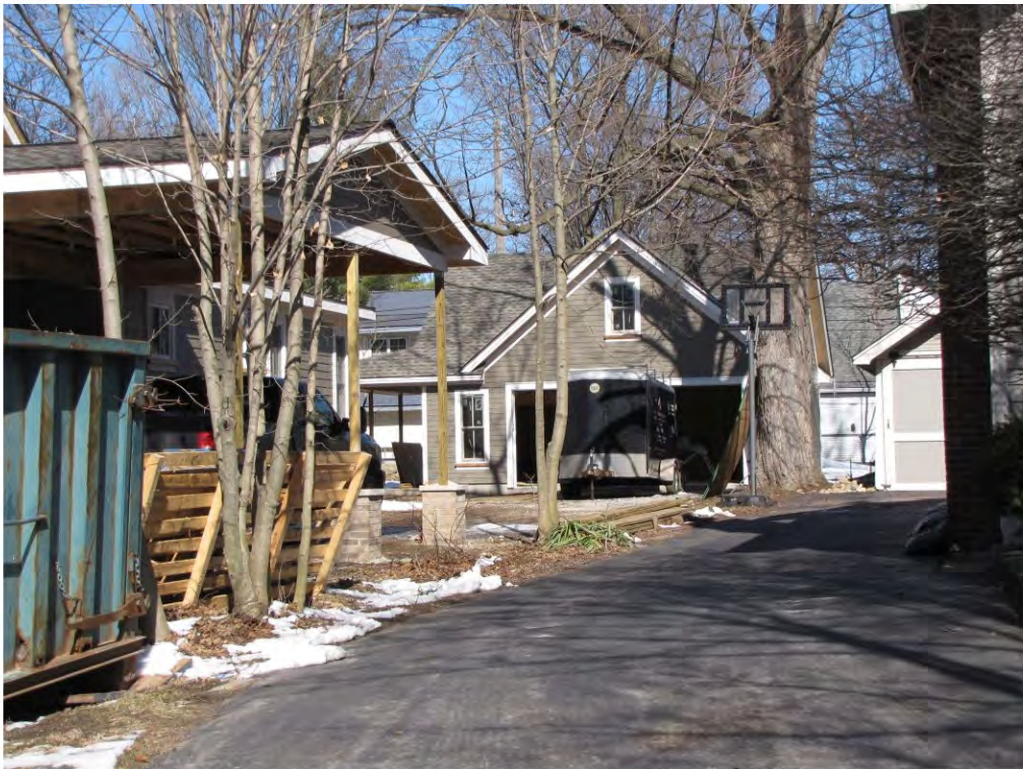
Dunlap West 528, Garage_Looking North