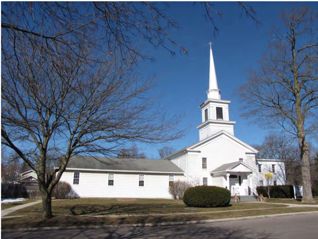
Wing North 217_Looking Northwest