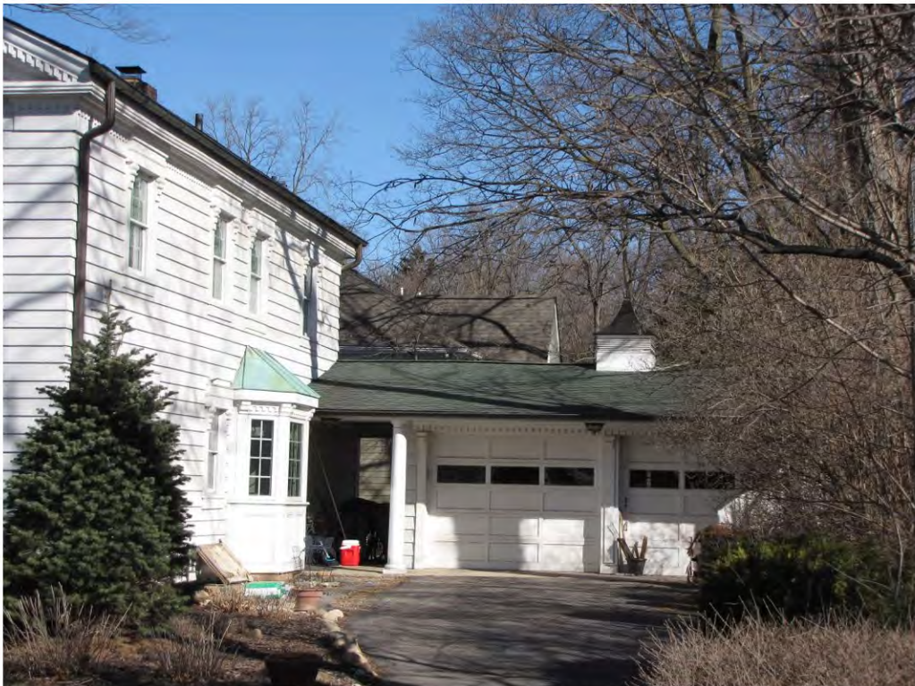
Randolph 204, Garage_Looking North