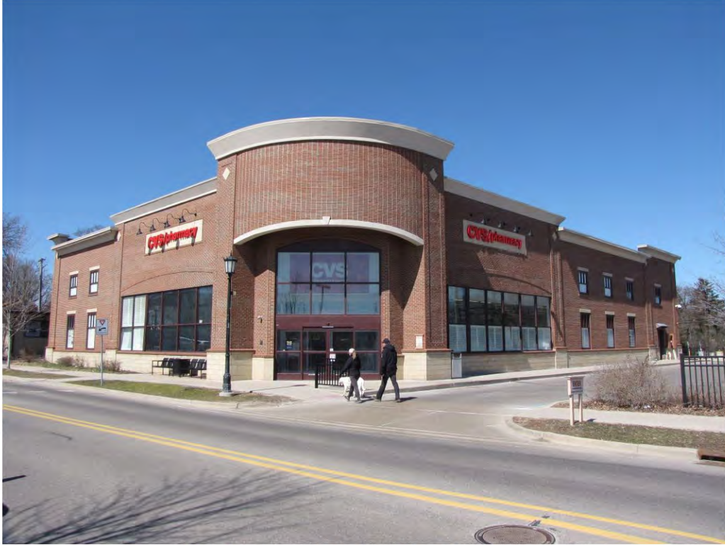
Dunlap East 133_Looking Northwest