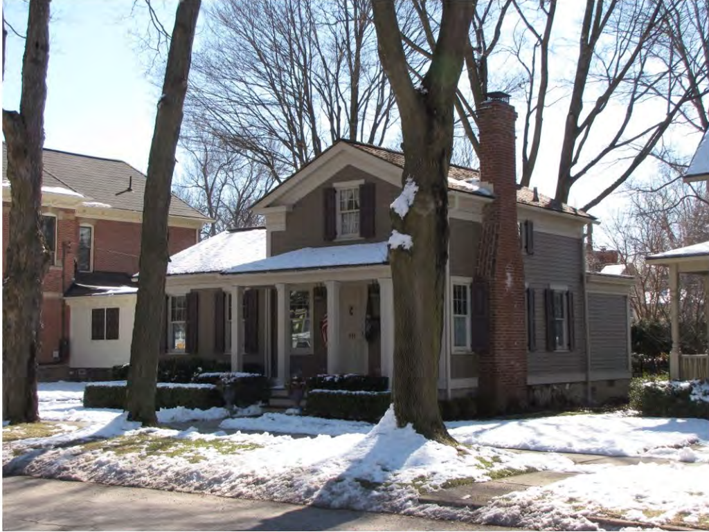
Dunlap West 511_Looking Southeast