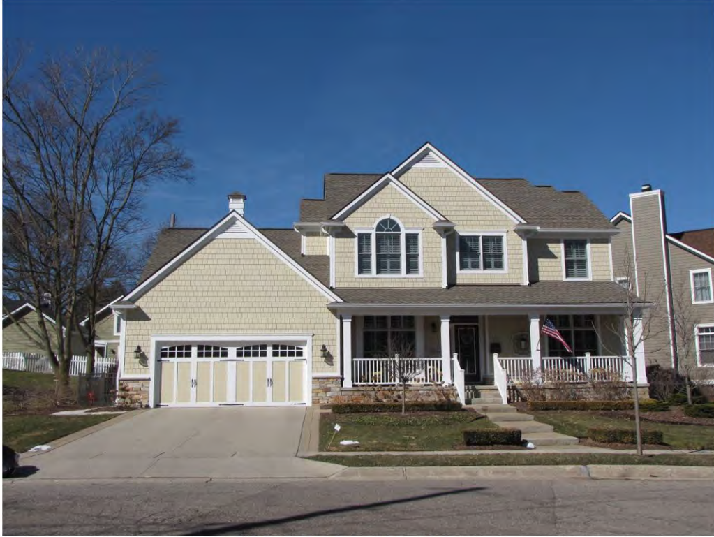
West 255_Looking West