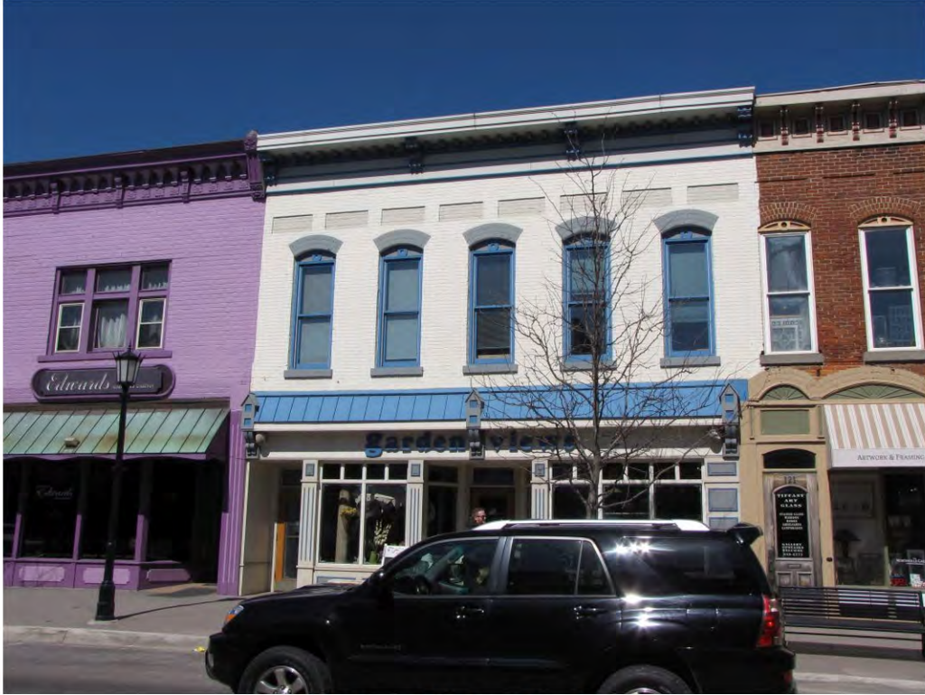
Main East 117_Looking North