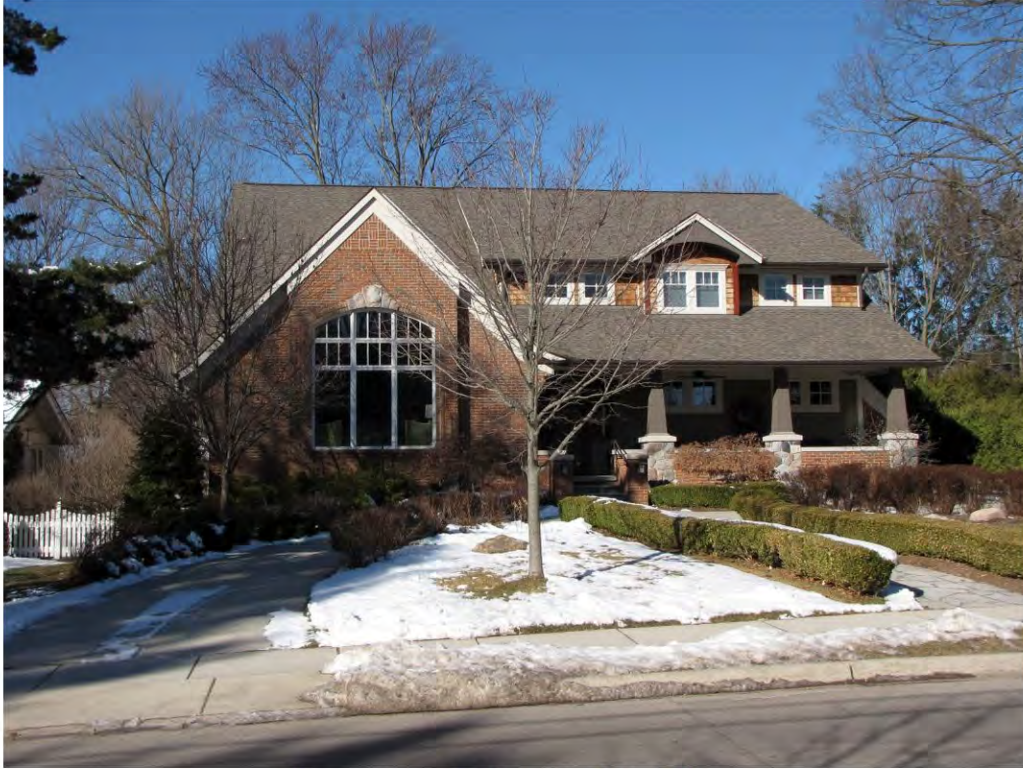
Rogers South 208_Looking West