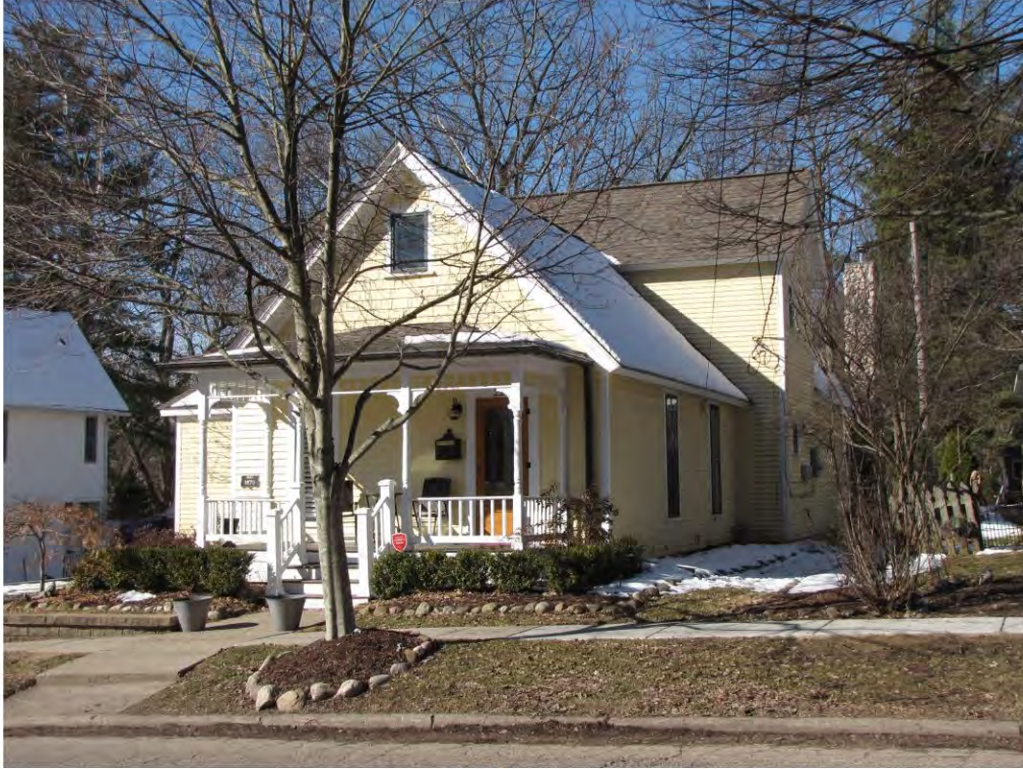
Rogers North 221_Looking West