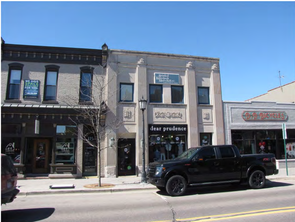
Center North 119_Looking Northeast