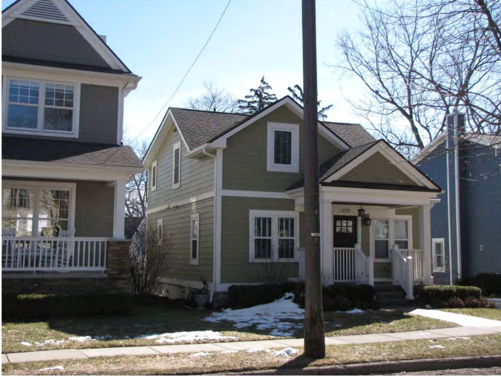
Linden 320_Looking Southeast