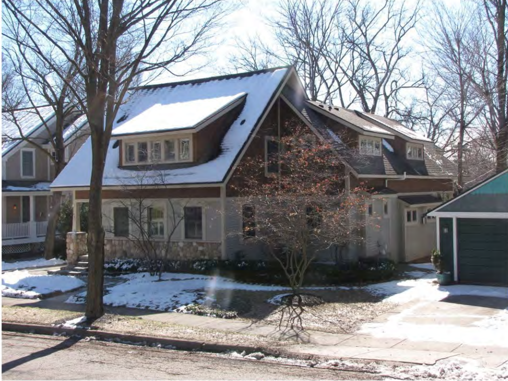
Dubuar 439_Looking Southeast