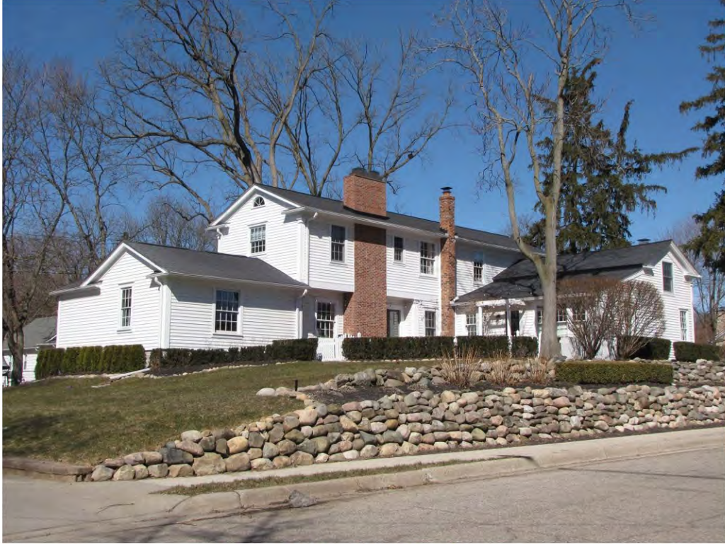
West 247_Looking Northwest