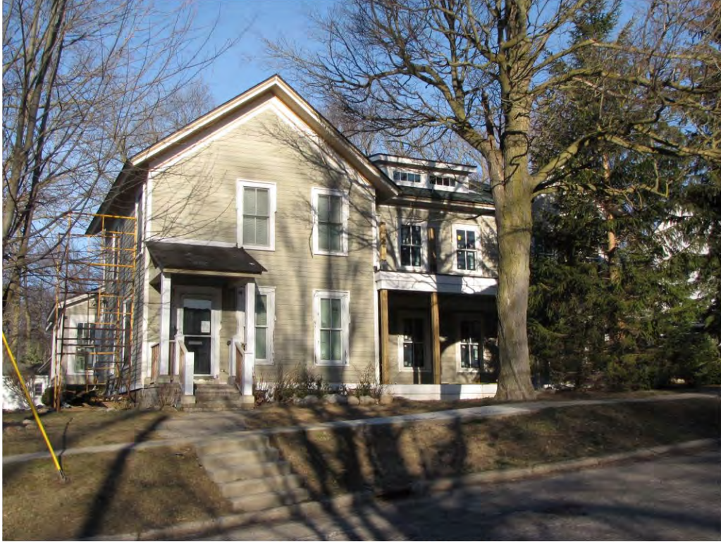
Rogers North 333_Looking West