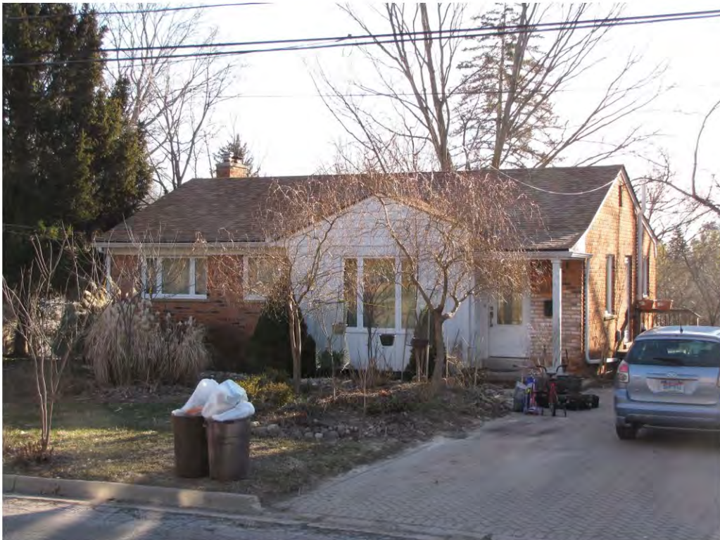
Rogers North 368_Looking Northeast