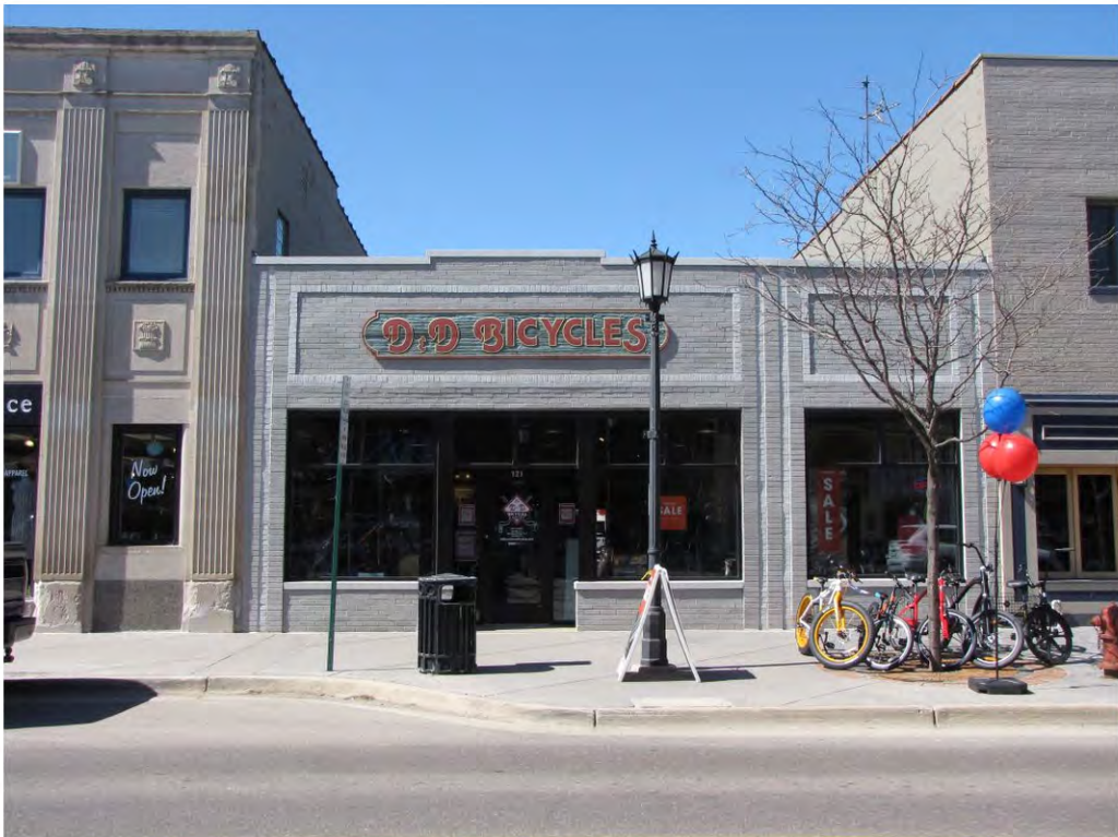
Center North 121_Looking West