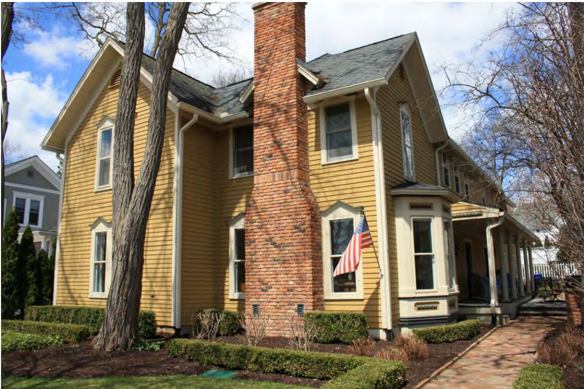
Main West 536_Looking Northwest