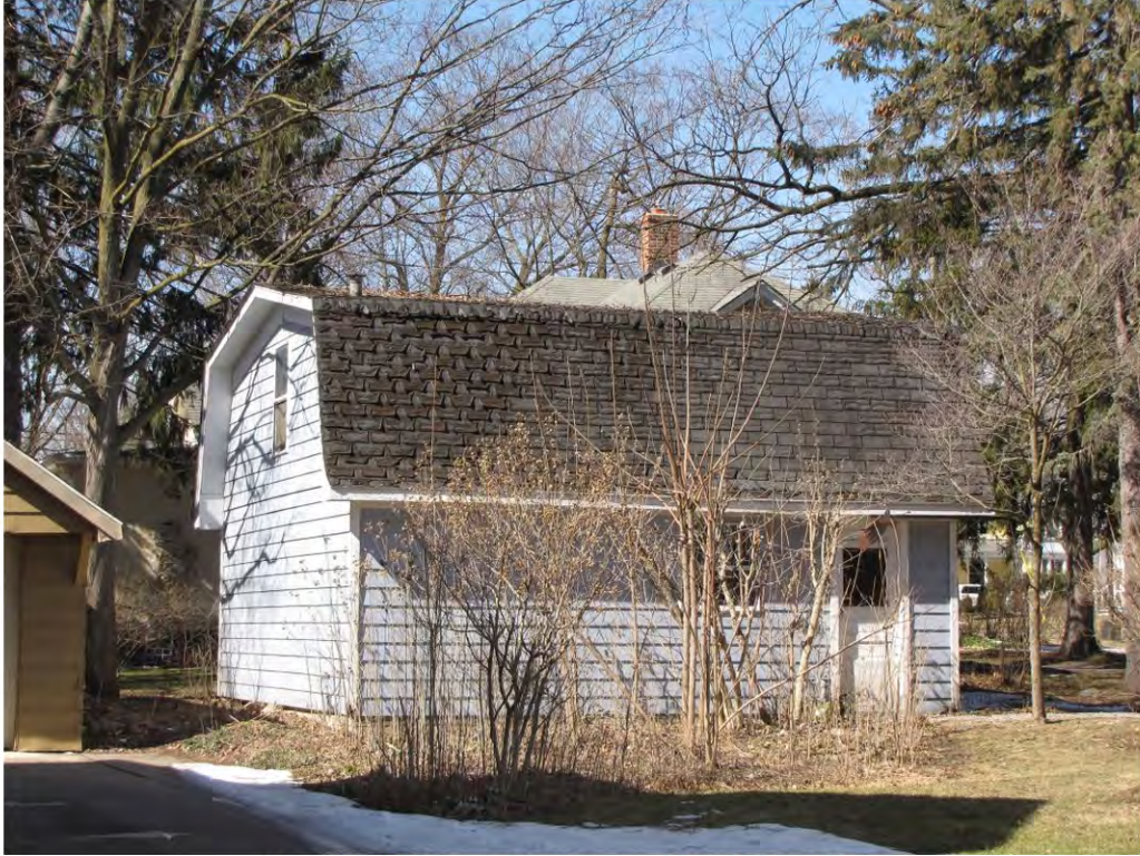
Dunlap West 305, Garage_Looking West