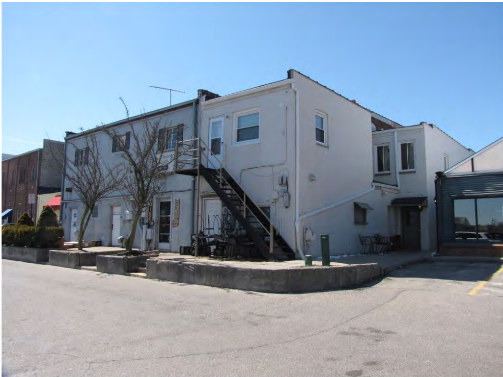
Center North 144-148_Looking Southwest