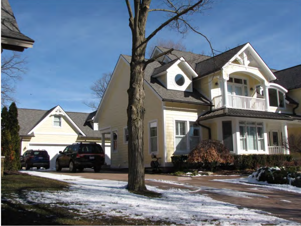
Dubuar 422_Looking Northeast