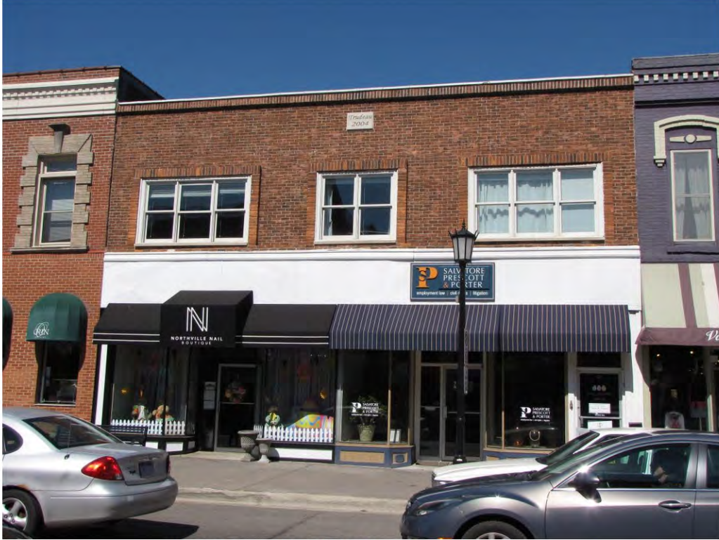
Main East 103-107_Looking Southwest