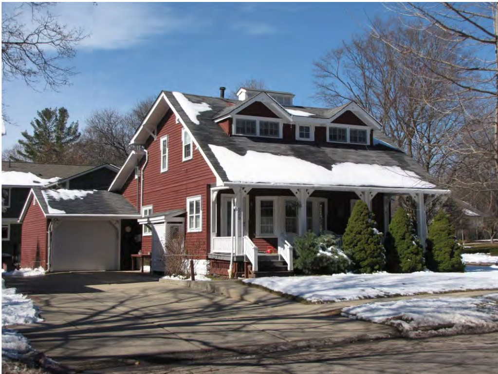
Linden 229_ Looking Northwest