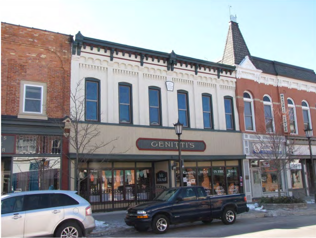
Main East 108-110_Looking Southeast