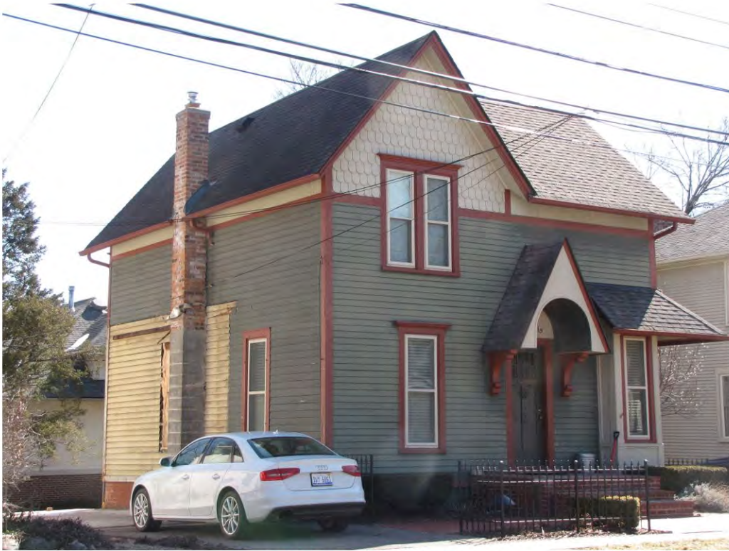
West 222_Looking Southeast