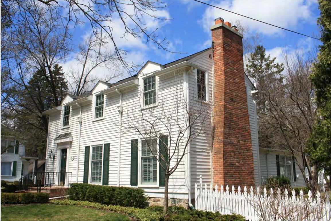
Main West 548_Looking Northwest