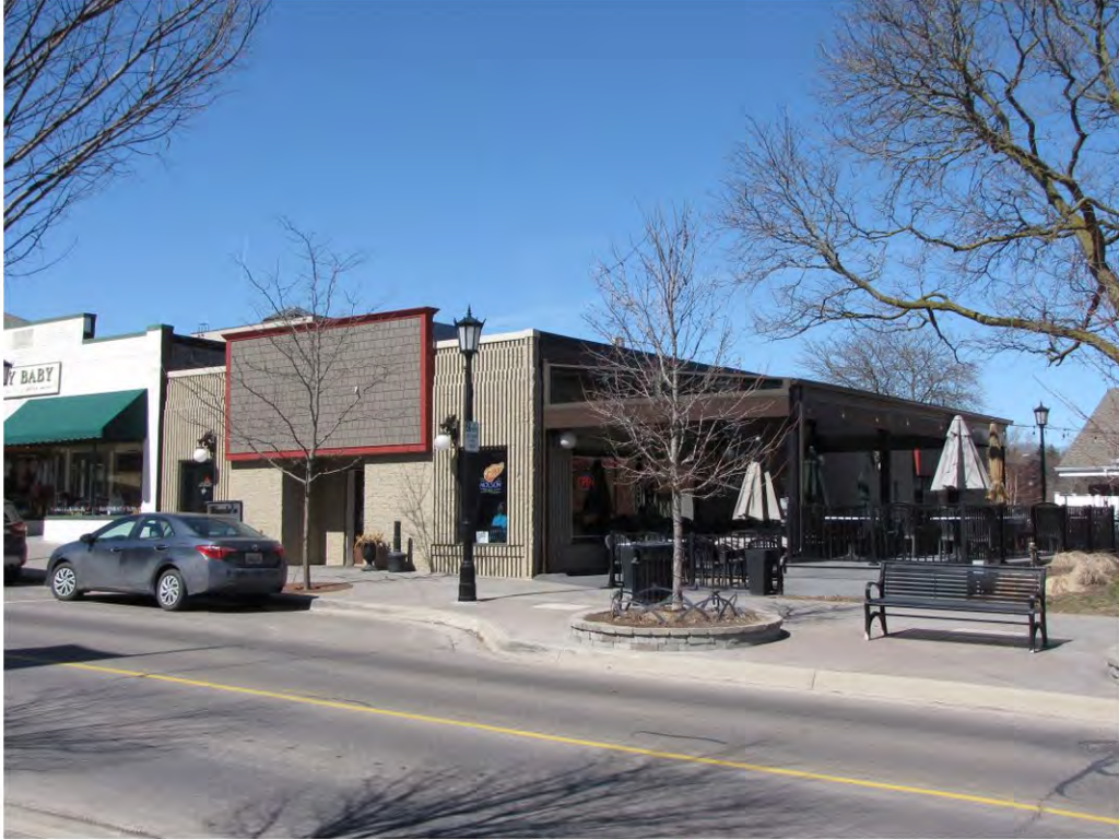
Main East 157_Looking Northwest