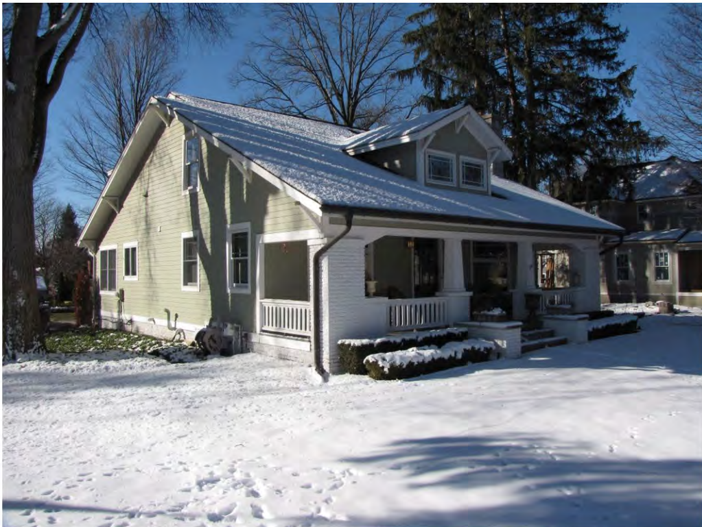
Cady West 487_Looking Southwest