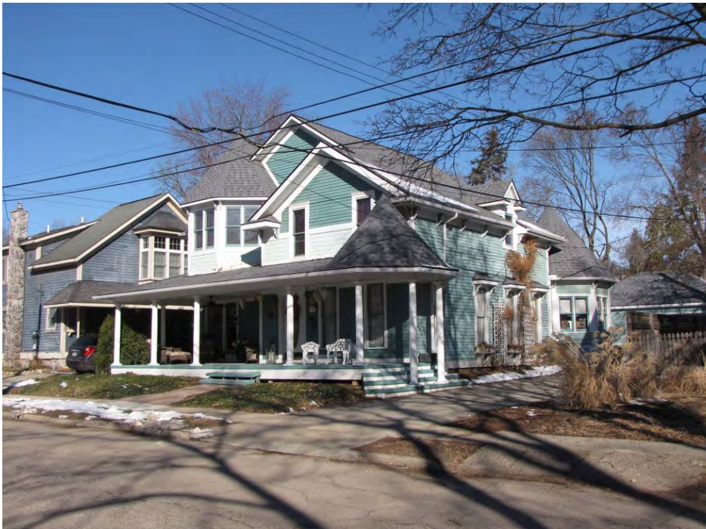
Cady West 514_Looking Northwest