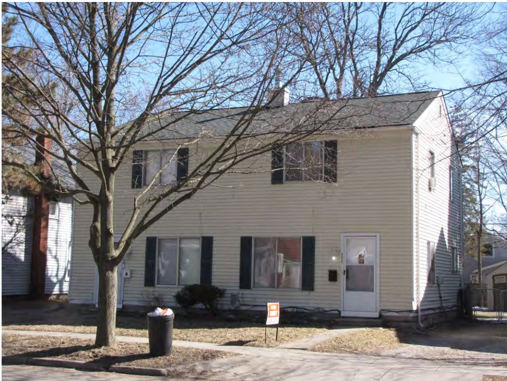
Linden 222-224_Looking Northeast