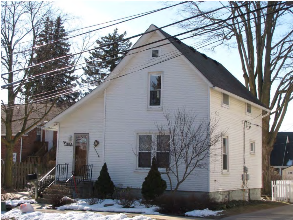
Randolph 113_Looking Southeast