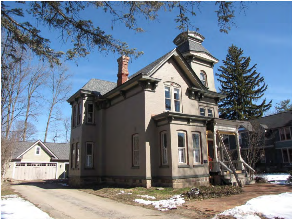
Dunlap West 512_Looking Northeast