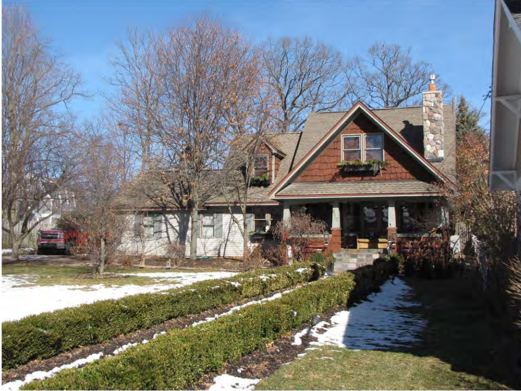
Dubuar 410_Looking North