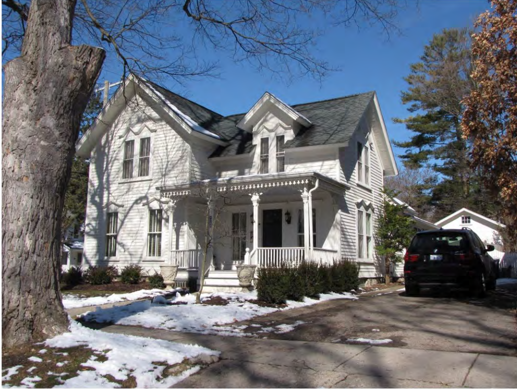
Dunlap West 552_Looking Northwest