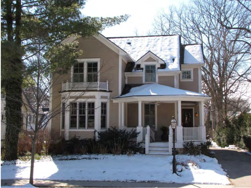
Dubuar 433_Looking South