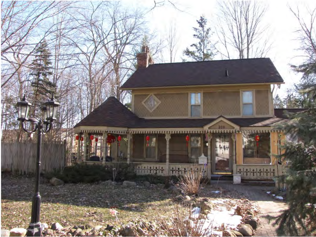
High 320_Looking East