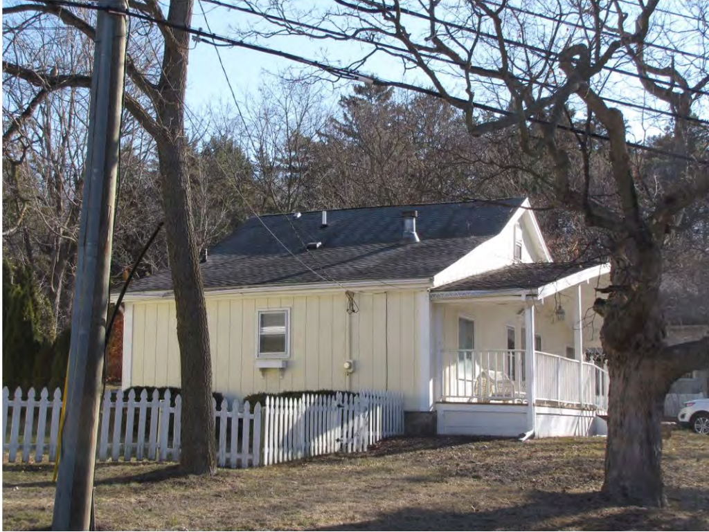
Randolph 572_Looking Northeast