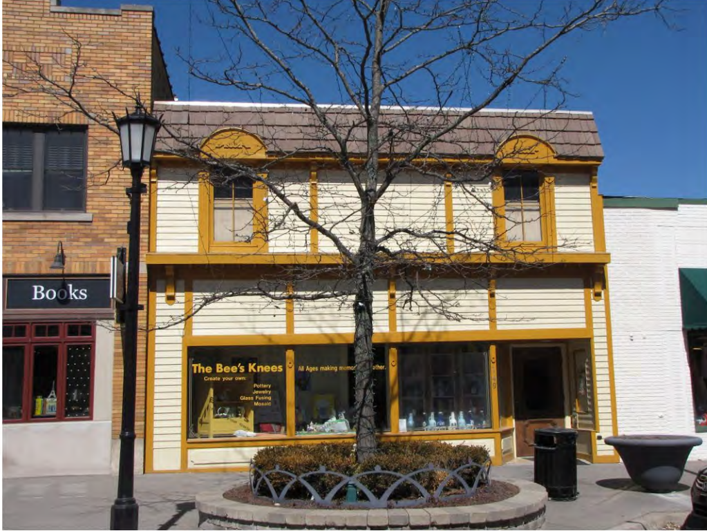
Main East 149_Looking Northeast