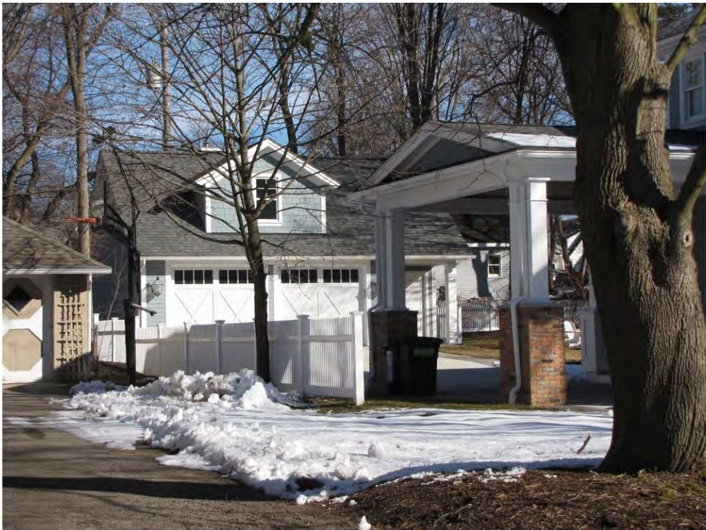
Cady West 500, Garage_Looking North