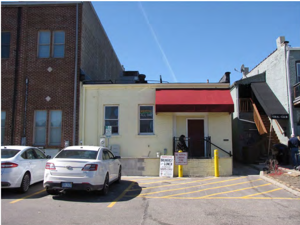
Center North 134_Looking West