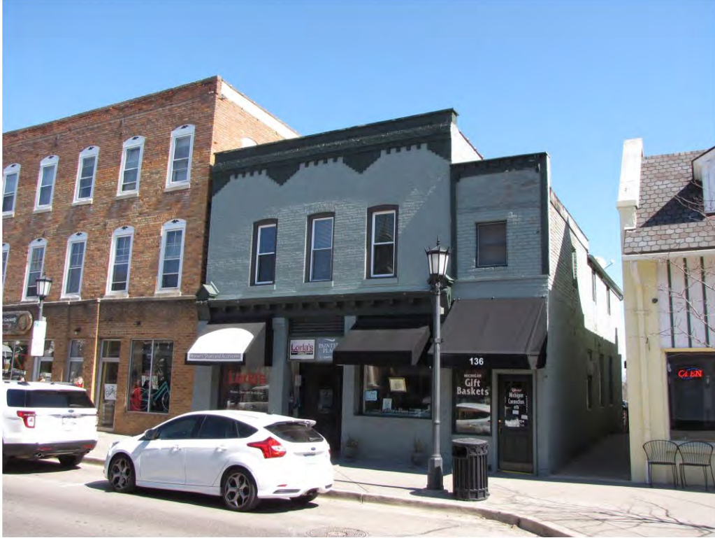
Center North 136_Looking Northeast