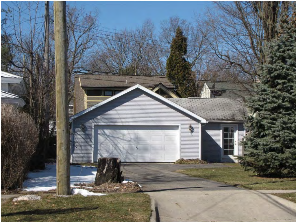
West 223, Garage_Looking West