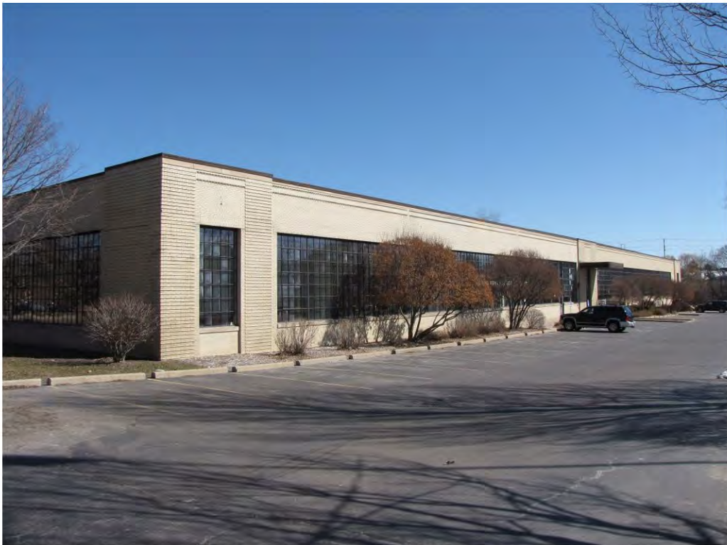
Main East 235_Looking Northeast