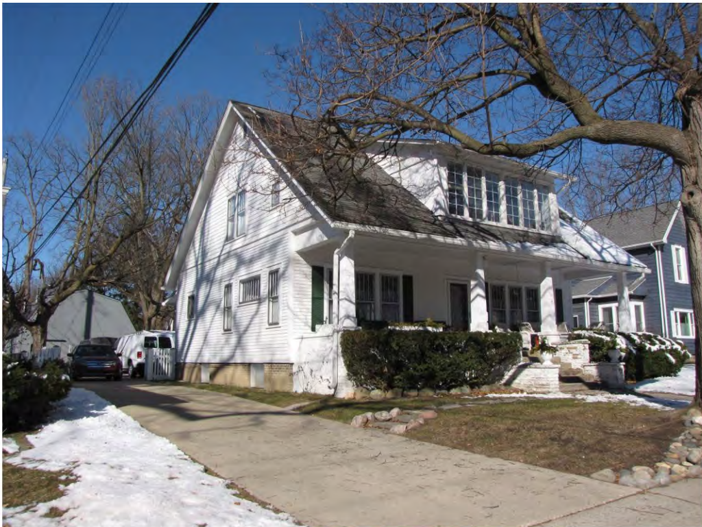
Rogers South 110_Looking Northwest