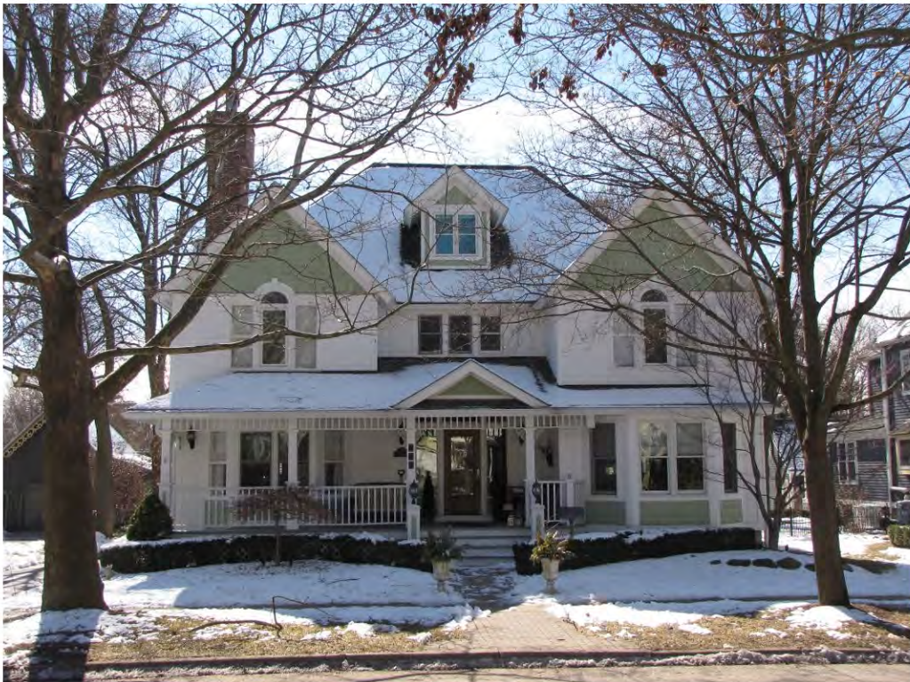
Dunlap West 537_Looking South