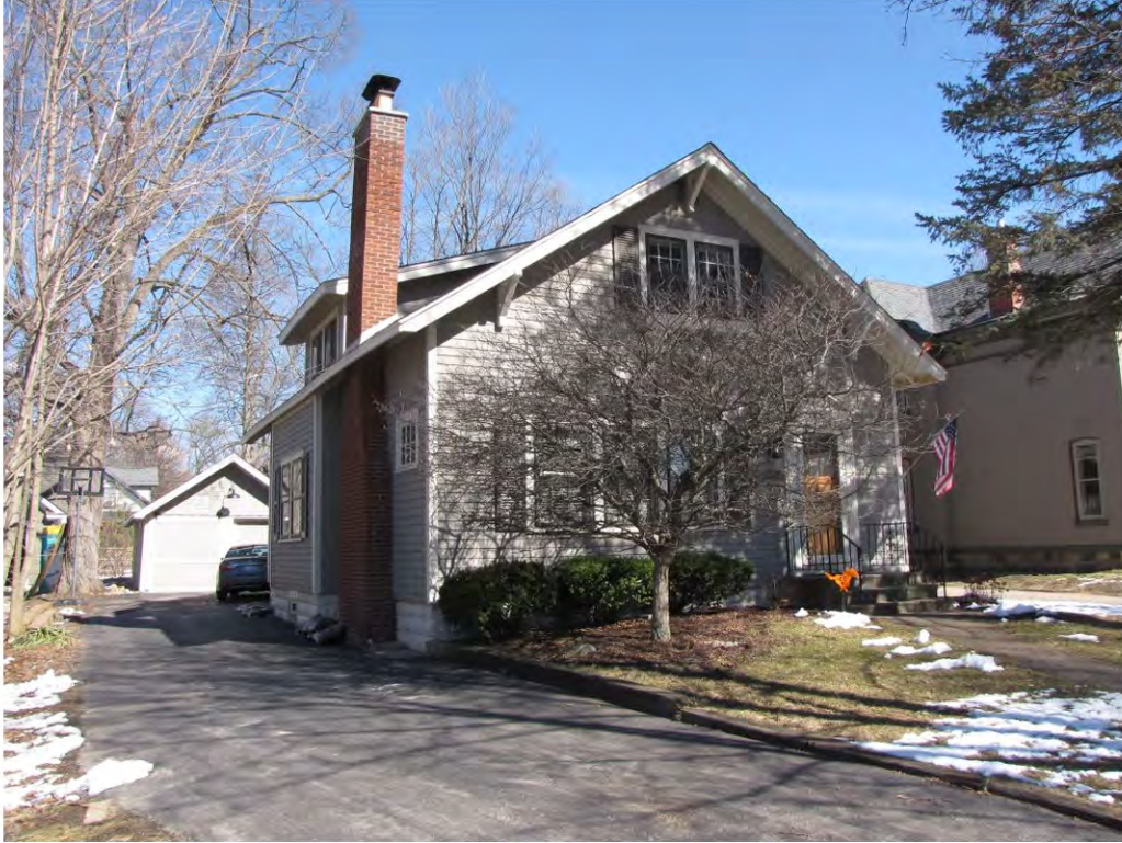
Dunlap West 522_Looking Northeast