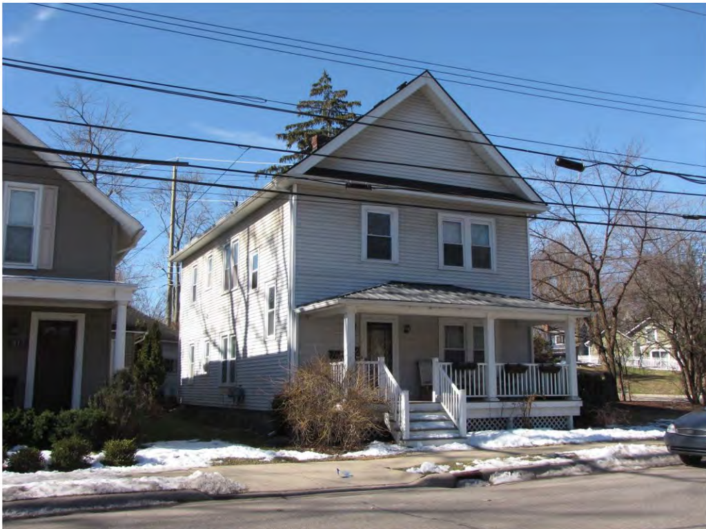
Randolph 319-321_Looking Southwest