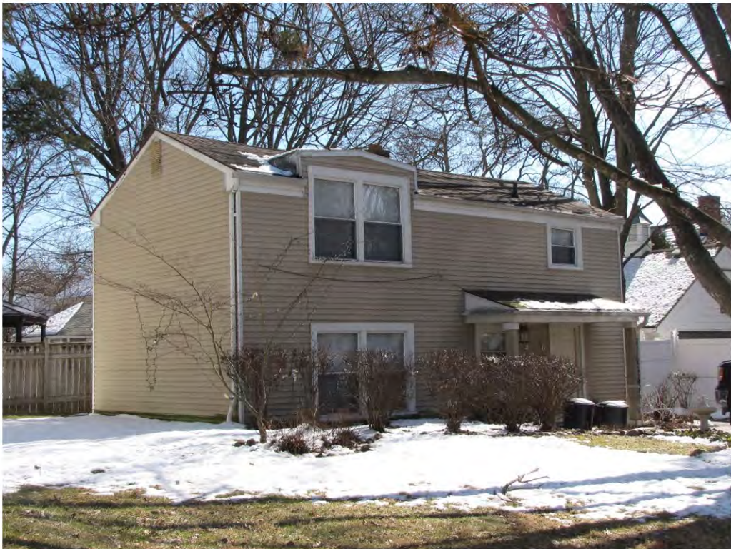
Rogers North 114-116_Looking Southeast