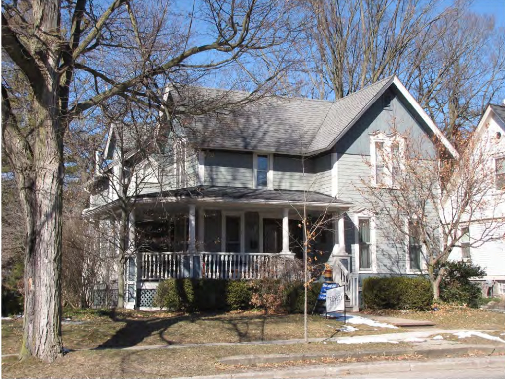
High 229_Looking Northwest