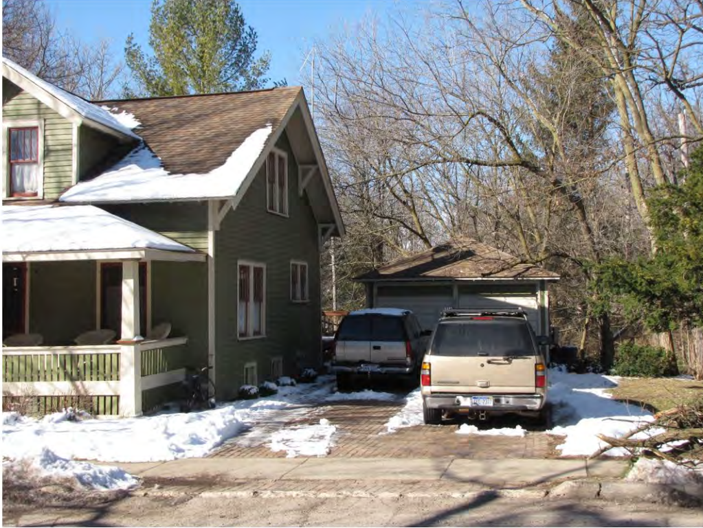
Rogers North 131, Garage_Looking West