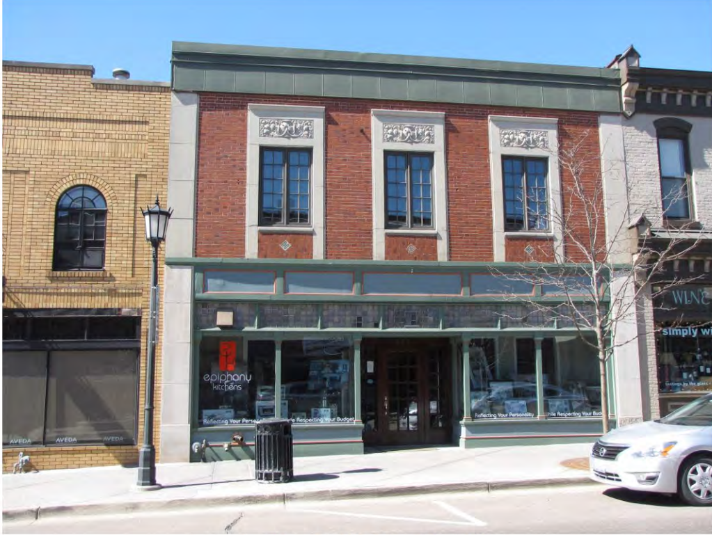
Center North 107_Looking West