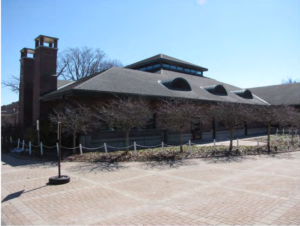
Cady West 212_Looking Southwest