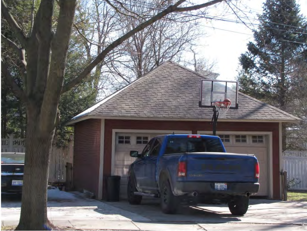
Dunlap West 418, Garage_Looking East