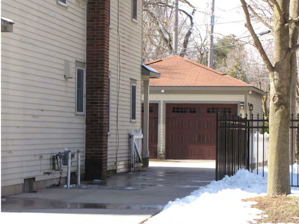
Linden 115, Garage_Looking West