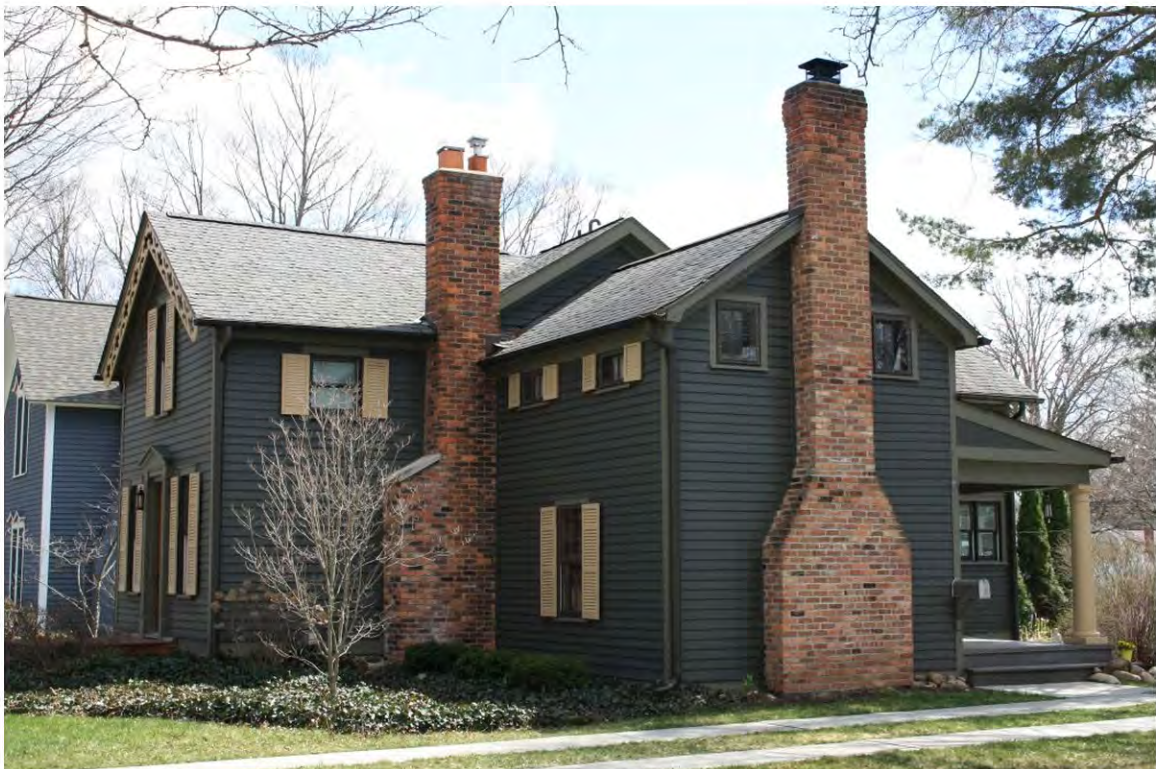
Dunlap West 527_Looking Southeast