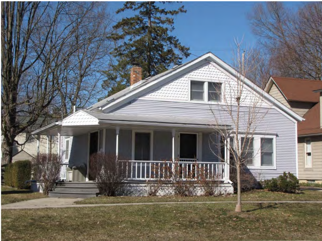
West 223_Looking West