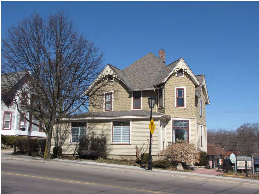
Main East 371_Looking Northwest