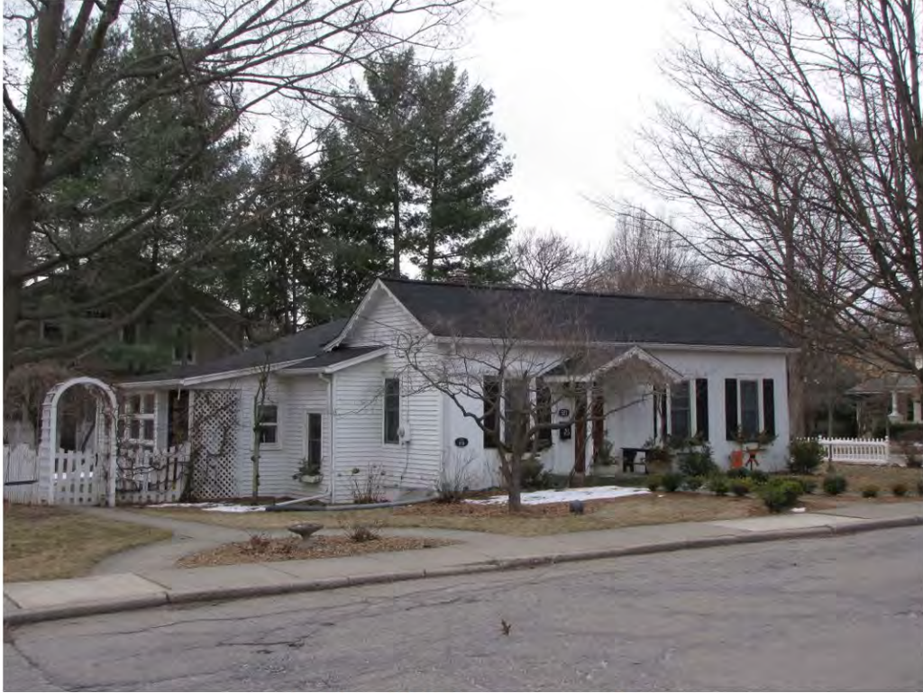
Cady West 521_Looking Southwest