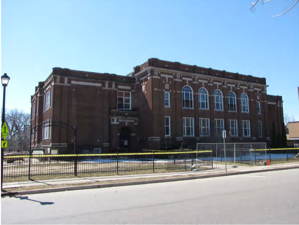
Main West 411_ Looking South