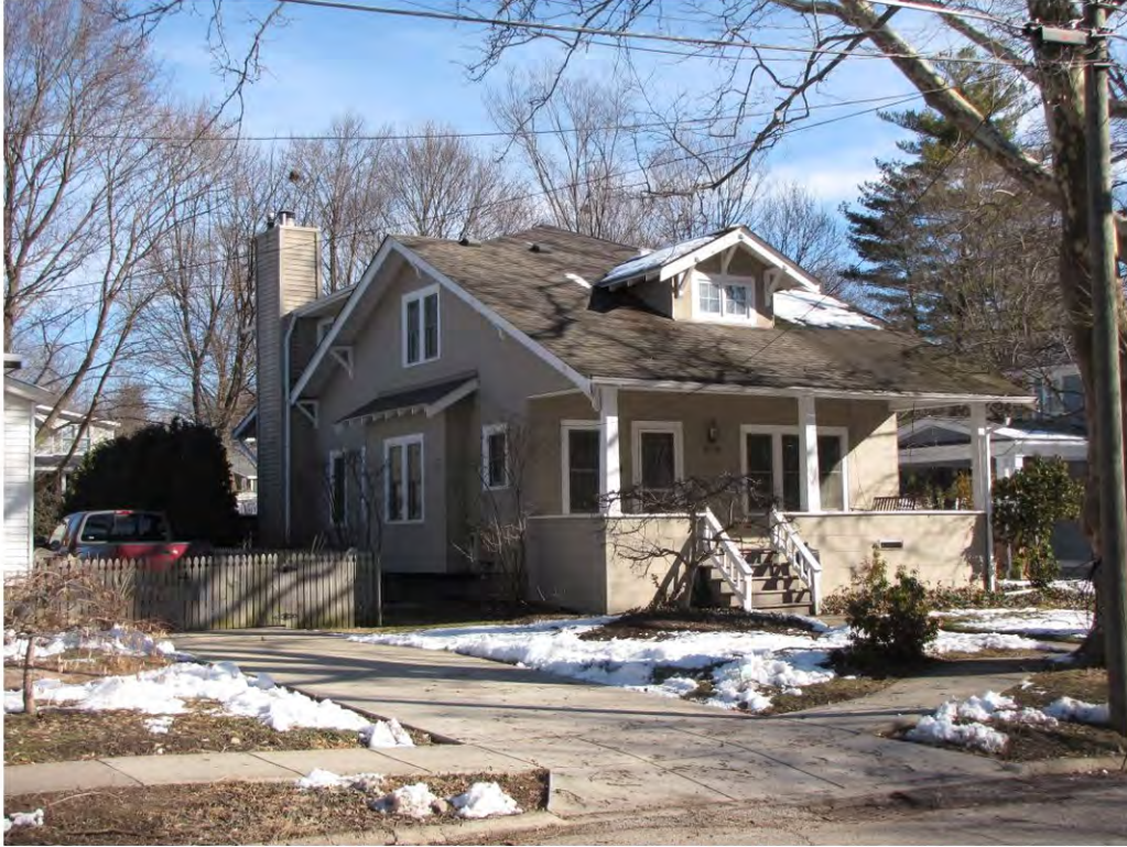
Cady West 504_Looking Northeast