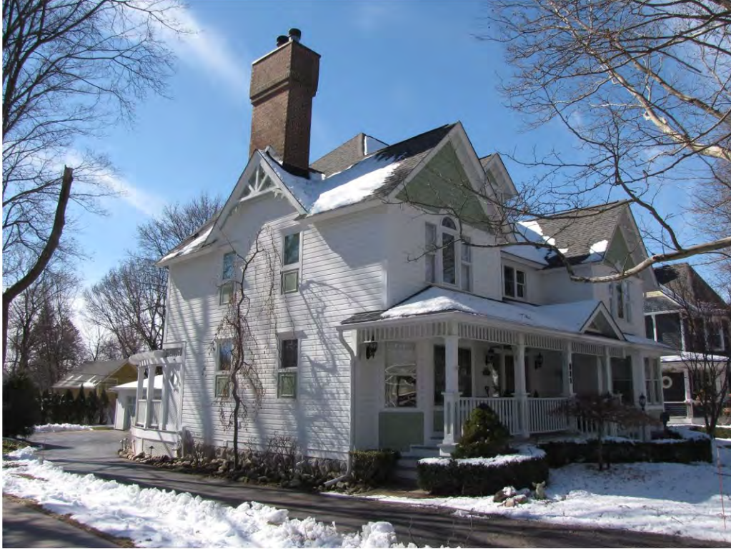
Dunlap West 537_Looking Southwest