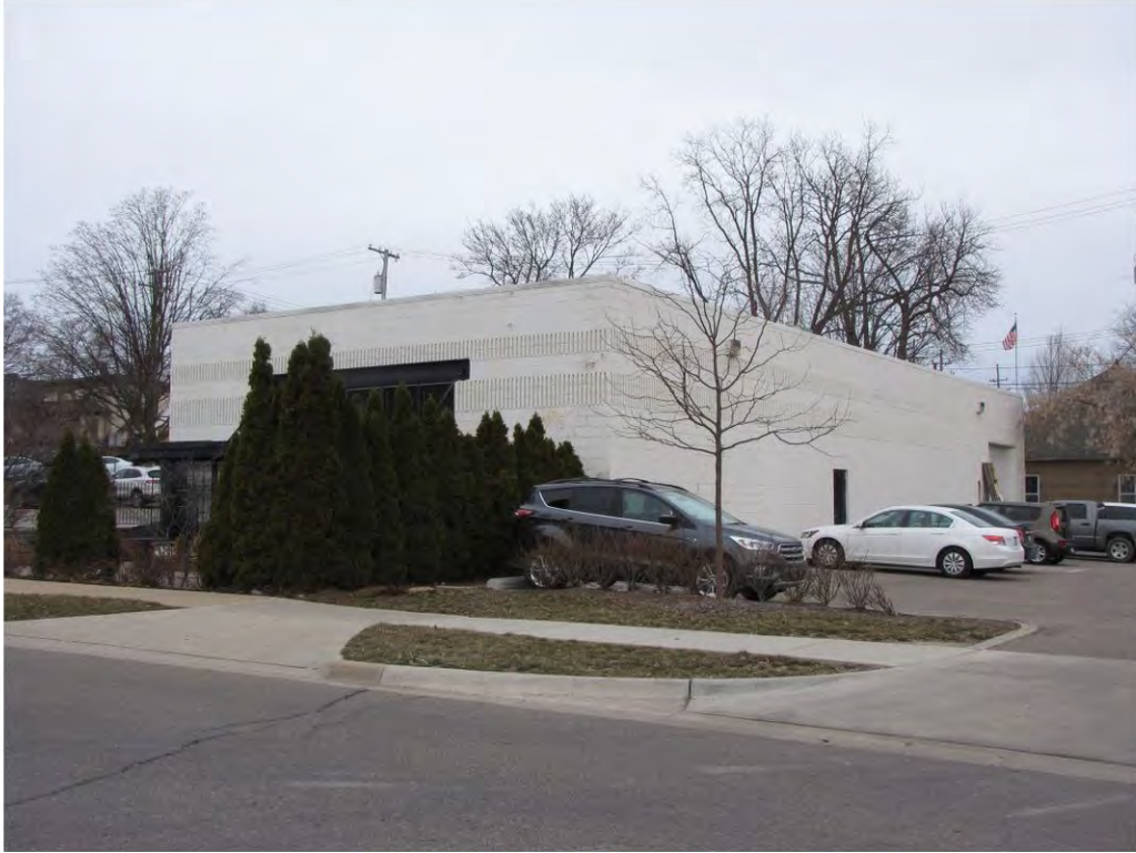
Cady East 361_Looking Northwest