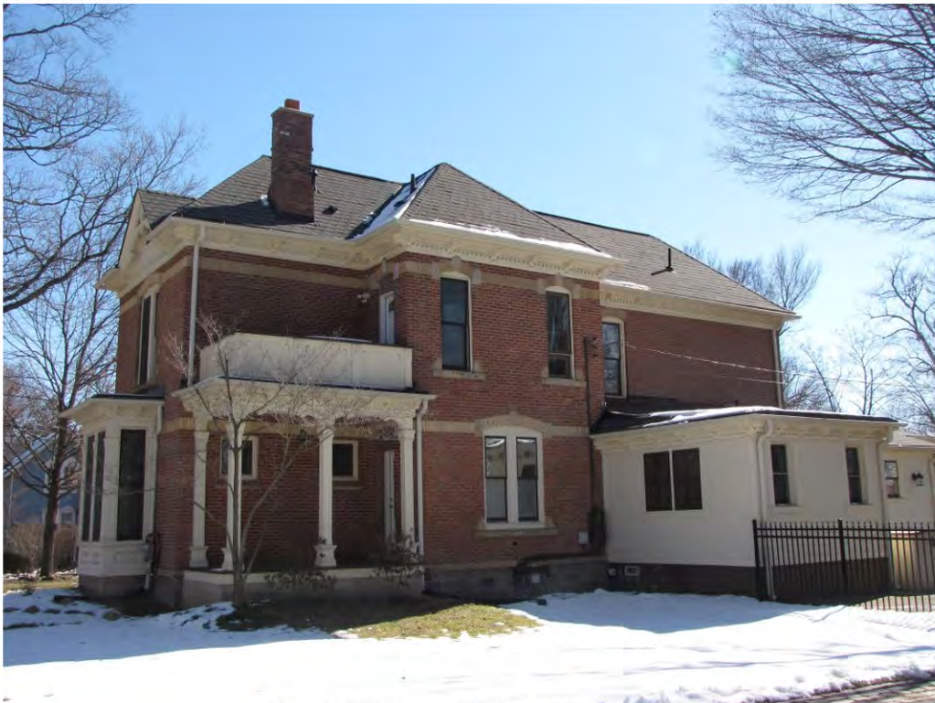
Dunlap West 501_Looking East