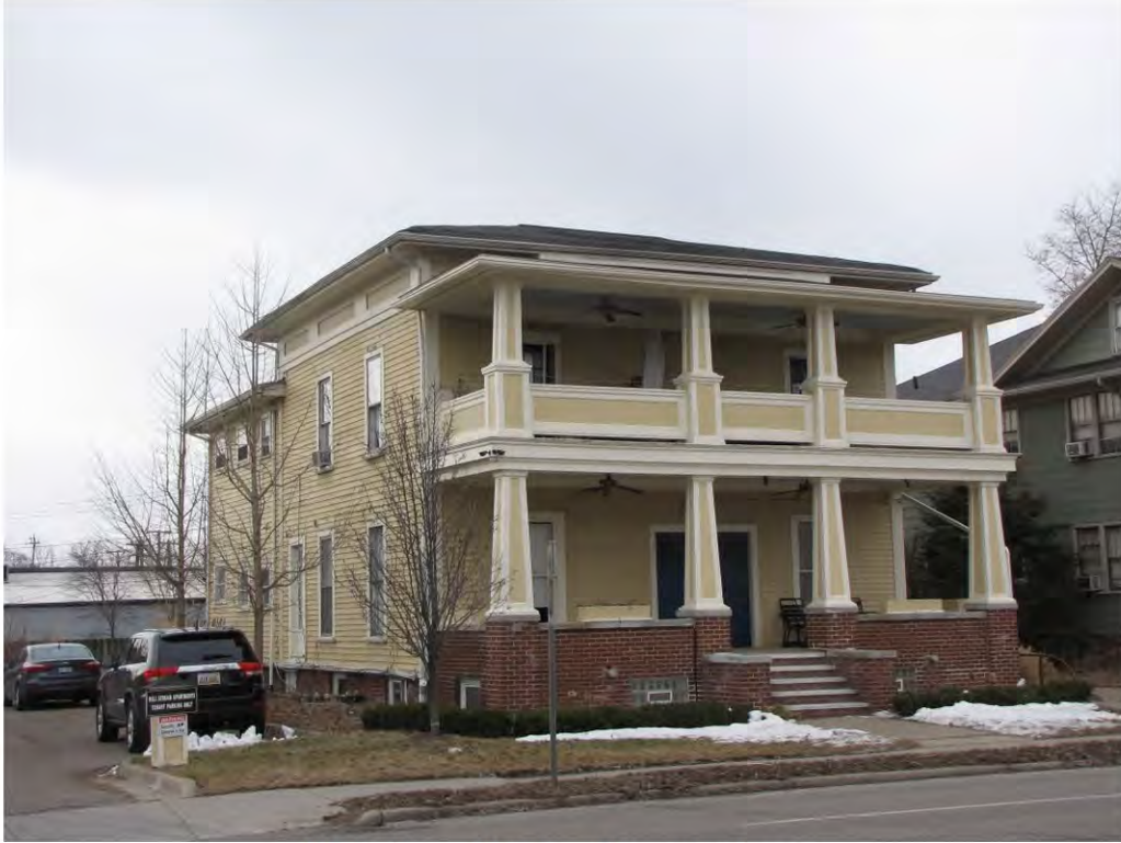
Main East 450_Looking Southwest