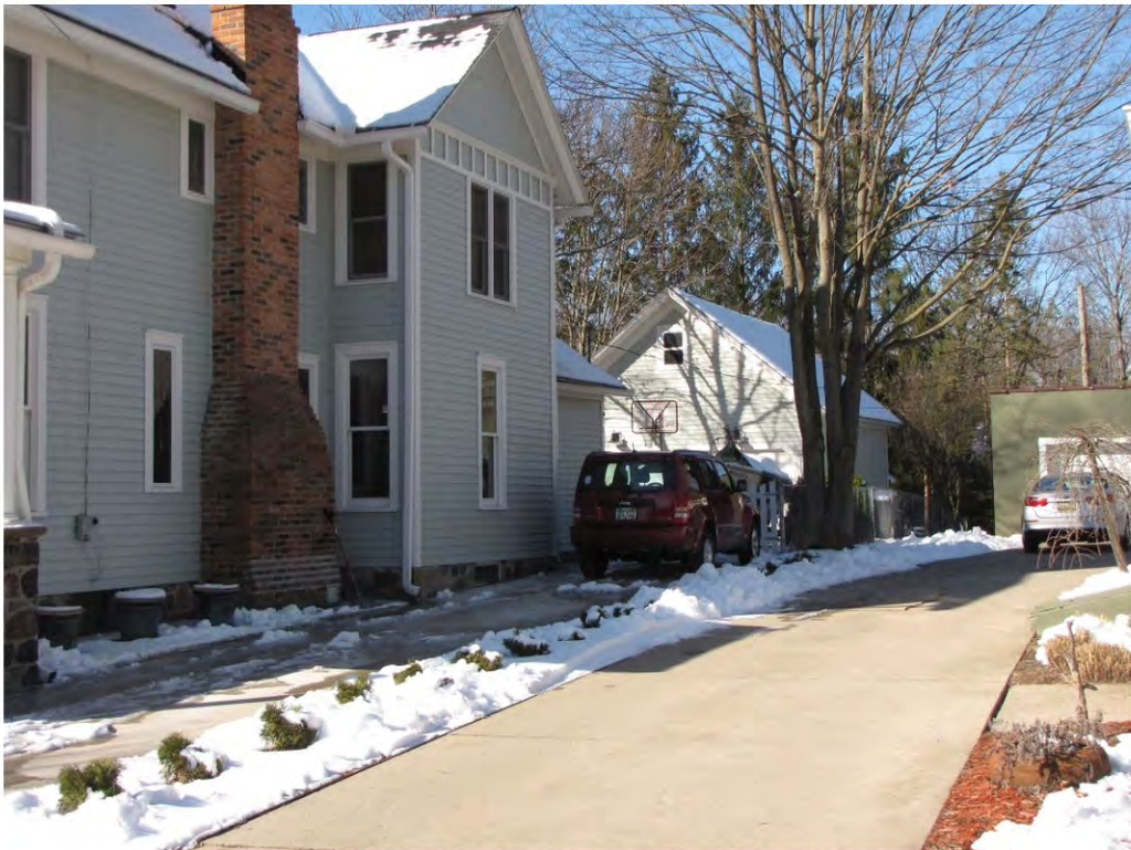
Rogers South 128, Garage_Looking West