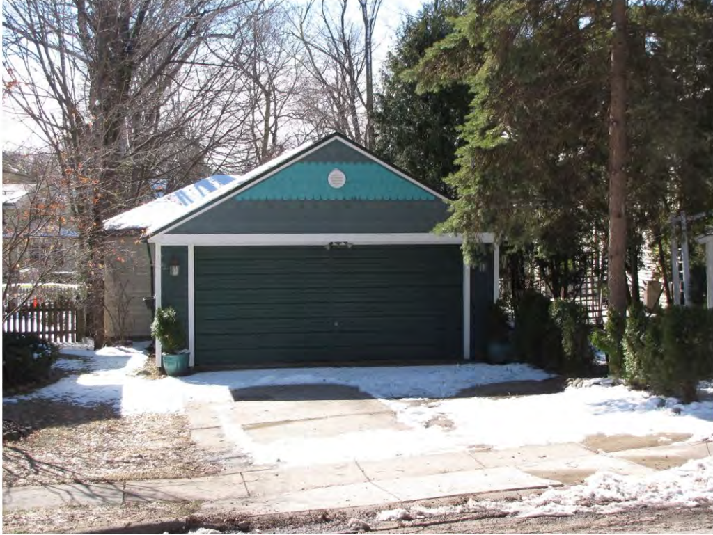
Rogers North 234, Garage_Looking South