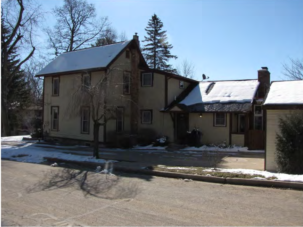
Rogers North 231_Looking Southwest