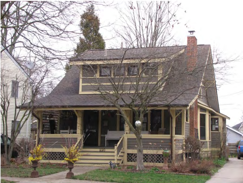
Linden 220_Looking Northeast