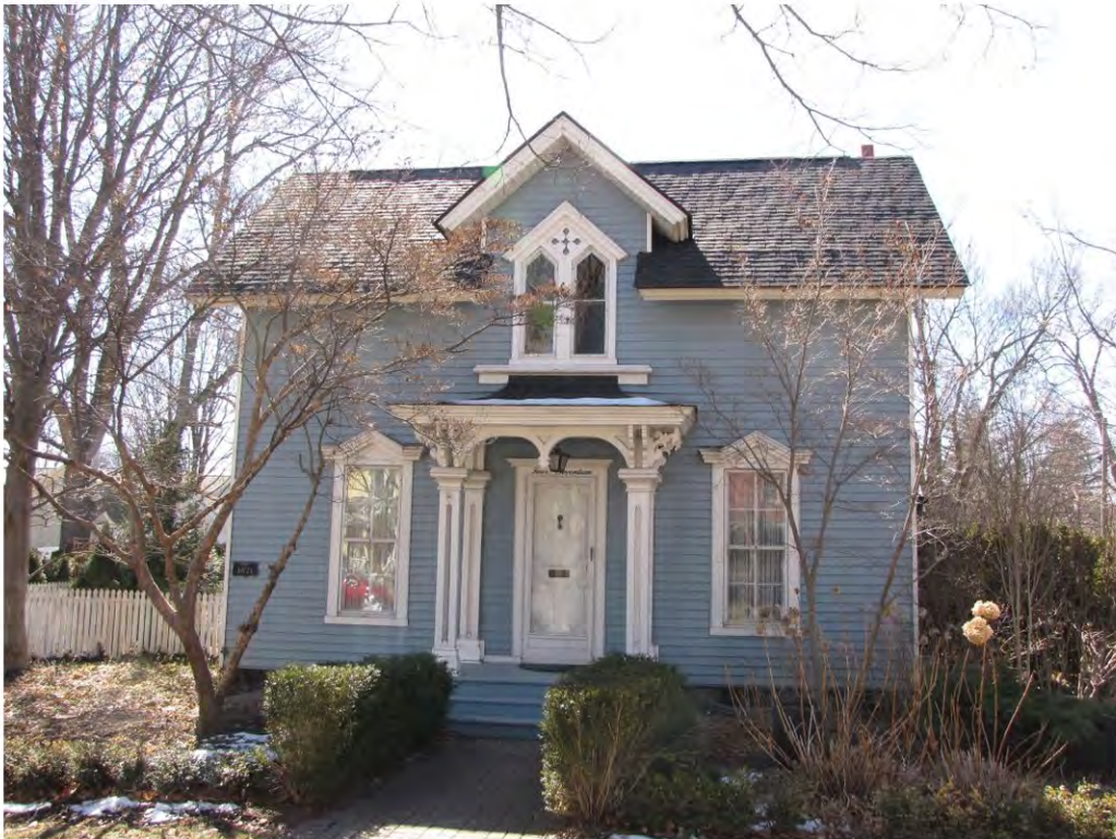
Dunlap West 417_Looking South