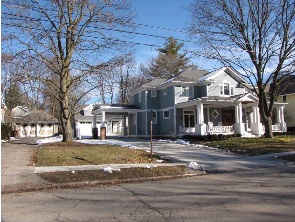
Cady West 500_ Looking Northeast