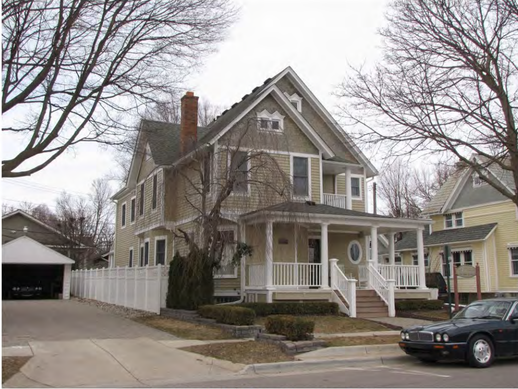
Wing North 117_Looking Northwest