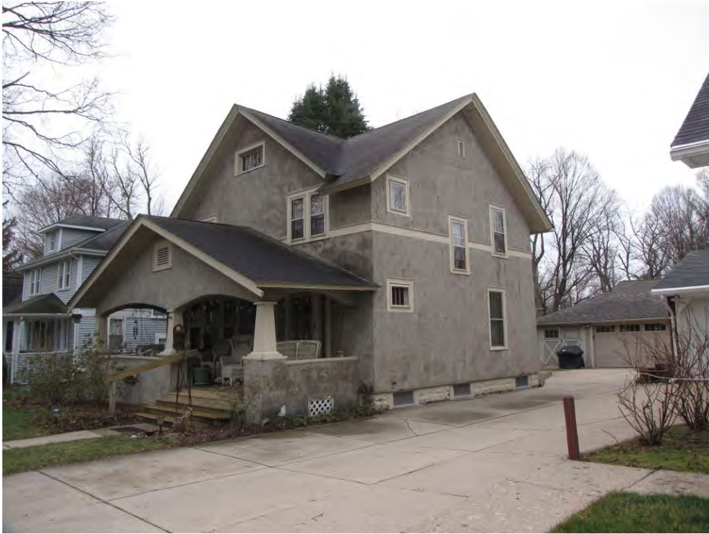
Linden 223_Looking Southwest