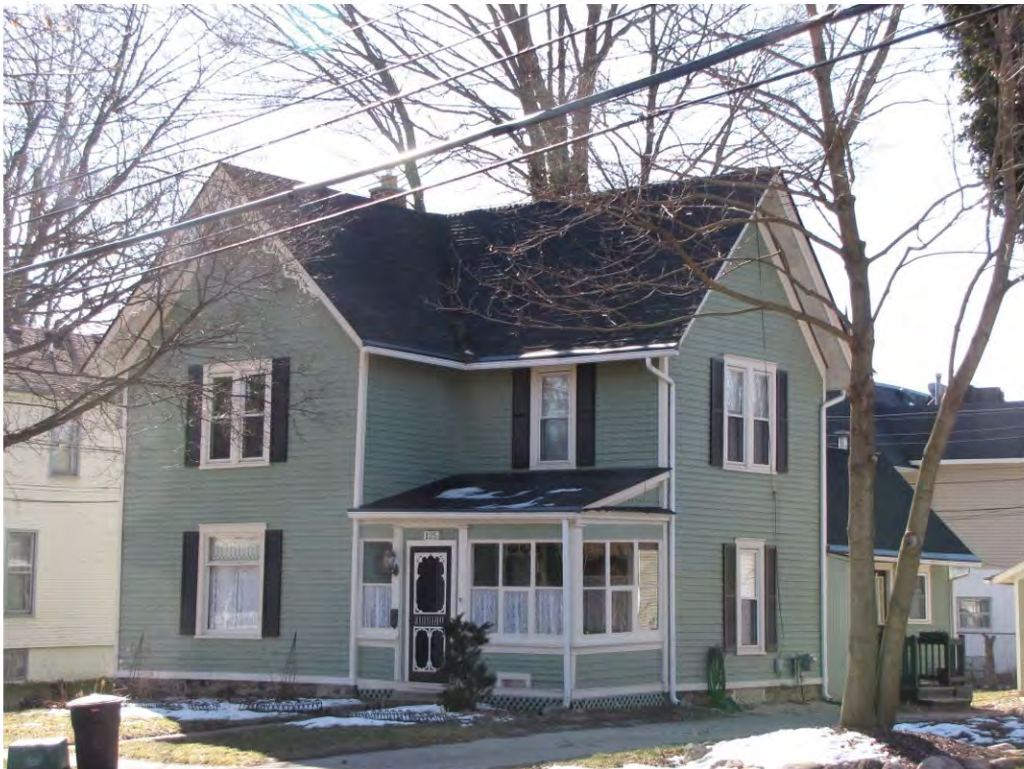
Randolph 125_Looking Southeast