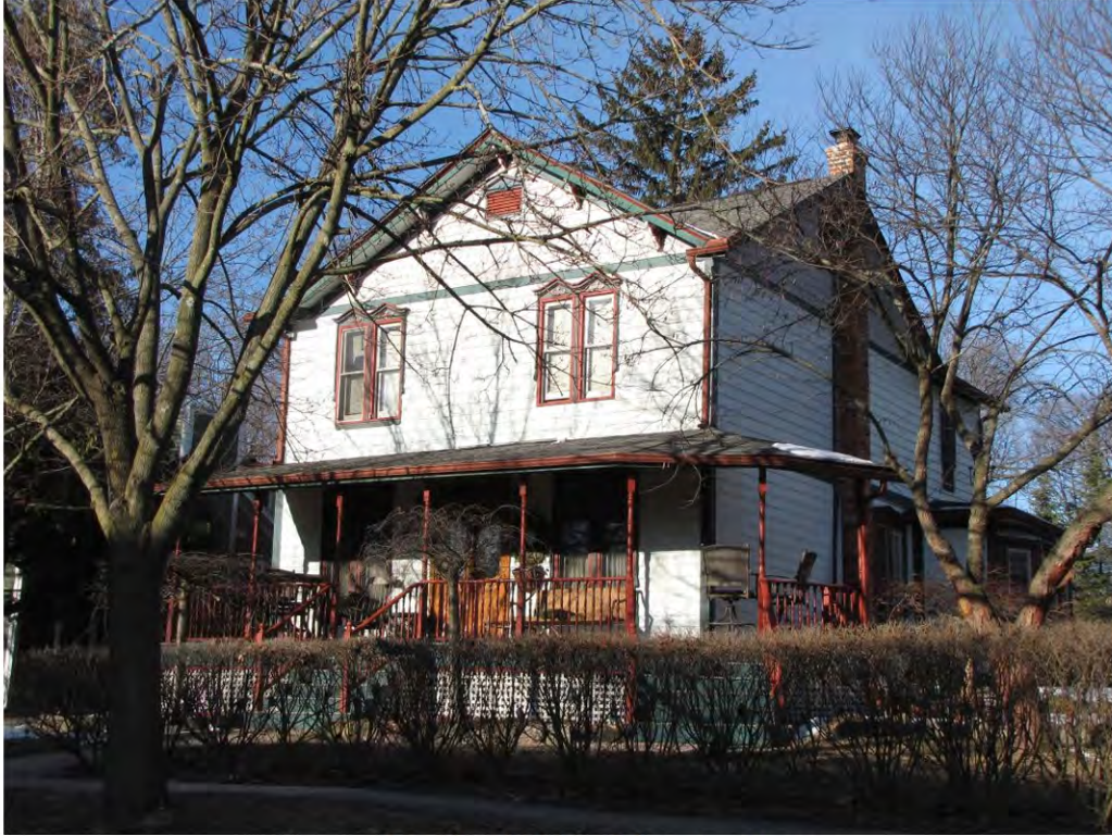
Rogers North 365_Looking Southwest