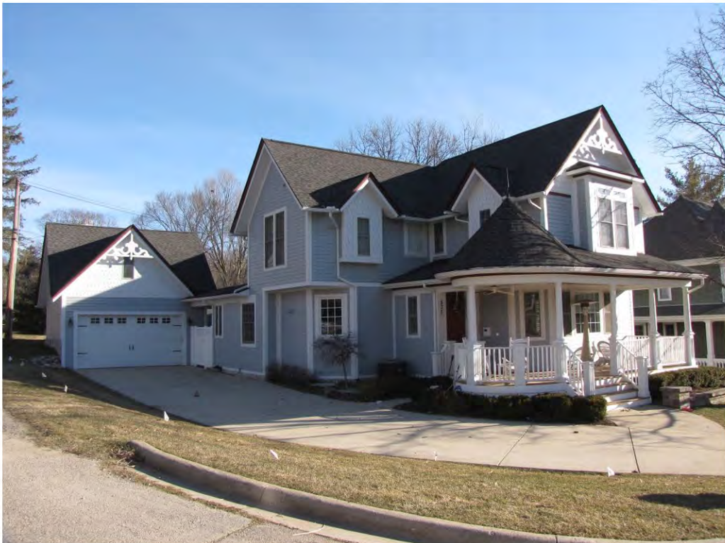
Linden Court 535_ Looking Northeast