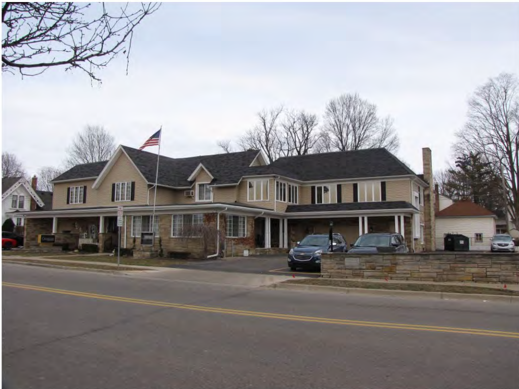
Dunlap West 122_Looking North