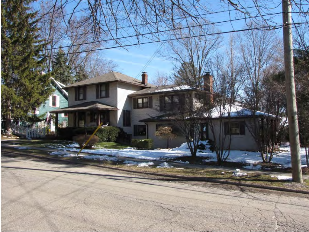
Rogers North 230_Looking Northeast