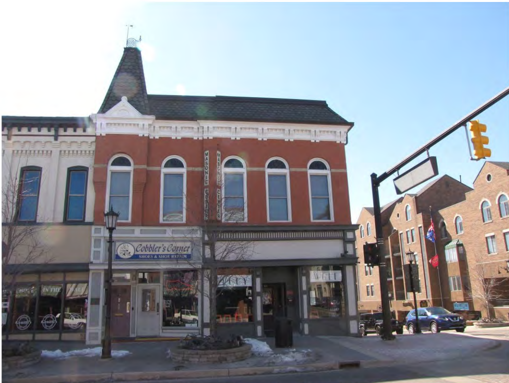
Main East 102-106 and Center South 113_Looking South