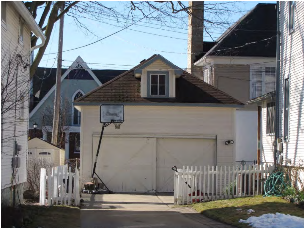
Randolph 119, Garage_Looking South