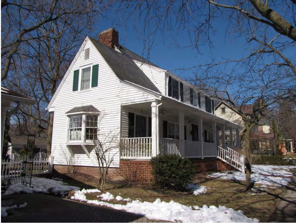
Linden 105_Looking Northwest