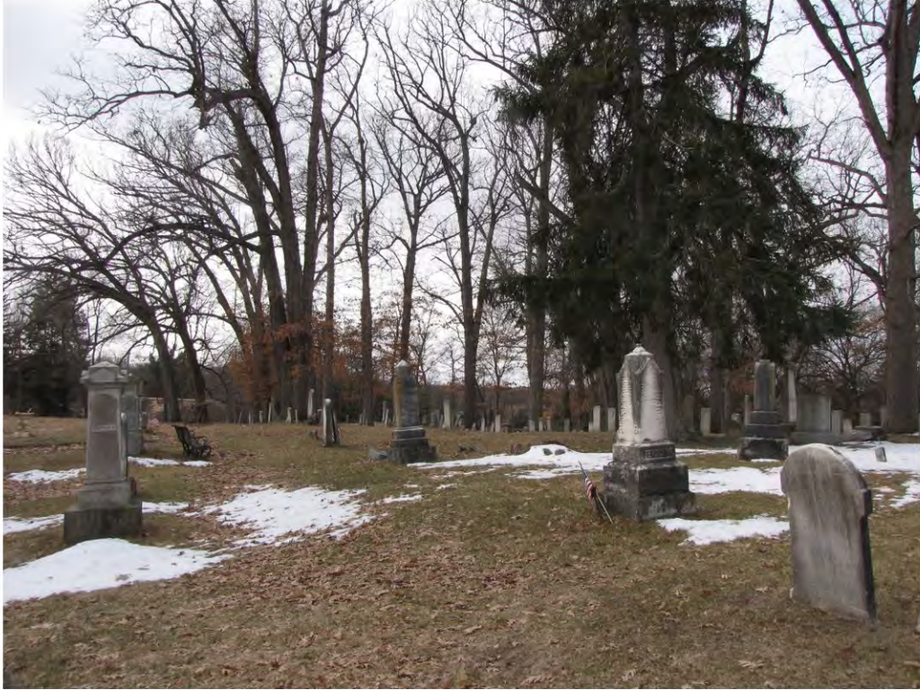
Cady West NVA 17_Looking Southwest