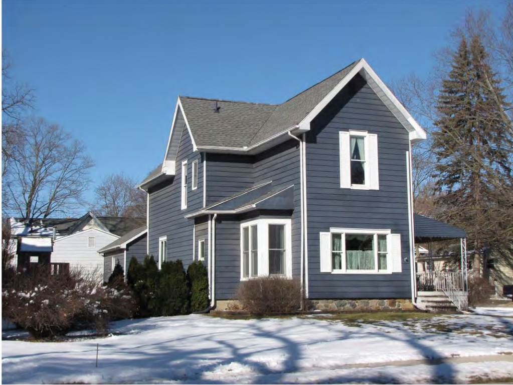
Rogers South 102_Looking Northwest