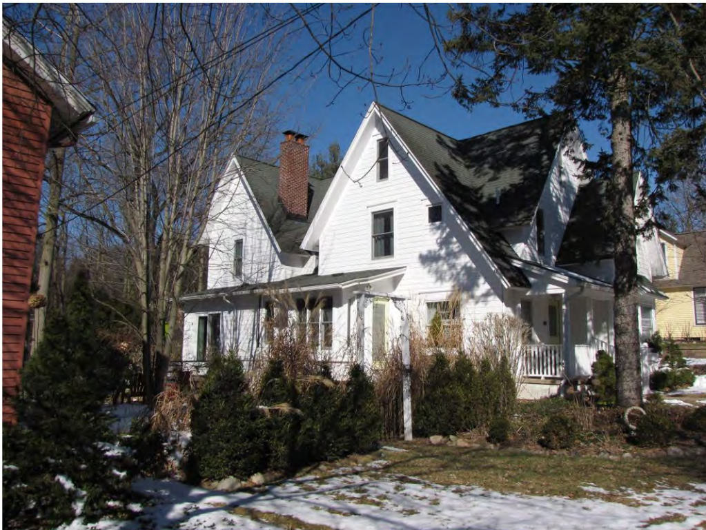
Rogers North 207_Looking Northwest