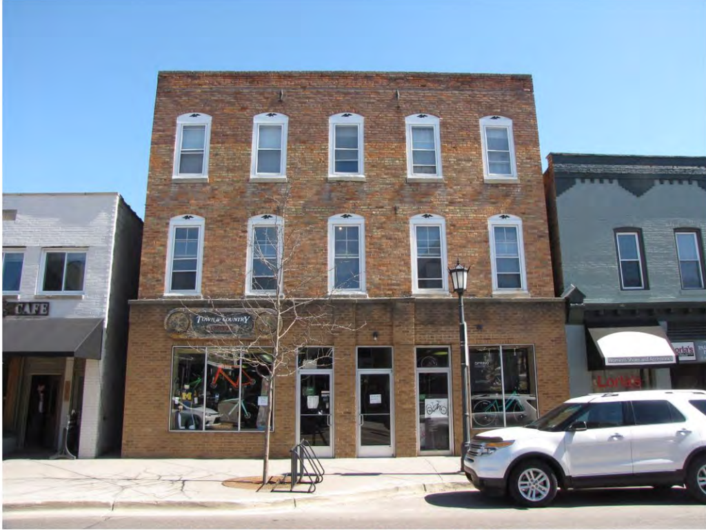
Center North 144-148_Looking East