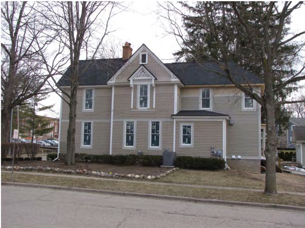
Cady West 495_Looking East