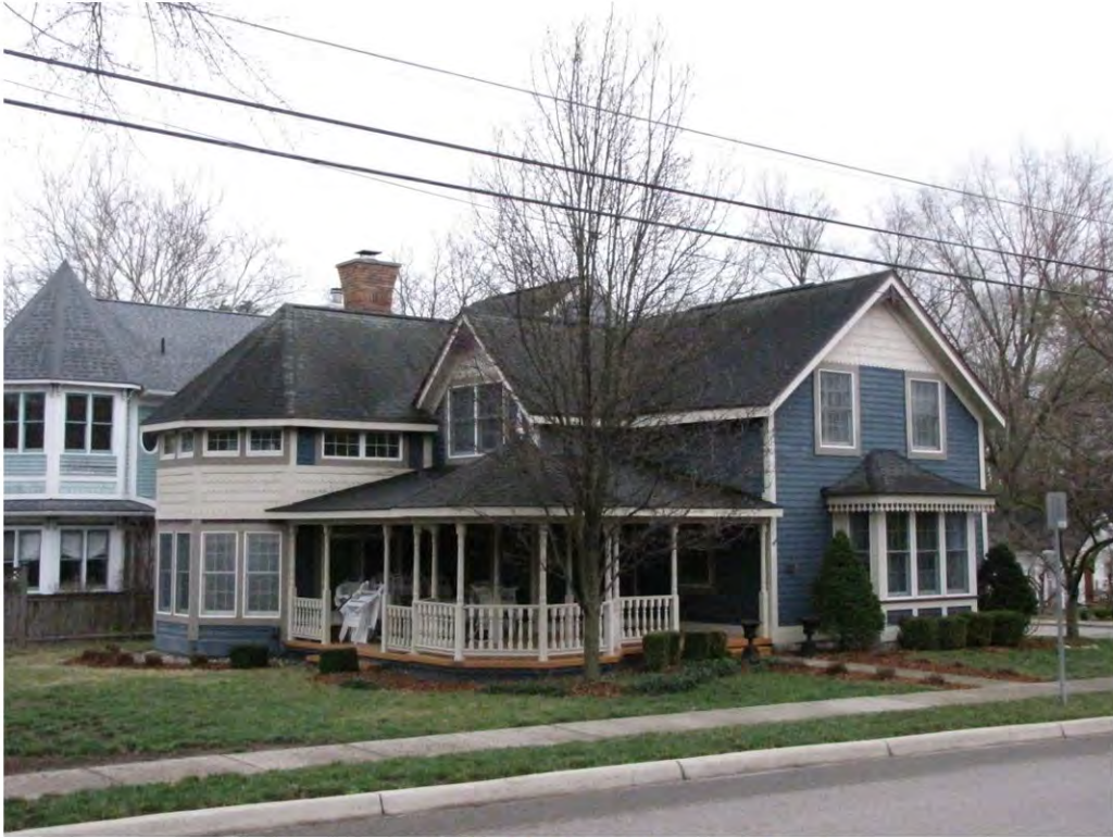
Rogers South 127_Looking Southeast