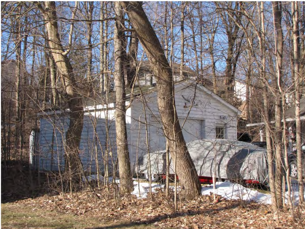
Randolph 545, Garage_Looking Southwest