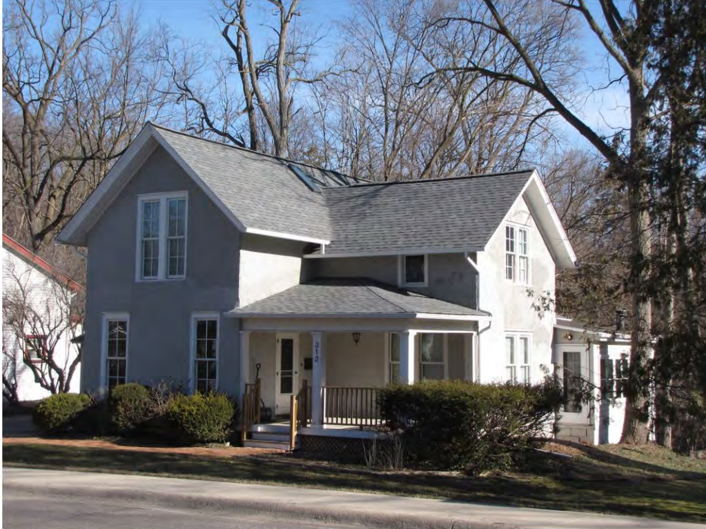
Randolph 312_Looking Northwest