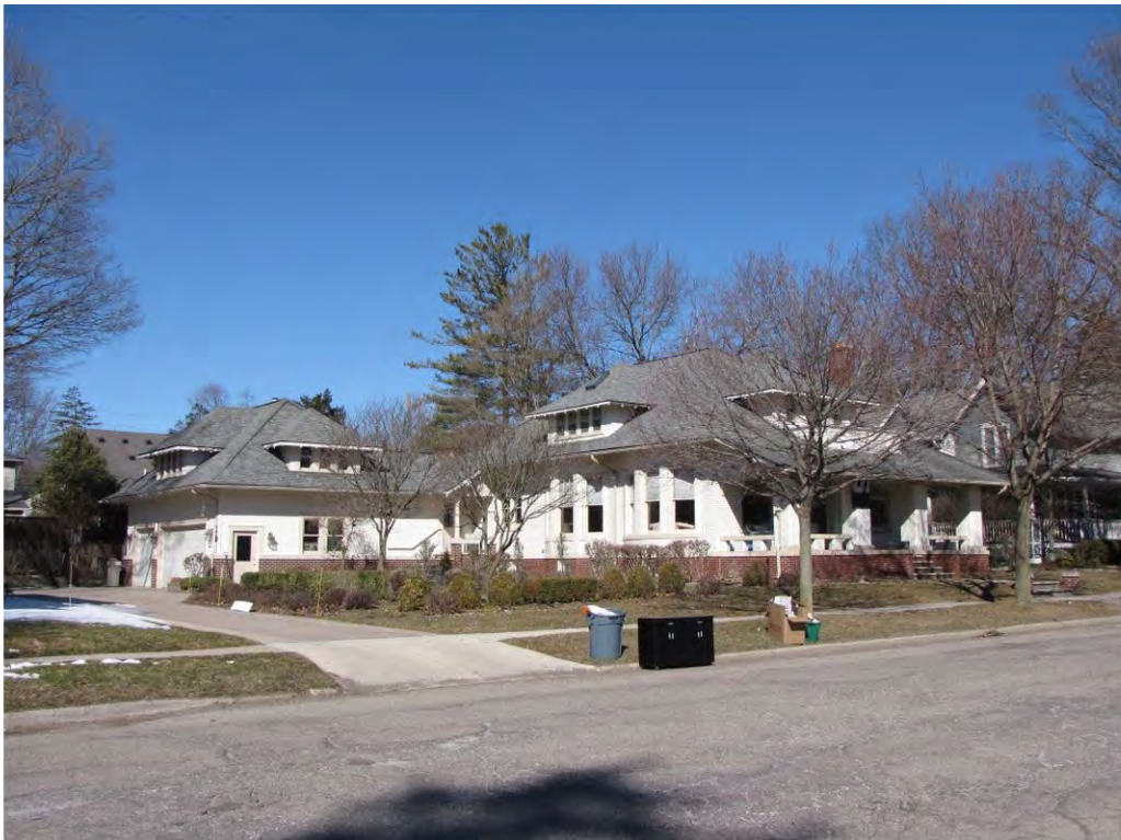
High 223_Looking Northwest