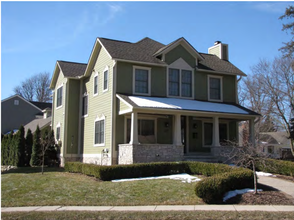
Randolph 413_Looking Southwest