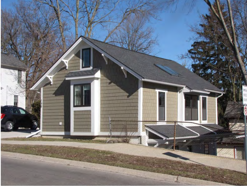
Randolph 108_Looking Northwest