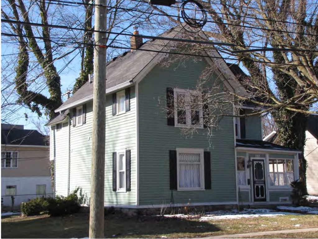
Randolph 125_ Looking Southwest