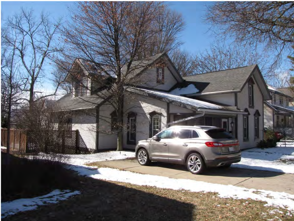
Dubuar 419_Looking Southwest