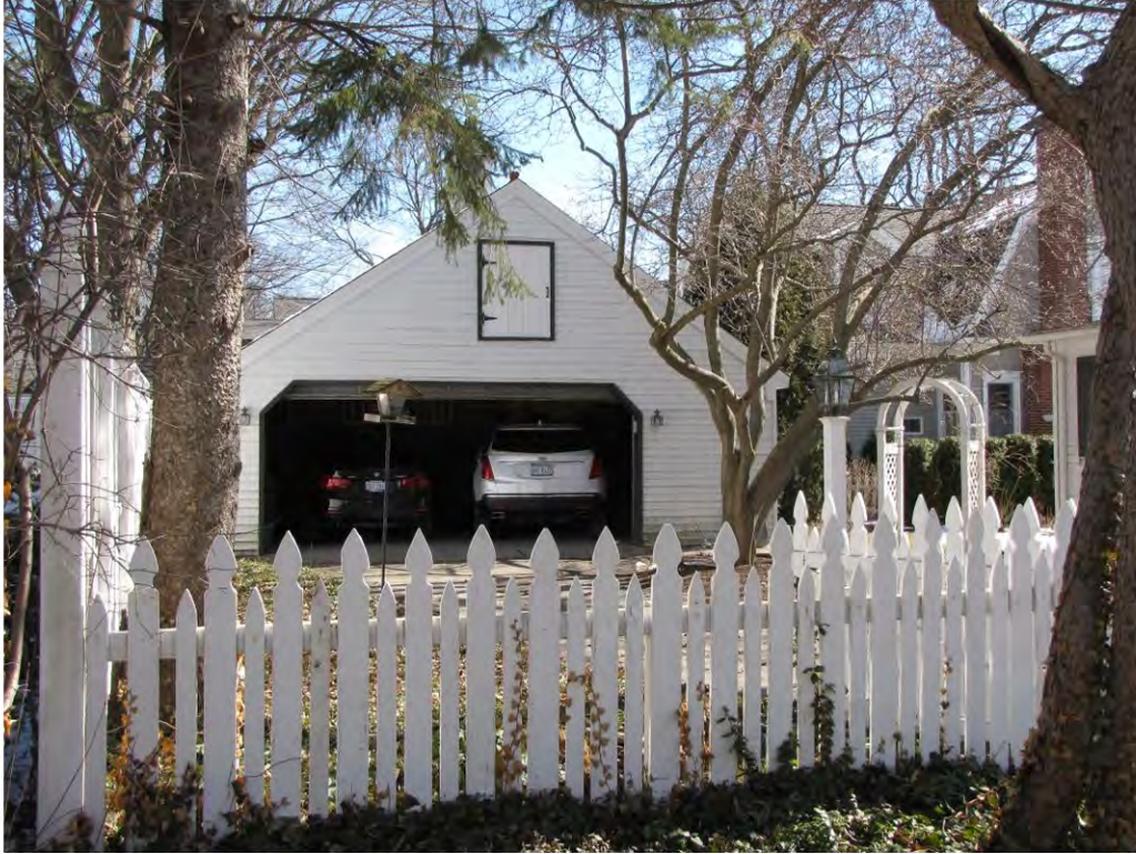
Main West 548, Garage_Looking East