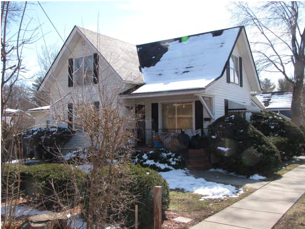
Rogers South 117_Looking Southeast