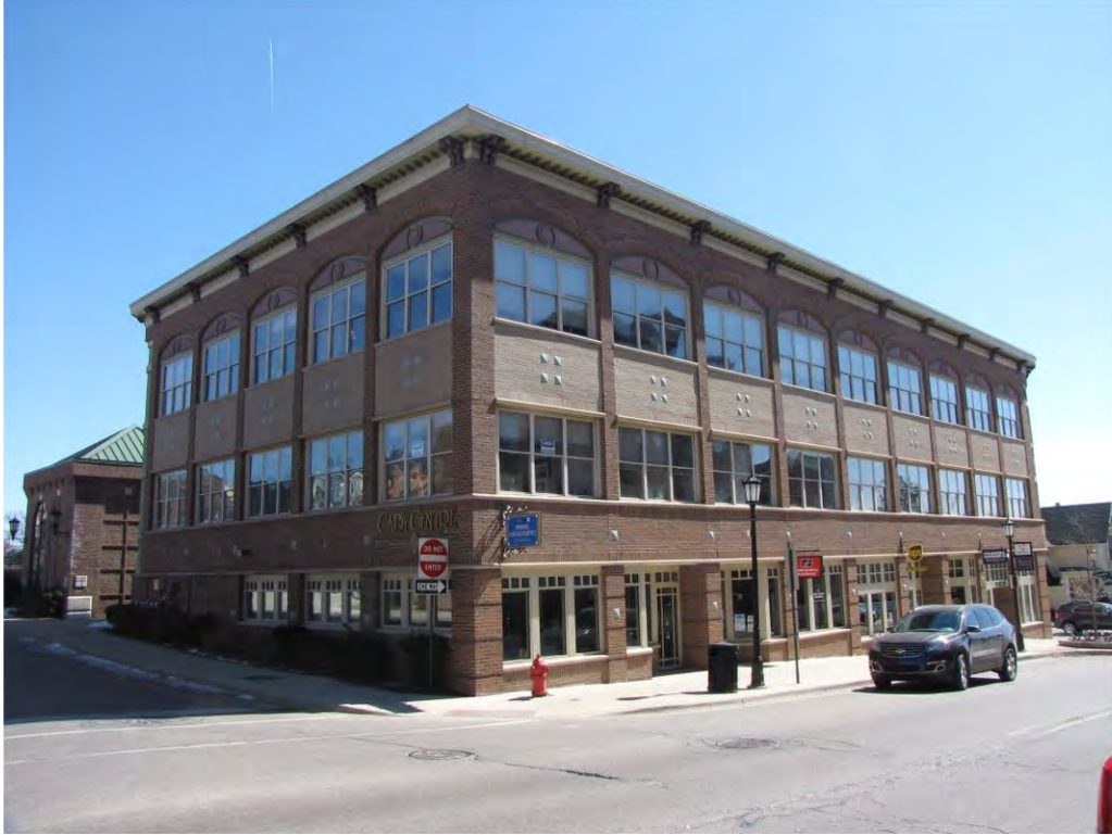
CadyCentre 125_Looking Northwest