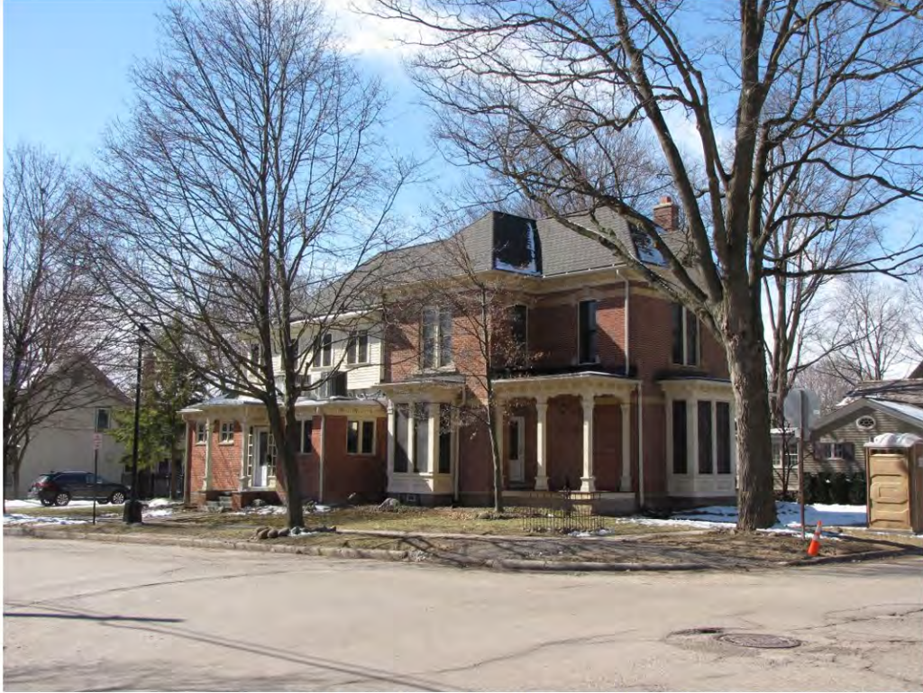
Dunlap West 501_Looking Southwest