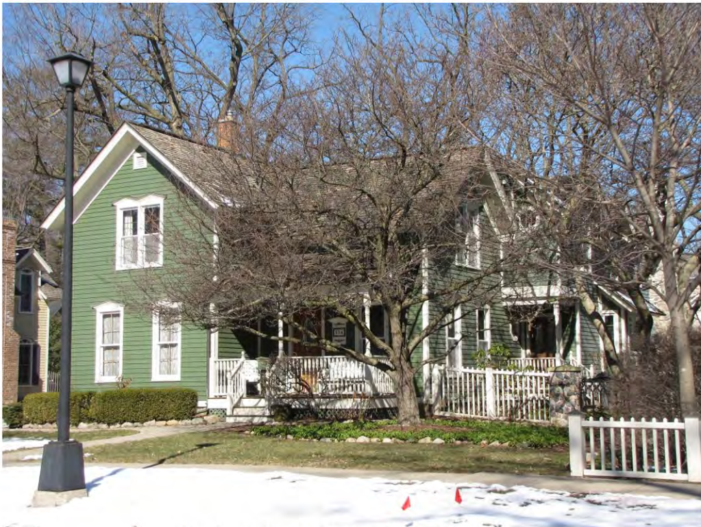
Dunlap West 534_Looking Northwest