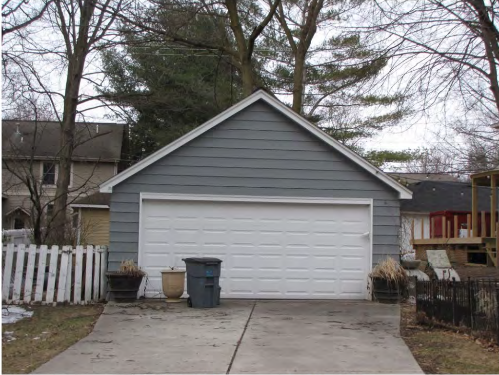
Cady West 501, Garage_Looking West