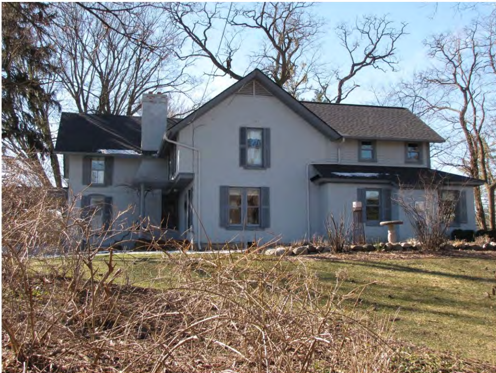
High 239_Looking South