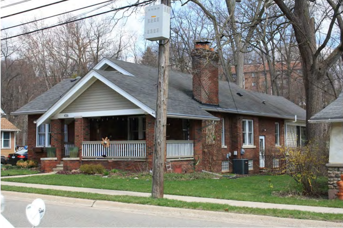
Randolph 436_ Looking Northwest