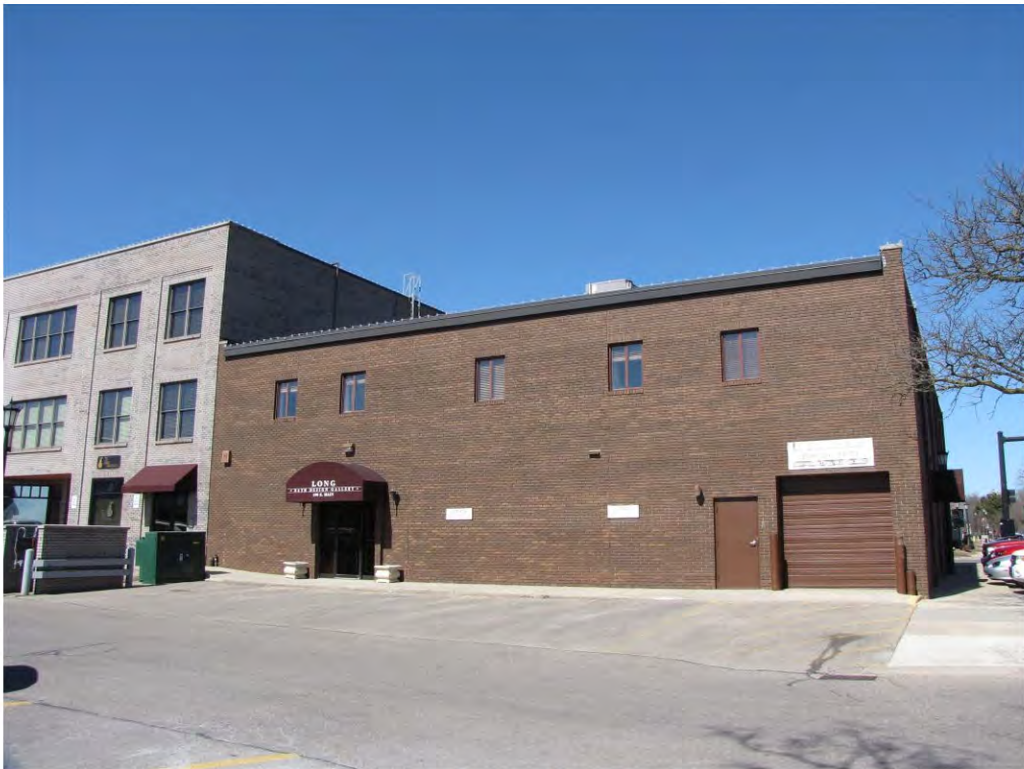
Main East 190_Looking Northwest