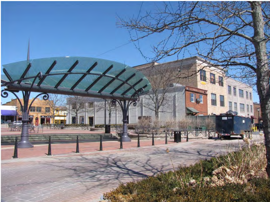
Main East 156 - 158_ Looking Northeast