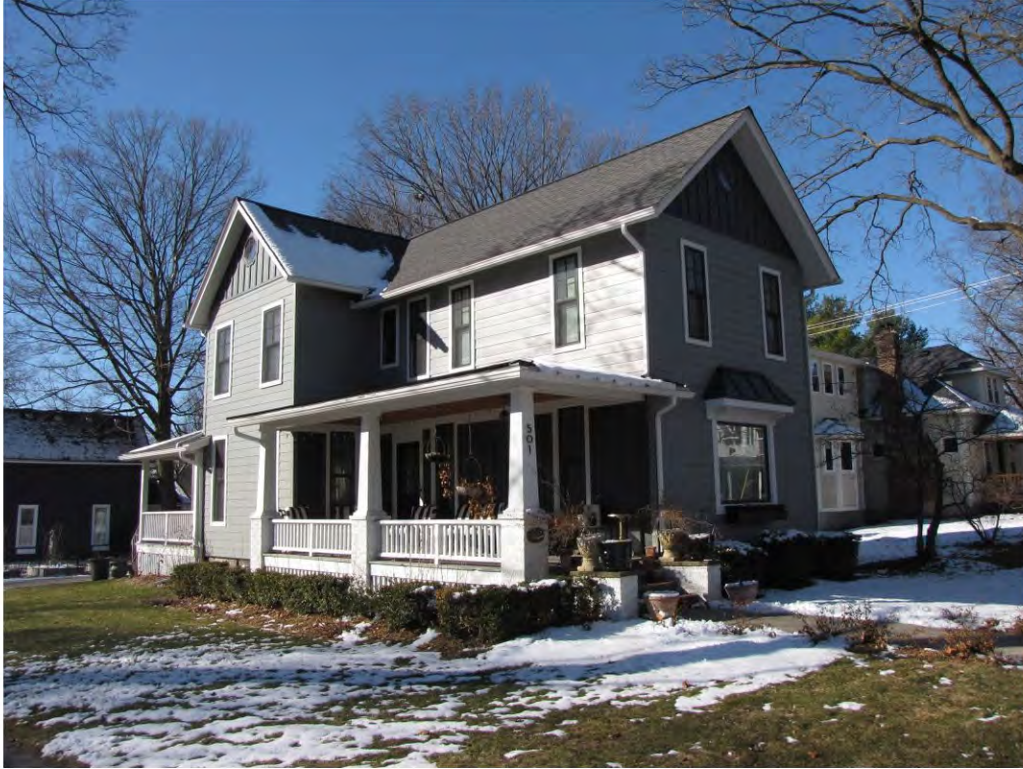
Cady West 501_Looking Southwest