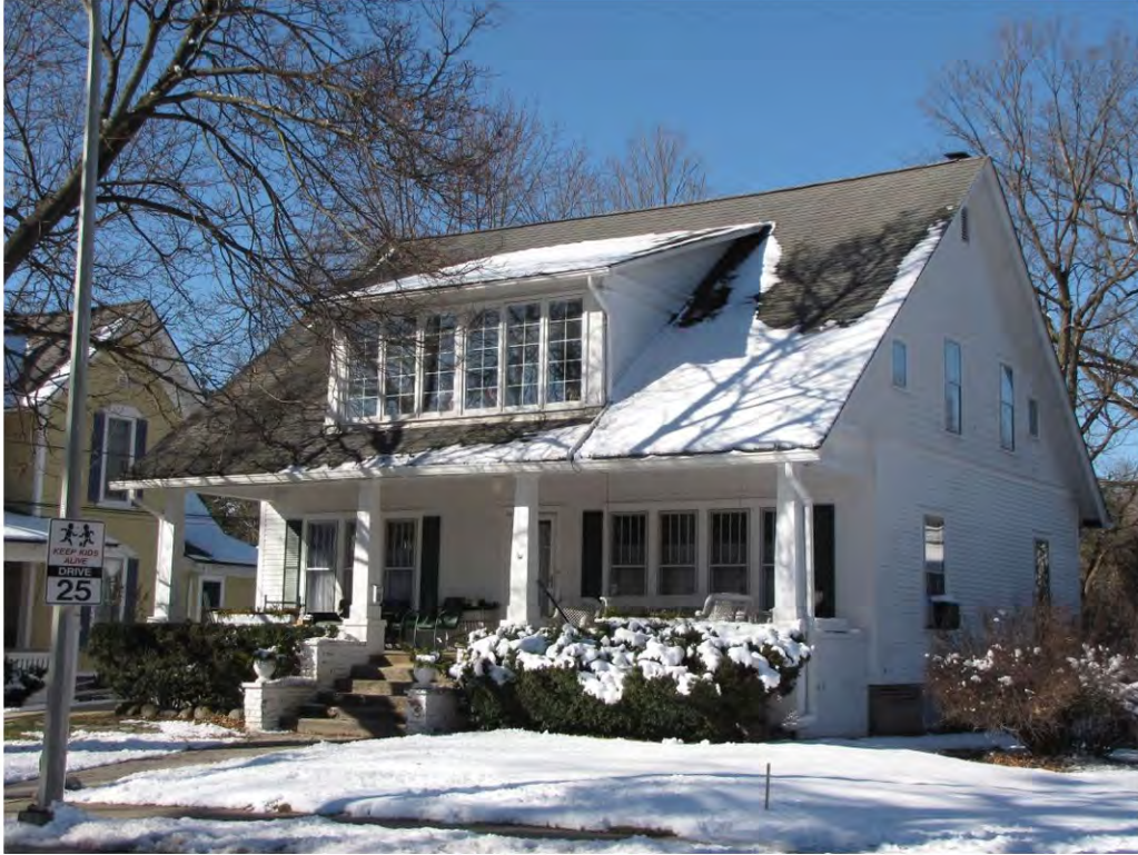
Rogers South 110_Looking Southwest