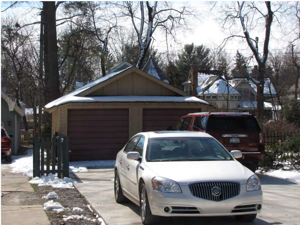
Main West 547, Garage_Looking South