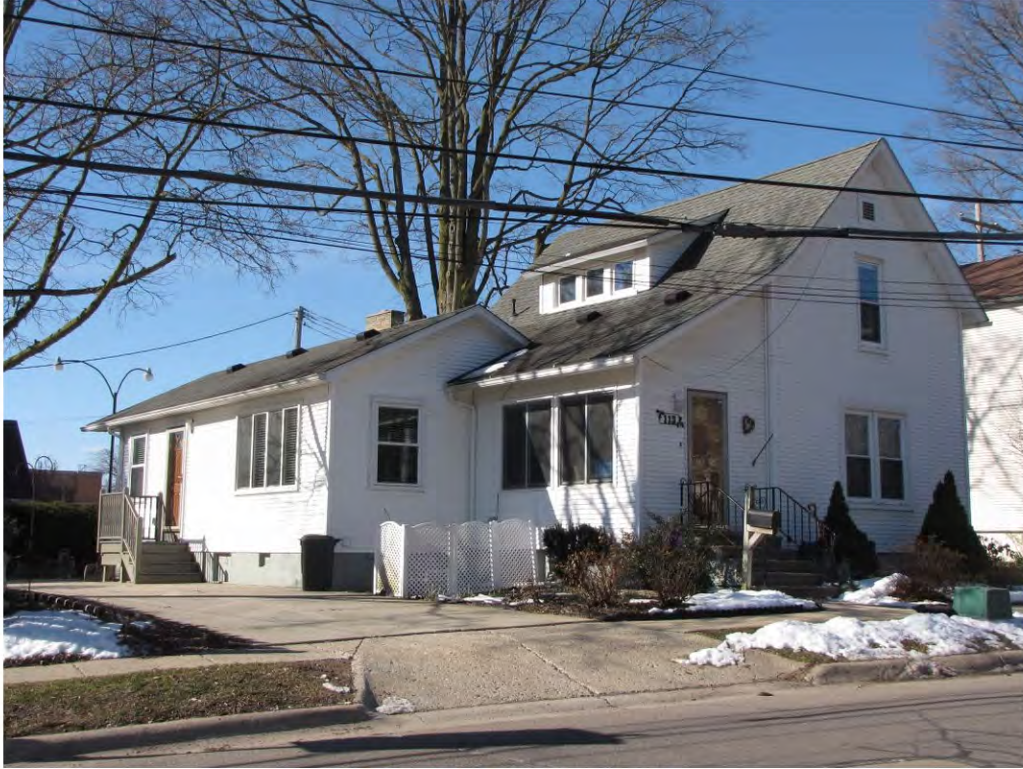
Randolph 113_Looking Southwest