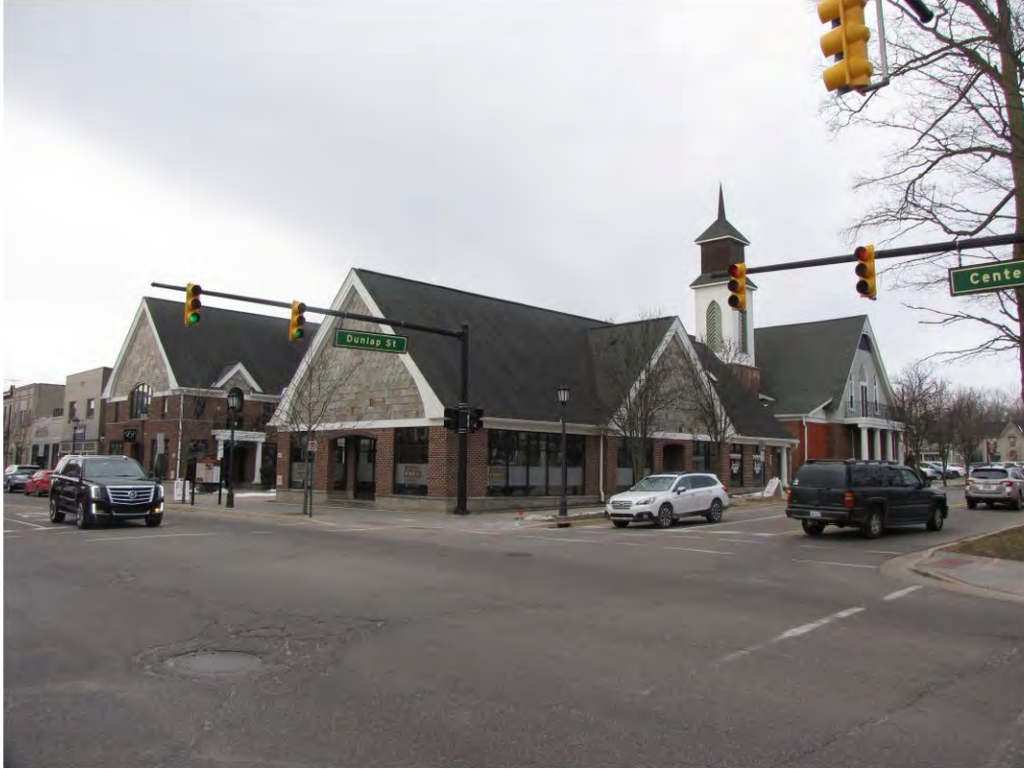
Center North 145_Looking Southwest