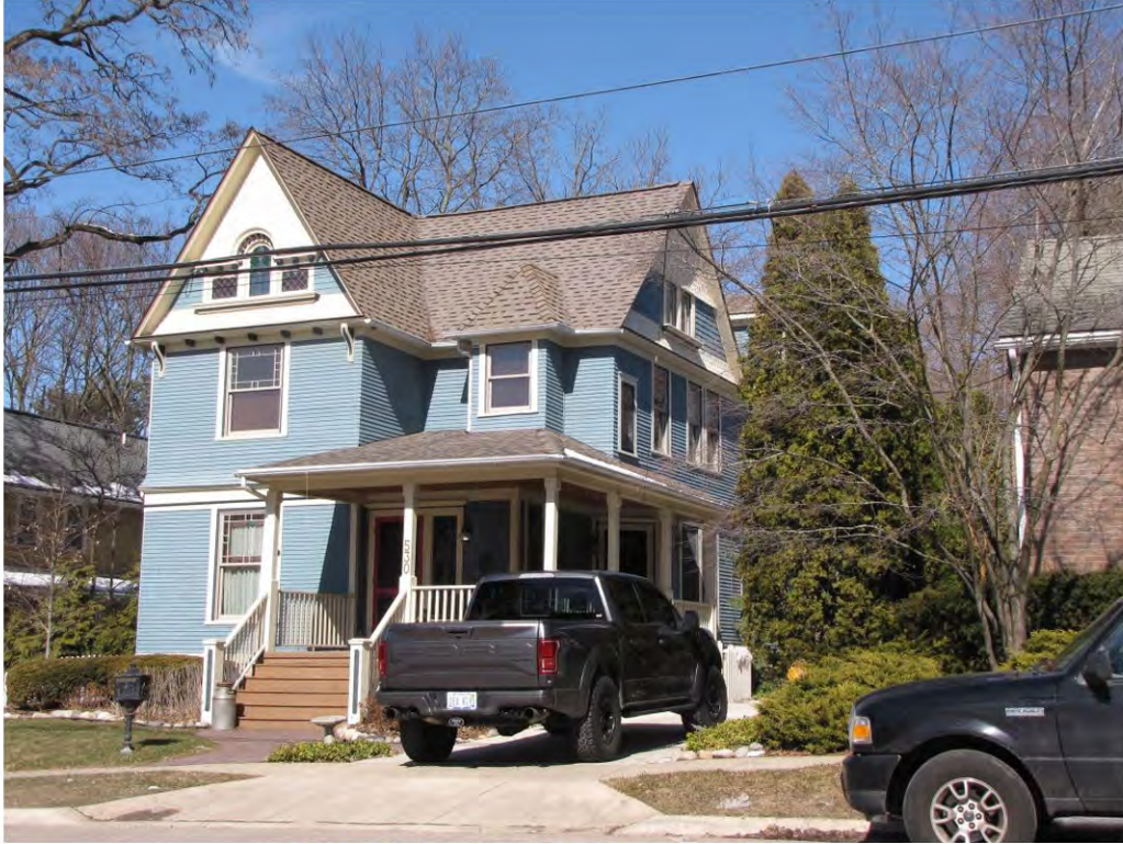
Main West 530_ Looking Northwest