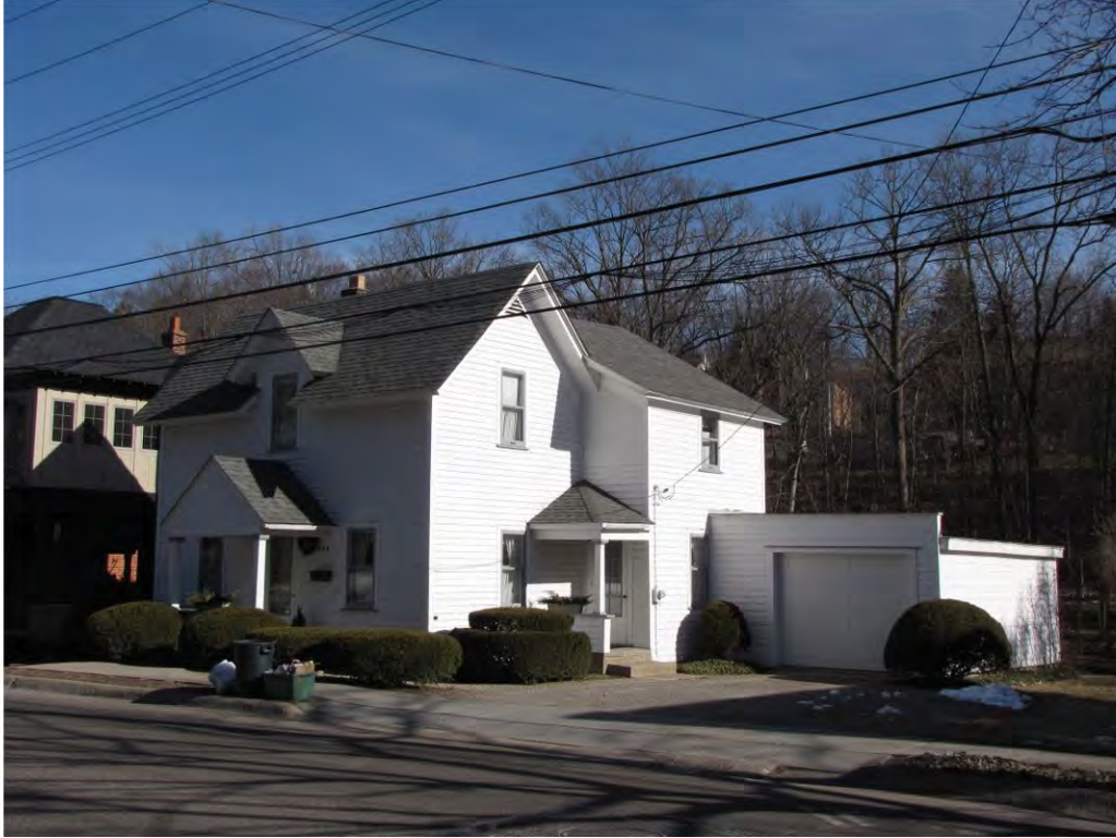
Randolph 504_Looking Northwest