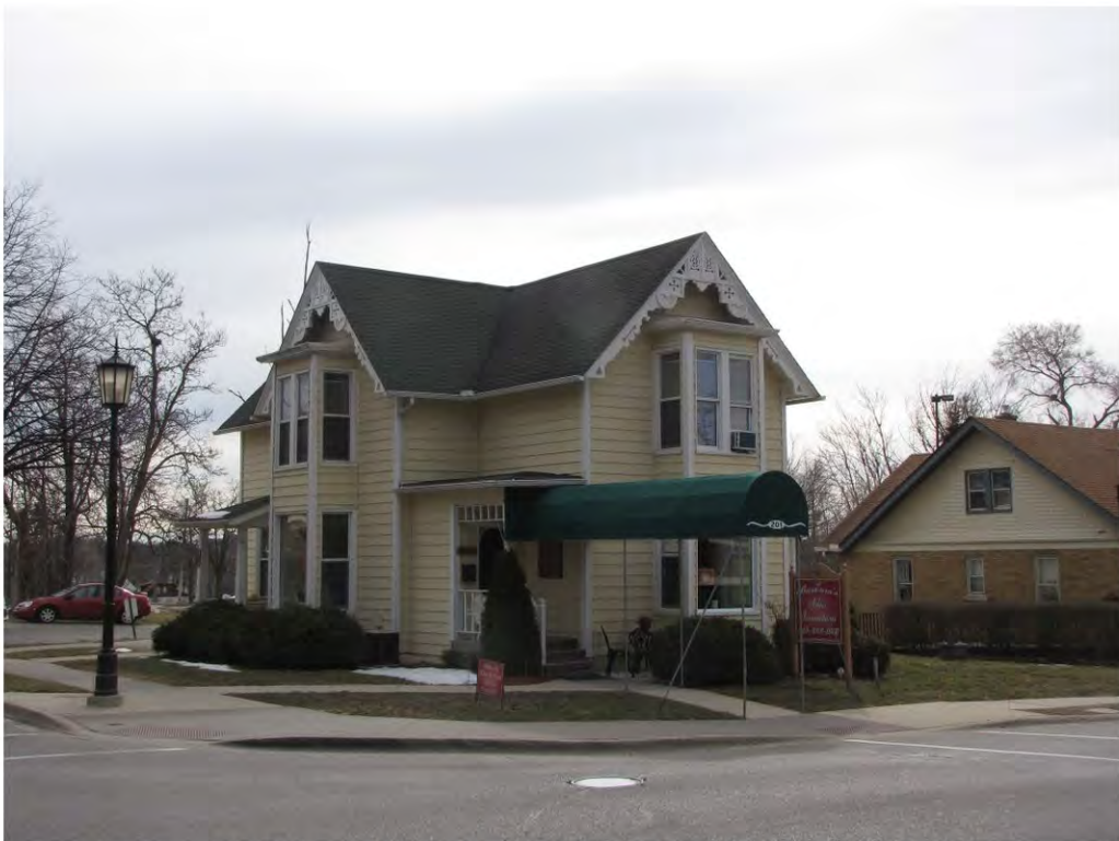
Center South 201 and Cady East 100_Looking Southeast