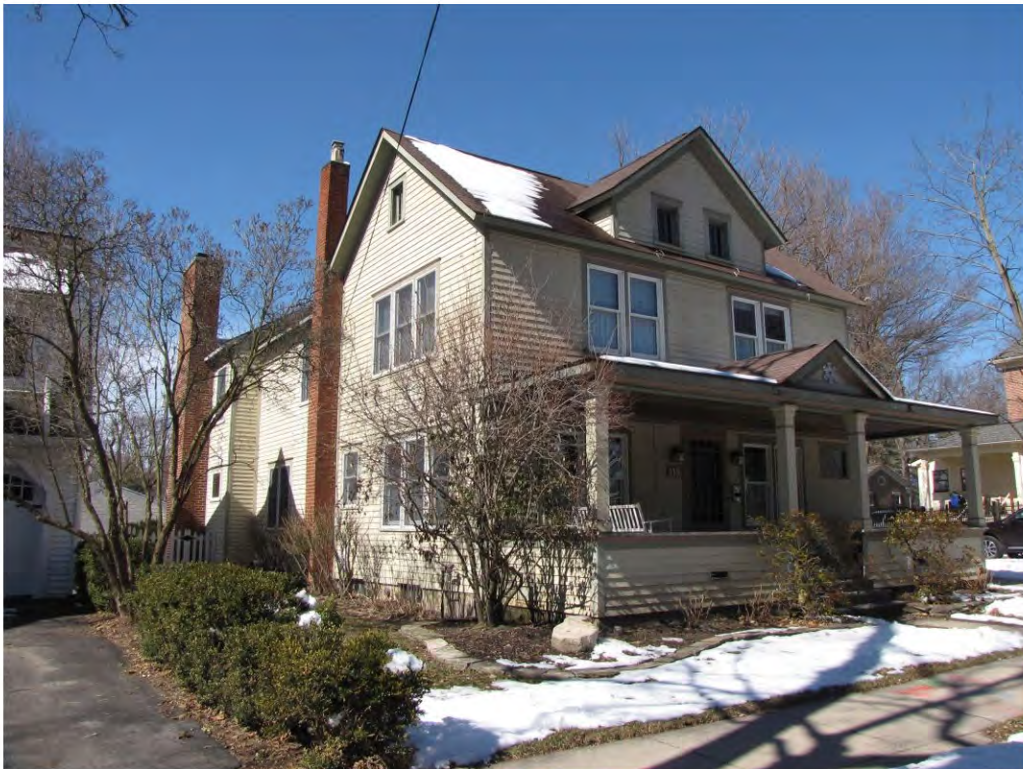
Linden 115_Looking Northwest