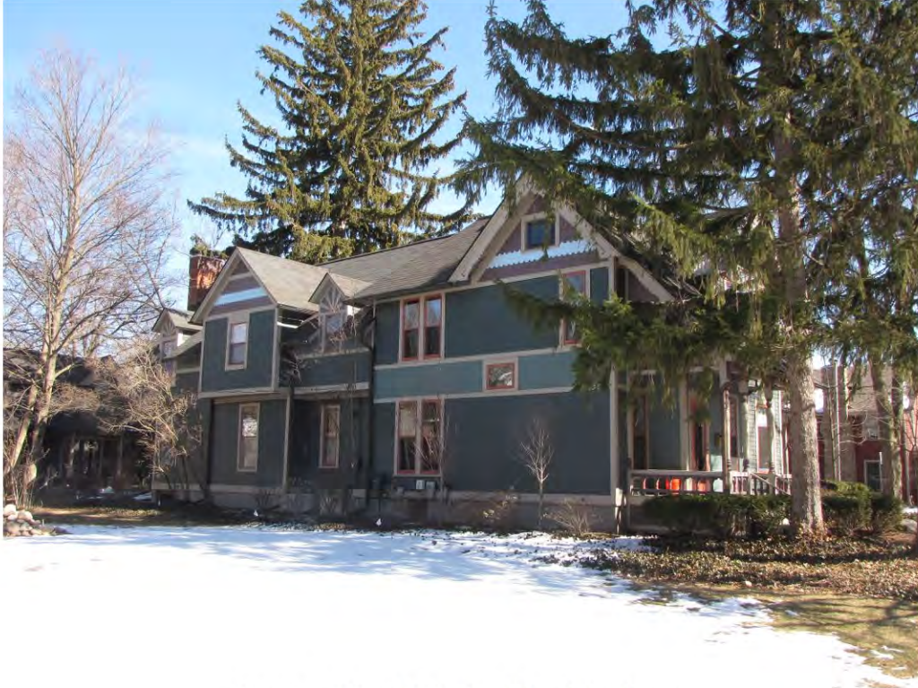
Dunlap West 504_Looking Northeast