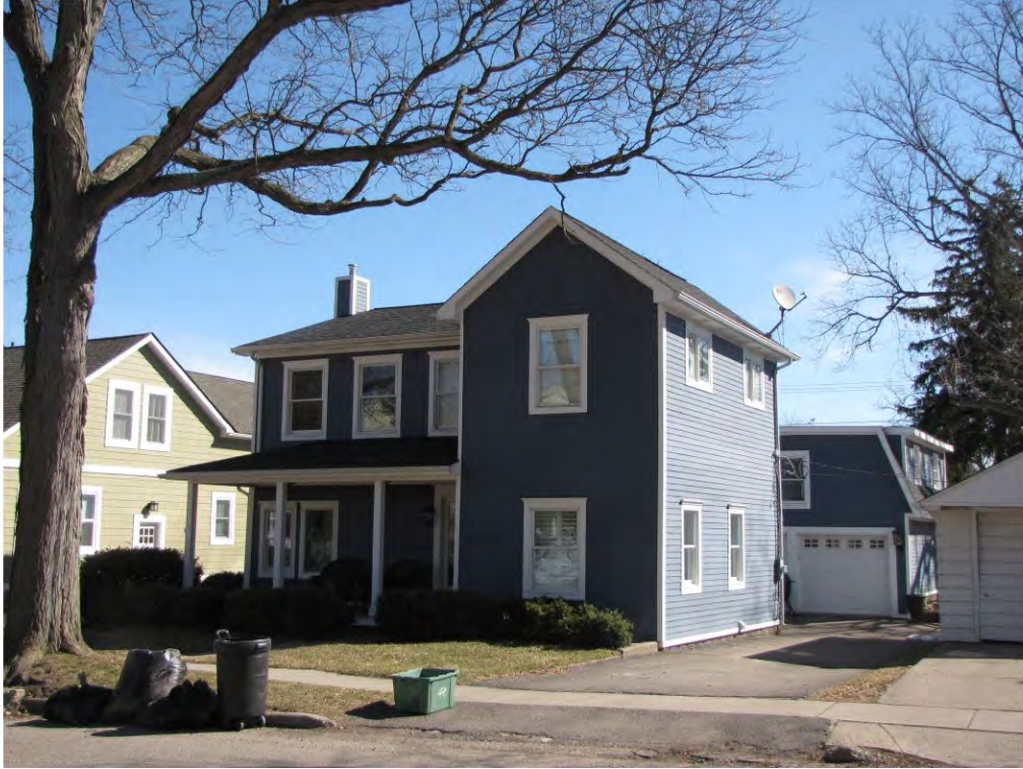
Linden 254_Looking Northeast