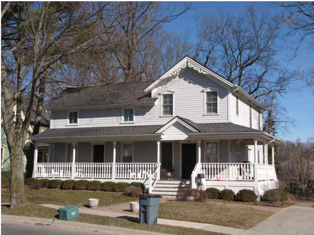
Randolph 116_Looking North