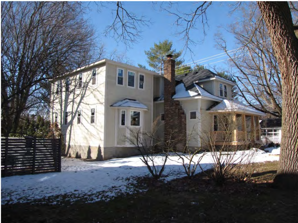
Cady West 511_Looking Southwest