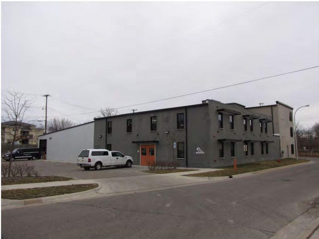
Cady East 459_Looking Northeast