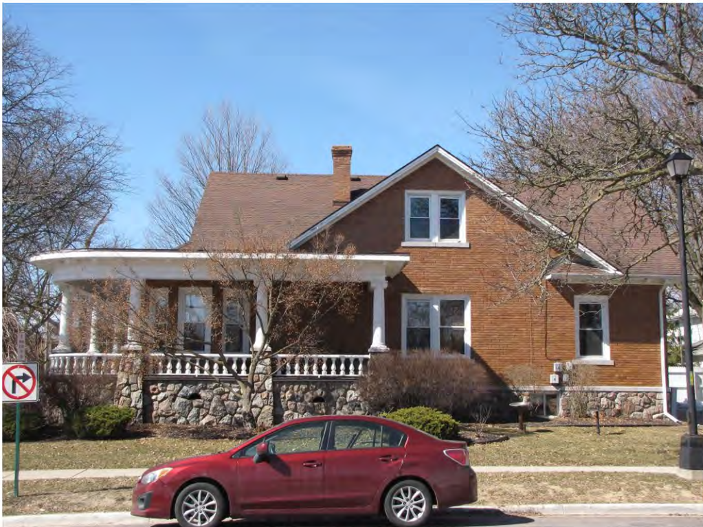
Main West 302_Looking West