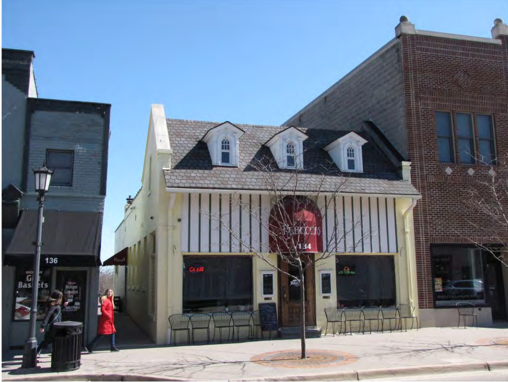
Center North 134_Looking Southeast