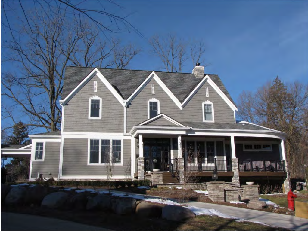
Linden Court 525_Looking West