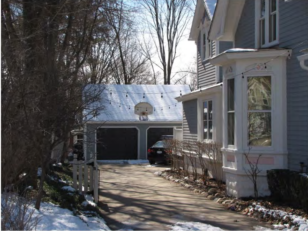
Main West 521, Garage_Looking South