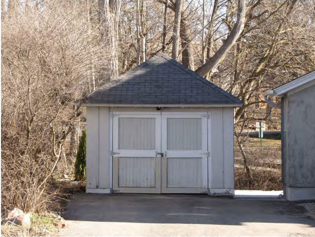
Randolph 312, Shed_Looking North