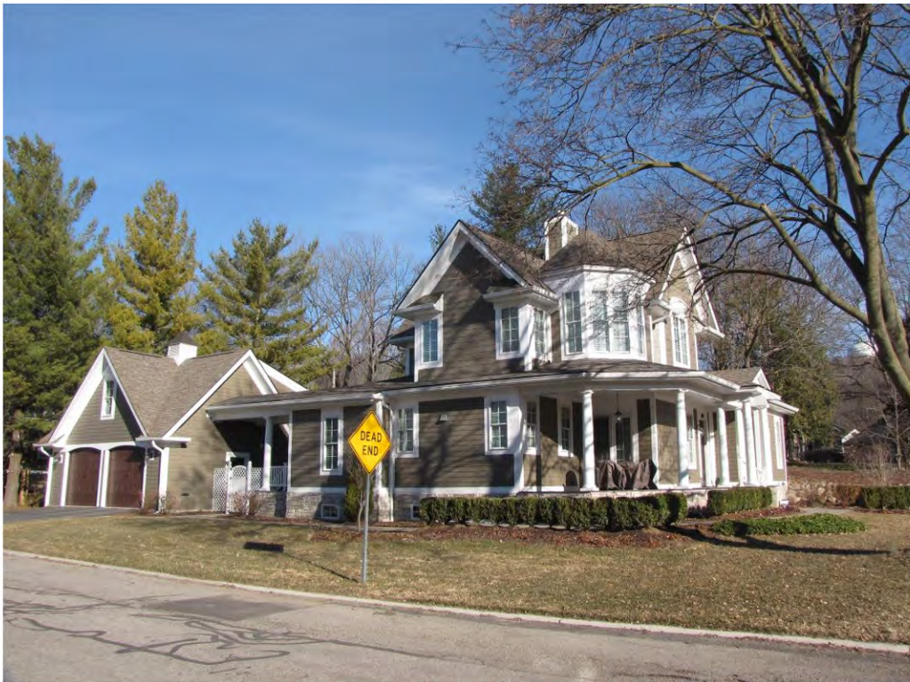
Linden 373_Looking Northwest