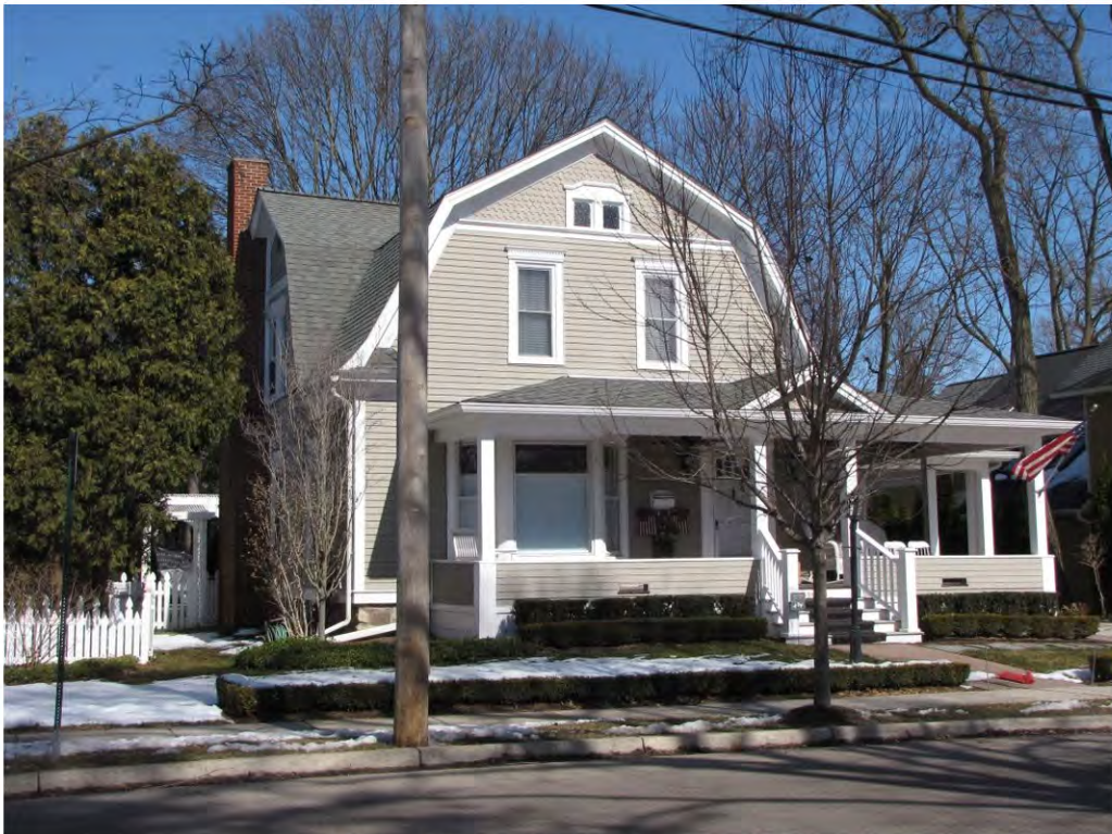
Main West 542_ Looking North