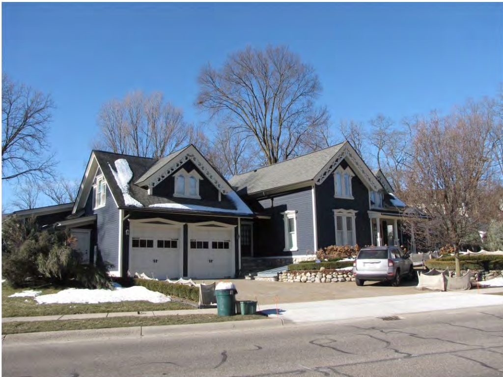
Randolph 521_Looking Southwest