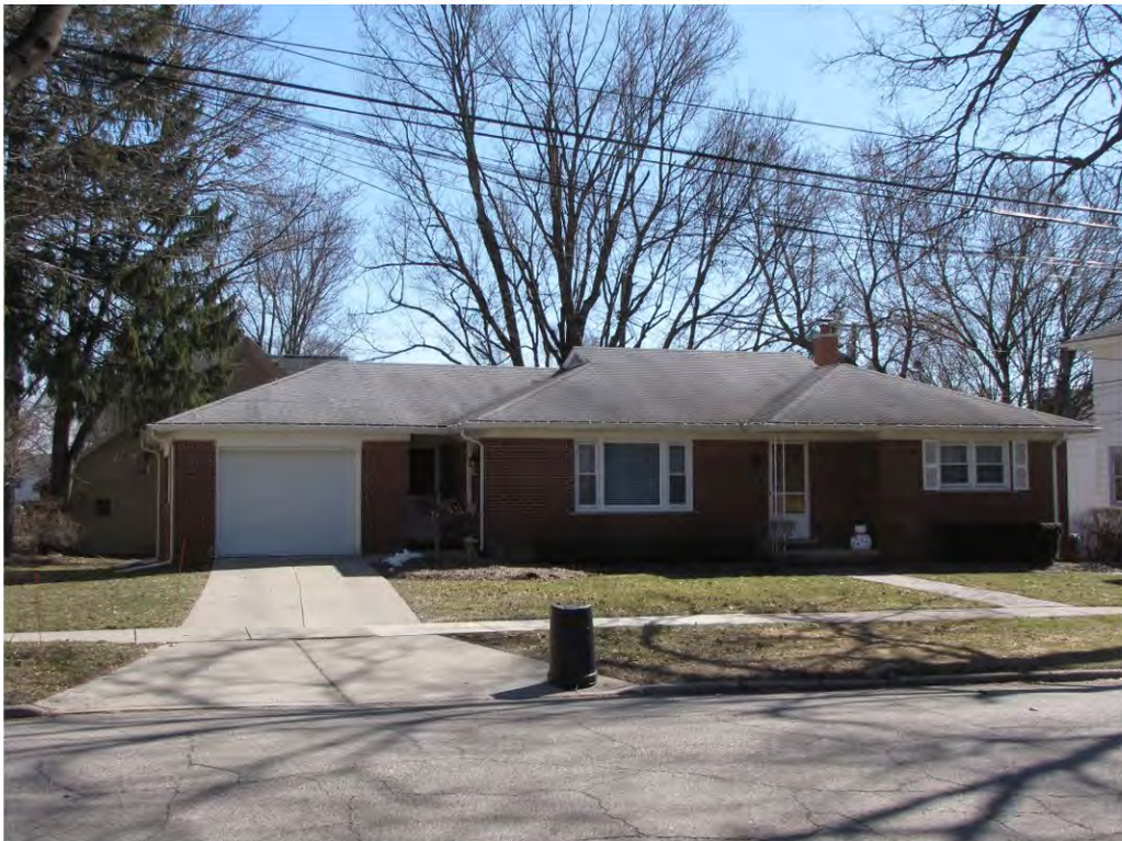
West 120_Looking Southeast