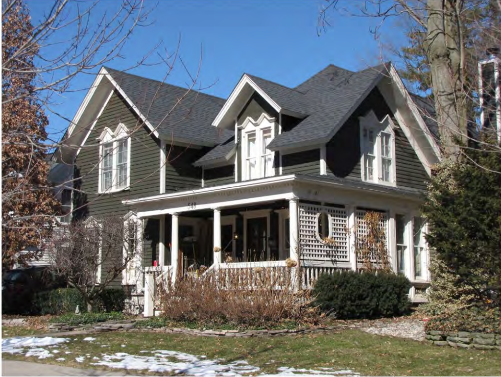
Dunlap West 548_Looking Northwest