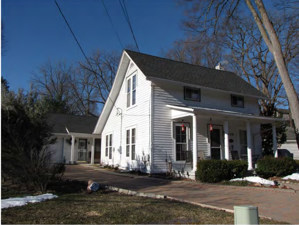
Randolph 529_Looking Southwest