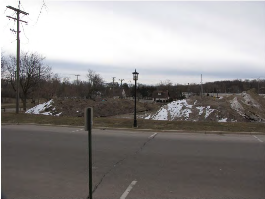
Cady East NVA 5 and 6_Looking South