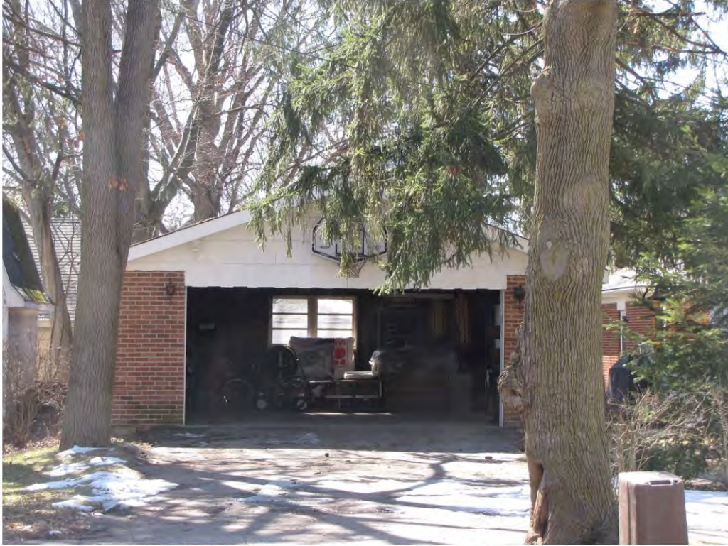
Dunlap West 317, Garage_Looking South