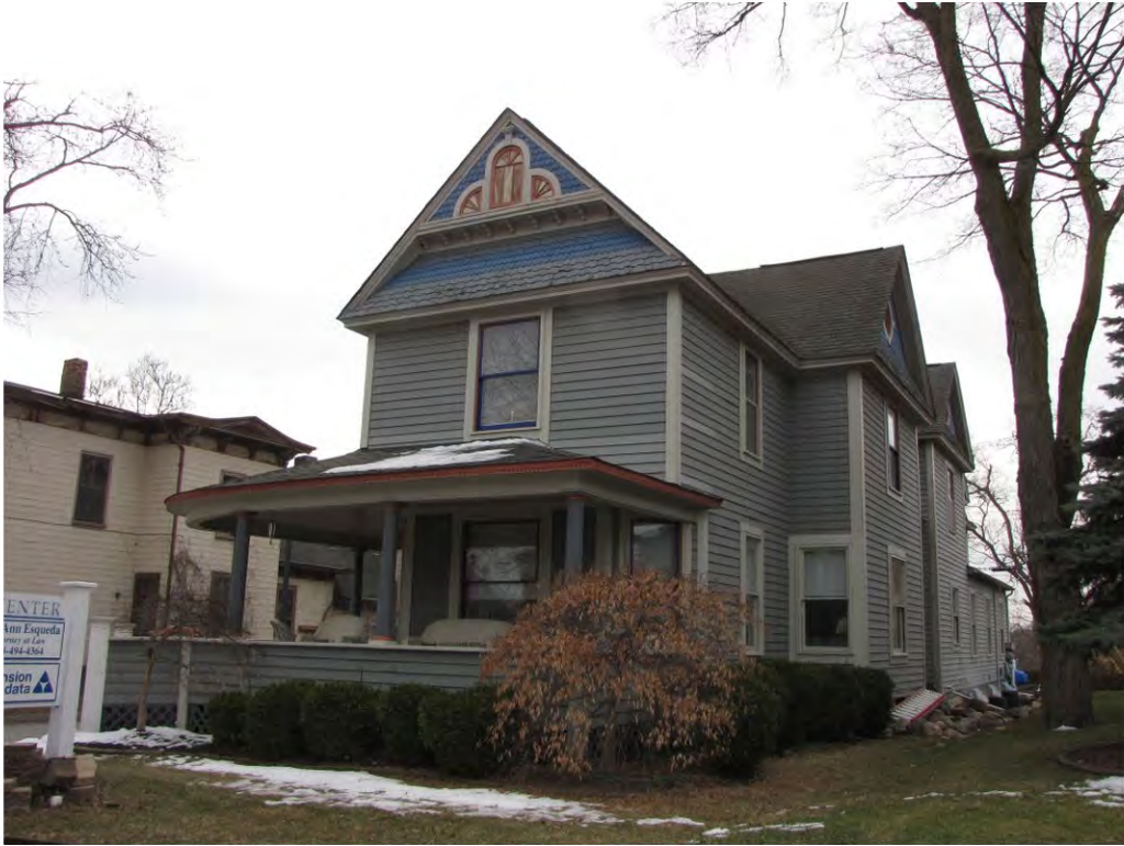
Main East 332_Looking Southeast