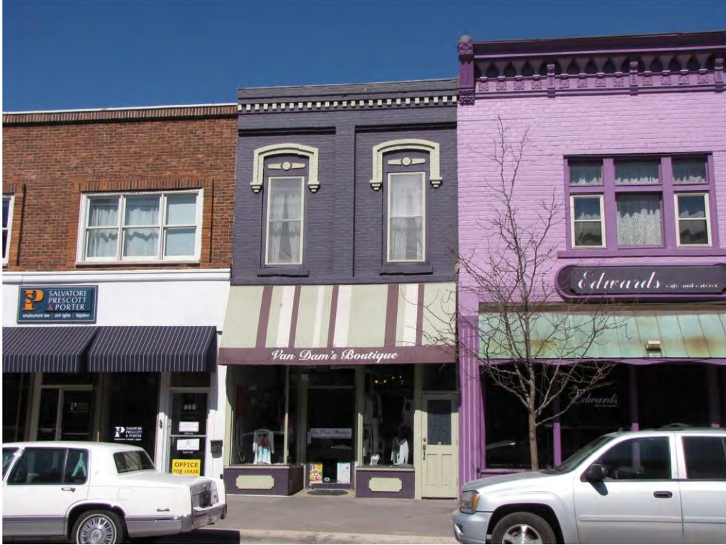
Main East 111_Looking North