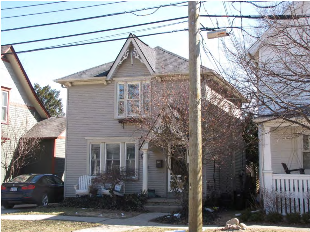
West 218_Looking Northeast