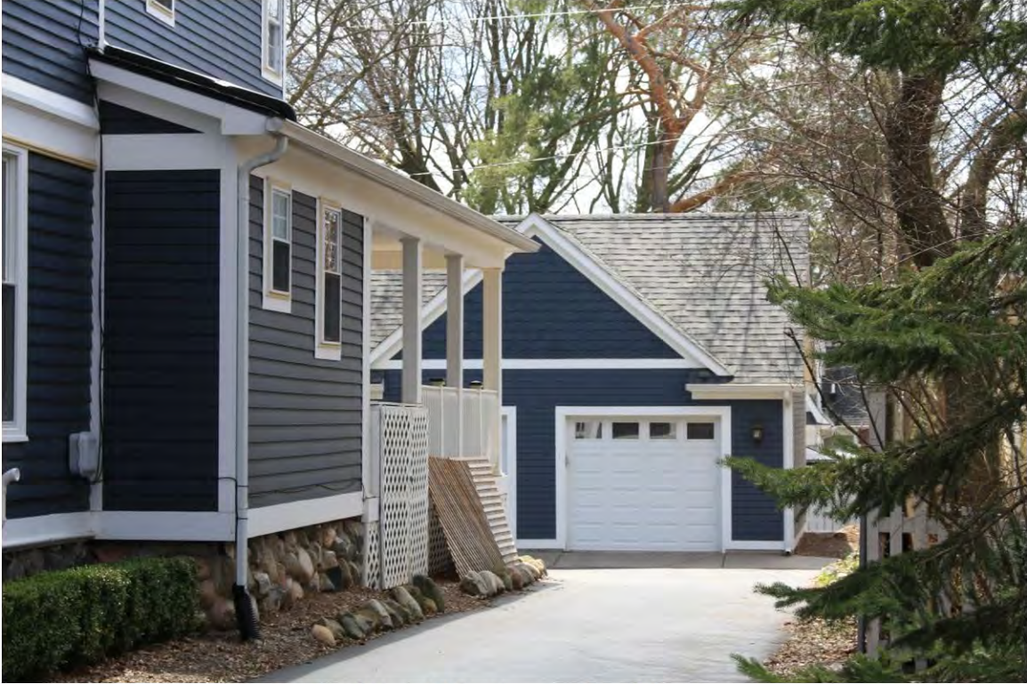
Dunlap West 543, Garage_Looking South