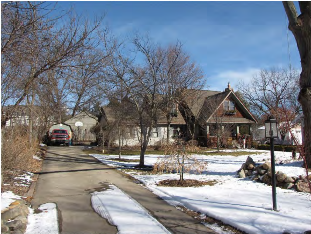
Dubuar 410_Looking Northeast