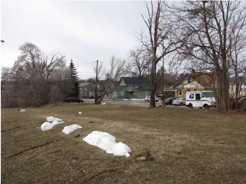
Cady East NVA 1_Looking Southwest