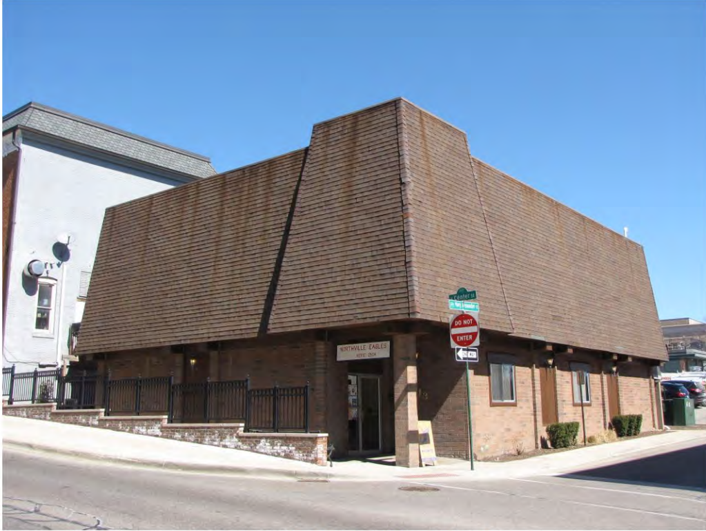
Center South 113_Looking Northeast