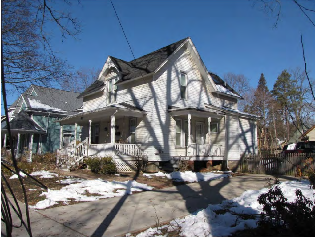
Cady West 508_Looking Northwest