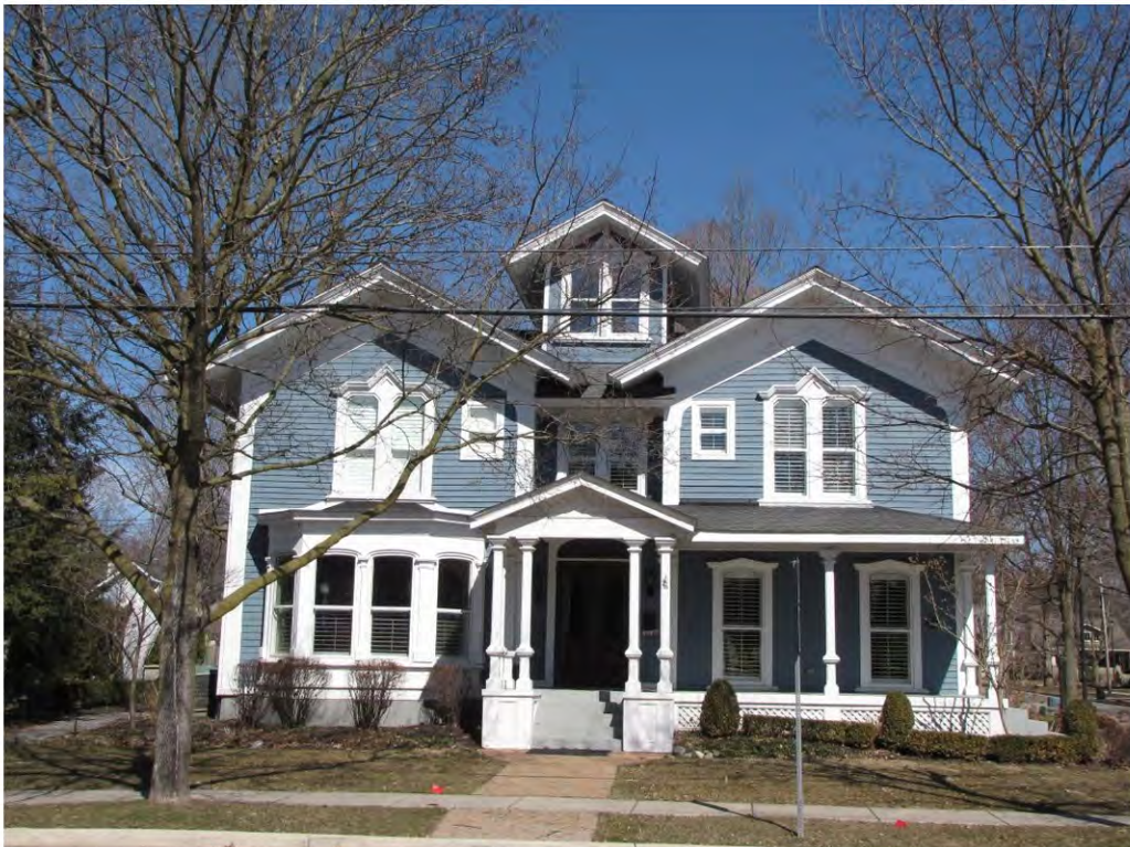
Main West 404_Looking North