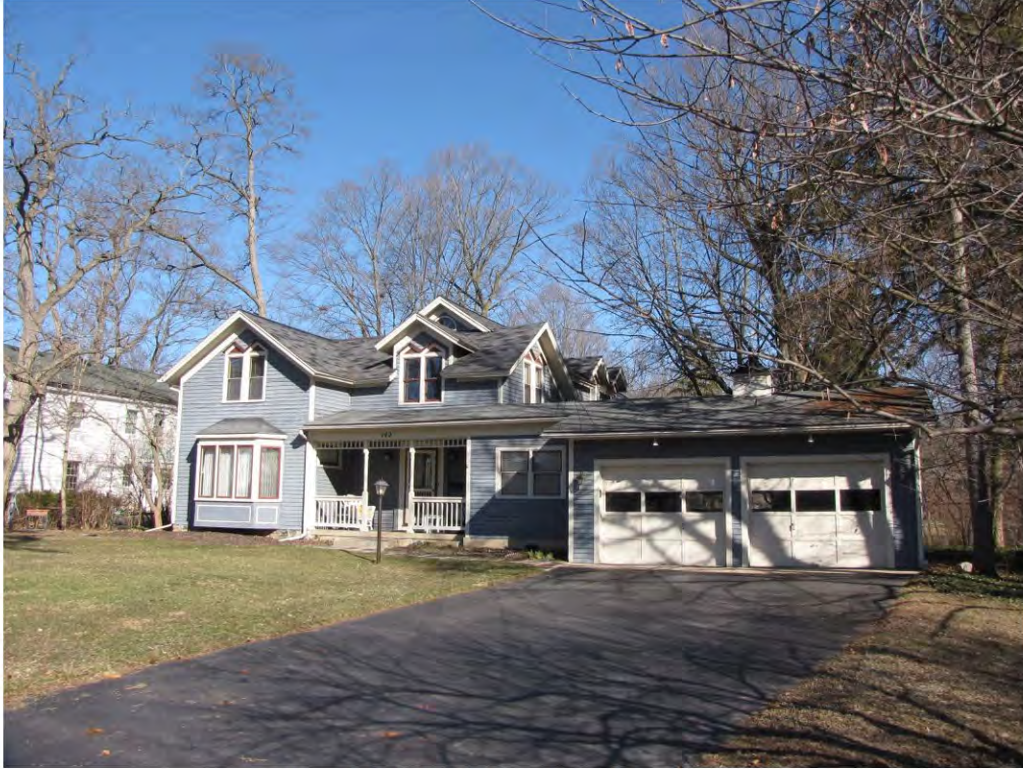
Randolph 142_Looking Northwest