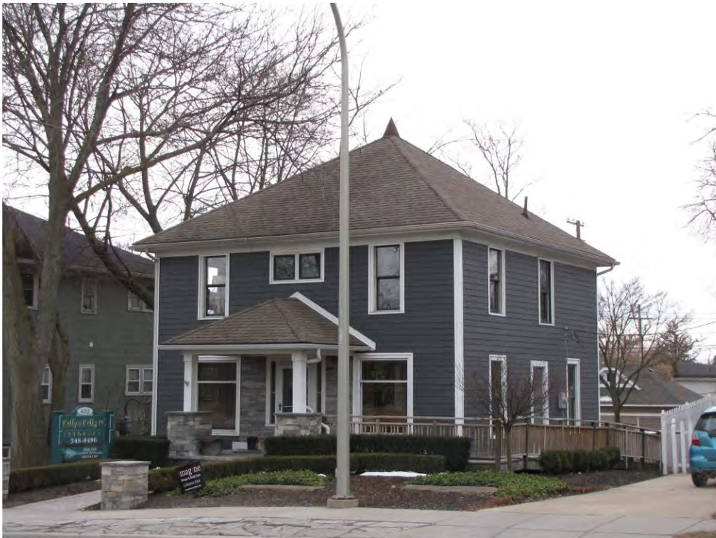
Main East 422_Looking Southeast