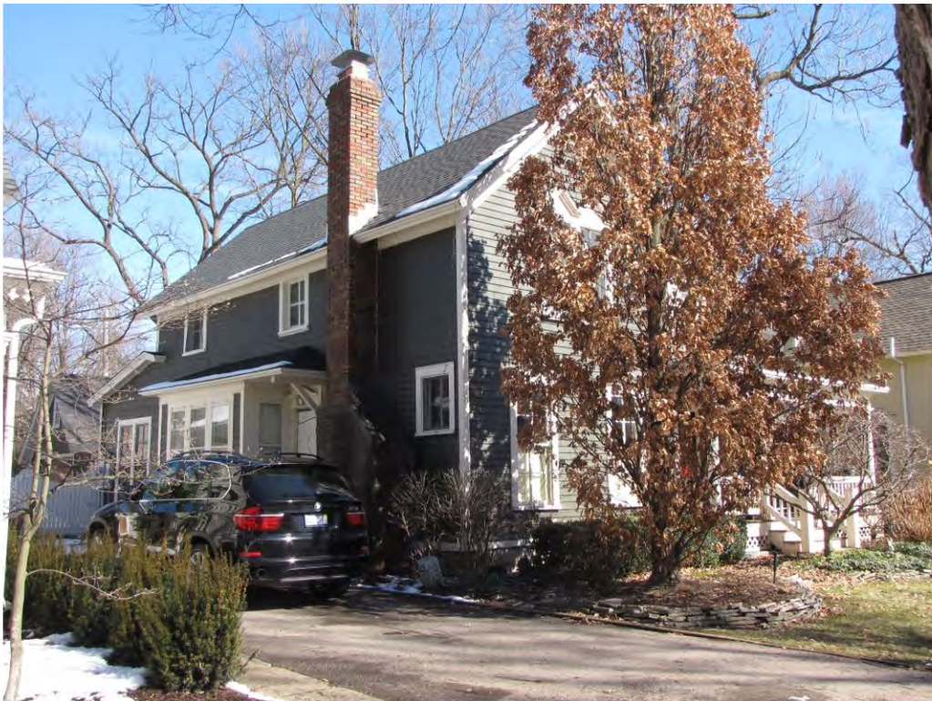
Dunlap West 548_Looking Northeast