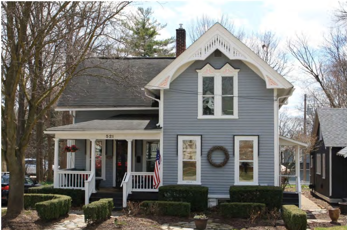
Main West 521_Looking South