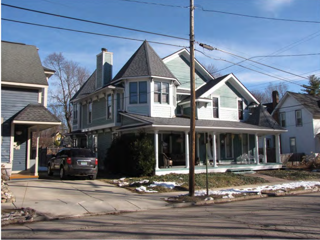
Cady West 514_Looking Northeast