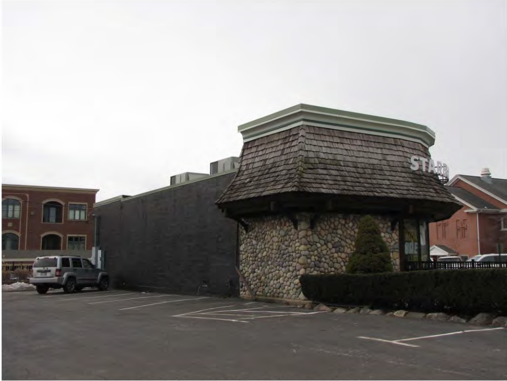
Main East 302_Looking Southwest