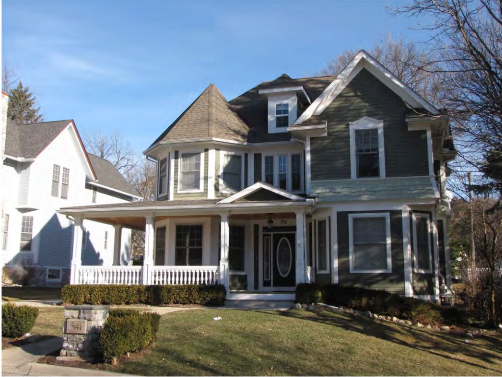
Linden Court 541_Looking North