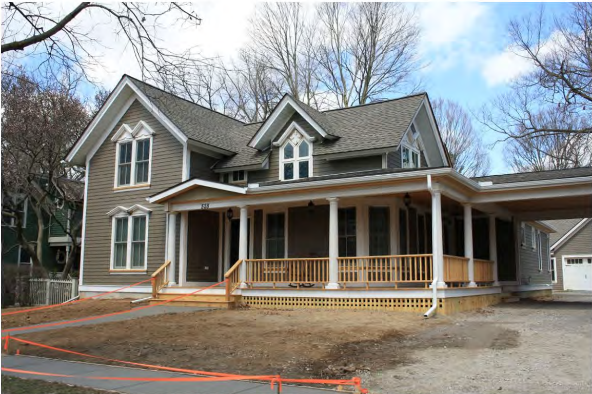
Dunlap West 528_Looking Northwest