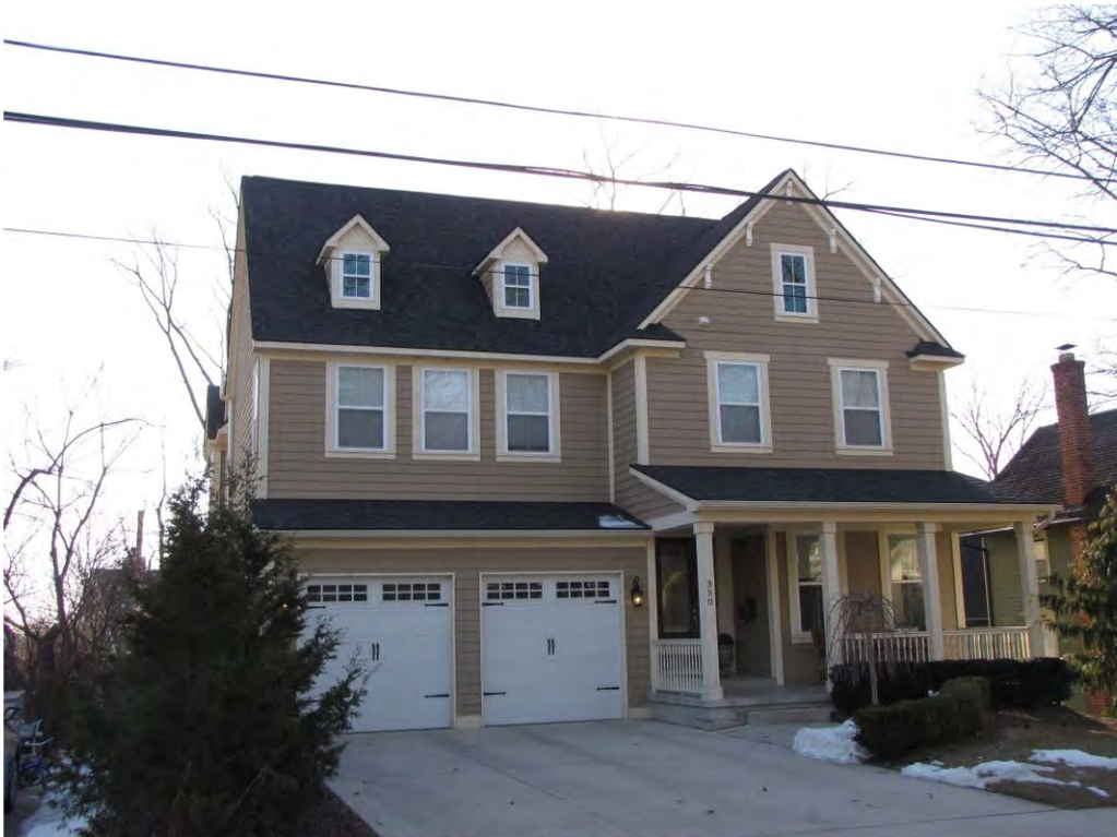
Rogers North 350_Looking East