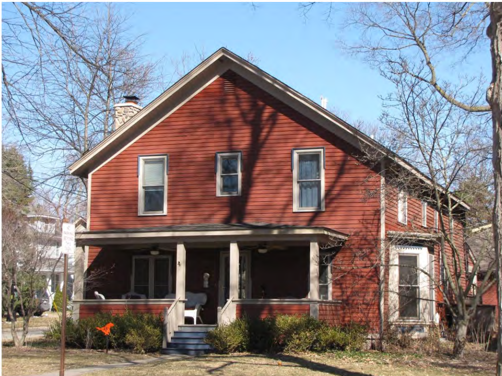
Dunlap West 418_Looking Northwest