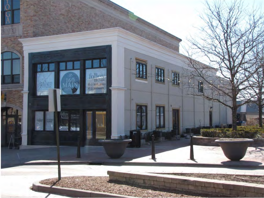
Main East 160_Looking Southeast