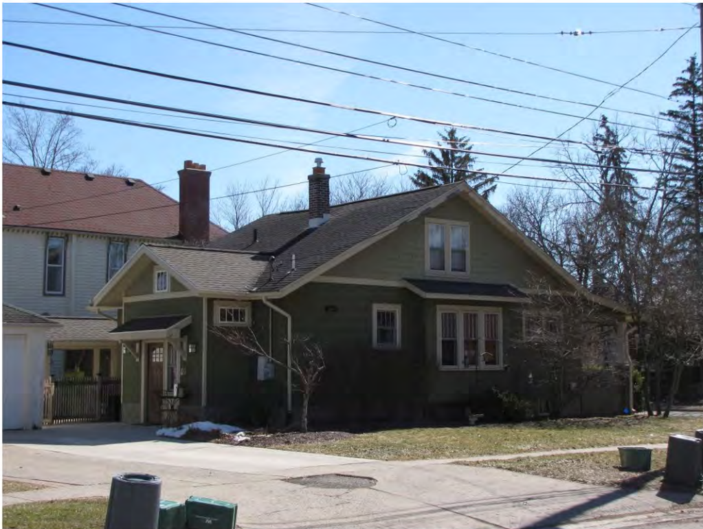
Dunlap West 314_Looking Southeast