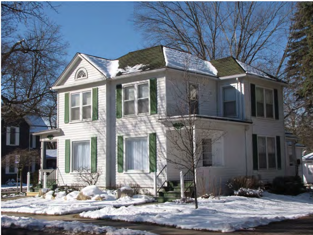
Rogers North 101_Looking Southwest