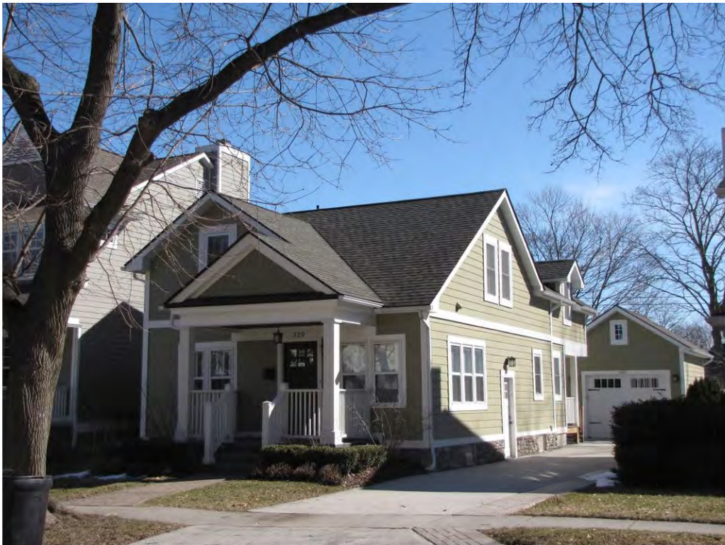
Linden 320_Looking Northeast