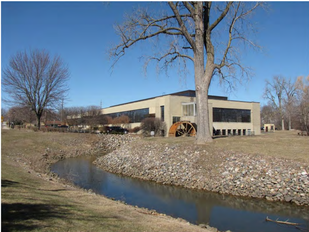
Griswold NVA 14_Looking Northwest