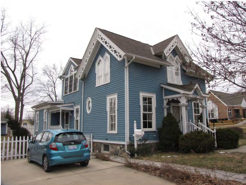
Main East 410_Looking Southwest