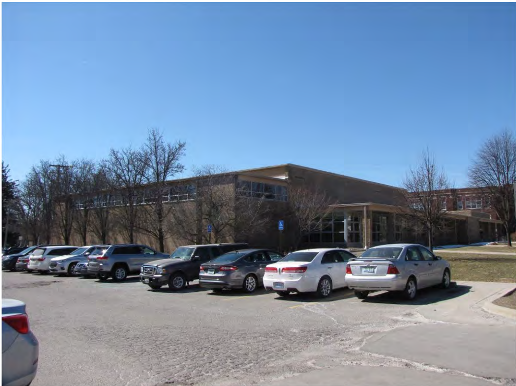
Main West 303_Looking Southwest