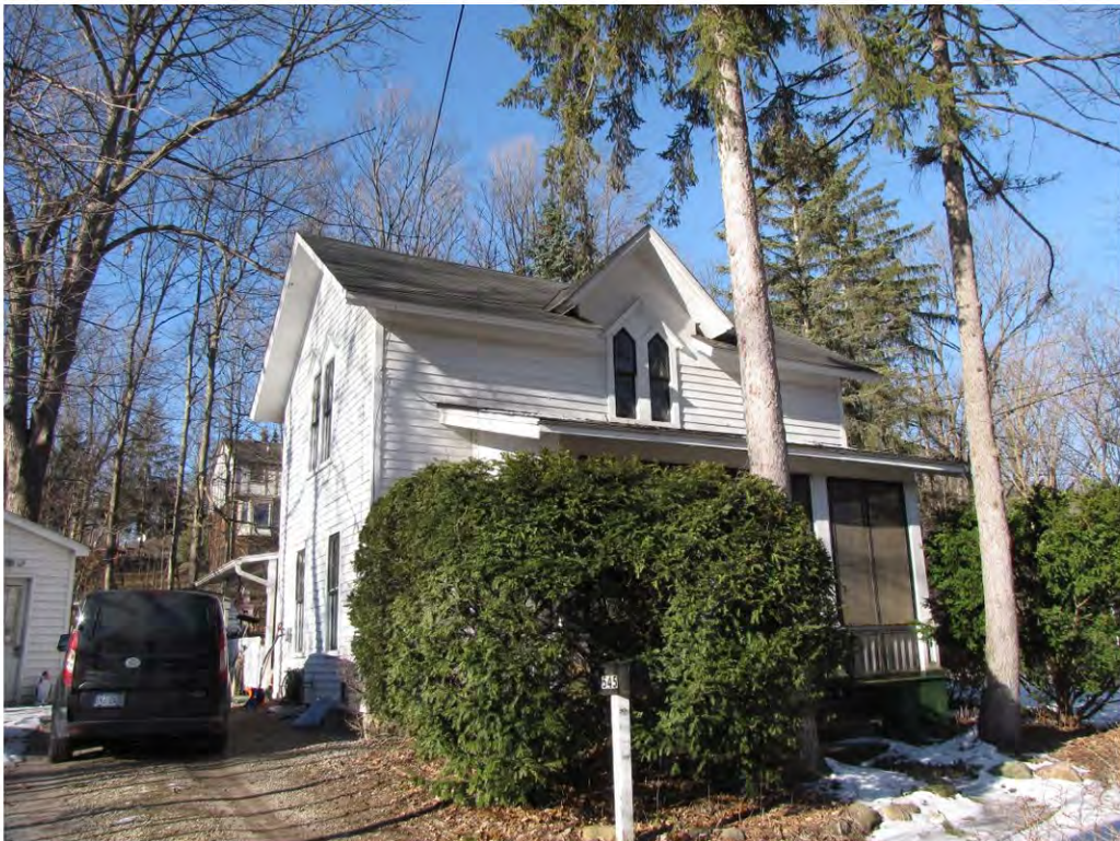
Randolph 545_Looking Southwest