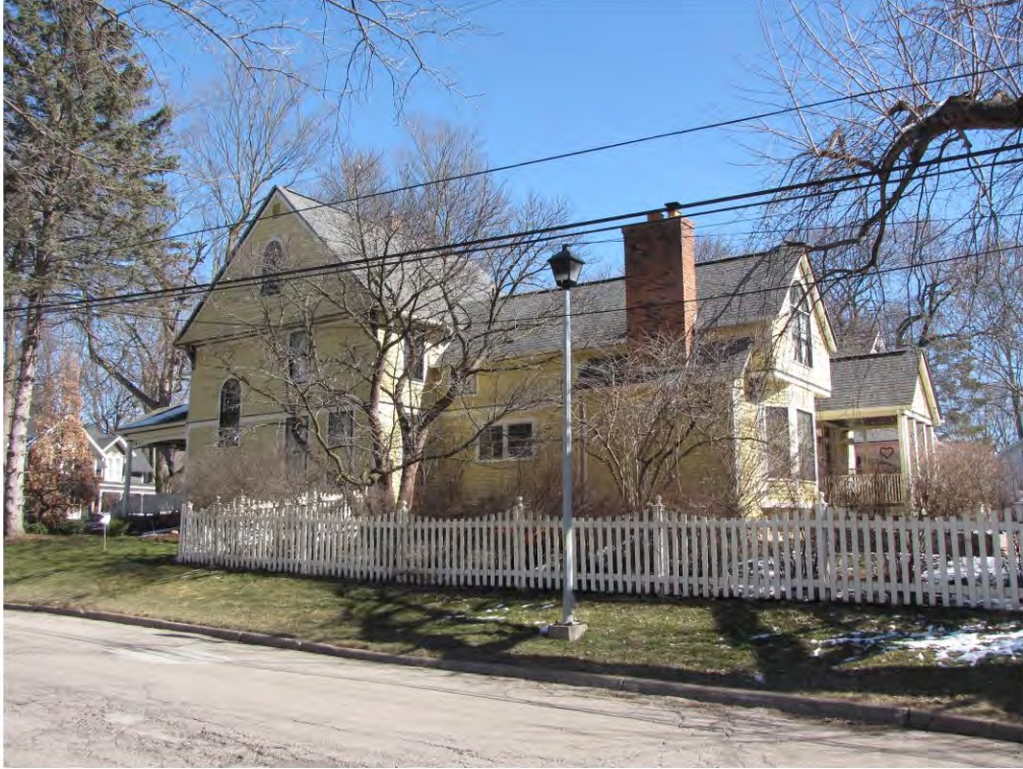
Dunlap West 549_ Looking Northeast