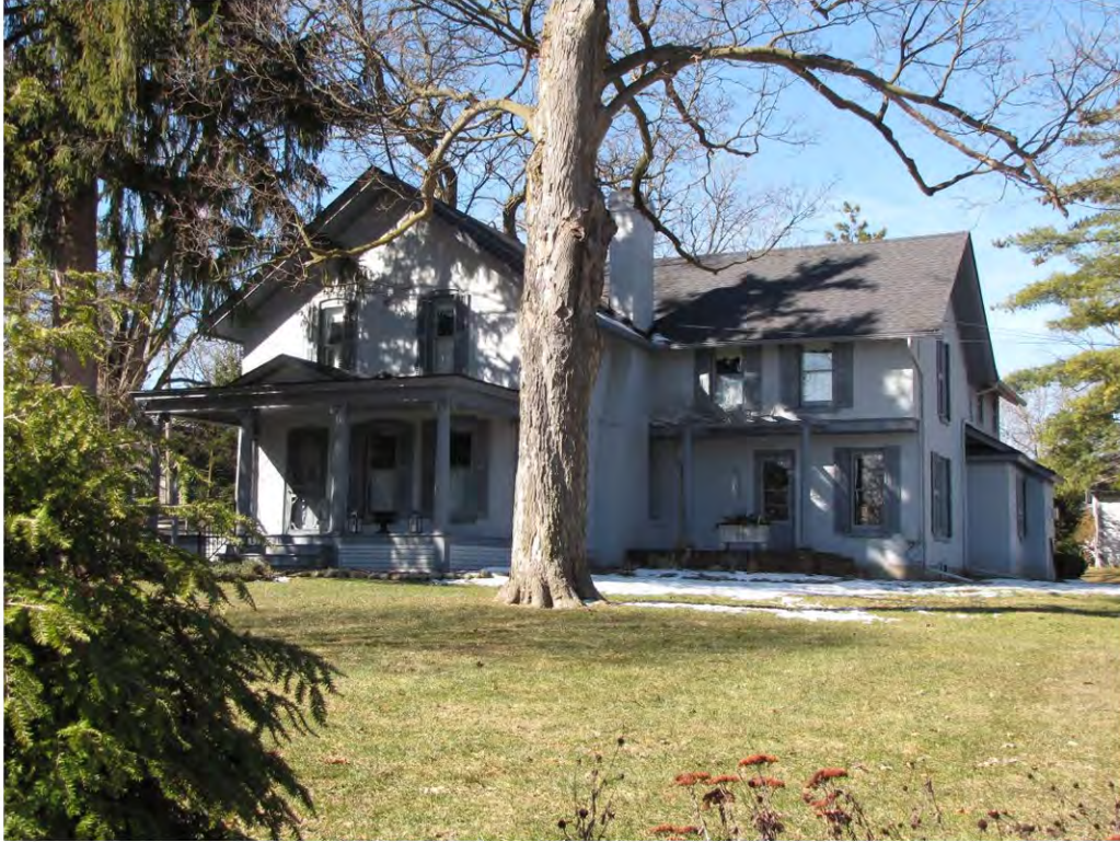
High 239_Looking Southwest