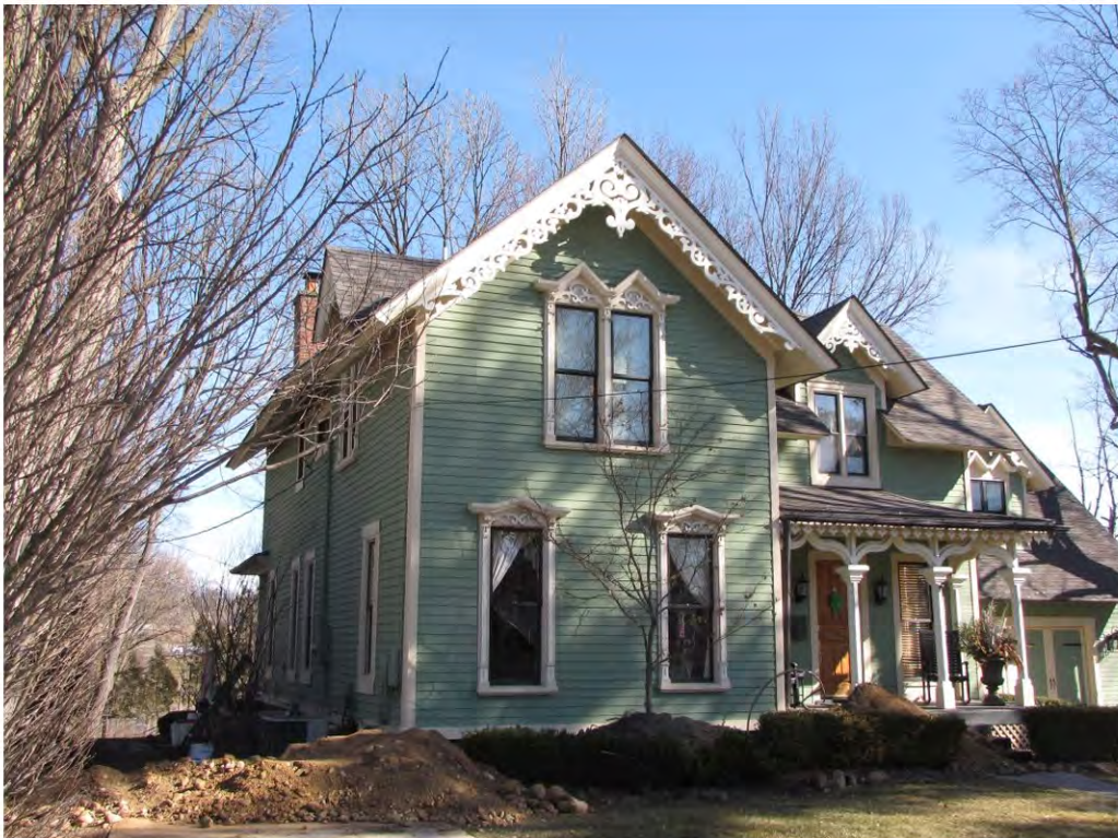
Randolph 124_Looking Northeast