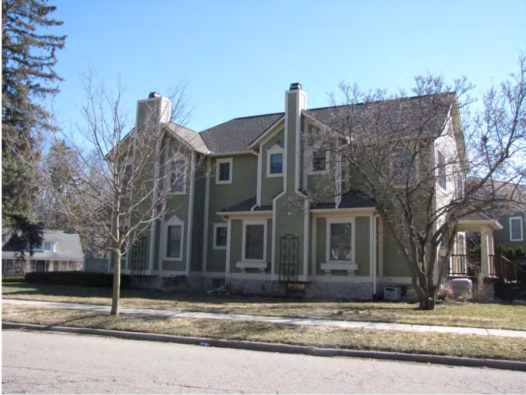
Randolph 413_Looking East