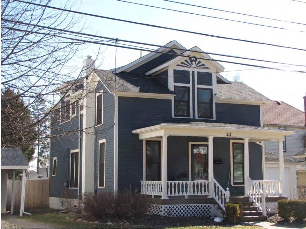
West 212_Looking Southeast