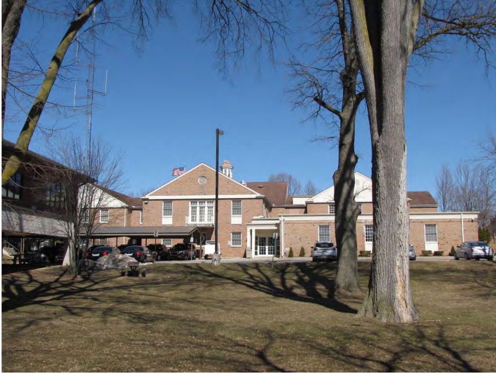
Main West 215_Looking North