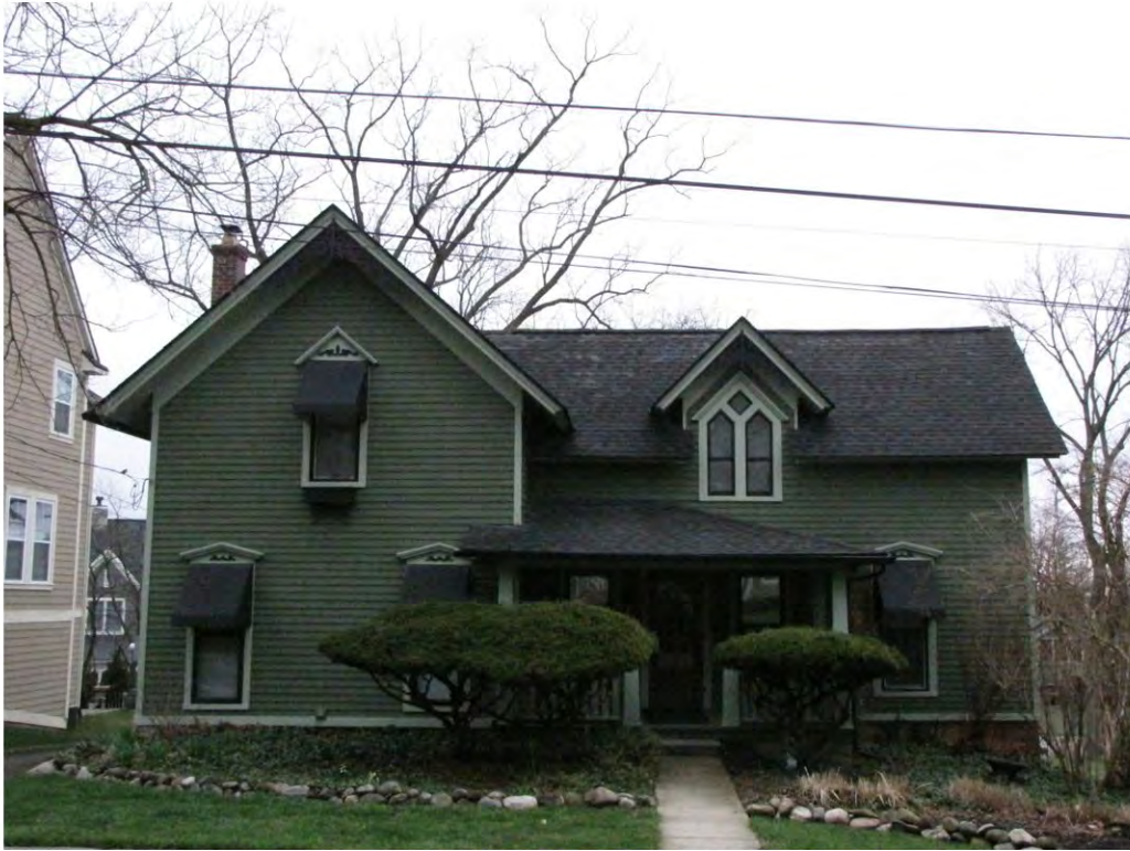
Rogers North 322_Looking East