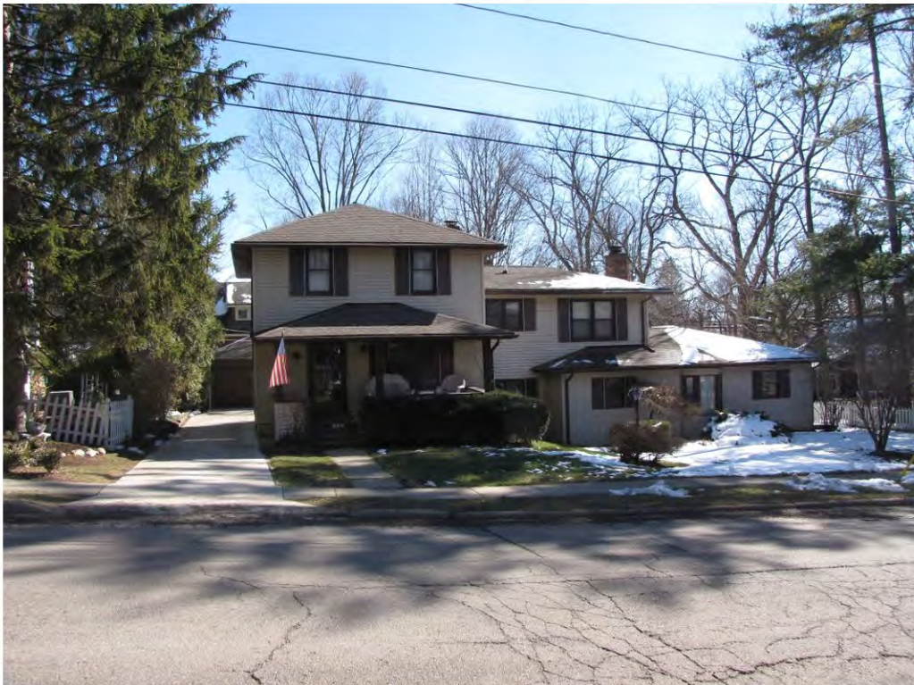
Rogers North 230_Looking East