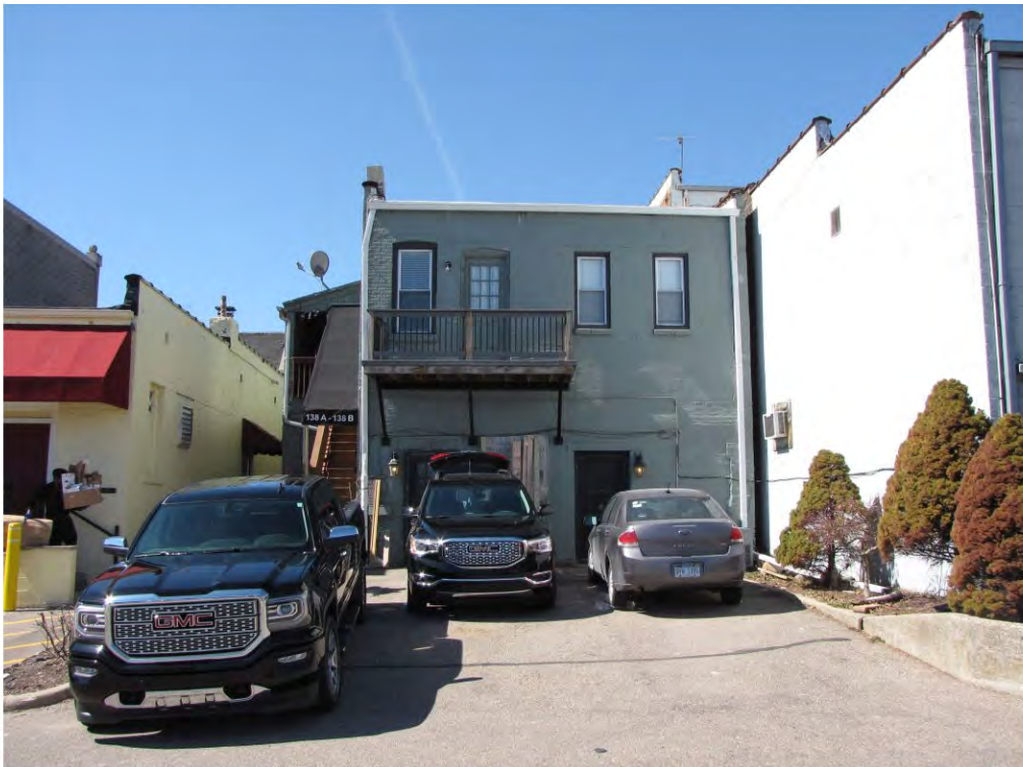
Center North 136_Looking West