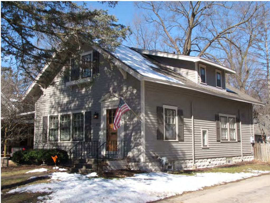
Dunlap West 522_Looking Northwest