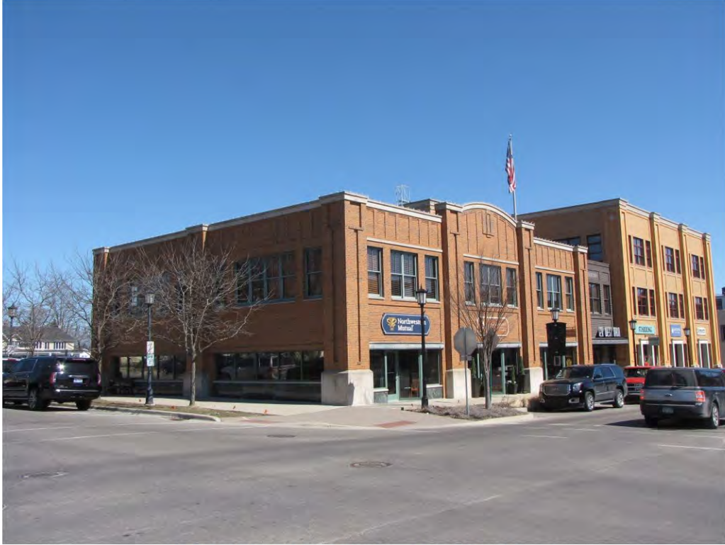
Main West 114-126_Looking Northeast