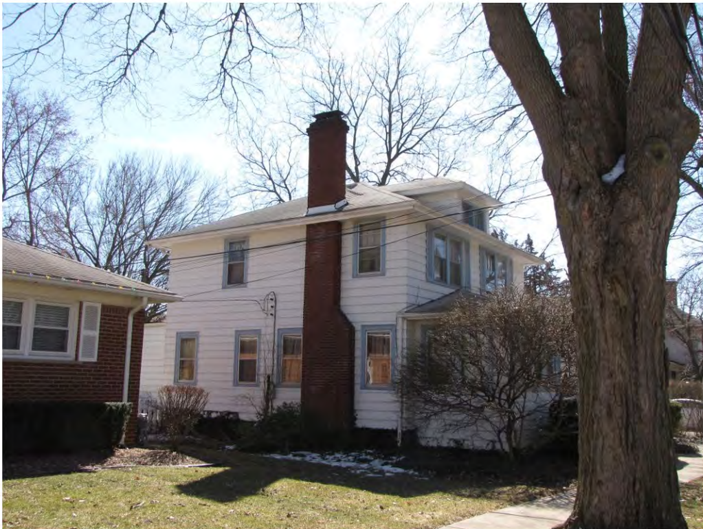
West 114_Looking Southeast