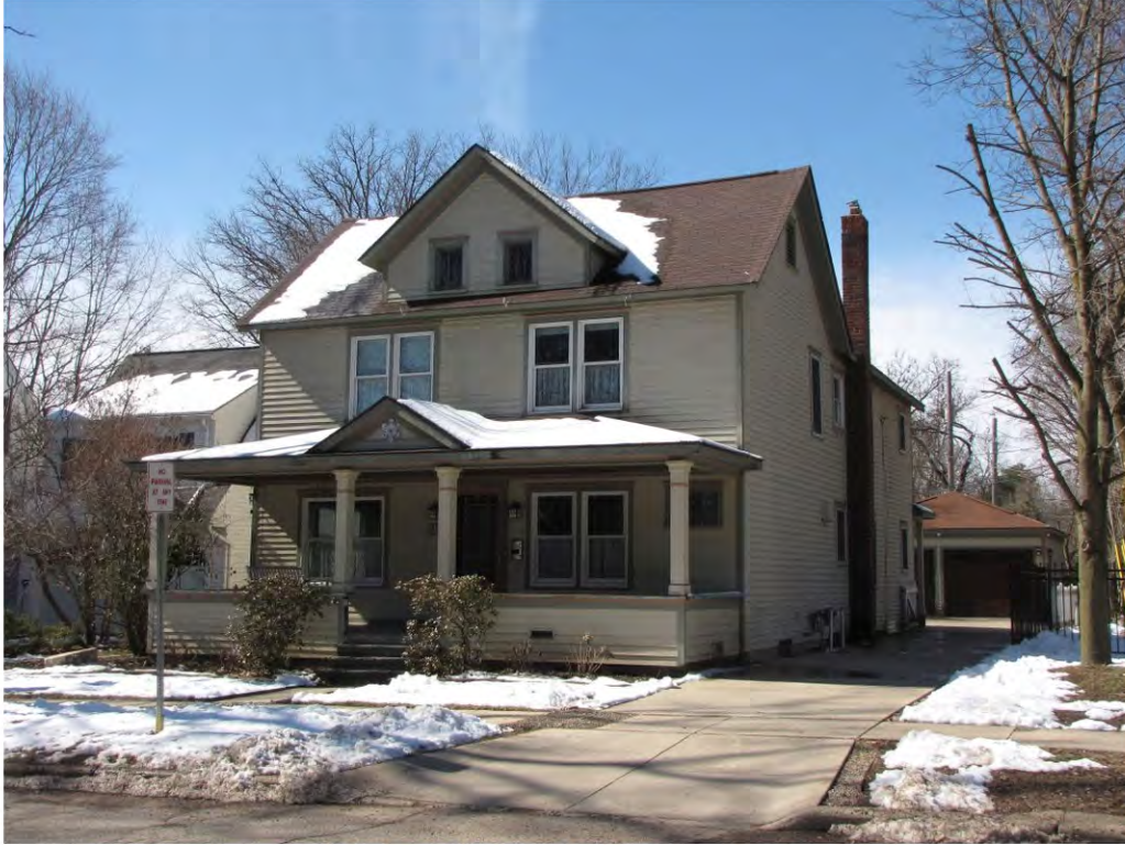
Linden 115_Looking Southwest