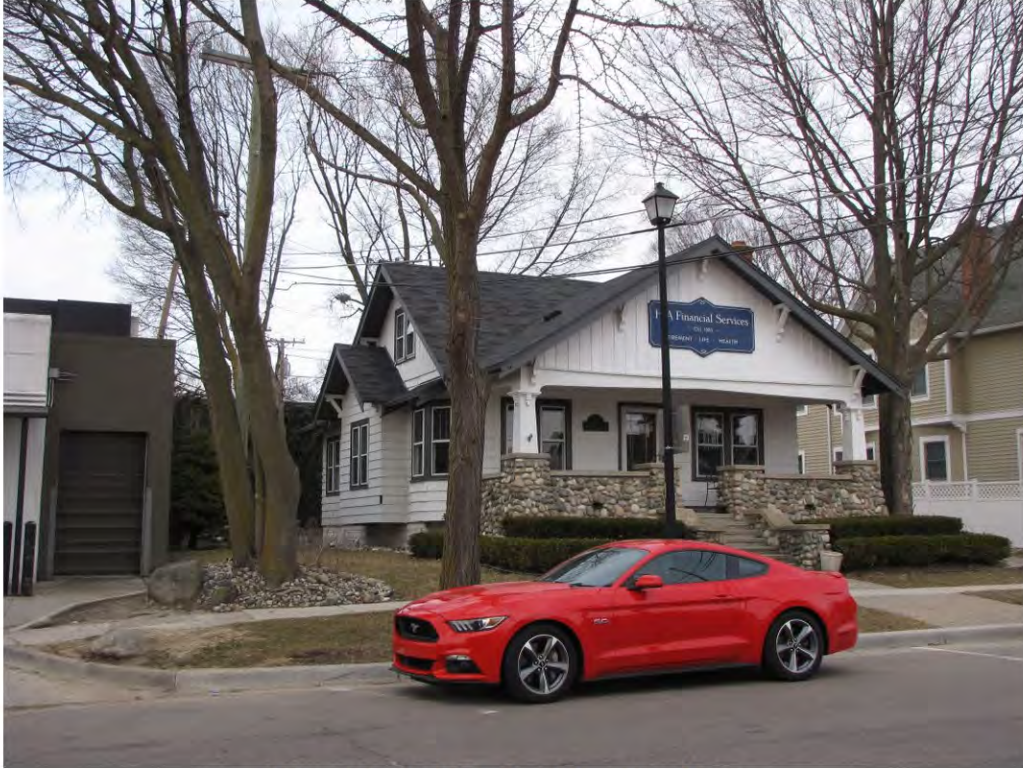
Wing North 111_Looking Northwest