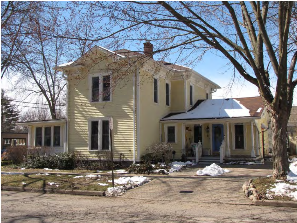
Main West 502_Looking Northeast