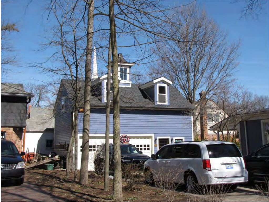
Dunlap West 206, Garage_Looking North