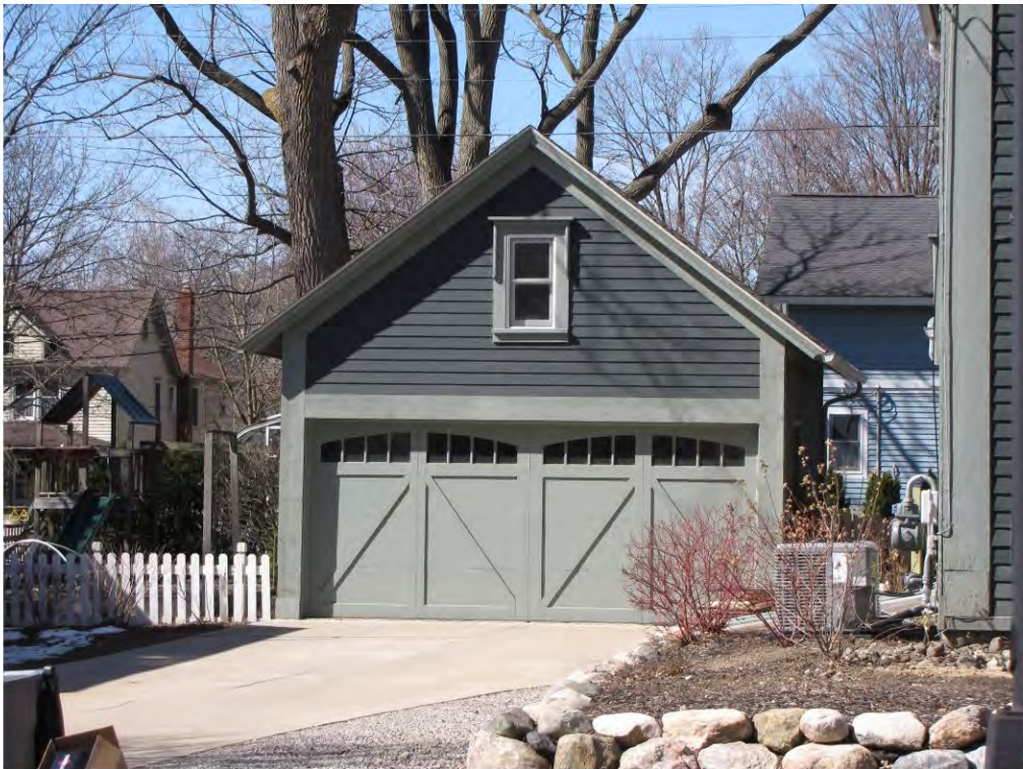
Dunlap West 401, Garage_Looking West