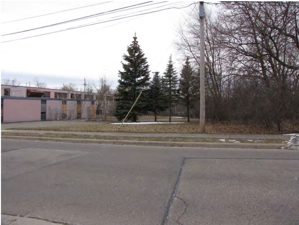
Cady East NVA 7_Looking South