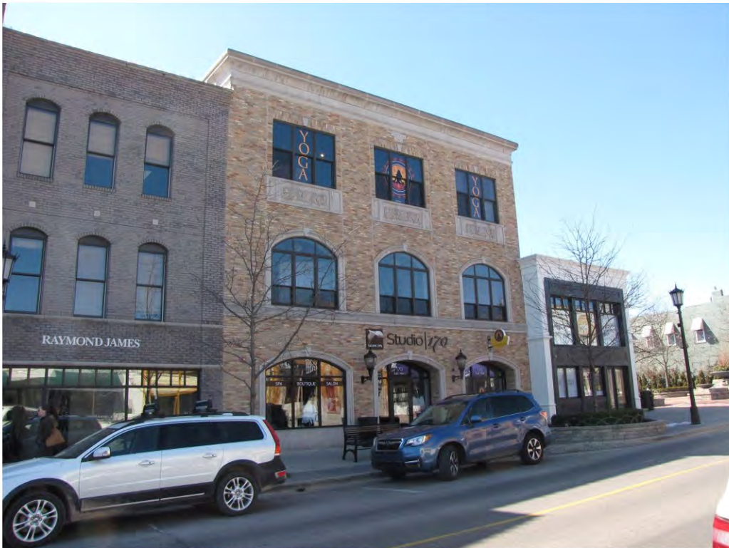
Main East 170_Looking Southwest