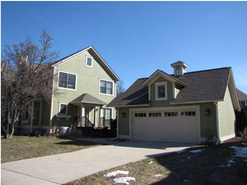
Randolph 413, Garage_Looking Northeast