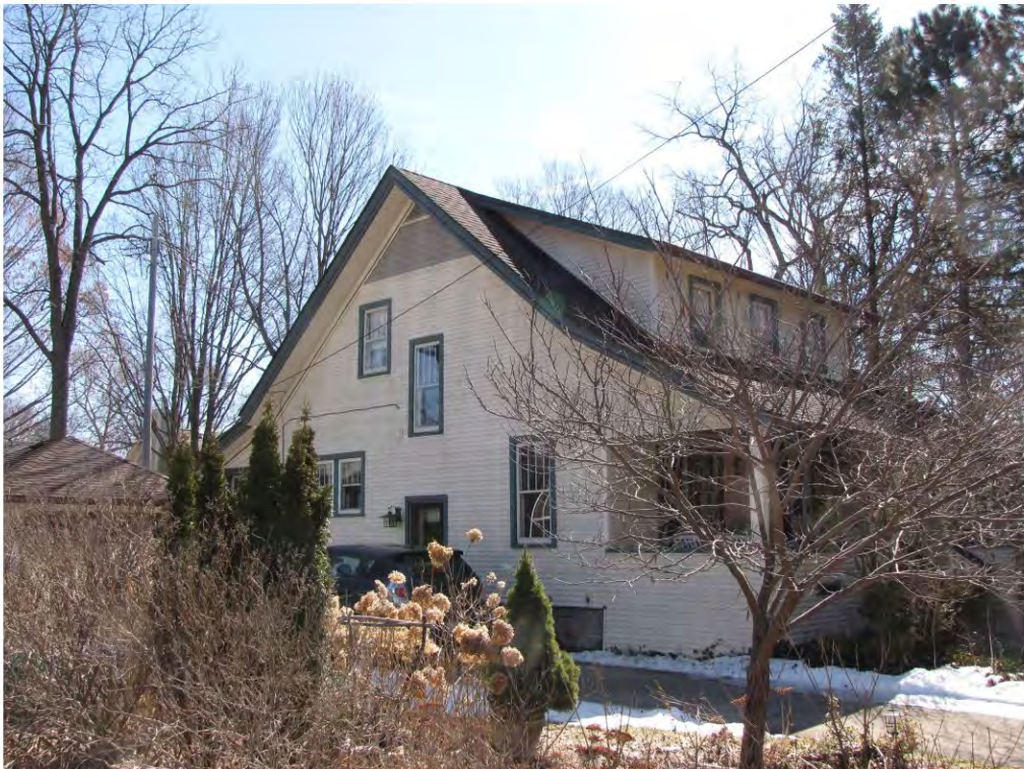
Linden 118_Looking Southeast