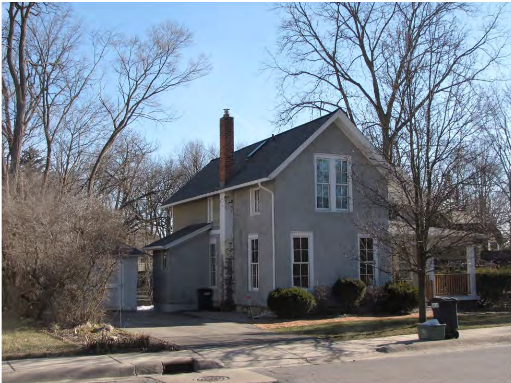
Randolph 312_Looking Northeast