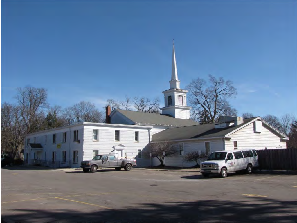
Wing North 217_Looking Northeast