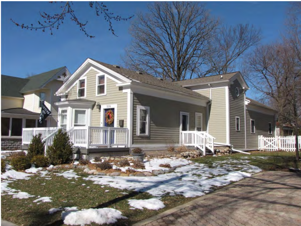
Main West 508_Looking Northwest