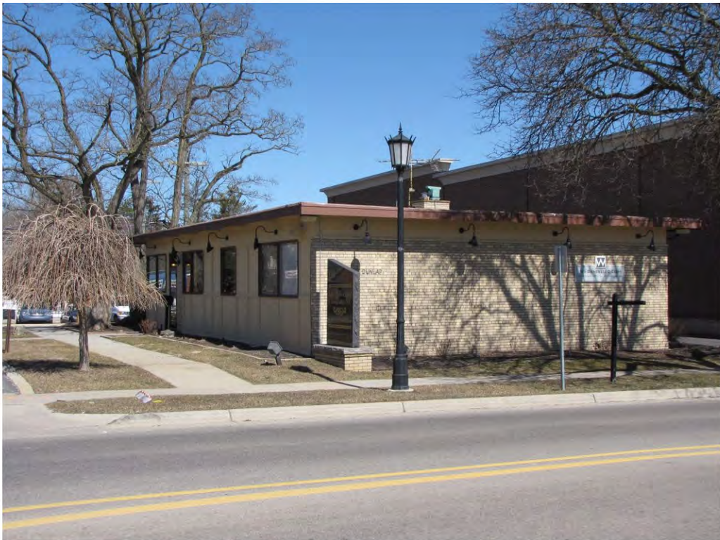
Dunlap East 115_Looking Northeast