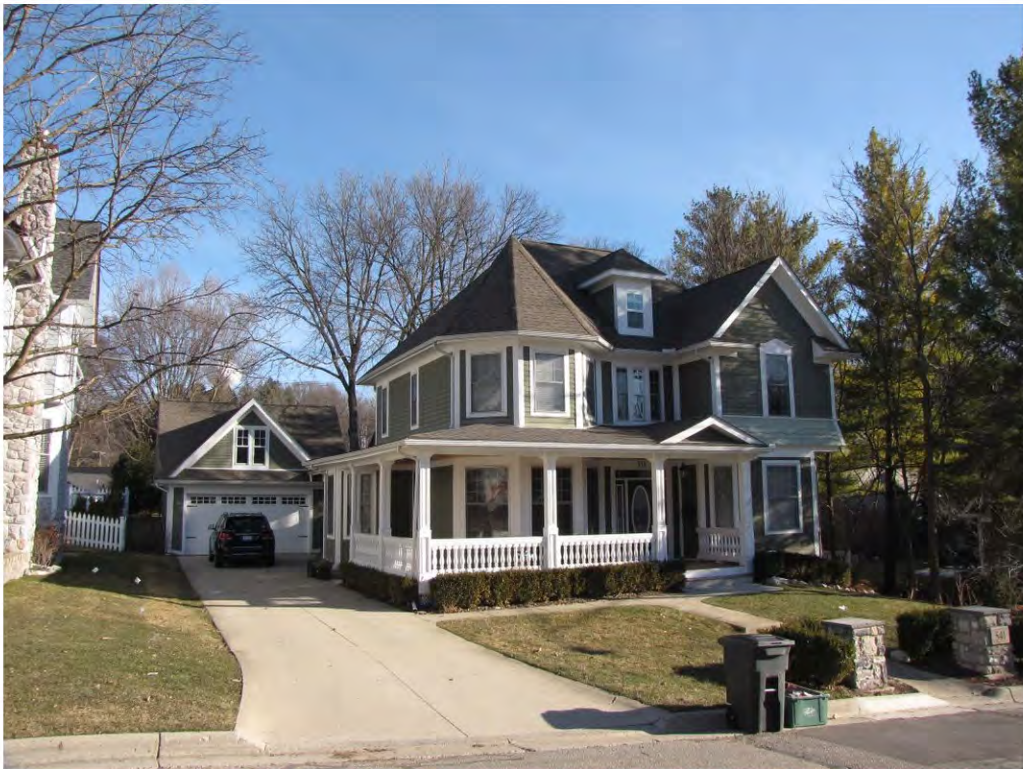
Linden Court 541_Looking Northeast