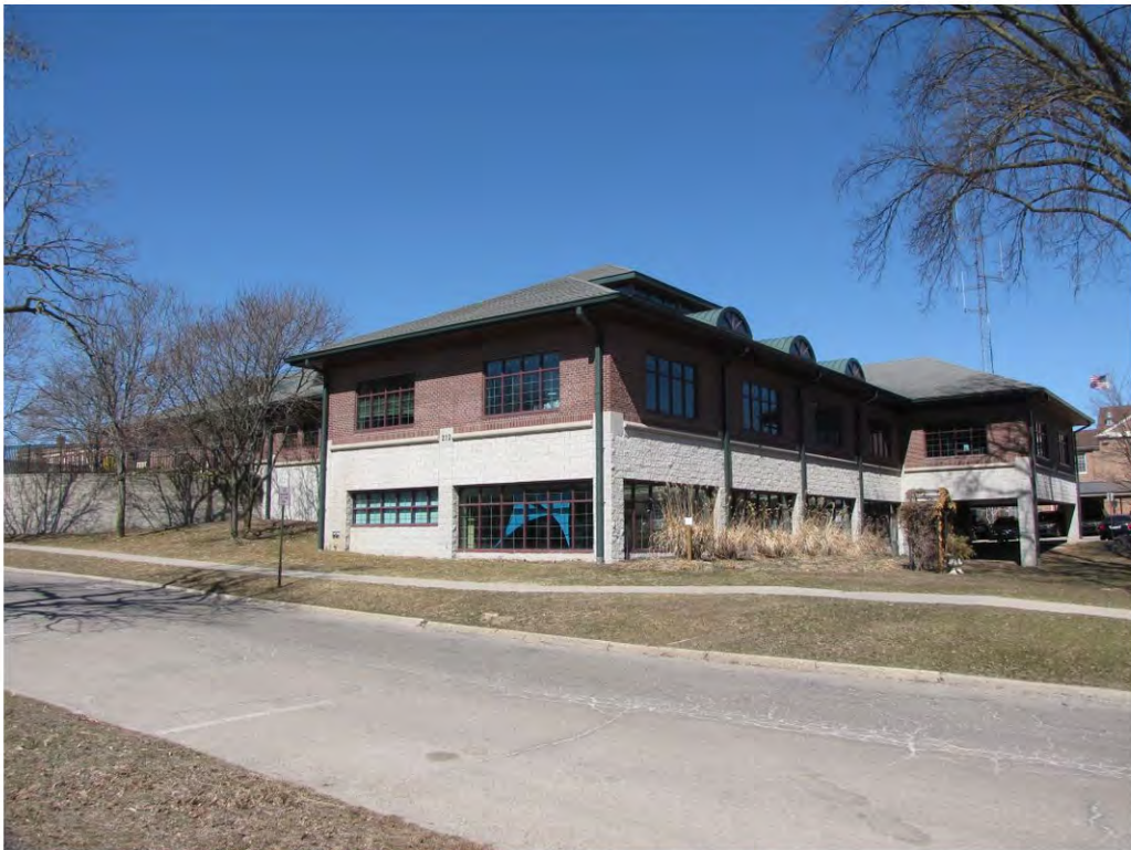
Cady West 212_Looking Northwest