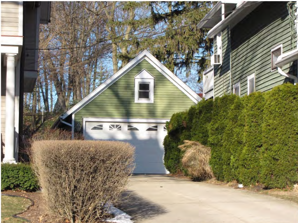
Rogers North 359, Garage_Looking West