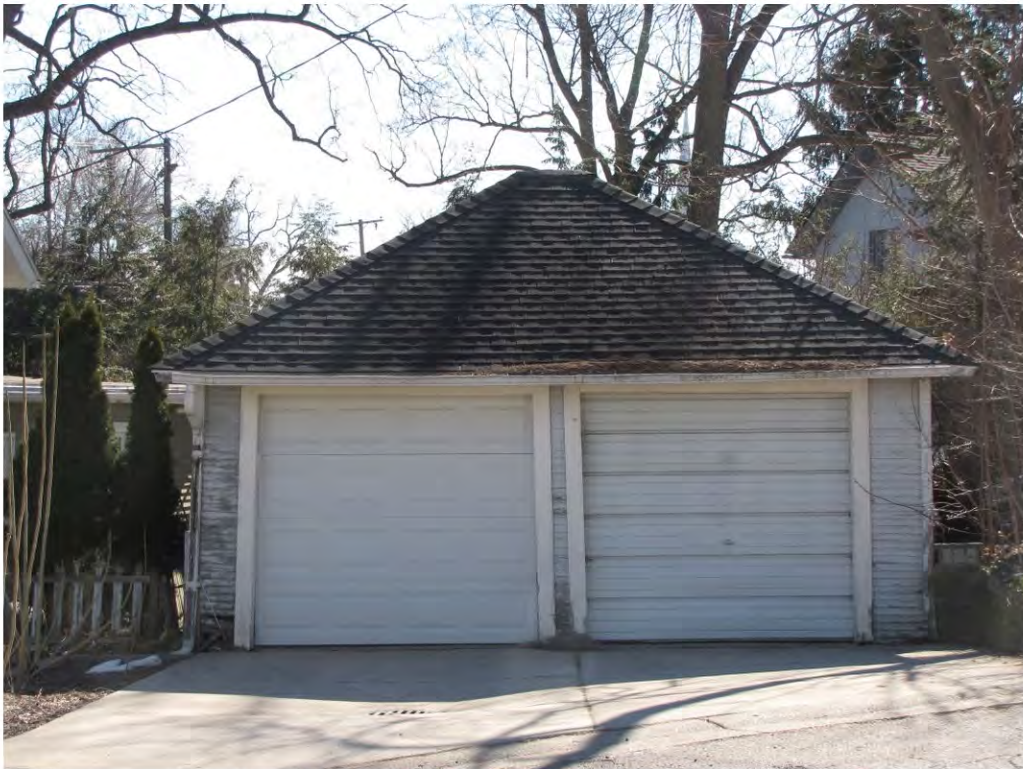
Randolph 319-321, Garage_Looking East