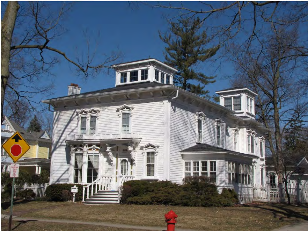
Dunlap West 404_Looking Northwest