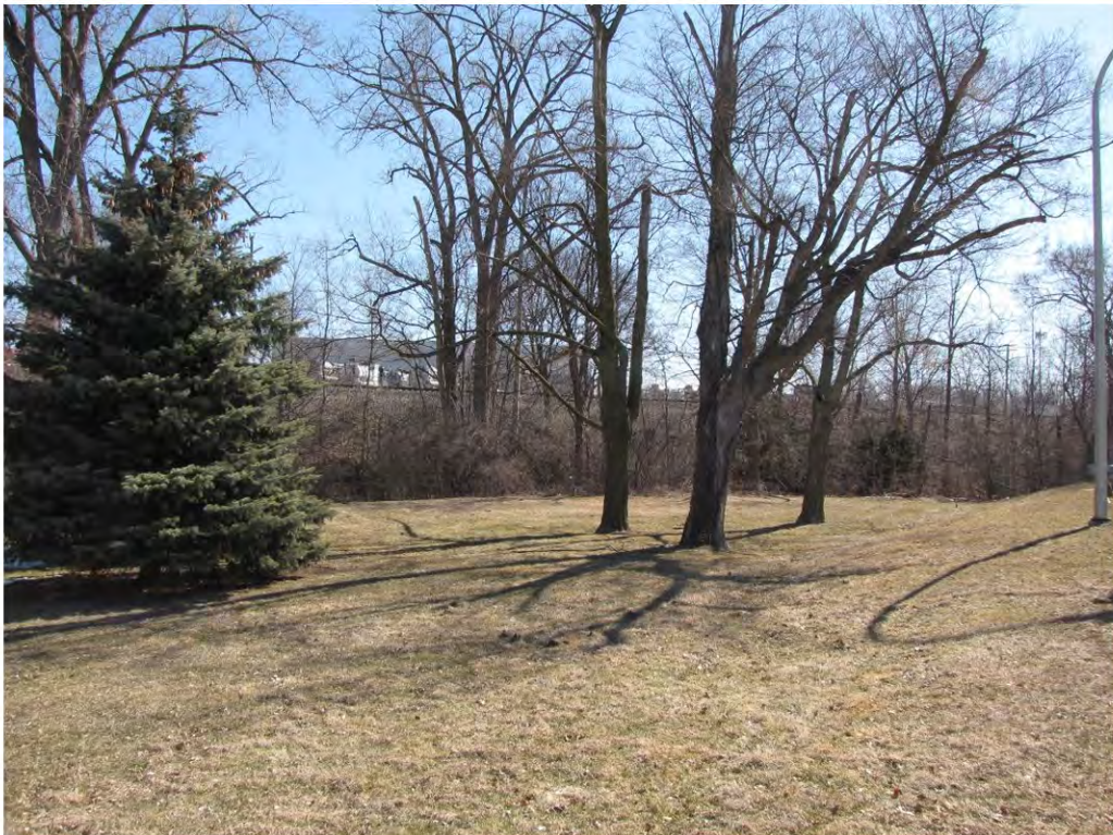
Main East NVA 13_Looking East