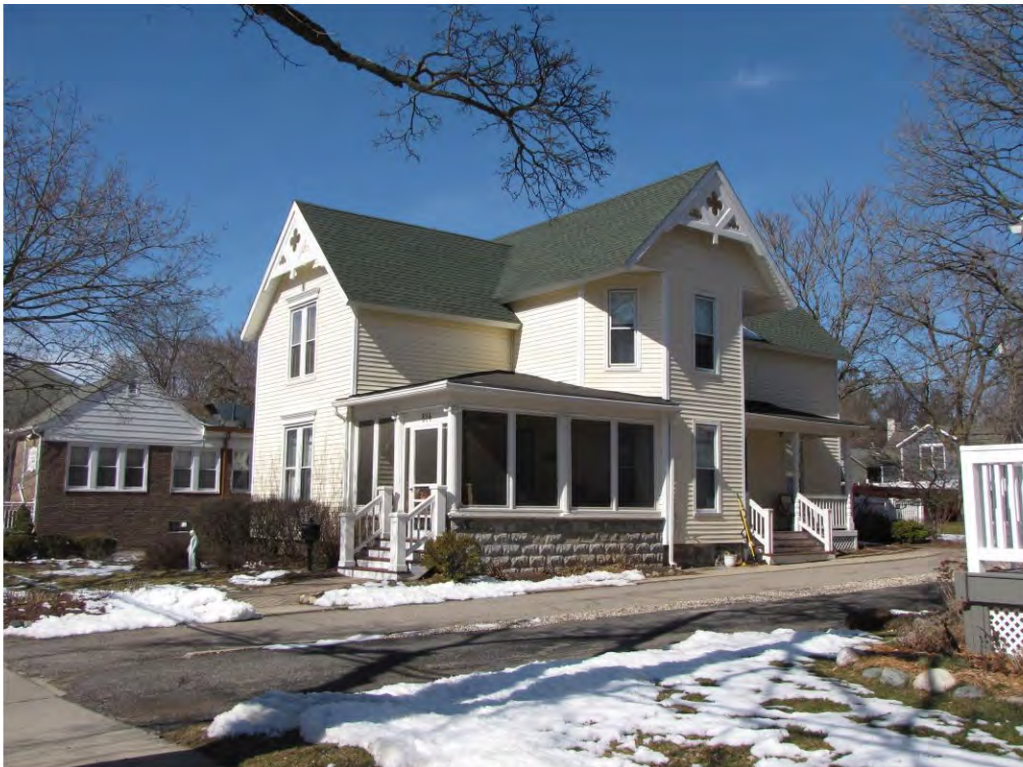
Main West 514_Looking Northwest