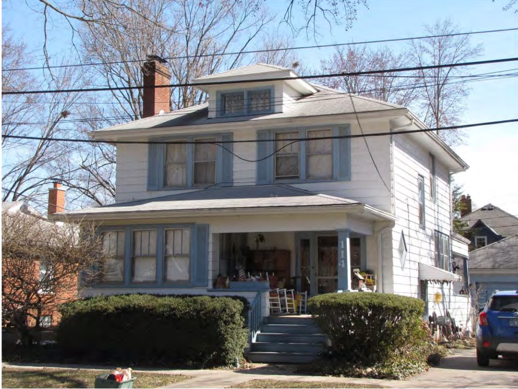
West 114_Looking Northeast