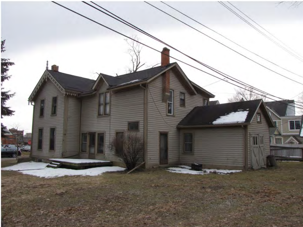
Wing North 129_Looking Southeast