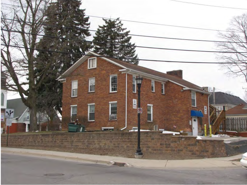
Dunlap West 100_Looking Southwest