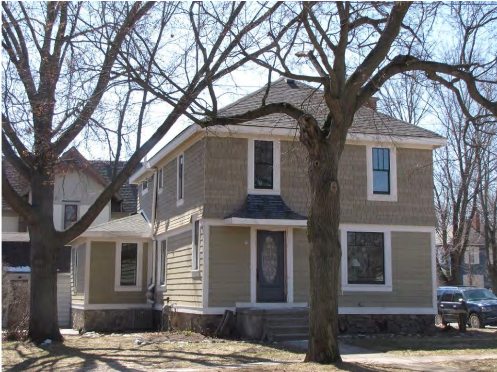
Dunlap West 217_Looking Southwest