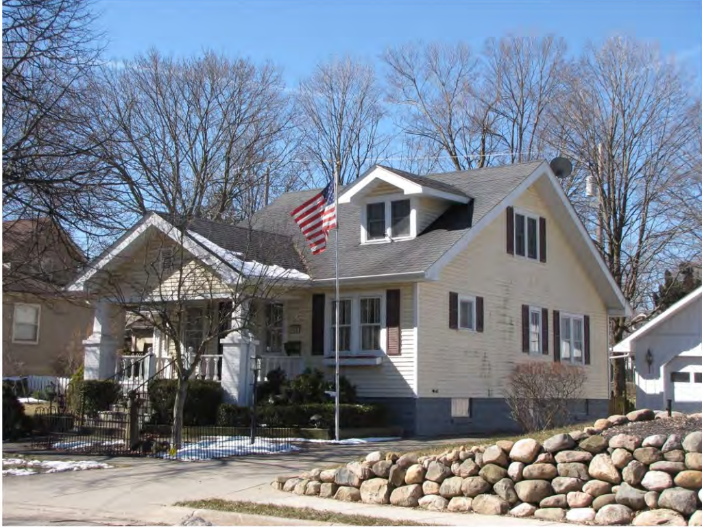
West 231_Looking Southwest