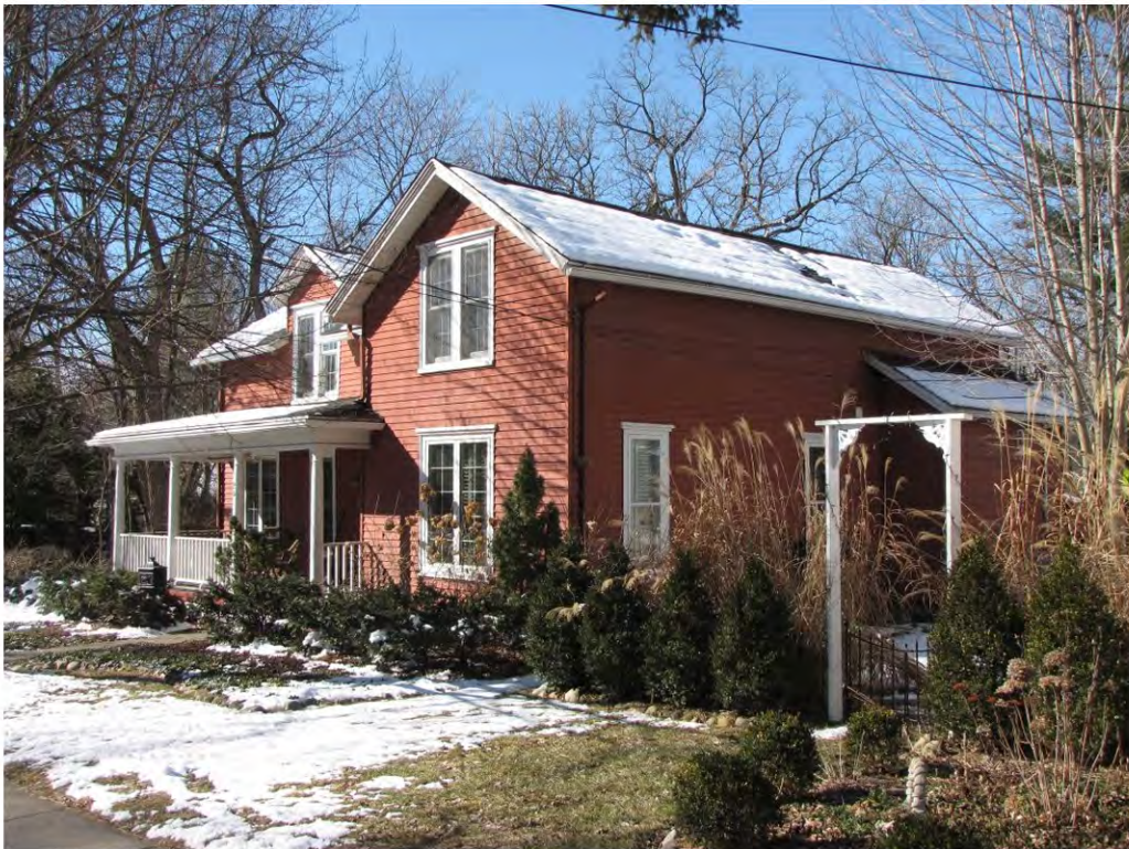
Rogers North 201_Looking Southwest