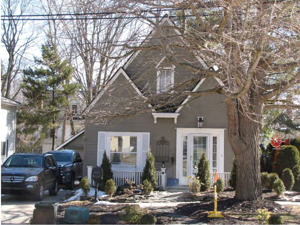
West 228_Looking East