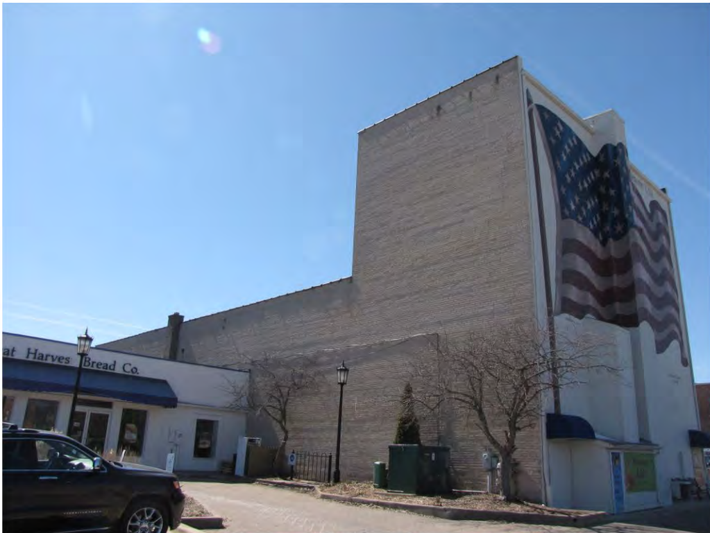
Main East 135-137_Looking Southwest