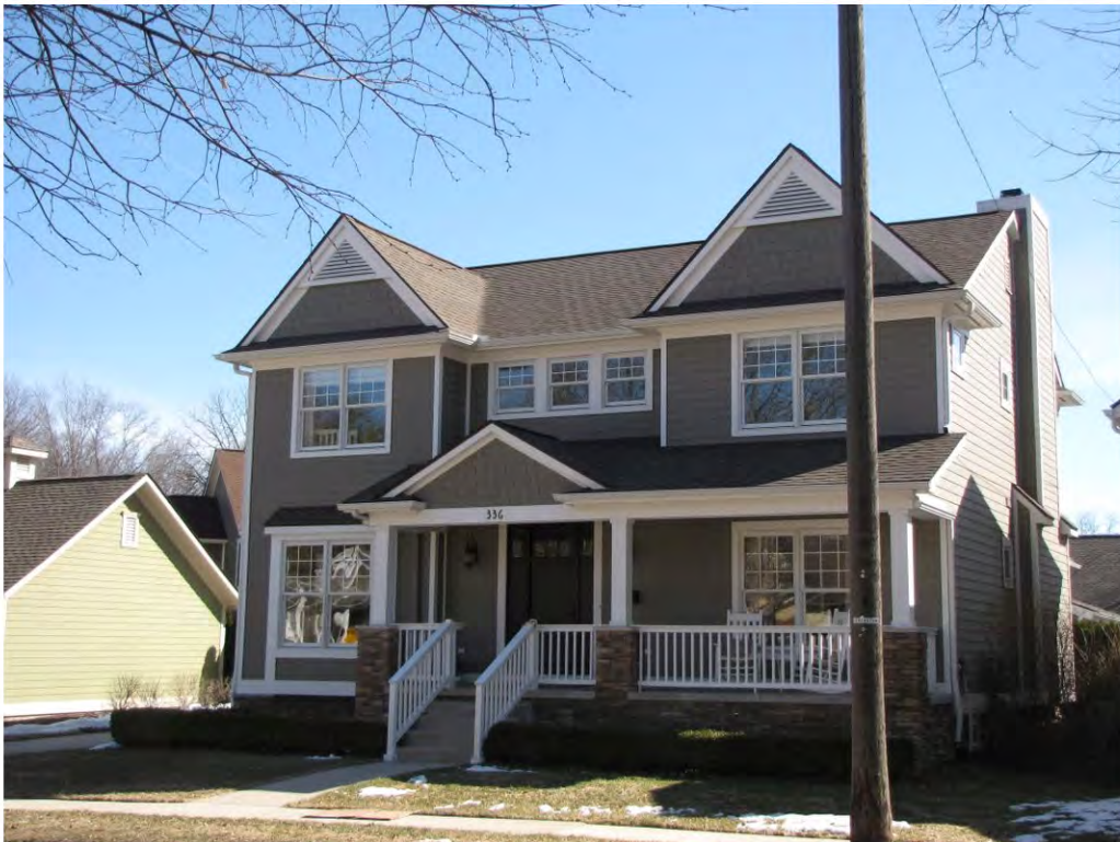
Linden 336_Looking Northeast