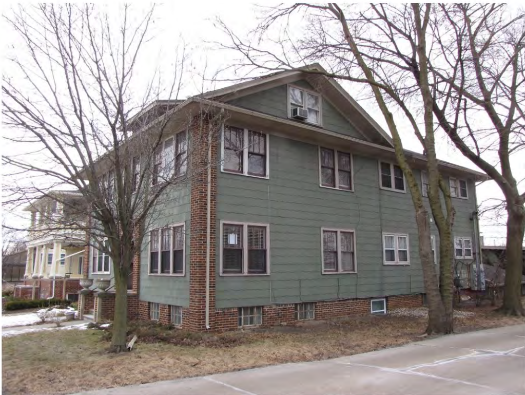
Main East 430_Looking Southeast