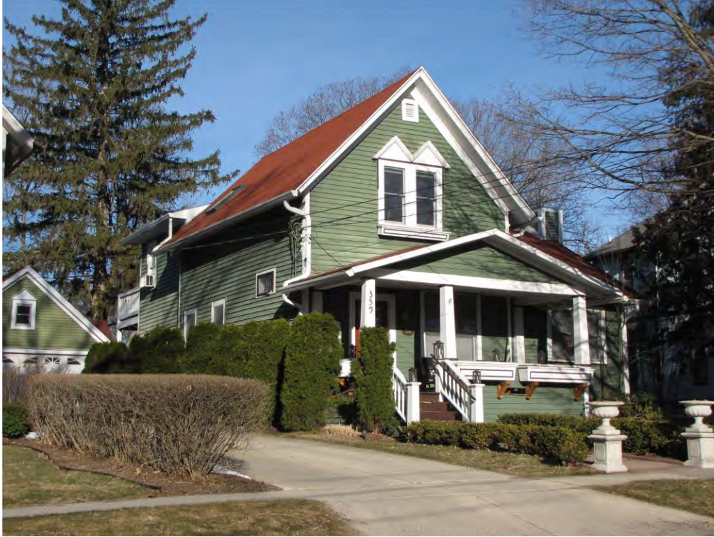
Rogers North 359_Looking Northwest