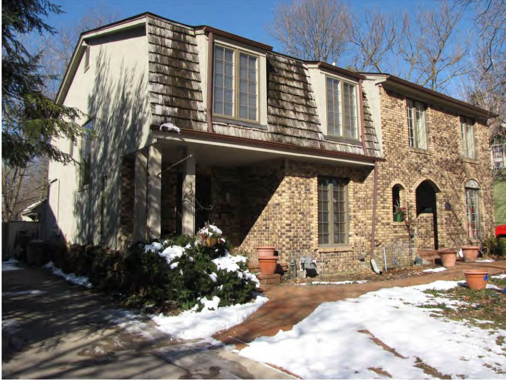
Rogers North 121-125_Looking Northwest