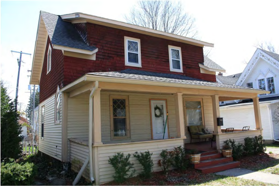
Wing North 212_Looking Southeast