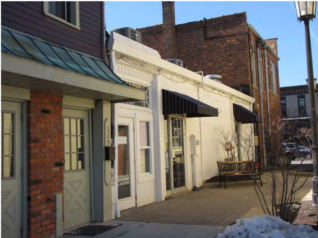
Main East 103-107_Looking North