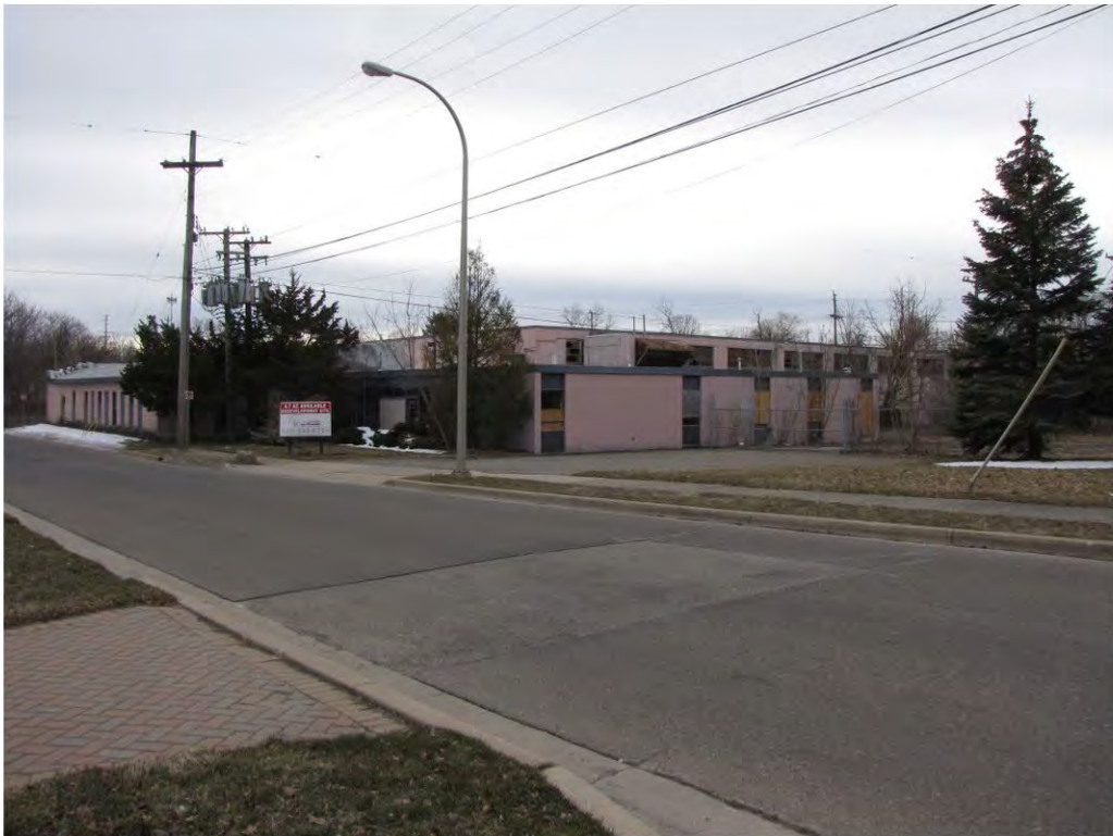
Cady East 456_Looking Southeast