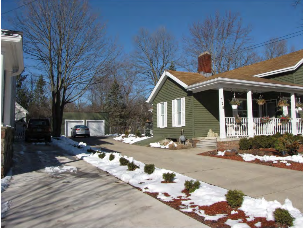
Rogers South 122, Garage_Looking West