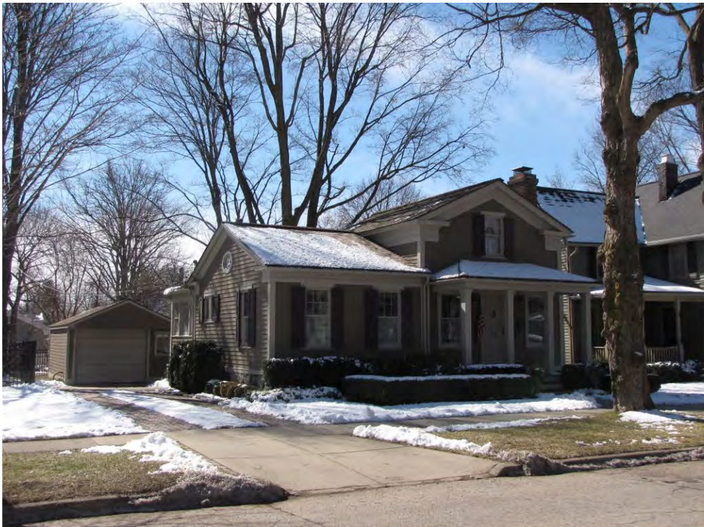
Dunlap West 511_Looking Southwest