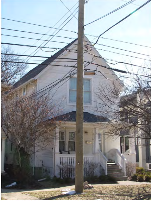
West 216_Looking Southeast