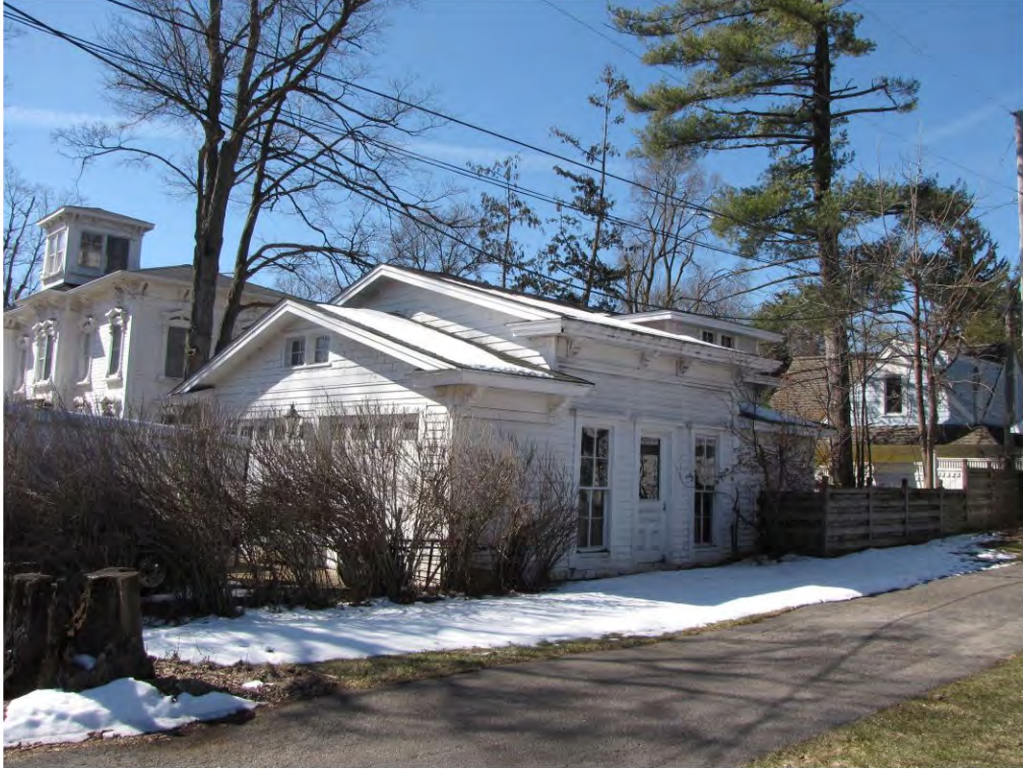
Dunlap West 404, Garage_Looking Southwest