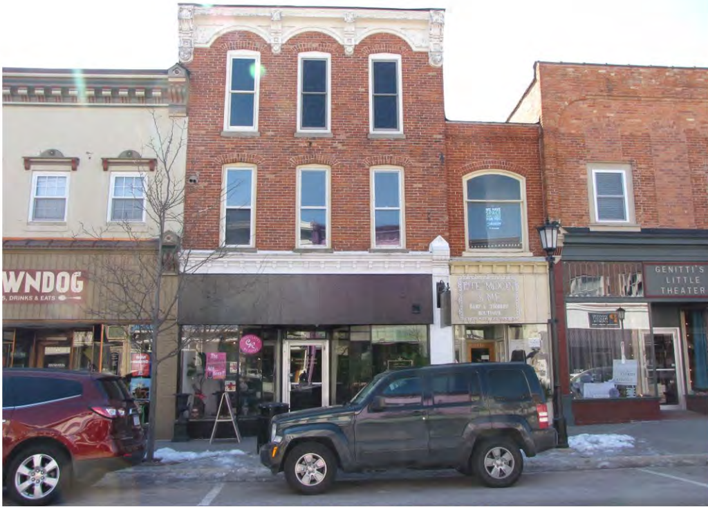
Main East 118_Looking South