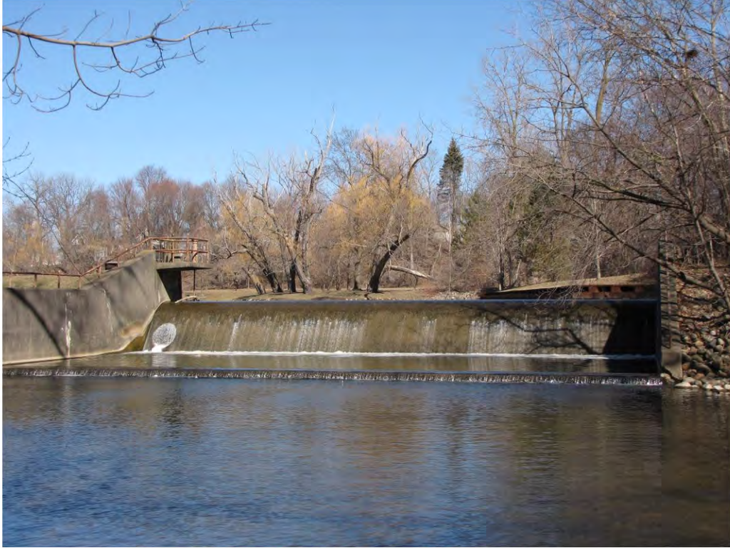
Griswold NVA 14_Looking North