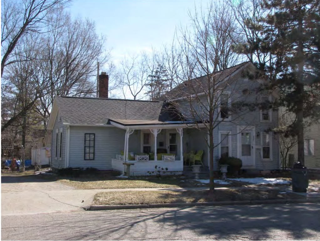
Linden 226-228_ Looking Southeast