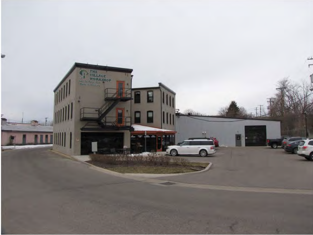
Cady East 459_Looking West