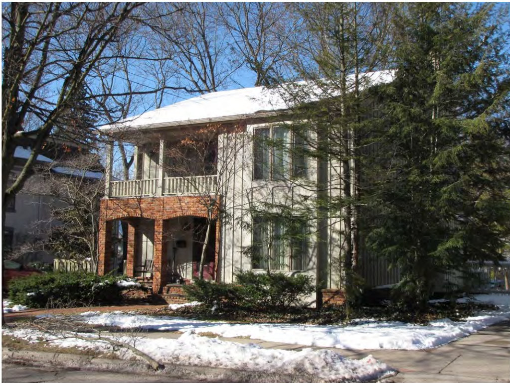
Rogers North 117_Looking Southwest