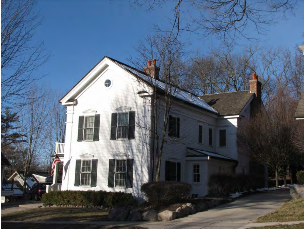
Rogers North 343_Looking Southwest