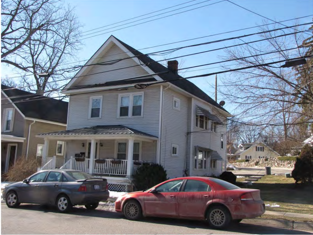
Randolph 319-321_Looking Southeast