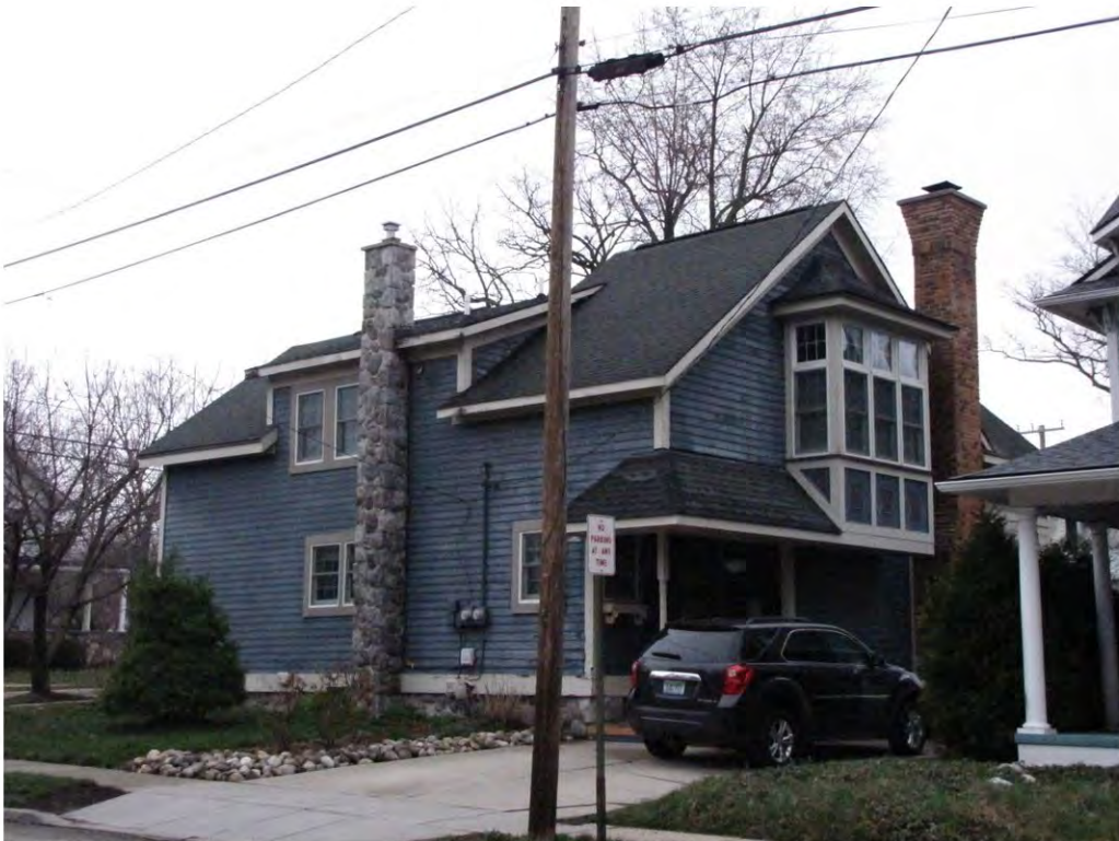
Rogers South 127_Looking Northwest