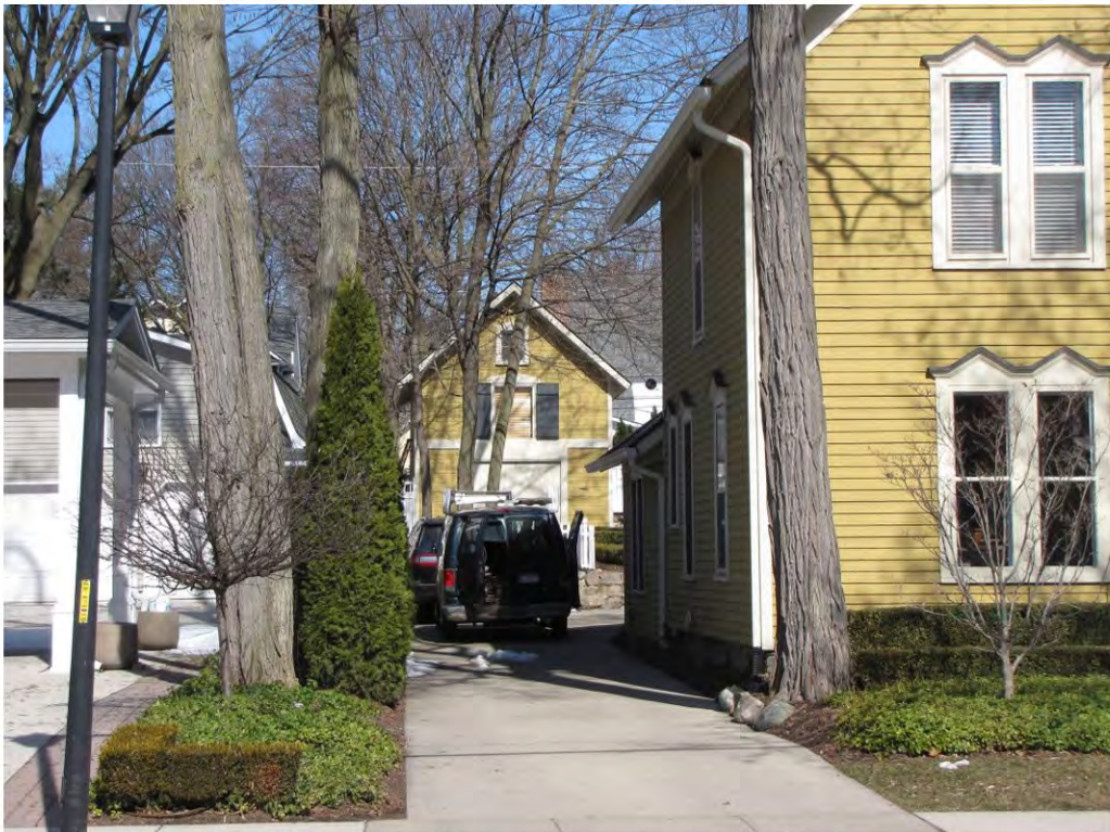
Main West 536, Garage_Looking North