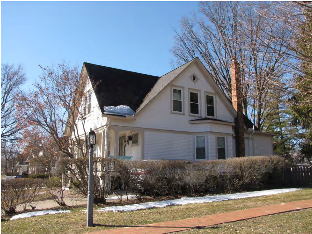
High 235_ Looking Southwest