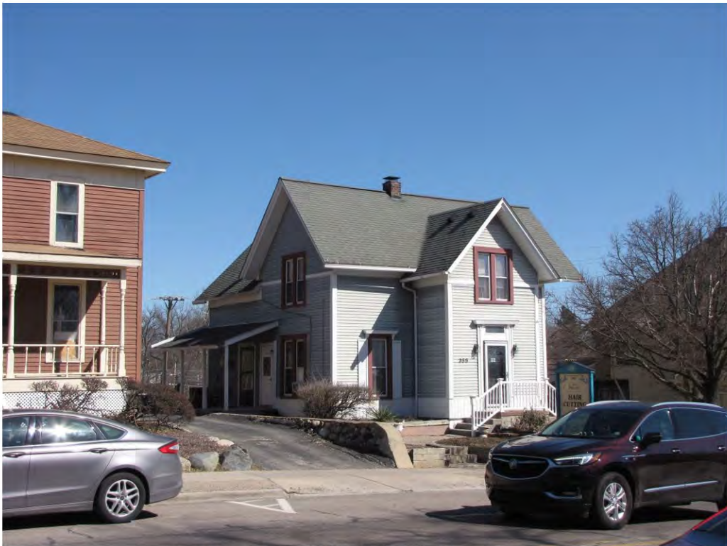
Main East 355_ Looking Northeast