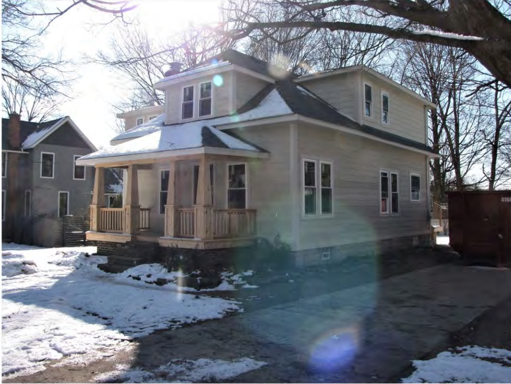
Cady West 511_Looking Southeast