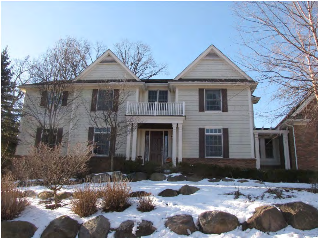
Linden Court 515_Looking South