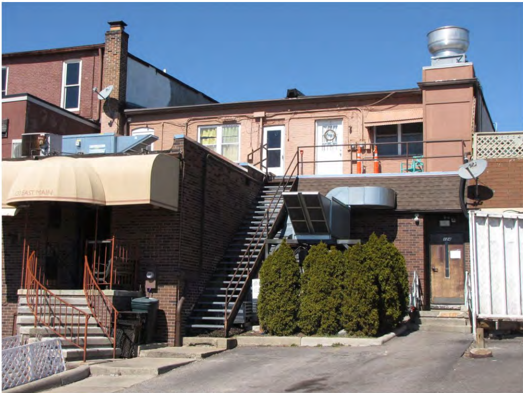
Main East 120-124_Looking Northwest