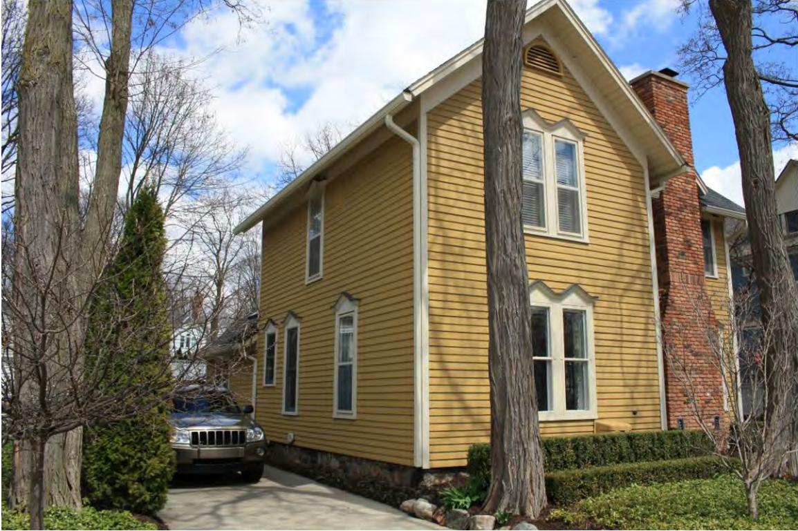
Main West 536_Looking Northeast