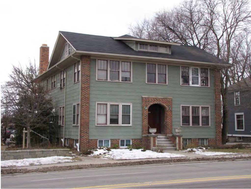
Main East 430_Looking Southwest