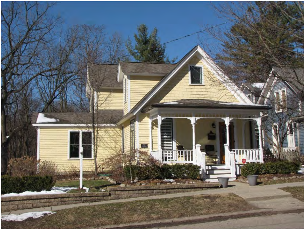
Rogers North 221_Looking Northwest