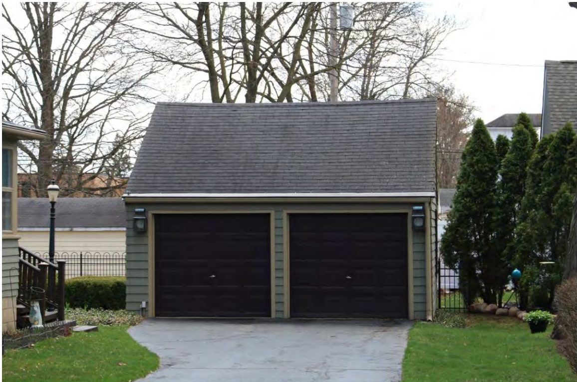
Dunlap West 515, Garage_Looking South