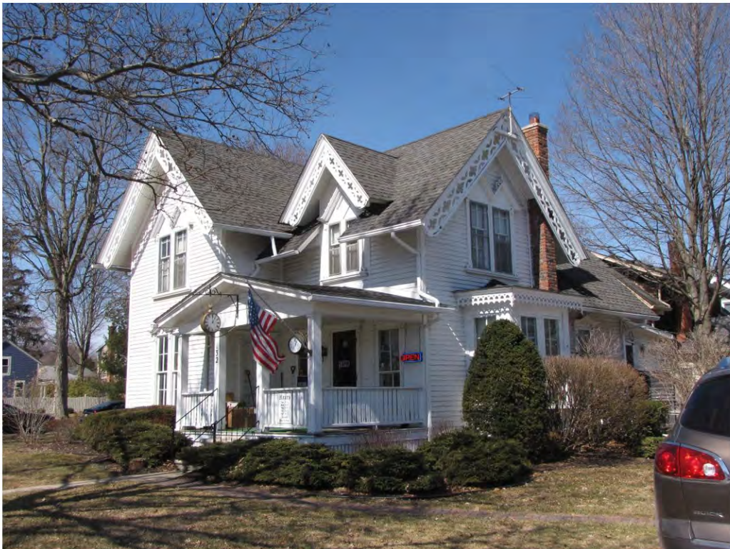
Dunlap West 132_Looking Northwest