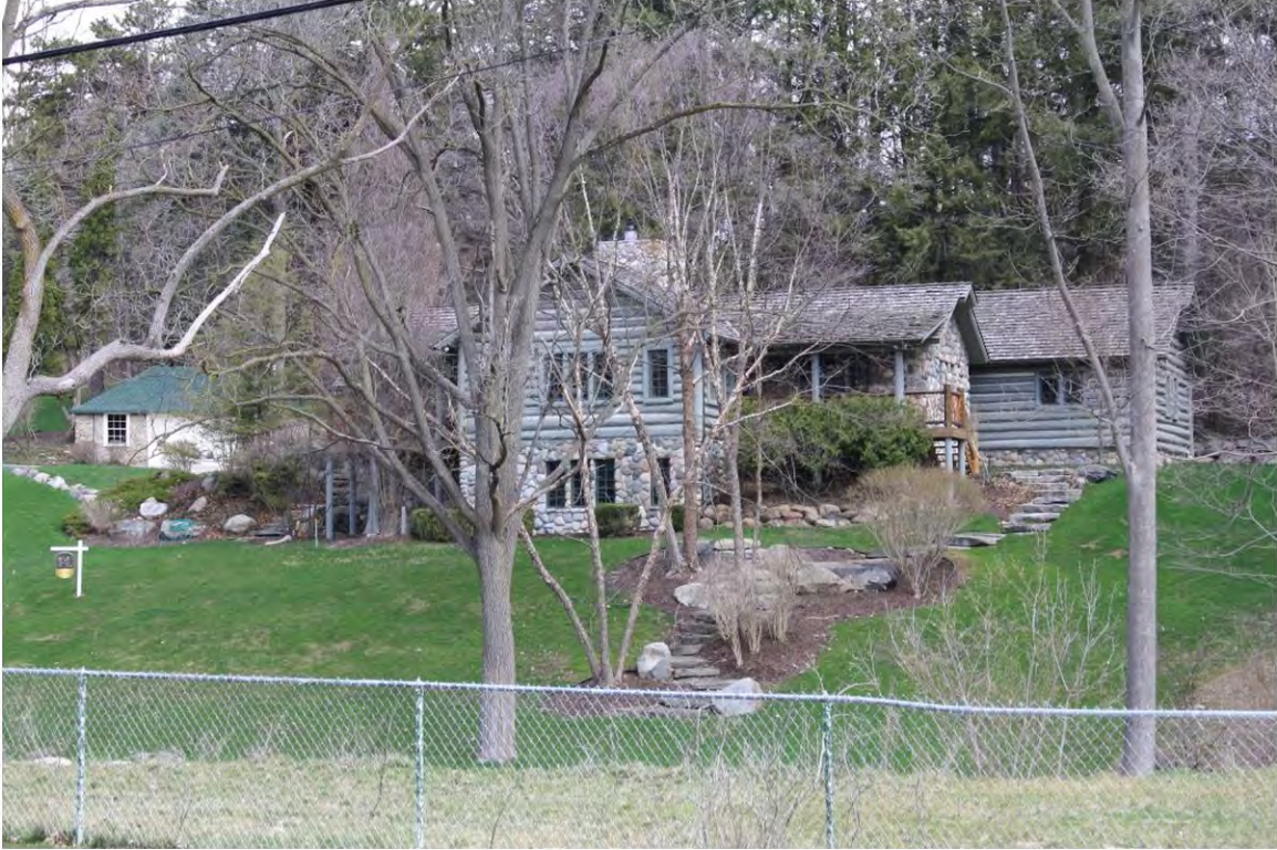
Randolph 528_ Looking North