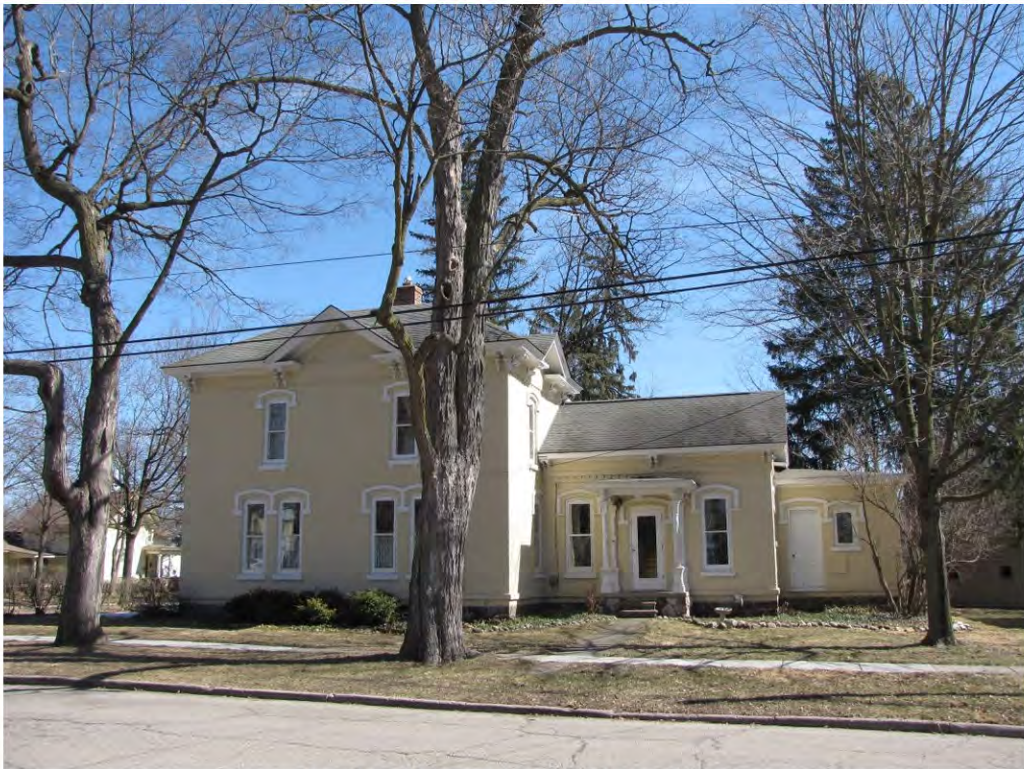
Dunlap West 317_Looking East