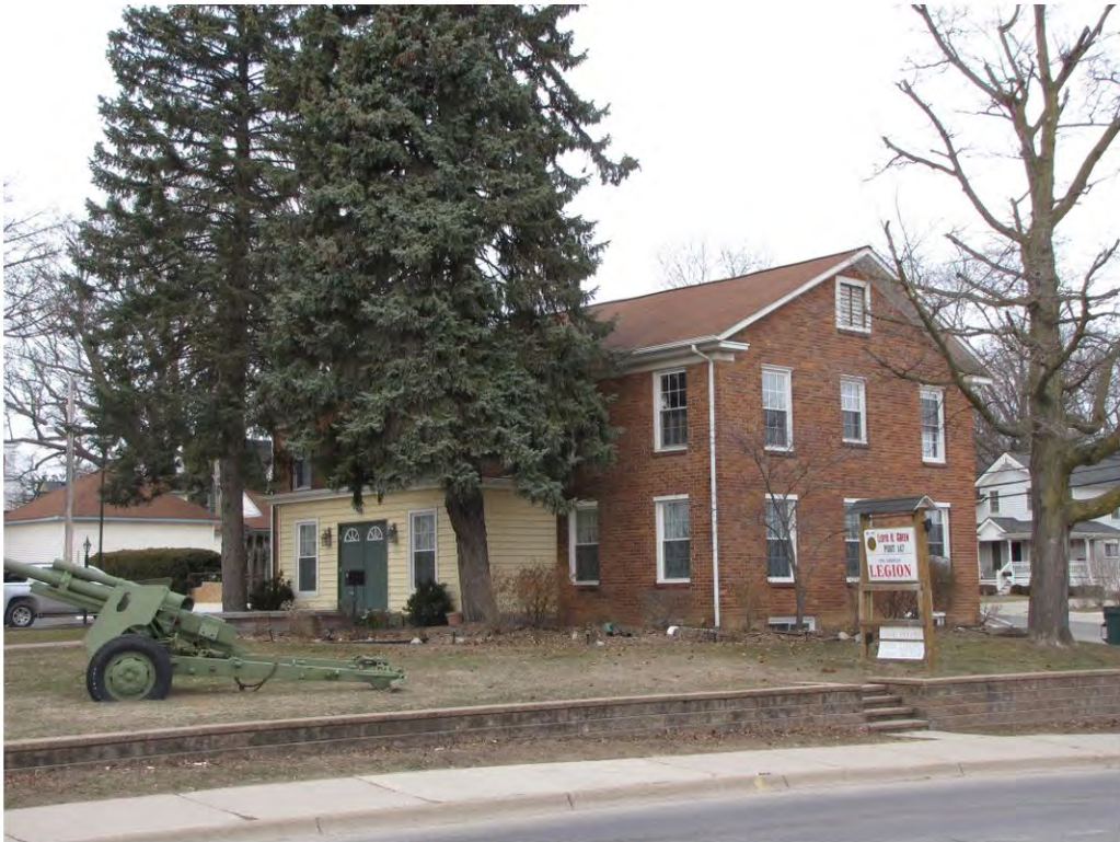
Dunlap West 100_ Looking Northwest