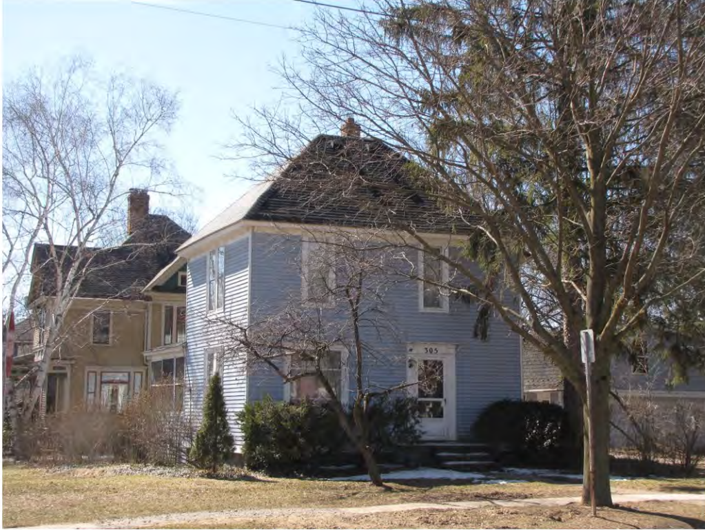
Dunlap West 305_Looking Southwest