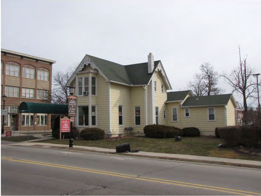
Center South 201 and Cady East 100_Looking Northeast