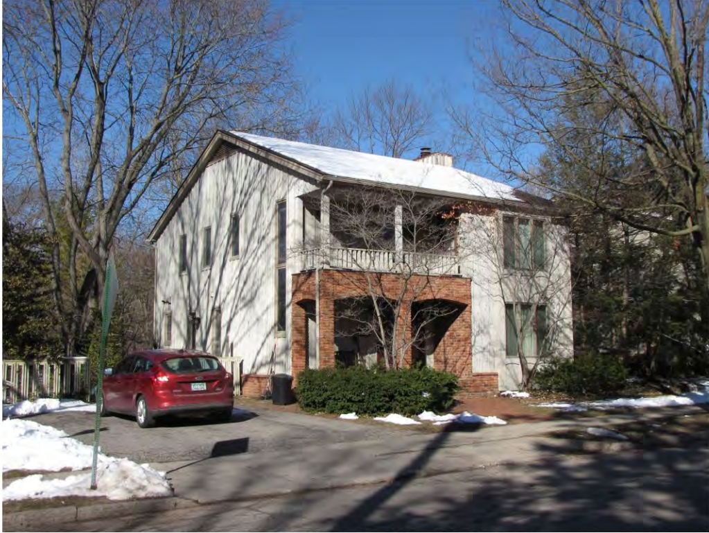
Rogers North 117_Looking Northwest