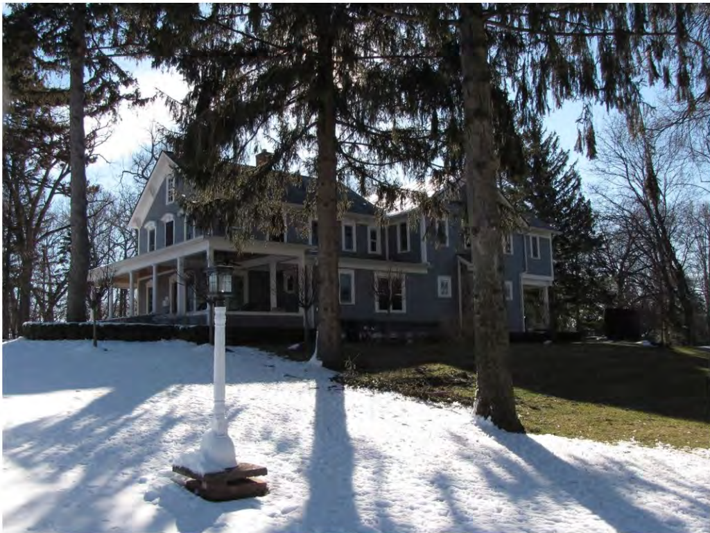
Cady West 473_ Looking Southeast