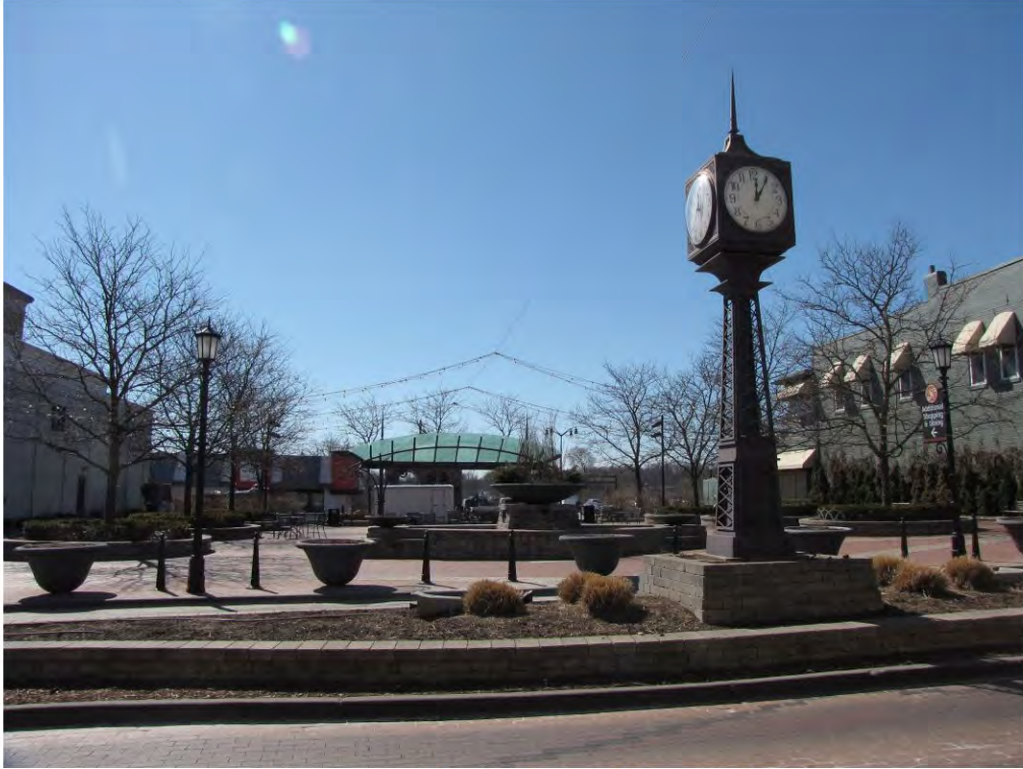
Main East 156 - 158_Looking South