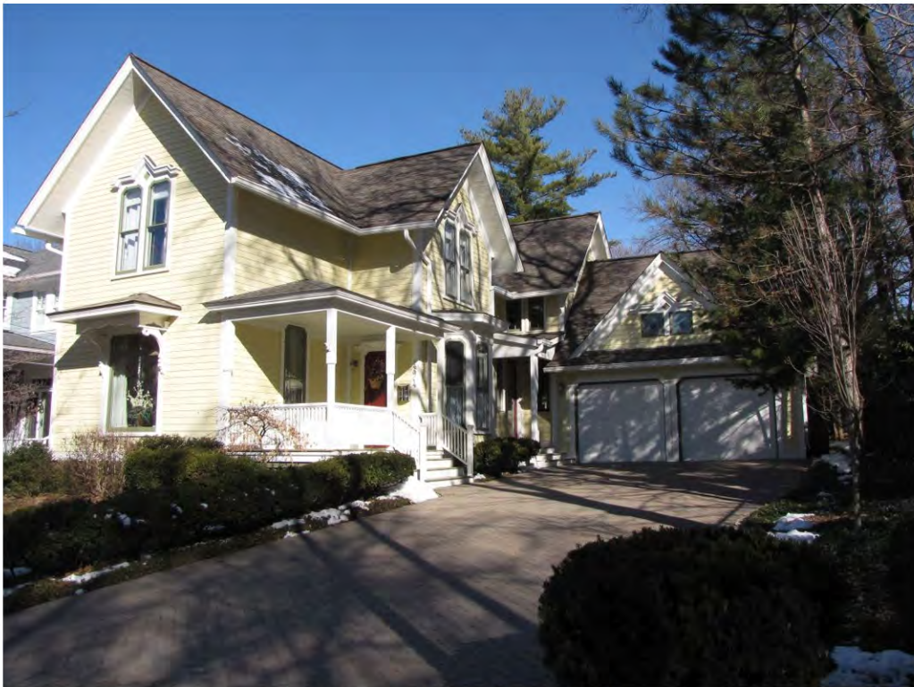
Cady West 494_ Looking Northwest