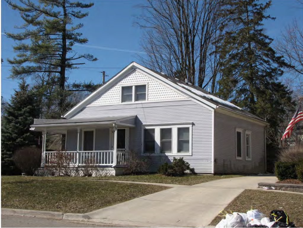
West 223_Looking Southwest