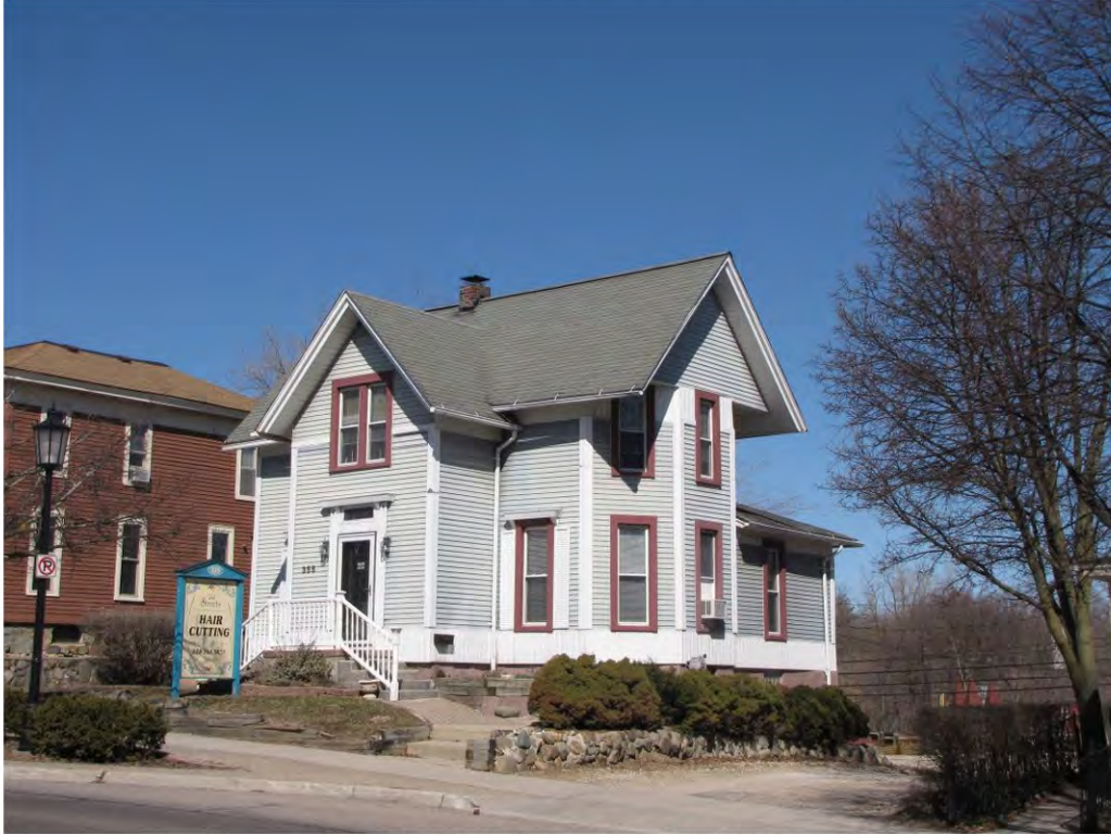
Main East 355_Looking Northwest