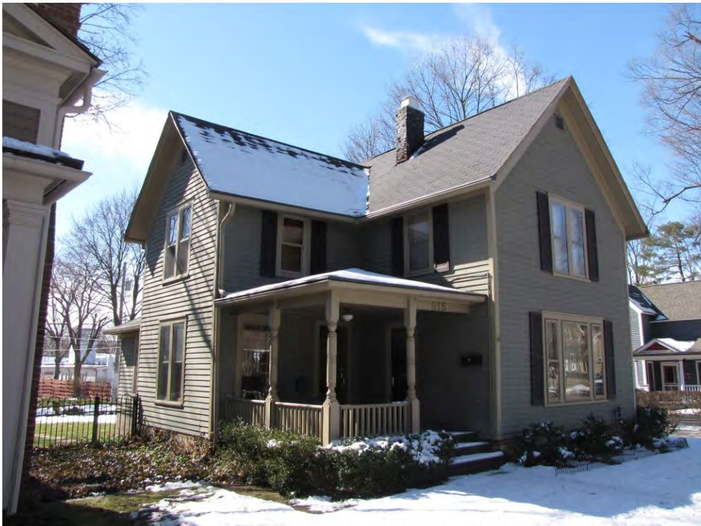
Dunlap West 515_Looking Southwest