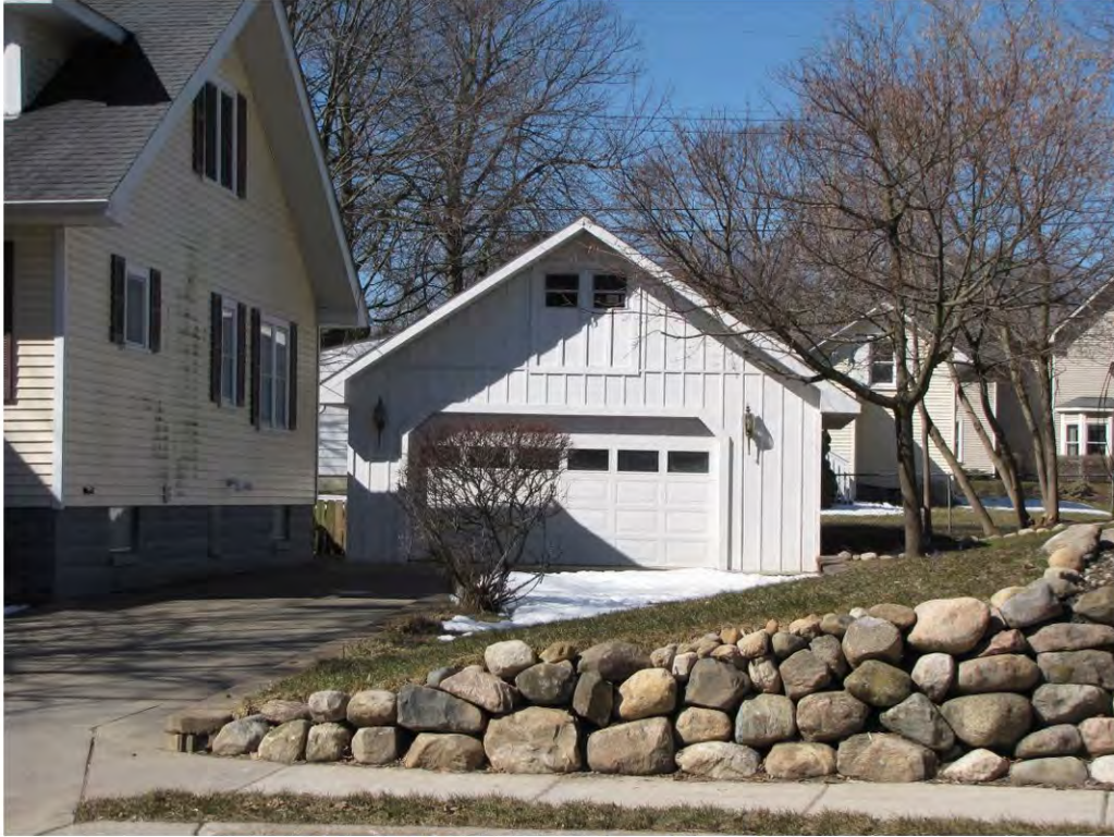
West 231, Garage_Looking West