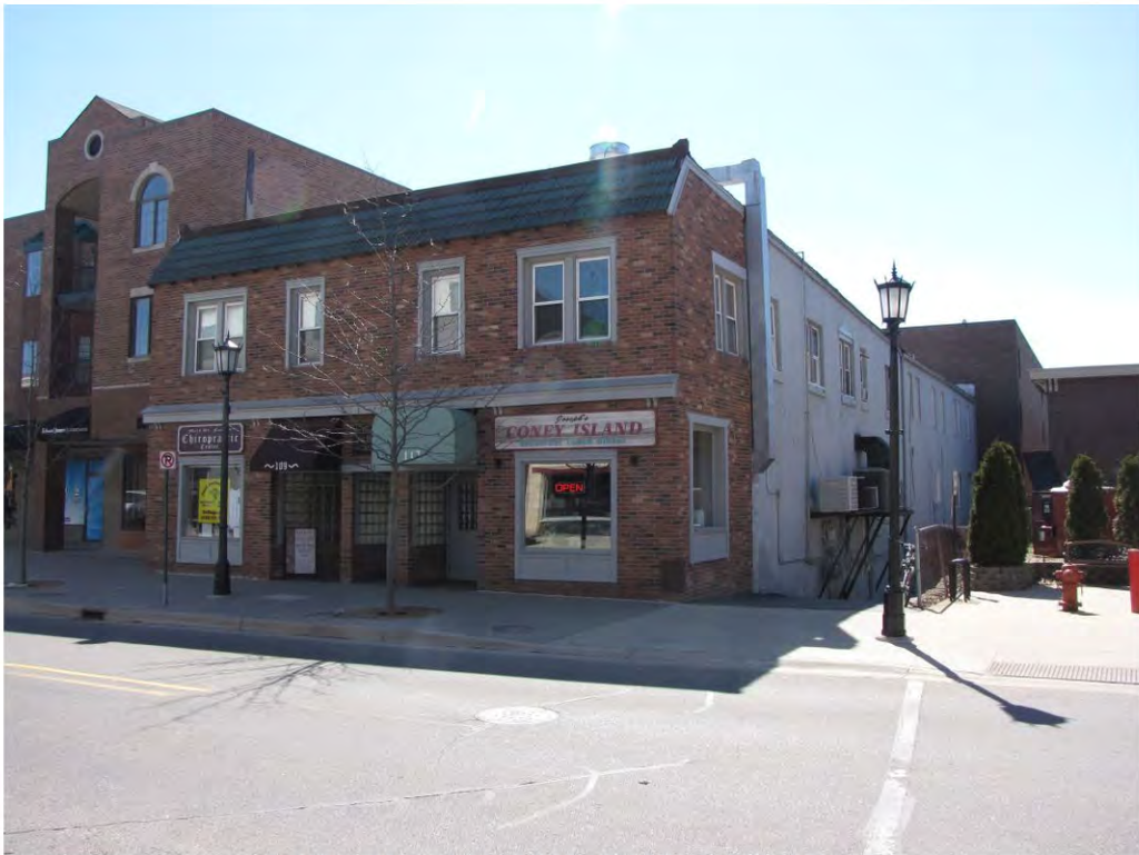
Main West 109-113_Looking Southeast