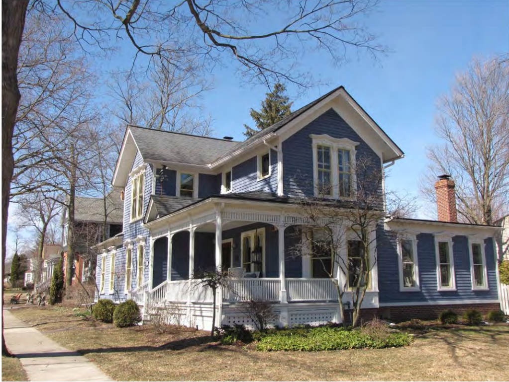
Dunlap West 206_Looking Northwest