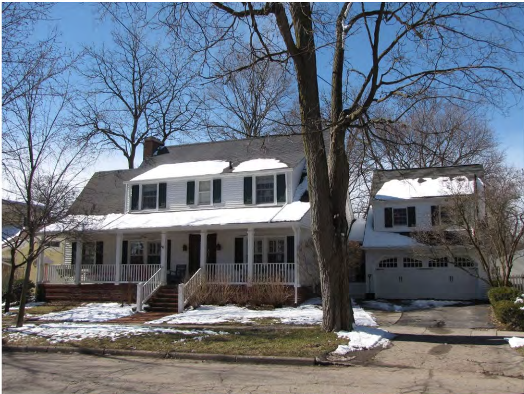
Linden 105_Looking West