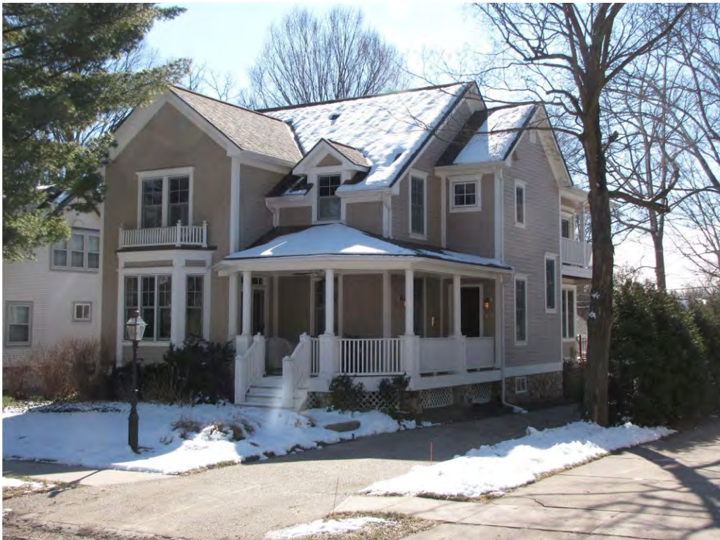
Dubuar 433_Looking Southeast