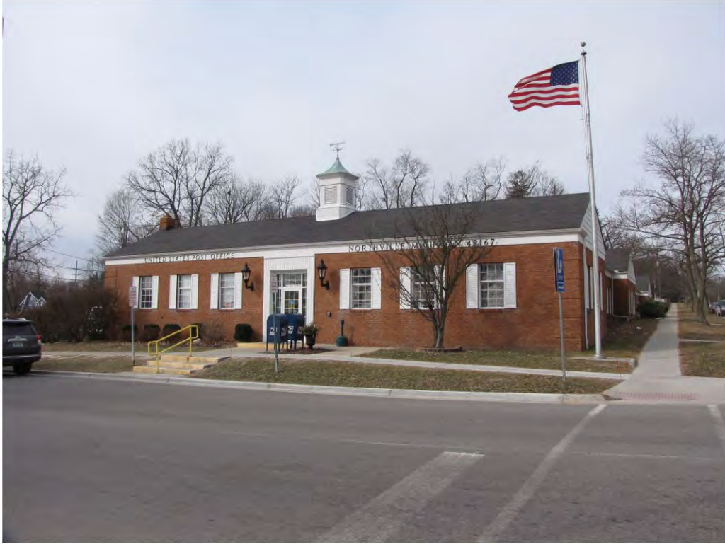
Wing South 200_Looking West