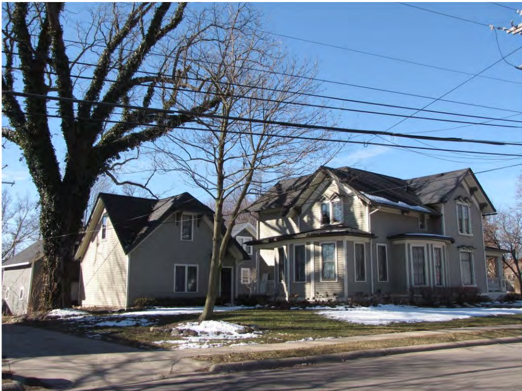
Wing North 220_Looking Northeast