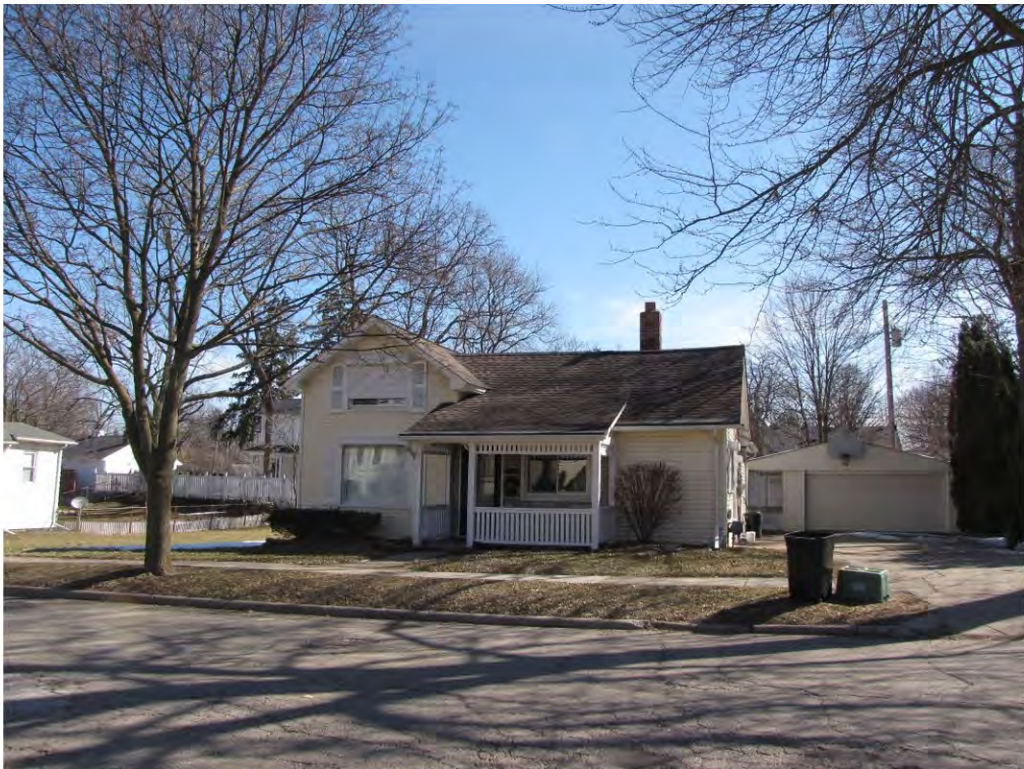
Linden 238_Looking East