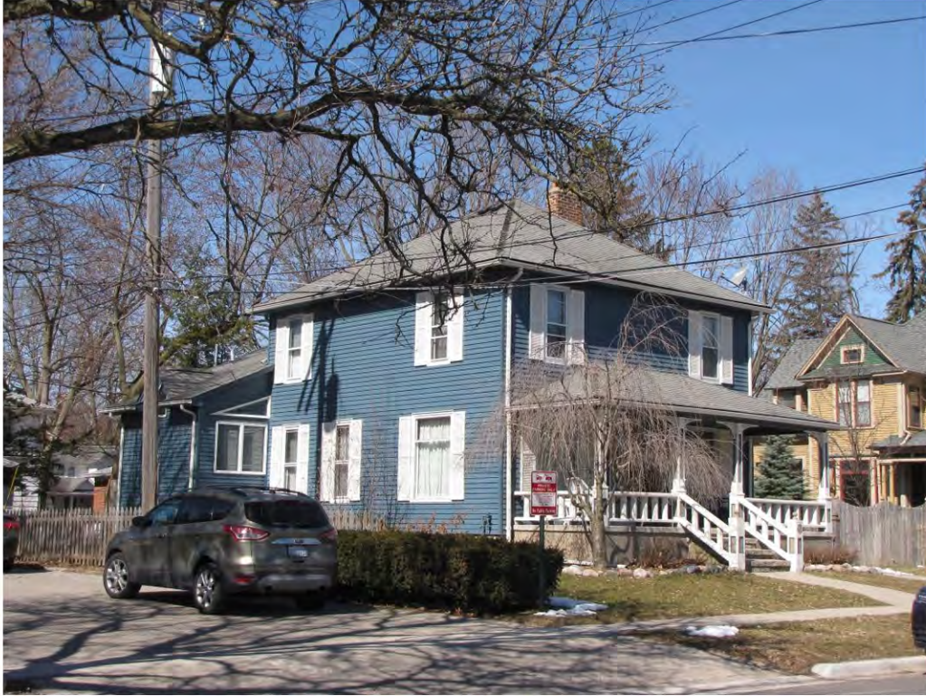
High 113_Looking Northwest