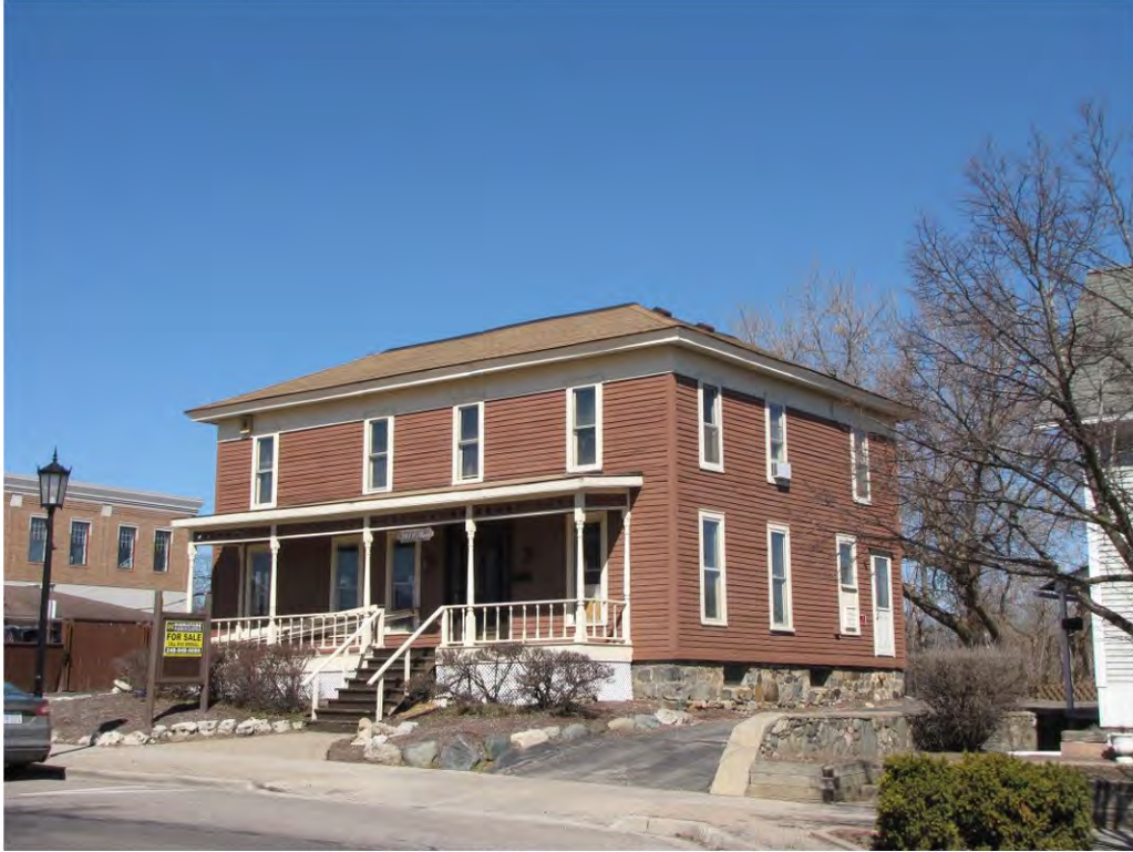
Main East 341_ Looking Northwest