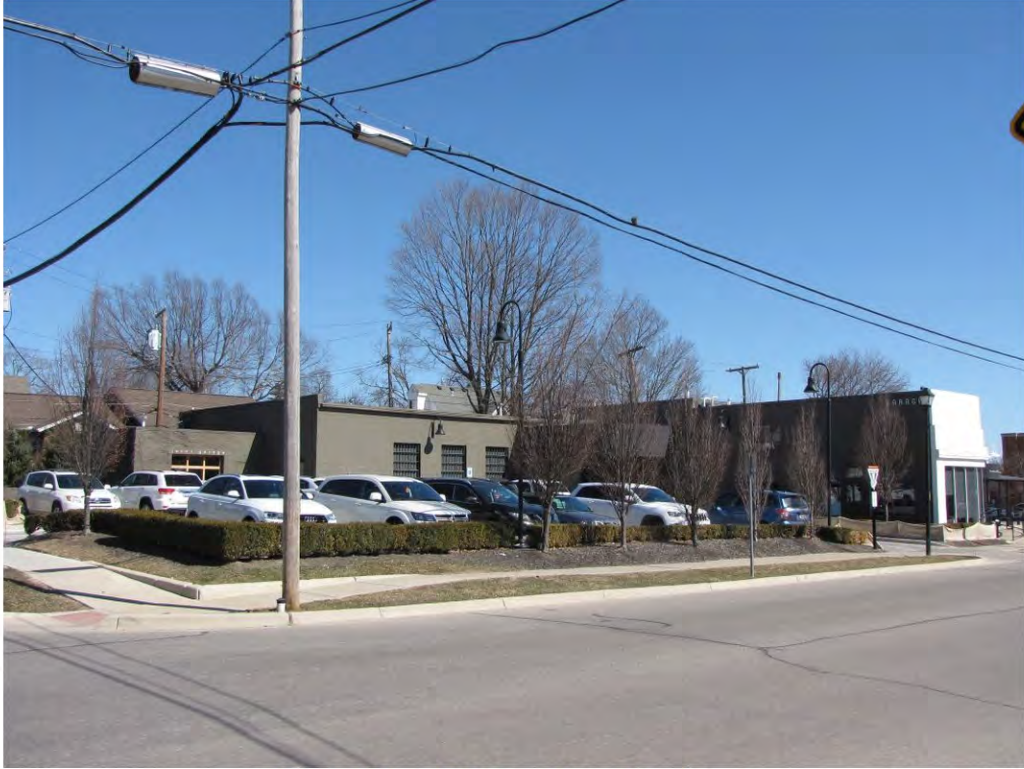
Main West 202_Looking Northeast