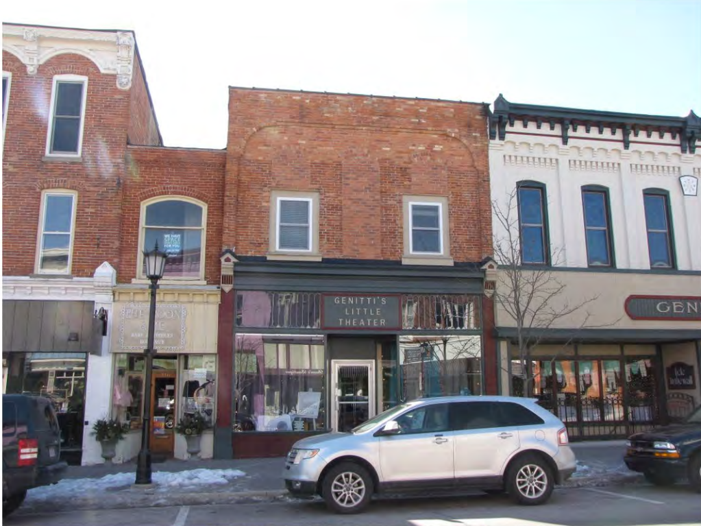
Main East 112_Looking South